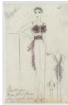
Black Crepe Evening Dress with Wine Colored Velvet Flowers and Rose Taffeta Sash (KA0039_V9p05-008)