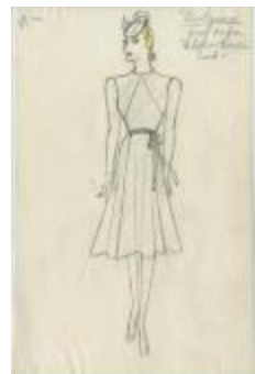
Knee-Length Grey Crepe Dress with Silver Cabochon Belt (KA0039_V9p67-005)