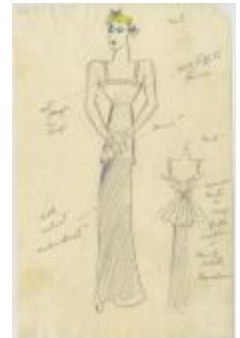
Black Taffeta Tunic Dress with Black Velvet Underskirt (KA0039_V9p30-006)