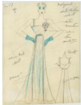
White Cloché Velvet Evening Dress with Carnations (KA0039_V9p54-009)