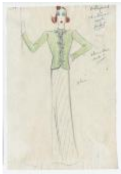
Women's Chartreuse Wool Evening Jacket with Silver Skirt (KA0039_V8p01-005)