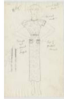
Brown and White Printed Dress with Short Sleeves and Matching Coat (KA0039_V8p16-005)