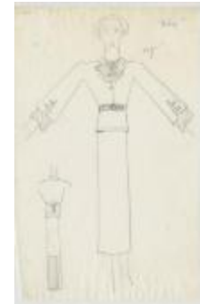
Long-Sleeved Women's Ensemble with Organza Bow and Pleated Back Panel (KA0039_V8p16-002)