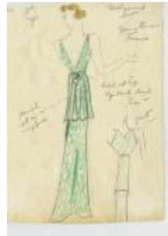
Green Lace Tunic Dress with Very Full Skirt Panel (KA0039_V9p36-008)