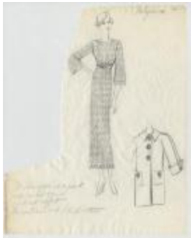
Black and Oyster White Print Dress with Blue Linen Coat (KA0039_V8p58-001)