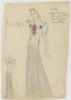
Black CrÃ©pe Dress and Jacket with Tulip Embroidery (KA0039_V8p79-004)