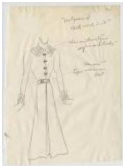
Black Wool Suit with Chamois Fur Collar and Sleeve Cuffs (KA0039_V8p74-003)