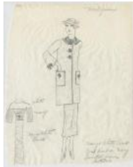
Navy and White Print Ensemble with Twisted Silver Buttons (KA0039_V8p58-002)