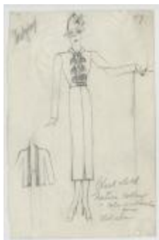
Black Women's Ensemble with Nutria Collar and Wool Tassels (KA0039_V9p08-006)