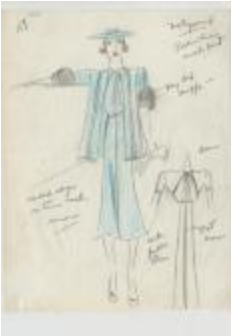
Women's Pale Blue Wool Suit with Wide Grey Fox Fur Cuffs (KA0039_V8p20-007)