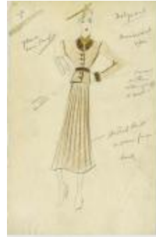
Women's Brown Wool Ensemble with Brown Leather Accents and Yellow Scarf (KA0039_V9p66-001)