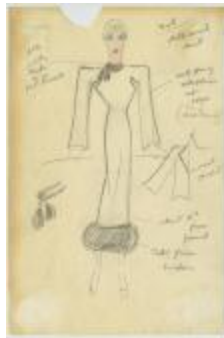
Black Wool Women's Suit with Fur and Cellophane Trim (KA0039_V9p36-001)