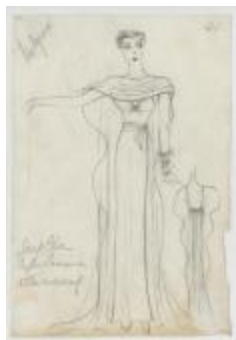
Deep Blue Crepe Romaine Evening Dress with Attached Scarf (KA0039_V9p08-009)