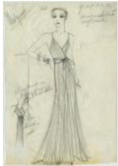
Grey Crepe Evening Dress with Sunburst Pleats (KA0039_V9p22-008)