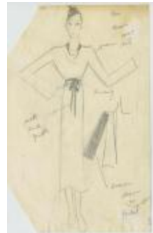
Brown Wool Women's Suit with Silk Cord Girdle and Beaver Fur Sleeves (KA0039_V9p37-002)