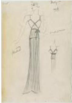
Pleated Black Evening Dress with Beaded Cord Trim (KA0039_V9p56-004)