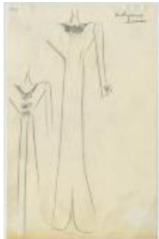
Evening Dress with Rosette and Bow Embellishments (KA0039_V9p31-007)