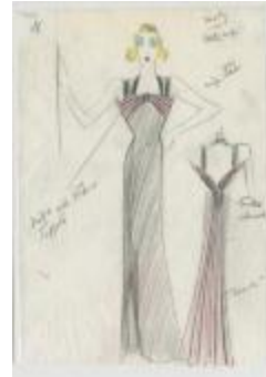
Black CrÃ©pe Evening Dress with Pink and Black Striped Taffeta Accents (KA0039_V8p44-003)