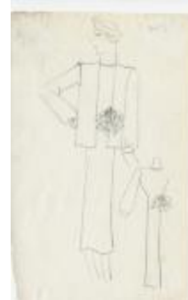
Women's Ensemble with Sleeveless Jacket and Dotted Bow (KA0039_V8p11-003)