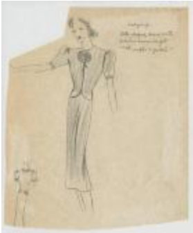
Black Cloque Dress with Silver Embellishments on Neck, Sleeve Cuffs, and Pockets (KA0039_V8p70-001)