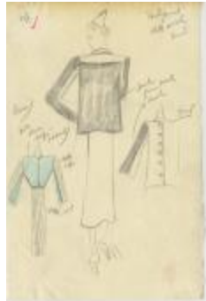
Black Wool Women's Suit with Seal Fur and Pale Blue Crepe Accents (KA0039_V9p44-002)