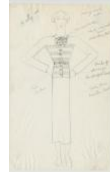
Women's Navy Blue Wool Ensemble with Dot Bow and Bands of Shirring (KA0039_V8p12-003)