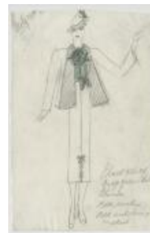
Women's Ensemble with Green Velvet Blouse and Black Jacket with Sealskin (KA0039_V9p19-005)