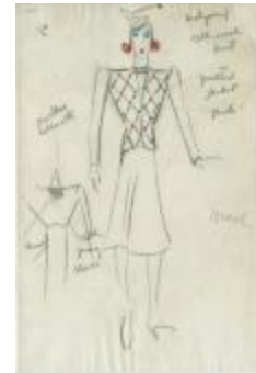
Black Wool Women's Suit with Quilted Jacket and Jewel Embellishments (KA0039_V9p64-005)