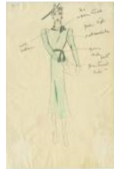
Long-Sleeved Green CrÃ©pe Dress with Cord Belt and Tassels (KA0039_V9p36-006)