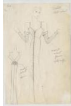
Black Velvet Evening Dress with Violet Velvet Choux and Opera Gloves (KA0039_V8p37-009)