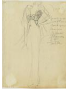
Pale Green Evening Dress with Blue Floral Embellishments and Tulle Wrap (KA0039_V9p61-009)