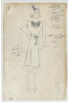
Black Wool Dress with Paillette, Stone, and Jewel Embellishments (KA0039_V9p17-003)