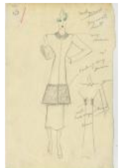
Women's Grey Wool Suit with Persian Lamb Accents (KA0039_V9p48-003)