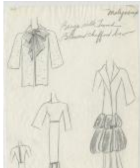
Set of Four Sketches Depicting a Dress and Two Coats (KA0039_V8p56-005)