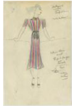
Multicolor Striped Dress with Silver Chain and Fringe Tassel Belt (KA0039_V9p44-003)