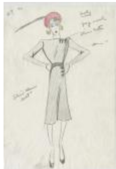
Grey Wool Long-Sleeved Wrap Dress with Silver Buttons and Chain Belt (KA0039_V8p28-005)