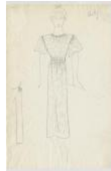
Print Dress with Butterfly Sleeves and Matching Coat (KA0039_V8p16-001)