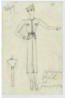
Women's Grey Oxford Tweed Suit with Pressed Godet Pleats (KA0039_V9p21-005)