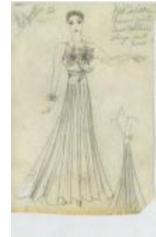
Black Taffeta Evening Dress with Two Large Pink Rose Embellishments (KA0039_V9p27-007)