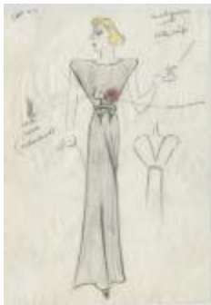
Black CrÃ©pe Evening Dress with Red and White Embroidered Roses (KA0039_V8p28-007)