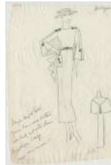
Beige Mixed Tweed Ensemble with Cape Back and Wood Buttons (KA0039_V8p58-003)