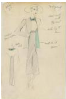
Women's Black Wool Suit with Green Accents (KA0039_V9p47-002)