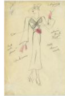
Sheer Black Wool Dress with Long Bell Sleeves and Pink Floral Embellishments (KA0039_V9p26-001)