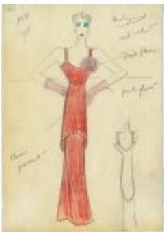
Red Velvet Tunic Evening Dress with Pink Flower Embellishment (KA0039_V9p40-007)