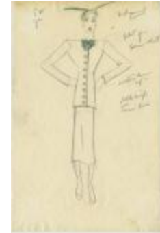
Black Crêpe Tunic Dress with Green Velvet Gilet (KA0039_V9p49-001)