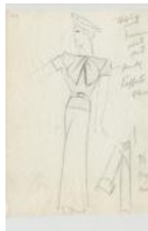
Brown Wool Women's Suit with Pink Taffeta Blouse (KA0039_V8p14-007)