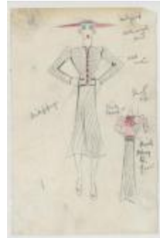
Black Wool Women's Suit with Pink Piping and Printed Pink Blouse (KA0039_V9p05-001)