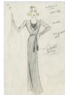
Black CrÃ©pe Evening Dress with Black Paillette Gilet and Tassel Belt (KA0039_V8p30-009)