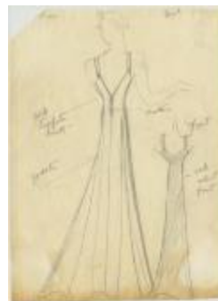
Evening Dress with Black Velvet Front and Taffeta Back (KA0039_V9p49-007)