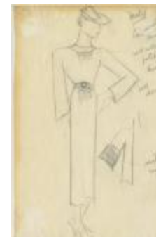
Tan Wool Women's Suit with Nutria Sleeve Cuffs (KA0039_V9p50-001)