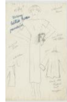
Black Wool Short-Sleeved Dress with Taffeta Bow and Matching Coat (KA0039_V8p16-006)