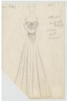
Black Velvet Evening Dress with Bow of Dotted Pink Faille (KA0039_V8p14-009)