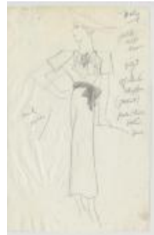
Black CrÃ©pe Dress with Off-White Chiffon Gilet and Pale Blue Satin Sash (KA0039_V8p15-001)