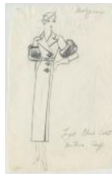
Light Blue Coat with Wide Nutria Cuffs (KA0039_V8p61-003)