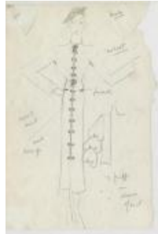
Wool Women's Suit with Lacing Details and Matching Coat with Tiered Puff Sleeves (KA0039_V8p36-001)