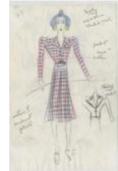
Women's Navy and Blue Checked Ensemble with Sunburst Pleated Skirt (KA0039_V8p28-004)