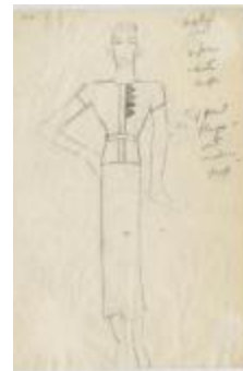
White Crepe Two-Piece Women's Ensemble with Printed Flag Accents (KA0039_V8p17-006)