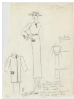
Navy Wool Ensemble with "Coolie" Coat and Bamboo Buttons (KA0039_V8p59-002)