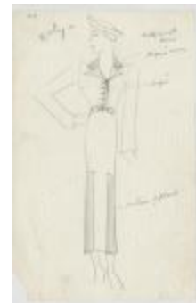
Black Wool Shirt Dress with PiquÃ© Accents and Pleated Side Panels (KA0039_V8p17-004)