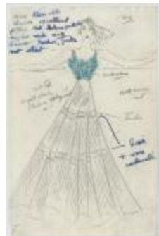
Black Net Evening Dress with Bright Blue Flower Appliques (KA0039_V9p14-006)