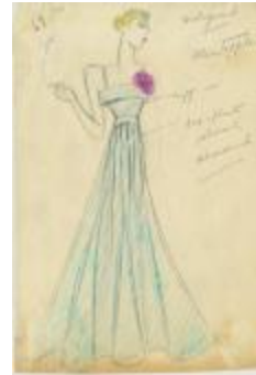
Blue Taffeta Evening Dress with Pink Flower Corsage and Released Box Pleats (KA0039_V9p48-009)