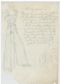
Wide-Legged Women's Jumpsuit of Navy Linen (KA0039_V8p50-003)