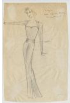
Black CrÃ©pe Long-Sleeved Dinner Dress with Queen Anne Neckline and Side Zipper (KA0039_V8p72-001)