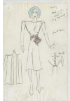
Black Wool Women's Suit with Long Box Coat and Printed Sash Belt (KA0039_V8p28-001)