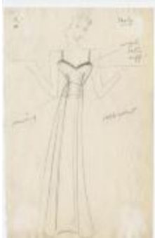
Black Velvet Evening Dress with Royal Satin Cuff (KA0039_V8p09-009)