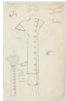
Navy Wool Women's Ensemble with Short-Sleeved Drop Shoulder Coat (KA0039_V8p17-003)