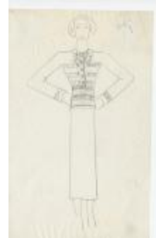
Women's Ensemble with Bands of Shirring and Dot Bow (KA0039_V8p11-002)