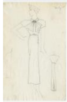
Short-Sleeved Dress with Scarf and Side Buttons (KA0039_V8p10-001)