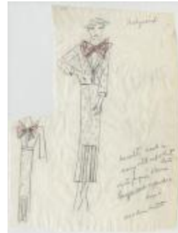
Navy Wool Women's Ensemble with Red and White Dots and Large Red Organdie Bow (KA0039_V8p57-002)