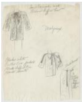
Set of Three Sketches Depicting a Tan Caracal Fur Coat and Black and White Printed Evening Jacket (KA0039_V8p61-001-003)