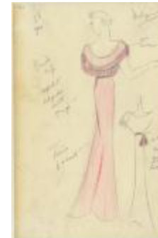
Pink Crêpe Evening Dress with Fringed Capelet (KA0039_V9p46-004)