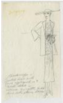
Black Floral Printed Crepe Dress with Print Appliqués and Colored Georgette Girdle (KA0039_V8p56-002)