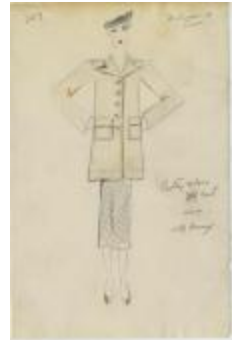
Women's Suit with Putty Color Coat and Black Dress (KA0039_V9p51-002)