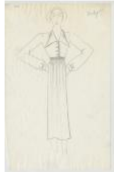
Long-Sleeved Dress with Wide Pointed Lapel and Rope Belt (KA0039_V8p16-003)