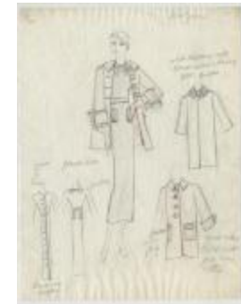
Set of Five Sketches Depicting a Black and Gold Women's Ensemble and White Shantung Coat (KA0039_V8p58-004)