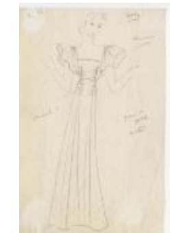
Green and Metallic Gold Evening Dress with Ruffled Sleeves (KA0039_V8p08-007)