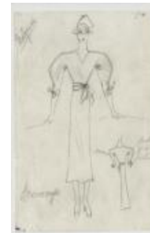
Brown Crepe Dress with Leg-of-Mutton Sleeves and Bow Accents (KA0039_V9p08-005)