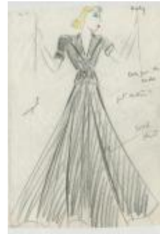
Black Gros de Londre Evening Ensemble with Lily of the Valley Embellishments (KA0039_V8p16-009)