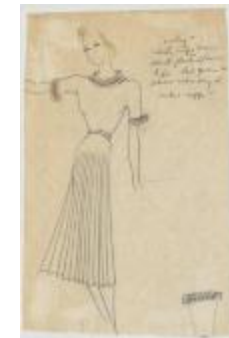
White CrÃ©pe Dress with Pleated Skirt and Red, Green, and Silver Embroidery (KA0039_V8p65-001)