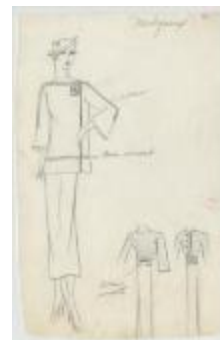
Women's Ensemble with Wrap Coat and Rose Inserts (KA0039_V8p59-003)