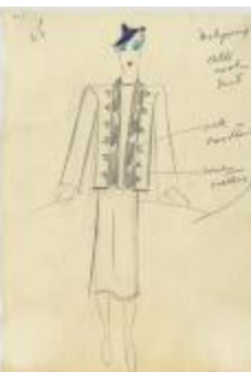
Black Wool Women's Suit with Broadtail Trim and Bone Buttons (KA0039_V9p42-009)