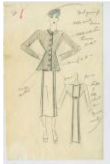
Black Wool Dress with Black Velveteen Tunic Jacket (KA0039_V9p30-004)