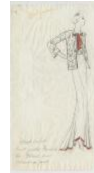
Women's Ensemble with Black Dress, Black and White Print Jacket, and Fuschia Accents (KA0039_V8p57-003)