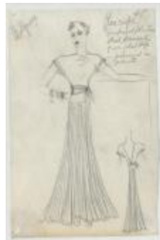
Blue Crepe Evening Dress with Sunburst Pleated Skirt (KA0039_V9p03-007)