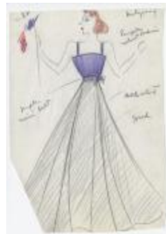
Evening Dress with Purple Velvet Bodice and Black Velvet Skirt (KA0039_V8p06-008)