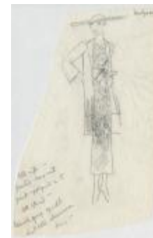
Black Floral Printed CrÃpe Dress with Print AppliquÃs and Colored Georgette Girdle (KA0039_V8p61-005)