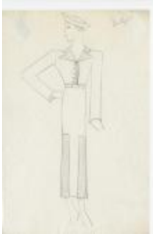
Calf-Length Shirt Dress with Pleated Side Panels (KA0039_V8p11-001)