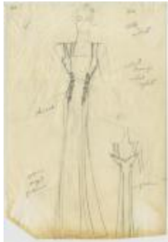
Black Velvet Evening Dress with Lacings and Metal Eyelets (KA0039_V9p50-009)