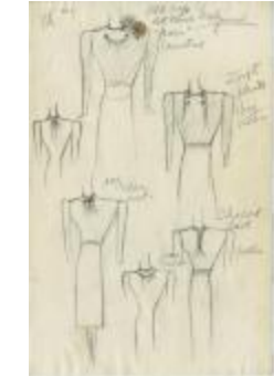
Set of Six Sketches Depicting a Variety of Bodice Designs (KA0039_V9p67-006)