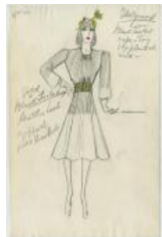
Black Tucked Crepe Dress with Gold and Black Tooled Leather Belt (KA0039_V9p67-004)