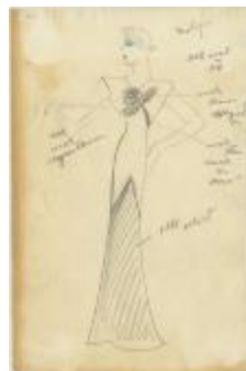
Black Wool and Velvet Evening Dress with Chrysanthemum Applique (KA0039_V9p42-007)