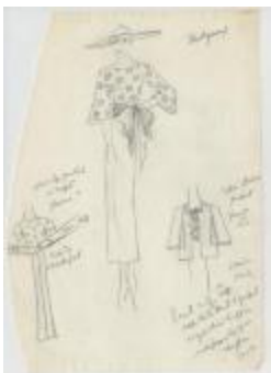
Black Cloth Women's Ensemble with Flower Printed Crêpe Top and Cape-Sleeved Jacket (KA0039_V8p59-001)