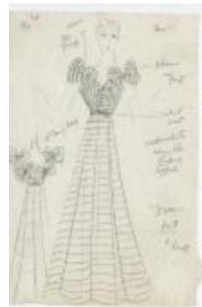
Chenille Striped Taffeta Evening Dress with Oversized Bows (KA0039_V8p04-009)