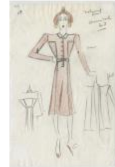
Brown Wool Suit with Long-Sleeved Shirt Dress and Matching Jacket (KA0039_V8p28-002)