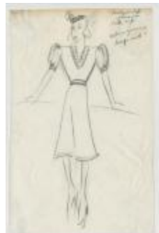
Black CrÃ©pe Dress with Silver Grecian Leaf Embroidery (KA0039_V9p14-002)