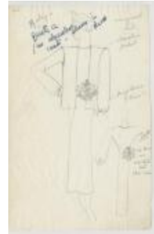
Navy Wool Women's Ensemble with Sleeveless Jacket and Dotted Bows (KA0039_V8p16-004)