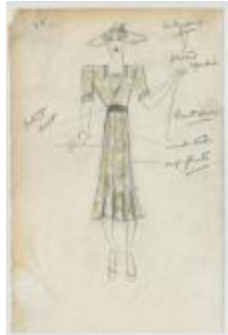
Printed Day Dress with Box Pleated Skirt and Pleated Organdie Trim (KA0039_V9p02-001)