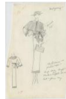
Calf-Length Dress with Detachable Pleated Cape and Blue, Beige, and Black Checked Taffeta Sash (KA0039_V8p60-003)