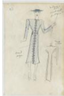
Women's Wool Coat with Braided Edges (KA0039_V9p19-003)