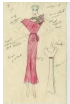
Wine Colored Velvet Dress with Plaid Taffeta Scarf (KA0039_V9p39-005)