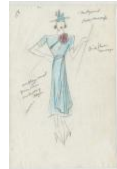
Pale Blue CrÃ©pe Dress with Surplice Waist and Pink Flower Corsage (KA0039_V8p19-006)