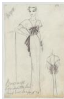
Brown Crepe Evening Dress with Rose Taffeta Bows (KA0039_V9p16-009)