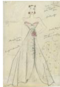
Black Taffeta Evening Dress with Pink Flowers and Black Net Coat with Embroidered Stars (KA0039_V9p57-008)