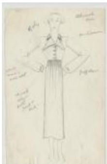
Long-Sleeved Black Wool Dress with Notched Lapel and Braided Belt (KA0039_V8p13-005)