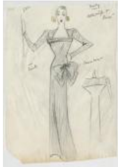
Black CrÃ©pe Evening Dress with Lace Bow and Sleeves (KA0039_V9p17-007)