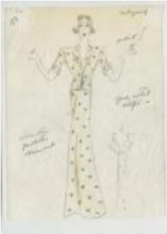
Gold Evening Ensemble with Silver Star Paillette Embroidery (KA0039_V8p43-002)