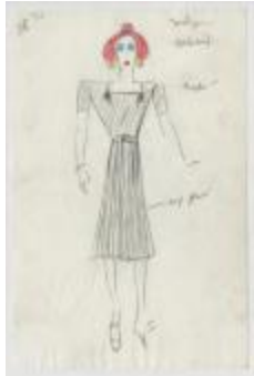
Short-Sleeved Black CrÃ©pe Dress with Box-Pleated Skirt (KA0039_V8p35-006)