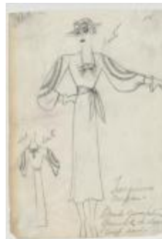
Turquoise Crepe Dress with Sash Belt and Wide Sleeves with Openwork (KA0039_V9p14-007)