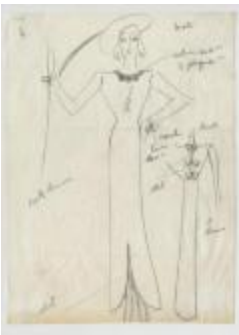
Black Dinner Dress with Silver Embroidery and Small Bows (KA0039_V9p12-008)