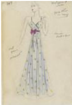
Navy Evening Dress with Gold Star Print and Cerise Bow (KA0039_V9p50-004)