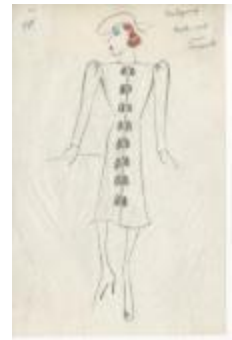
Women's Black Wool Coat with Tassels (KA0039_V8p04-003)