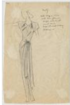
Black Cloque Dress with Draping and Sash at Waist (KA0039_V8p72-003)