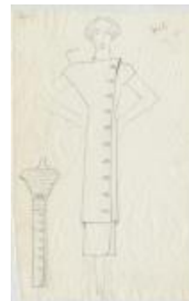
Women's Ensemble with Short-Sleeved Drop Shoulder Coat and Calf-Length Dress (KA0039_V8p14-004)