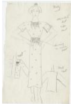
Women's Black and White Dot Print CrÃ©pe Suit with Shirring (KA0039_V8p10-005)