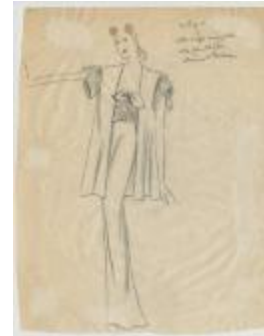
Black CrÃ©pe Women's Ensemble with Long Vest and Paillettes (KA0039_V8p73-001)