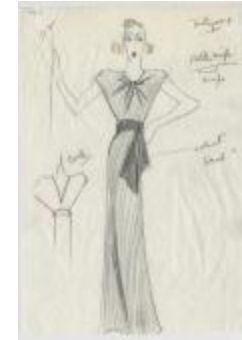
Black CrÃ©pe Evening Dress with Velvet Sash (KA0039_V8p45-002)