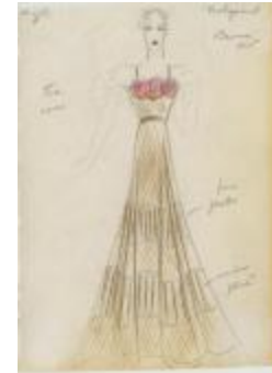
Brown Net Evening Dress with Pleated Panels and Tea Rose Embellishments (KA0039_V9p55-009)