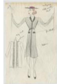
Black Wool Women's Suit with Paillette and Fur Accents (KA0039_V9p10-002)