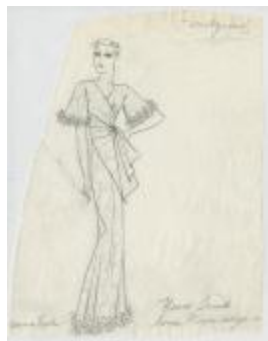
Flower Print Wrap Dress with Loose Flower Embellishments Around the Edges (KA0039_V8p61-002)