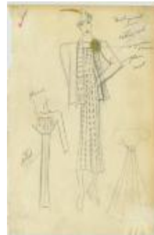
Women's Dotted Wool Ensemble with Yellow Flower Embellishments (KA0039_V9p27-003)