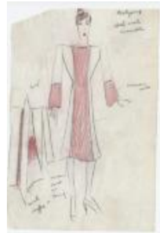
Black and Maroon Wool Dress with Matching Coat (KA0039_V8p11-006)