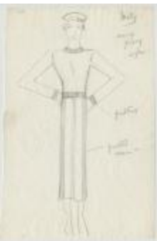
Navy Jersey Two-Piece Women's Ensemble with Quilted Details (KA0039_V8p13-004)