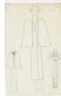
Set of Sketches Depicting Two Capes and Printed Dress (KA0039_V8p10-003)