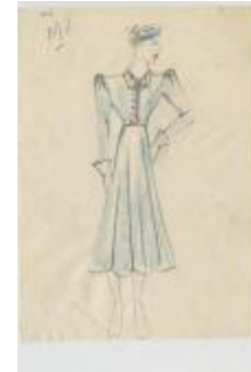
Long-Sleeved Blue Shirt Dress with White Bowtie and Matching Pillbox Hat (KA0039_V8p38-005)