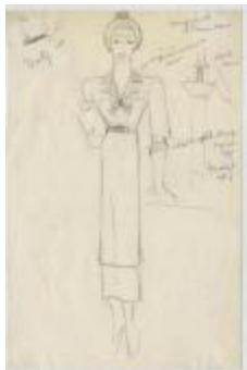
Navy Wool Tunic Dress with PiquÃ© Accents (KA0039_V8p17-002)