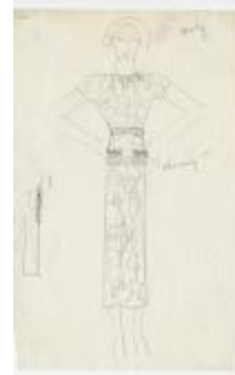
Printed Calf-Length Dress with Shirred Pockets and Matching Coat (KA0039_V8p10-002)