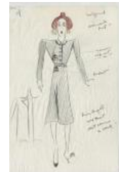
Black Wool Women's Suit Featuring Shirt Dress with Maroon CrÃ©pe Pocket Accents (KA0039_V8p31-002)