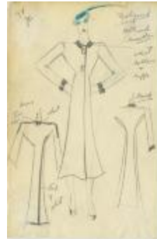
Women's Black Wool Ensemble with Velvet Accents (KA0039_V9p54-001)