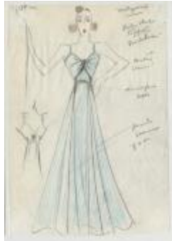
Pale Blue Taffeta and Gros de Londres Evening Dress (KA0039_V8p44-001)