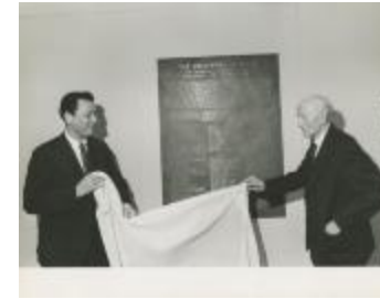
Unveiling of University in Exile Plaque (NS040101_000044)