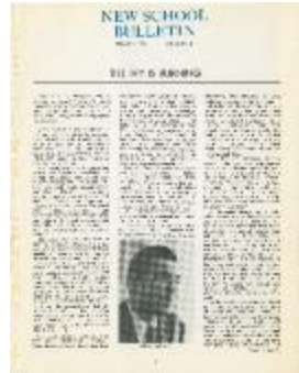
New School Bulletin Vol. 26, No. 3 (NS030102_bull2603)