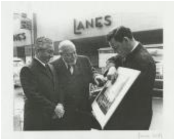
People Viewing an Architectural Rendering of the Graduate Center of the New School for Social Research (NS040101_000193)