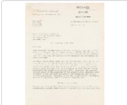
Letter to the National Labor Relations Board Regional Office from Attorneys for Community and Social Agency Employees