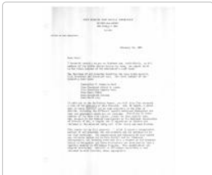
Self-Study Report: New School for Social Research and Parsons School of Design (NS010105_000007)