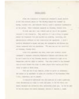
General Notice (NS010102_000017)