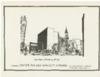
Women's House of Detention Site (NS010102_000019)