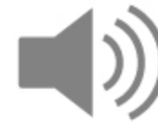
Parsons School of Design/New School for Social Research Merger Announcement (PC070205_Parsons_New_School)