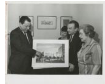
People View an Architect's Rendering of the Graduate Center of the New School for Social Research (NS040101_000174)