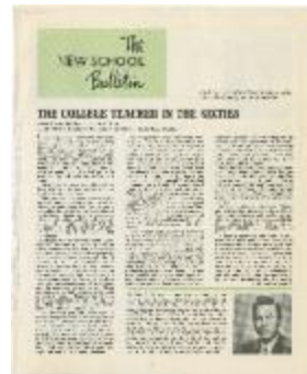
The New School Bulletin Volume 22, Number 19 (NS030102_bull2219)