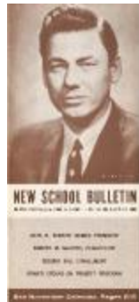
New School Bulletin Vol. 22, No. 05 (NS030102_bull2205)