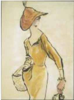
Yellow Sheath Dress with Orange Hat and Basket Purse (KA0038_000116)