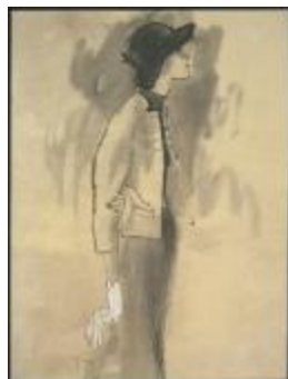
Women's Ensemble with Short Jacket and Cloche Hat (KA0038_000049)