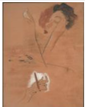
Women Plucking Eyebrows, Applying Makeup, and Filing Nails (KA0038_000062)