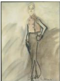
Evening Ensemble with Sleeveless Pink Pillbox Jacket (KA0038_000043)