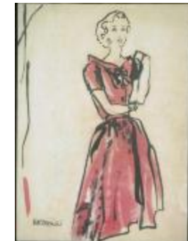
Pink Shirtdress with Chelsea Collar (KA0038_000085)