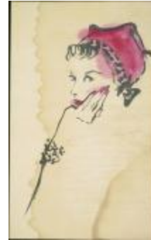
Rose Handkerchief Hat with French Ribbon Trim (KA0038_000121)