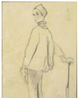
Women's Ensemble with Loose Coat (KA0038_000131)