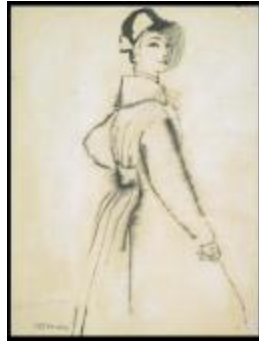
High-Waisted Women's Coat with Back Belt (KA0038_000002)