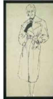
Women's Trench Coat with Wide Notched Collar (KA0038_000102)