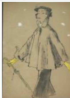
Short Swing Coat with Trumpet Skirt (KA0038_000067)