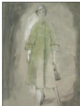
Women's Green Coat with Large Button Closure (KA0038_000075)