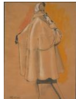
Women's "BÃ©nÃ©dictine" Coat with Low Yoke (KA0038_000021)