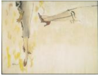
Fitted Skirts with Red or Orange Pumps (KA0038_000083)