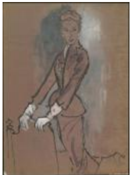
Women's Late-Day Suit in Wine Velveten (KA0038_000032)