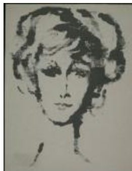
Portrait of Unknown Woman (KA0038_000091)