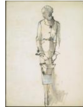
Women's Suit with Belted Jacket and Fitted Skirt (KA0038_000093)