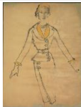
Grey Wool Jersey Dress with Wrap-Around Skirt (KA0038_000066)