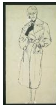
Women's Trench Coat with Wide Notched Collar (KA0038_000102)