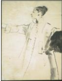
Women's Loose Overcoat with Small Buttons and Fur Muff (KA0038_000107)