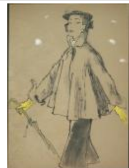
Short Swing Coat with Trumpet Skirt (KA0038_000067)