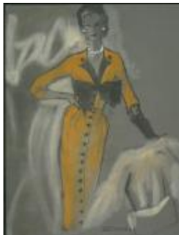
Orange Coat Dress with Large Black Bow (KA0038_000033)