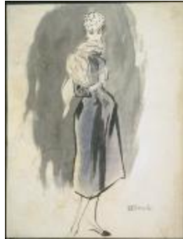
Navy Dress with Rhinestone Embellishments (KA0038_000072)