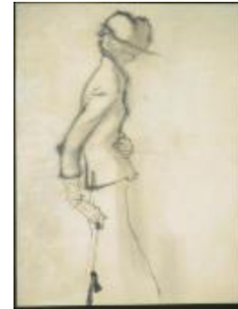
Women's Fitted Jacket and Quilled Hat (KA0038_000105)