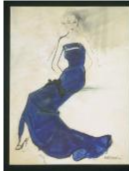
Strapless Blue Evening Dress with Mermaid Skirt (KA0038_000005)