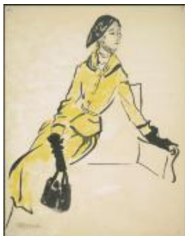
Yellow Silk Shantung Women's Suit (KA0038_000074)