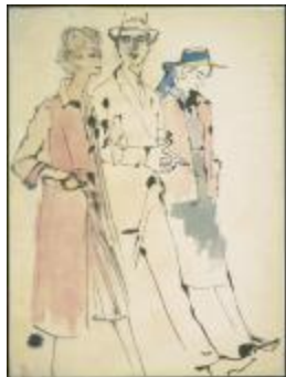
Women's Pink Coat and Jacket Ensembles (KA0038_000027)