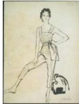
Corded Overalls with Sash Belt (KA0038_000109)