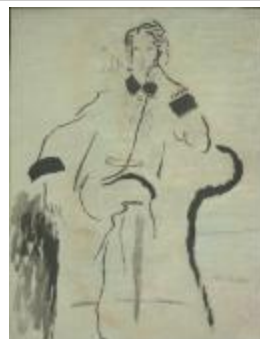
Women's Ensemble Featuring Coat with Flap Closure and Dark Collar (KA0038_000078)