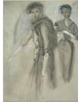
Coat Dresses (KA0038_000025)