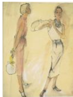
Shell Pink Dress and Lavender-Blue Ensemble (KA0038_000056)