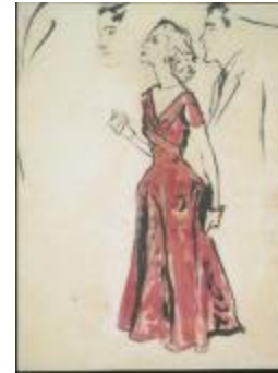
Short-Sleeved Pink Dress with Wrapped Bodice (KA0038_000068)