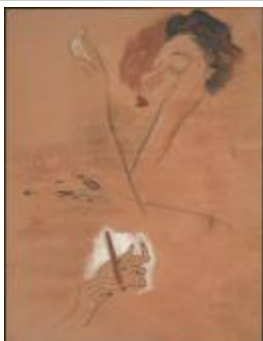
Women Plucking Eyebrows, Applying Makeup, and Filing Nails (KA0038_000062)