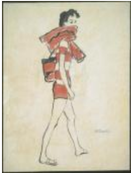
Red Striped Pullover with Gabardine Shorts (KA0038_000088)