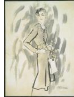
Women's Suit with Framed Handbag (KA0038_000020)