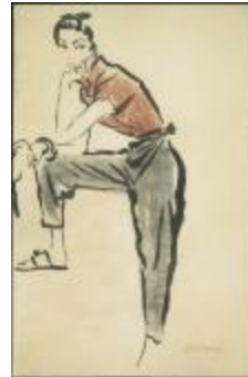
Women's Ensemble with Black Pants and Short-Sleeved Red Blouse (KA0038_000120)