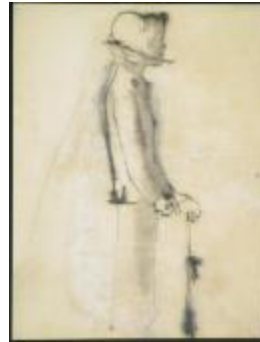
Women's Fitted Jacket and Quilled Hat (KA0038_000098)