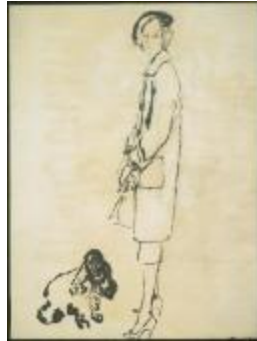
Women's Topcoat with Square Patch Pocket (KA0038_000106)