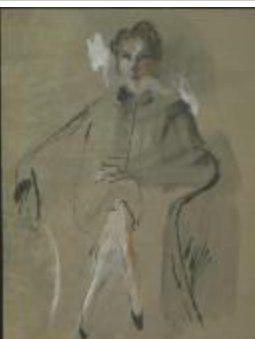
Women's Ensemble with Dark Collar and Matching Sleeve Cuffs (KA0038_000122)