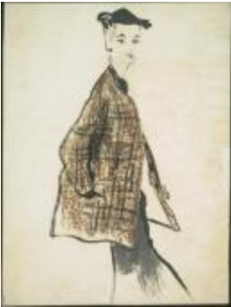
Rust and Black Tweed Collarless Coat (KA0038_000044)