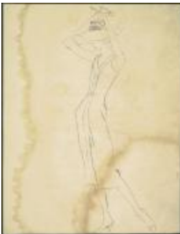
Women's Beachwear Ensemble with Buttoned Dress and Sunhat (KA0038_000104)