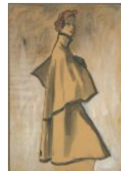
Flannel Cape Coat with Black Braid Piping (KA0038_000054)