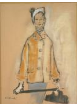
Women's "B&A" dictline Wool Coat (KA0038_000026)