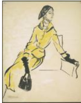
Yellow Silk Shantung Women's Suit (KA0038_000074)