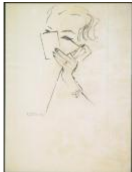
Woman Applying Mascara (KA0038_000060)