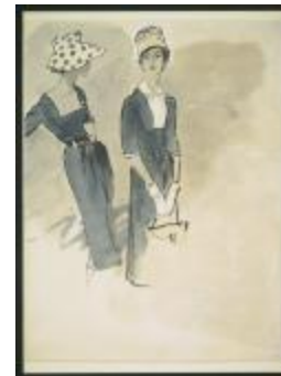
Blue Sheath Dresses (KA0038_000013)