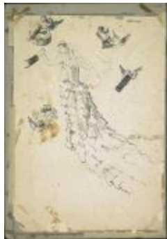
Ruffled Bridal Gown and Containers of "Salut de Schiaparelli" (KA0038_000077)