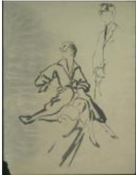
Women's Loose Overcoat and Men's Suit (KA0038_000111)