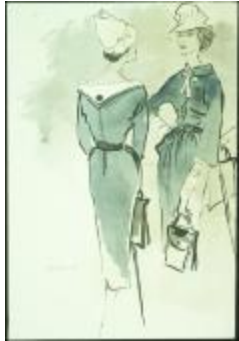
Navy Blue Dresses with White Hats (KA0038_000017)