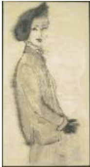
Women's Cardigan Jacket and Beret (KA0038_000119)