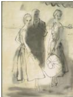
Blue Dresses with Tucks (KA0038_000015)