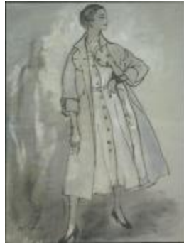
Women's Ensemble with Shirtdress and Tent Coat (KA0038_000016)