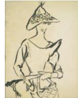
Scoop-Necked Dress with Embellished Hat (KA0038_000123)