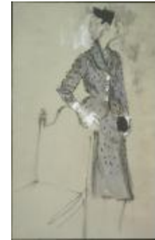
Blue Women's Suit with Black Dots (KA0038_000019)