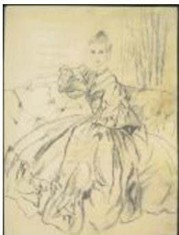
Portrait of Unknown Woman in Full Evening Dress and Drop Necklace (KA0038_000097)