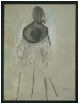
Women's Tweed Coat with Sealskin Collar (KA0038_000007)