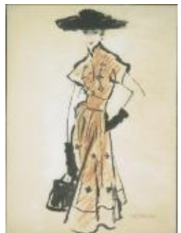
Two-Piece Sepia Linen Dress with Black Embroidery (KA0038_000125)