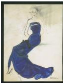
Strapless Blue Evening Dress with Mermaid Skirt (KA0038_000005)