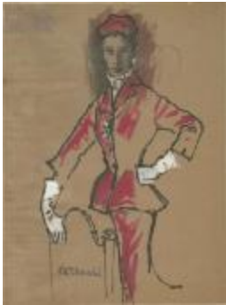
Wine Velveten Late-Day Suit (KA0038_000038)