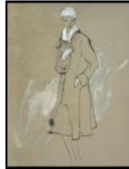
Women's Coat with White Ermine Collar (KA0038_000003)