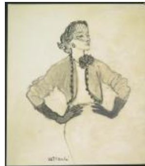
Blond Fleece Jacket with Black Braid and Tassels (KA0038_000063)