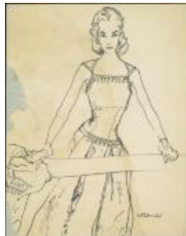
Evening Dress with Beaded Trim and Matching Stole (KA0038_000127)