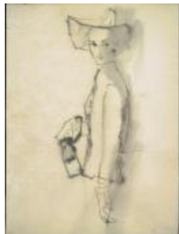
Women's Ensemble with Fitted Jacket and Wide-Brimmed Hat (KA0038_000079)