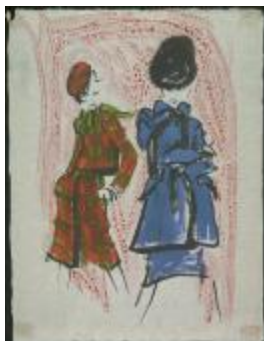
Women's Red Plaid Ensemble and Solid Blue Ensemble (KA0038_000089)