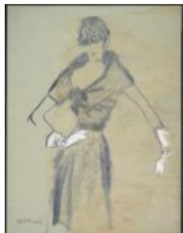
Short Dress with Fichu Wrap and Spotted Cap (KA0038_000086)