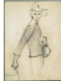
Women's Ensemble with Fitted Jacket and Tall Hat (KA0038_000095)