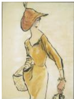
Yellow Sheath Dress with Orange Hat and Basket Purse (KA0038_000116)