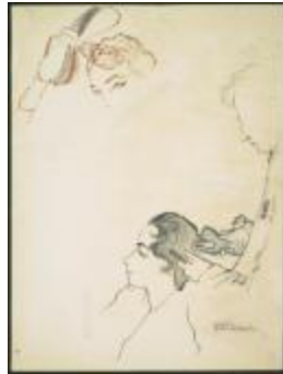
Women Using Hair Color Selector and Pinking Machine (KA0038_000090)