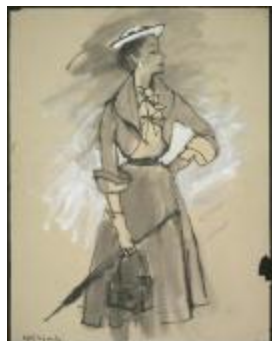
Women's Ensemble with Bolero Jacket and Large Bows (KA0038_000057)