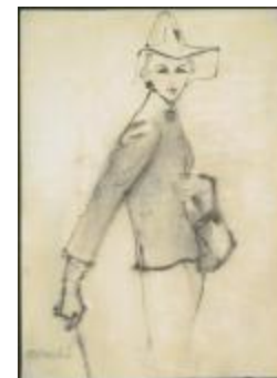
Women's Ensemble with Fitted Jacket and Tall Hat (KA0038_000095)