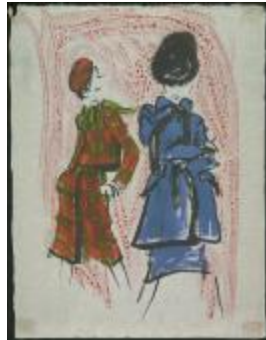
Women's Red Plaid Ensemble and Solid Blue Ensemble (KA0038_000089)