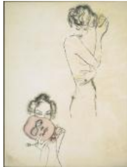
Women Applying "Diet-Form" and Heated Facial Mask (KA0038_000045)