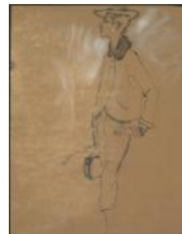
Topaz Wool Ensemble with Mink Collar (KA0038_000065)