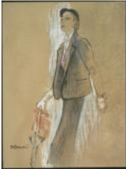
Box-Jacket Suit with Pink Velveten Vest (KA0038_000022)