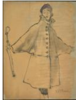
Women's Tent Coat with Dolman Sleeves (KA0038_000018)