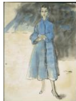
Turquoise Blue Coat with Fringe (KA0038_000076)