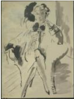
Women's Ensemble with Dark Collar and Matching Sleeve Cuffs (KA0038_000099)