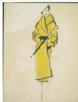
Women's Yellow Wrap Coat with Shawl Collar (KA0038_000080)