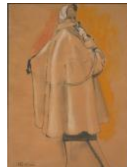
Women's "B&A" dictline Coat with Low Yoke (KA0038_000021)