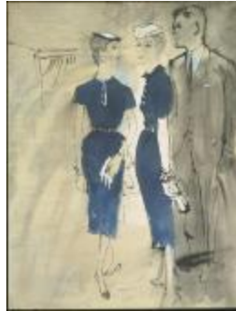
Navy Blue Sheath Dresses with White Buttons (KA0038_000024)