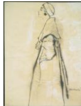
High-Waisted Women's Coat with Shawl Collar (KA0038_000031)