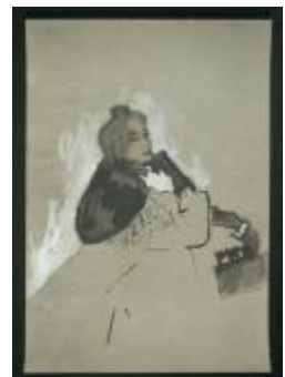
Women's Coat with Oversized Collar (KA0038_000008)