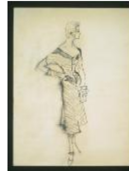
Short-Sleeved Dress with Diagonal Stripes (KA0038_000103)