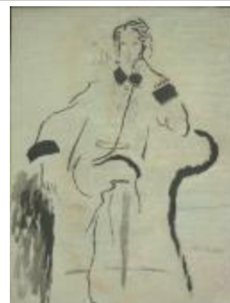
Women's Ensemble Featuring Coat with Flap Closure and Dark Collar (KA0038_000078)