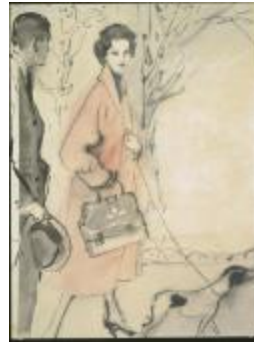
Pink Fleece Women's Coat (KA0038_000052)