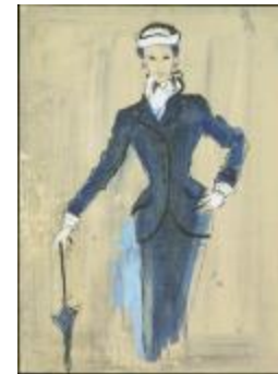
Fitted Blue Women's Suit (KA0038_000115)