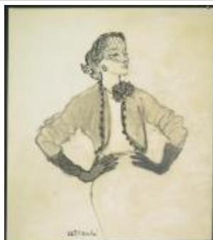
Blond Fleece Jacket with Black Braid and Tassels (KA0038_000063)