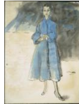
Turquoise Blue Coat with Fringe (KA0038_000076)