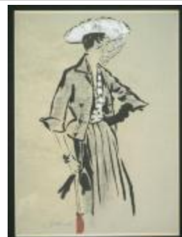
Women's Ensemble with Veiled Hat (KA0038_000009)