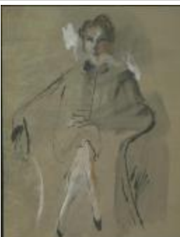
Women's Ensemble with Dark Collar and Matching Sleeve Cuffs (KA0038_000122)