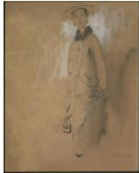
Cutaway Jacket with Fur Collar (KA0038_000094)