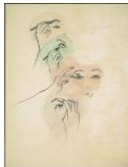
Women Applying Eye Makeup and Plucking Eyebrows (KA0038_000058)