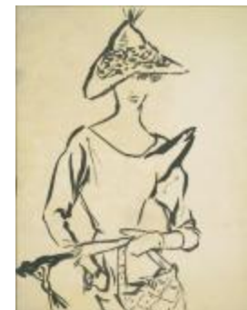
Scoop-Necked Dress with Embellished Hat (KA0038_000123)