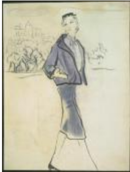
Short Navy Blue Coat and Fitted Skirt (KA0038_000113)