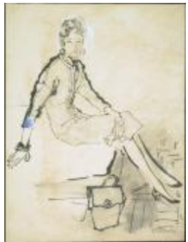
Women's Cardigan Suit (KA0038_000014)