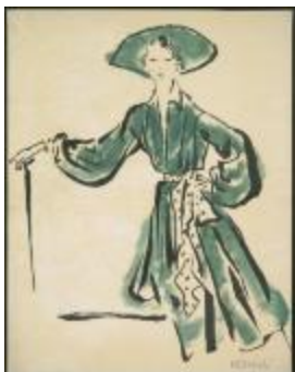
Fir-Green Silk Surah Suit (KA0038_000048)