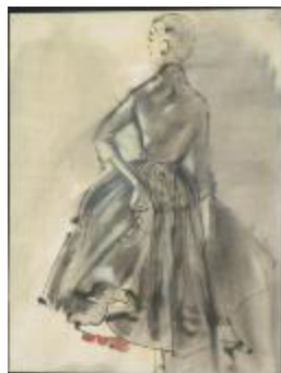
Black Taffeta Dress with Colorful Petticoat (KA0038_000046)