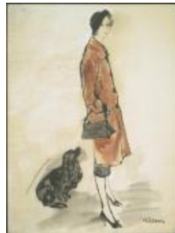
Auburn Velvet Coat (KA0038_000035)