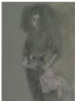
Women's Ensemble with Belted Sweater and Pleated Skirt (KA0038_000055)