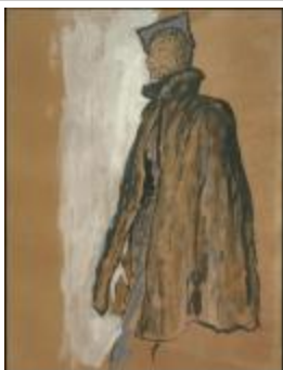
Fur Cape, Grey Dress, and Veiled Headpiece (KA0038_000110)