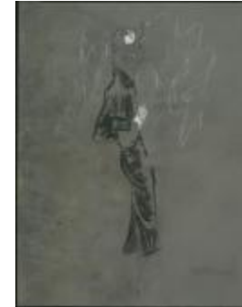
Women's Ensemble with Short Loose Coat and Long Fitted Skirt (KA0038_000112)