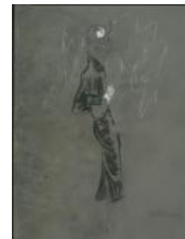
Women's Ensemble with Short Loose Coat and Long Fitted Skirt (KA0038_000112)