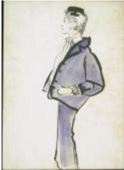
Short Navy Blue Coat with Silk Braided Trim (KA0038_000114)