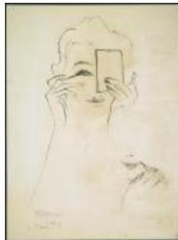
Women Applying Mascara and Lip Pencil (KA0038_000061)