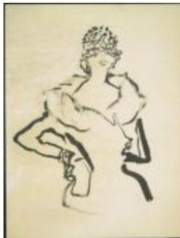
Evening Coat and Birdcage Veil (KA0038_000034)