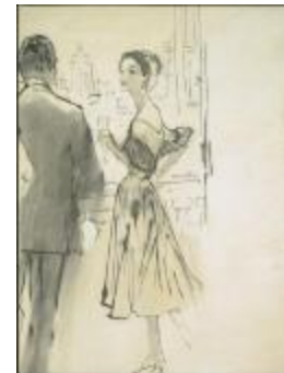
Pleated Dress with Bell Sleeves (KA0038_000042)