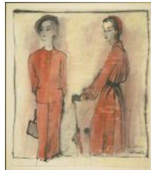
Red Jersey Ensemble and Shirtwaist Dress (KA0038_000037)