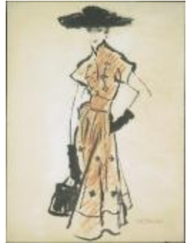
Two-Piece Sepia Linen Dress with Black Embroidery (KA0038_000125)