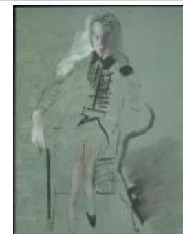
Women's Ensemble with Dark Collar and Matching Sleeve Cuffs (KA0038_000096)