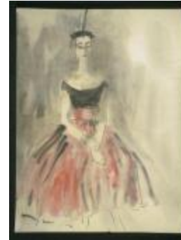
Black Top with Pink Taffeta Skirt (KA0038_000011)