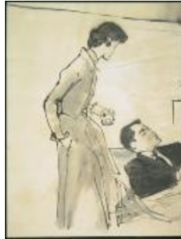
Two Women's Ensembles with Short Jackets and Gingham Blouses (Drawing in 2 Parts) (KA0038_000108)