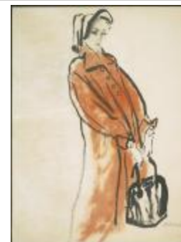
Women's Burnt Tangerine Travel Coat (KA0038_000071)