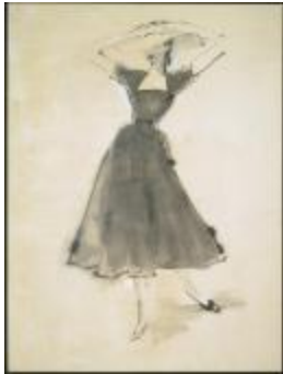
Black Cotton Piqué Dress with Straw Hat (KA0038_000069)