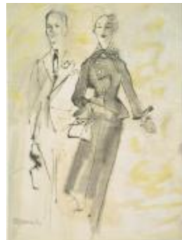
Black Alpaca Skirt and Fitted Jacket (KA0038_000030)