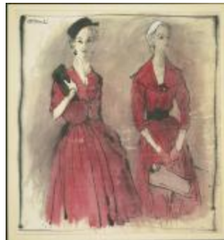
Red Jersey Dresses (KA0038_000036)