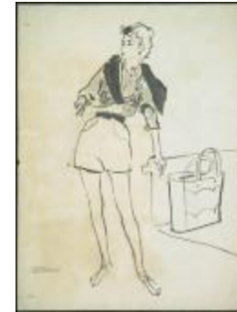
Women's Ensemble with Gabardine Shorts and Filled Gingham Blouse (KA0038_000132)