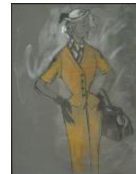
"B&A" dictline Linen Suit with Cardigan Jacket (KA0038_000023)