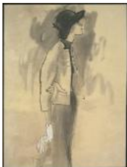
Women's Ensemble with Short Jacket and Cloche Hat (KA0038_000049)