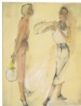
Shell Pink Dress and Lavender-Blue Ensemble (KA0038_000056)