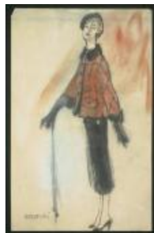
Orange and Black Plaid Jacket with Black Velveteen Skirt (KA0038_000101)