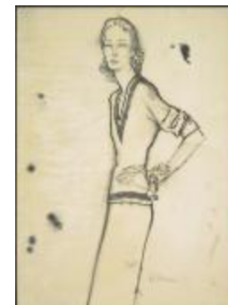
Middy-Bodice Sheath Dress (KA0038_000059)