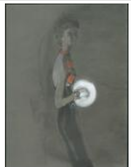
Wool Plaid and Velveteen Directoire Suit (KA0038_000050)