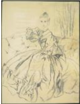
Portrait of Unknown Woman in Full Evening Dress and Drop Necklace (KA0038_000097)