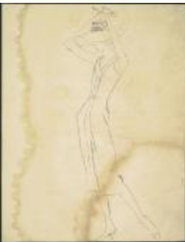
Women's Beachwear Ensemble with Buttoned Dress and Sunhat (KA0038_000104)