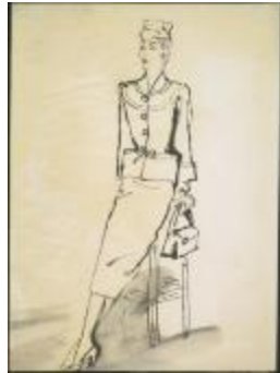
Women's Suit with Yoke and Bow Accents (KA0038_000081)