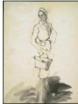
Women's Suit with Belted Coat and Fitted Skirt (KA0038_000084)