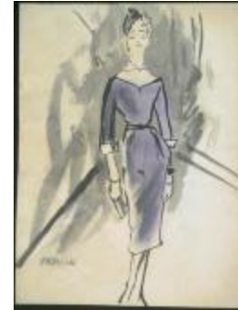
Blue Sheath Dress with White Collar and Sleeve Cuffs (KA0038_000092)