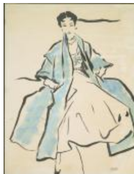
Blue Linen Coat with Embroidered Dinner Dress (KA0038_000053)