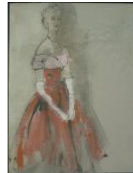
Pale Pink Chiffon Top and Crimson Satin Skirt (KA0038_000041)