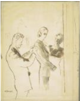
Woman in Jacket with Two Tailors (KA0038_000128)