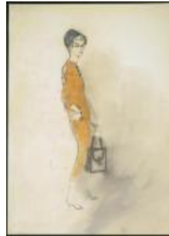
Women's Matchbox Suit in Persimmon (KA0038_000087)