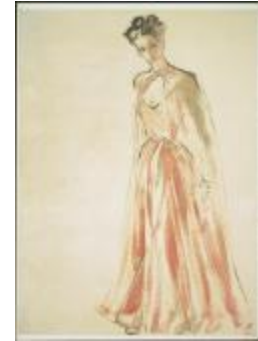
Coral Evening Dress with Cape (KA0038_000028)