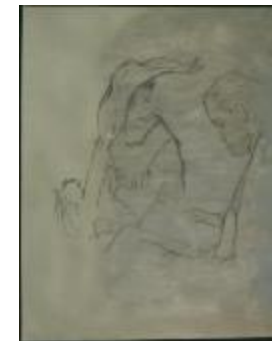
Oversized Women's Hat with Bow (KA0038_000082)