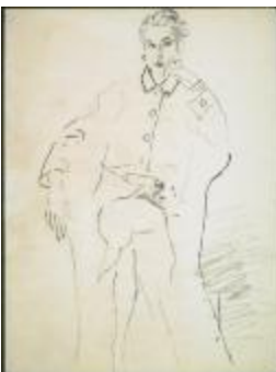
Women's Ensemble Featuring Coat with Flap Closure (KA0038_000100)