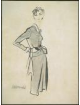
Navy Women's Suit with Framed Handbag (KA0038_000070)