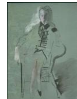
Women's Ensemble with Dark Collar and Matching Sleeve Cuffs (KA0038_000096)