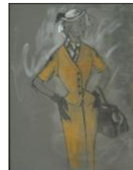
"BÃ©nÃ©dictine" Linen Suit with Cardigan Jacket (KA0038_000023)