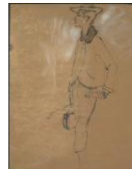
Topaz Wool Ensemble with Mink Collar (KA0038_000065)