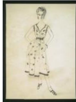
Day Dress with Butterfly Embroidery (KA0038_000010)