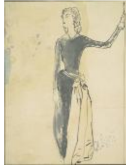
Long-Sleeved Navy Evening Dress with Low-Slung Girdle (KA0038_000129)