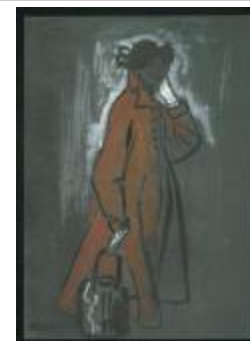
Women's Burnt Tangerine Tavel Coat and Veiled Hat (KA0038_000012)