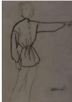
Long-Sleeved Tunic Blouse with Cinched Waistline (KA0038_k09_05_01)