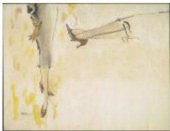
Fitted Skirts with Red or Orange Pumps (KA0038_000083)