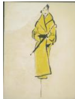
Women's Yellow Wrap Coat with Shawl Collar (KA0038_000080)