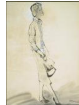
Women's Cardigan Suit with Blue Border (KA0038_000040)