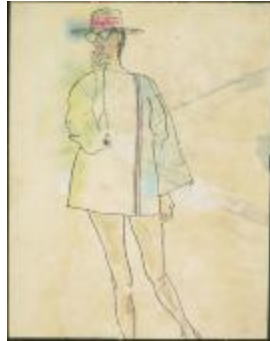
Multicolor Poncho and Sunhat (KA0038_000118)