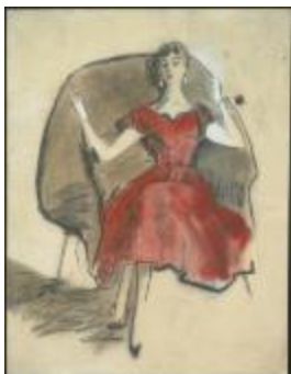
Red Lace Evening Dress with Cape Collar (KA0038_000073)