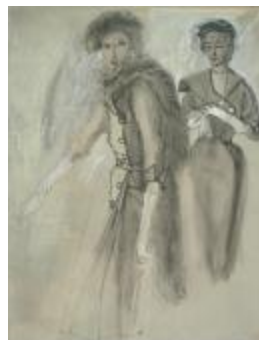
Coat Dresses (KA0038_000025)