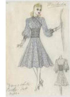
Navy and White Polka Dot Crepe Dress with Bishop Sleeves (KA0039_V8p40-001)