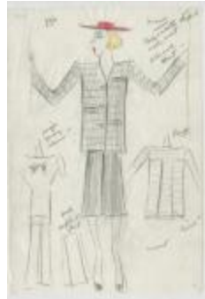
Women's Ensemble with Black and White Striped Coat and Beige Jersey Blouse (KA0039_V8p37-005)