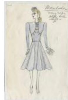
Navy Crepe Dress with White Collar and Cuffs (KA0039_V8p42-004)