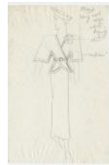
Navy Wool Women's Ensemble with Cape Top and White Piqué Edges (KA0039_V8p07-004)