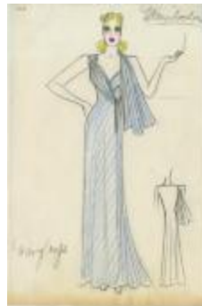
Navy Crepe Evening Dress with Draped Panel (KA0039_V9p70-008)