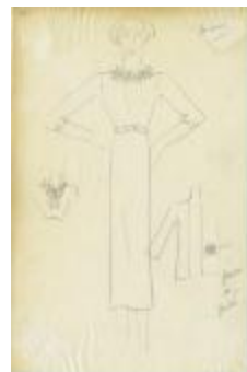
Women's Ensemble with Floral Embellishments (KA0039_V9p68-001)