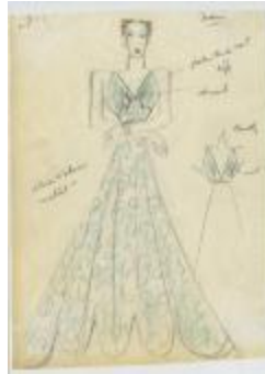
Pale Blue and Silver Printed Evening Dress (KA0039_V9p50-007)