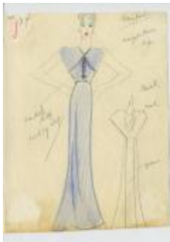
Royal Blue CrÃ©pe Evening Dress with Braided Strips (KA0039_V9p60-008)