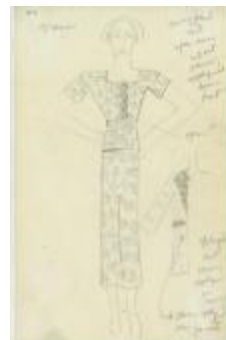
Daisy Printed Women's Suit with Floral Appliques (KA0039_V9p69-006)