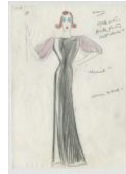
Black Satin Evening Dress with Pink Pleated Net Sleeves (KA0039_V8p35-008)