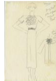
Short-Sleeved Grey Dress with Plaid Jabot Collar and Matching Coat (KA0039_V9p62-002)