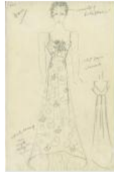
Floral Printed Evening Dress with Field Flower Wreath and Whale Boning (KA0039_V9p68-005)