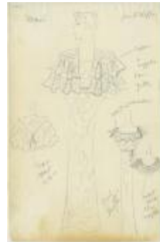
Calf-Length Printed Chiffon Dress with Ruffled Cape (KA0039_V9p66-007)