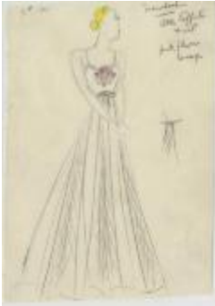
Black Taffeta and Net Evening Dress with Pink Flower Corsage (KA0039_V9p48-005)