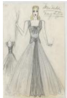
Navy Chiffon Evening Dress with Wrapped Bodice and Bows (KA0039_V8p40-009)