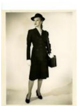
Public Health Nurse (KA0023_b01_f11_01)