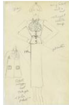
Women's Navy Taffeta Suit with Swagger Coat and White Eyelet Batiste Scarf (KA0039_V9p69-002)