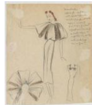
Black Chiffon Velvet Dress with Velvet and Mink Cape and Coral and Pearl Embellishments (KA0039_V8p70-002)