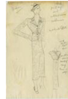
Women's Floral Printed Chiffon Suit with Boutonniere (KA0039_V9p67-002)