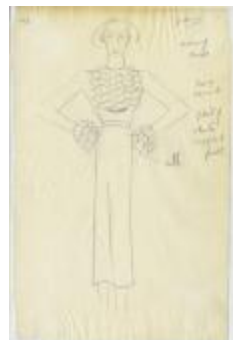
Navy CrÃ©pe Dress with White Ruffled Gilet and Sleeve Cuffs (KA0039_V9p67-003)