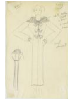
Women's Navy Coat with White Collar and Wool Bows (KA0039_V9p65-002)