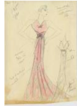
Evening Dress with Sheer Red Bodice and Red and Silver Printed Skirt (KA0039_V9p43-007)