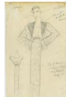
Women's Printed Suit with Shirred and Puffed Lapel (KA0039_V9p68-002)