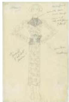
Daisy Printed Women's Suit with Cut-Out Flowers and Green Lace Accents (KA0039_V9p69-005)