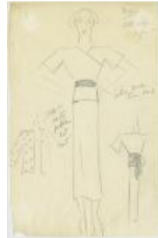
Women's Black CrÃ©pe Ensemble with Polka Dot Coat (KA0039_V9p65-001)