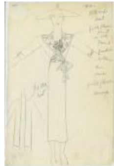
Women's Black CrÃ©pe Suit with Field Flower Printed Fichu Collar (KA0039_V9p65-003)