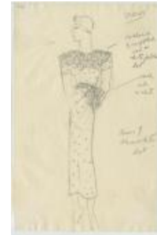
Blue and White Polka Dot Dress with Three Ruffled Red and White Polka Dot Collars (KA0039_V9p24-005)