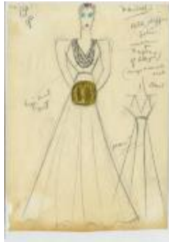
Black Slipper Satin Evening Dress with Jet Bead Rope Necklaces (KA0039_V9p39-007)