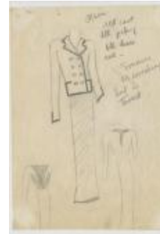
Double Breasted Red Tweed Coat with Black Piping and Black Dress (KA0039_V8p37-007)