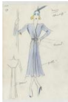
Blue CrÃ©pe Long-Sleeved Wrap Dress with Full Skirt (KA0039_V8p34-004)