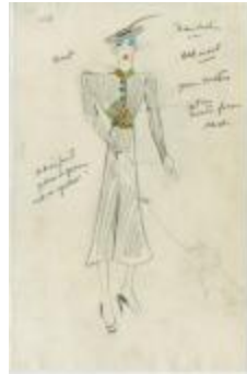
Black Wool Dress with Indian Print Scarf and Sash Belt (KA0039_V9p41-005)