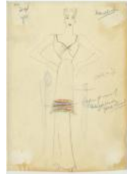
Black CrÃ©pe Evening Dress with Colored Bead and Gold Thread Border (KA0039_V9p57-009)