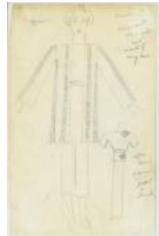
Sheer Navy Women's Suit with Navy Lace Inserts (KA0039_V9p69-001)