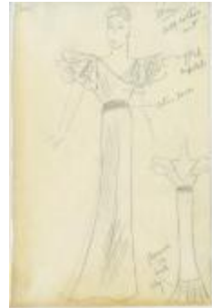
Black Cotton Net Evening Dress with Ruffled Capelet Sleeves (KA0039_V9p64-007)