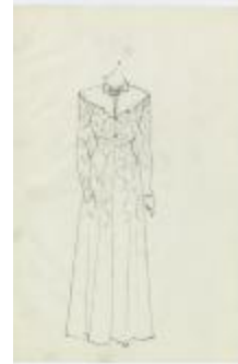
Women's Evening Ensemble with Collared Bolero Jacket (KA0067_000336)