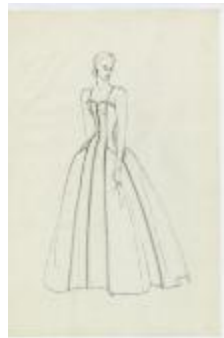
Evening Dress with Buttoned Bodice and Narrow Trim (KA0067_000306)