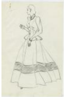
Women's Evening Ensemble with Full Skirt and Ruffled Peplum Jacket (KA0067_000293)