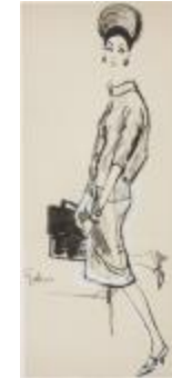
Women's Ensemble with Pencil Skirt and Loose Buttoned Jacket (KA008601_MCB4_f01_01)