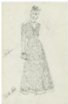
Women's Lace Evening Ensemble with Long Pink Gloves (KA0067_000338)