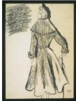
Women's Tweed Coat with Wide Collar (KA0038_000004)