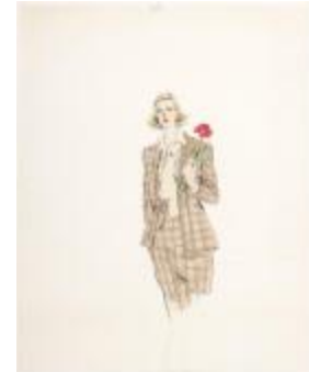
Women's Brown Plaid Suit with Tan Collared Shirt (KA002201_OSxxx1_f11_03)