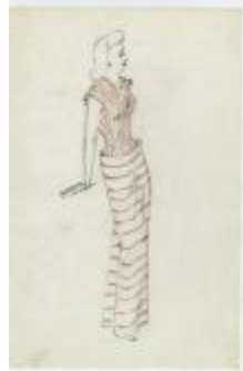
Red Striped Evening Dress (KA0067_000253)