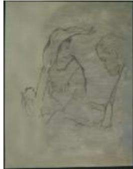
Oversized Women's Hat with Bow (KA0038_000082)