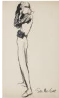
Women's Sleeveless Ski Suit with Striped Top and Belt Satchel (KA008601_MCB3_f06_03)