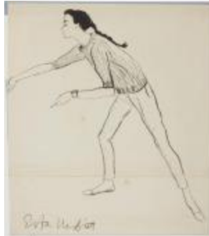
Cable Knit Sweater with Skinny Trousers (KA008601_MCB3_f04_04)