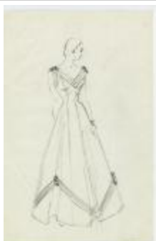
Evening Dress with Small Bows and Bands of Stripes or Tucks (KA0067_000310)