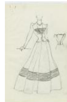
Women's Evening Ensemble with Fitted Jacket and Wide Stripes (KA0067_000300)