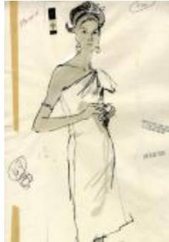
Asymmetrical Evening Dress with Oversized Bow (KA002201_OSxx3_f10_02)