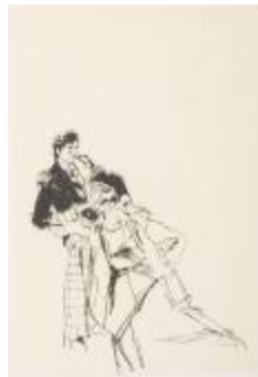
Man and Woman Lounging in Casual Ensembles (KA002201_OSxxx1_f01_01)