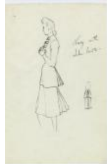
Women's Ensemble with Bows and Pleated Panels (KA0067_000271)