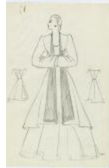
Women's Evening Ensemble with Draped Collar (KA0067_000291)