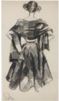
Plaid Skirt and Matching Shawl with White Collared Blouse (KA008601_MCB3_f04_02)