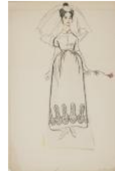
Wedding Dress with Buttoned Bodice and Embroidered Skirt (KA008601_MCB2_f02_03)