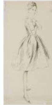
Dress with Short Sleeves and Full Knee- Length Skirt (KA008601_MCB2_f04_04)