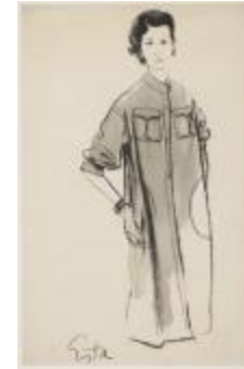
Women's Long Overcoat with Square and Circular Pockets (KA008601_MCB4_f02_01)