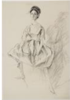
Dress with Short Sleeves and Full Knee- Length Skirt (KA008601_MCB2_f04_03)