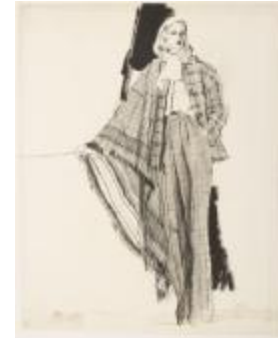
Plaid Women's Ensemble Featuring Blanket Cape (KA002201_OSxxx1_f04_10)