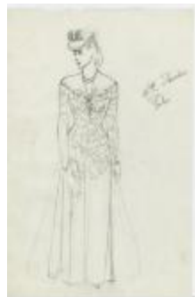
Long-Sleeved Evening Dress with Lace (KA0067_000339)