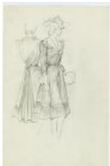
Long-Sleeved Dress with Ruffled Collar (KA0067_000285)