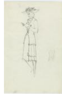
Women's Ensemble with Pleated Skirt and Cutaway Coat (KA0067_000259)