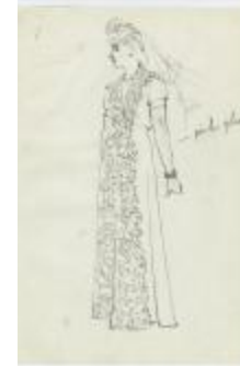
Women's Evening Ensemble with Lace and Long Pink Gloves (KA0067_000317)