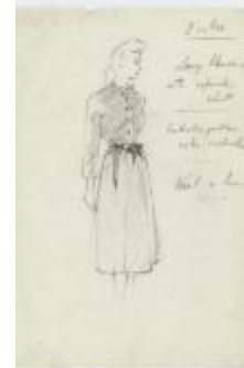
Long Blouse with Drawstring Skirt (KA0067_000272)