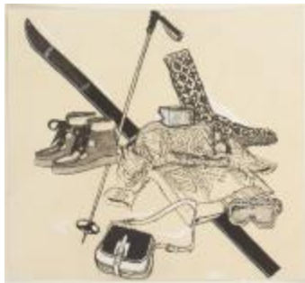
Sweater, Boots, Socks, and Purse with Assorted Ski Equipment (KA002201_OSxxx1_f04_03)