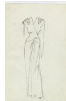
Evening Dress with Wrapped Bodice and Embellished Shoulders (KA0067_000341)