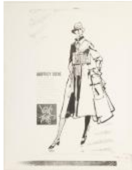
Lord & Taylor Advertisement Featuring Garnet Wool Ensemble by Geoffrey Beene (KA002201_OSxxx1_f02_01)