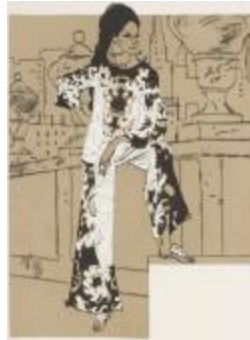
Women's Printed Pajama Suit with Tiered Tassel Earrings (KA002201_OSxxx1_f03_02)