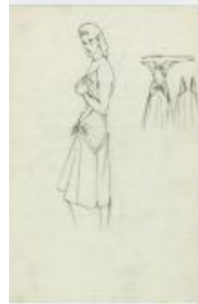
Long-Sleeved "Handkerchief" Dress (KA0067_000254)