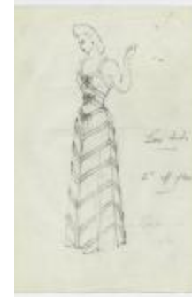
Evening Dress with Bows and Box Tucks (KA0067_000243)