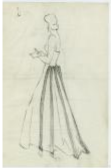
Floor-Length Dress with Long Contrasting Fins (KA0067_000281)