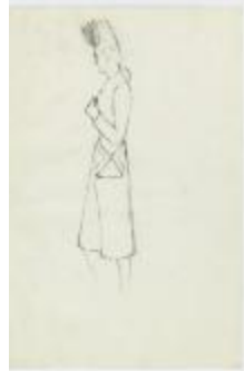
Women's Ensemble with Tall Cossack Hat (KA0067_000257)