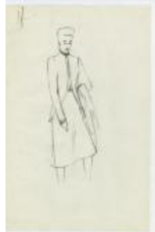
Women's Ensemble with Collarless Cutaway Coat (KA0067_000270)