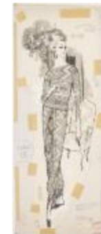
Printed Women's Ensemble with Harem Trousers (KA002201_OSxxx1_f10_01)