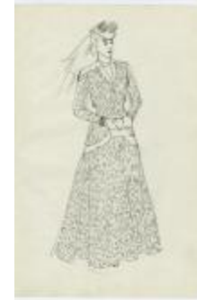
Women's Lace Evening Ensemble with Bolero Jacket (KA0067_000333)