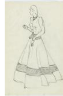
Women's Evening Ensemble with Full Skirt and Peplum Jacket (KA0067_000296)