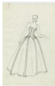
Evening Dress with Full Skirt and Decorative Bands (KA0067_000303)