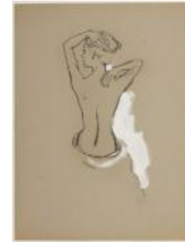
Back View of Nude Woman (KA002201_OSxxx1_f03_05)