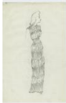
Sleeveless Evening Dress with Shirred and Pleated Panels (KA0067_000249)