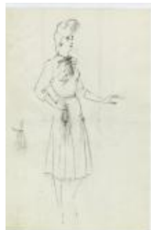
Dress with Drawstring Pockets and Keyhole Neckline (KA0067_000327)