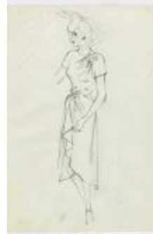
Short-Sleeved Dress with Draped Skirt and Gathered Bodice (KA0067_000279)