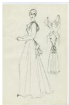
Evening Dress with Wide Ribbon Bows (KA0067_000311)