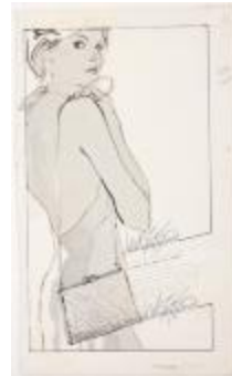
Lord & Taylor Advertisement Featuring Woven Bag by Judith Leiber (KA002201_OSxxx1_f12_02)