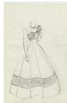
Women's Evening Ensemble with Bolero Jacket and Large Bow (KA0067_000299)