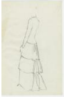
Women's Evening Ensemble with Tiered Skirt (KA0067_000346)