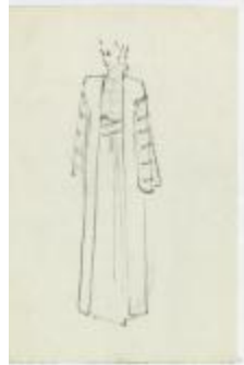
Women's Ensemble with Floor-Length Coat (KA0067_000265)