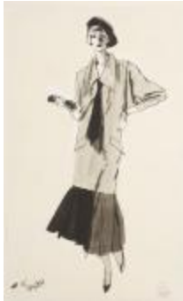
Schoolgirl Dress with Exaggerated Drop Waist and Oversized Collar (KA002201_OSxxx1_f04_12)