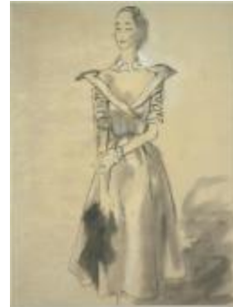
Belted Dress with Extra Wide Neckline (KA0038_000029)