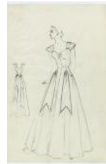
Evening Dress with Full Skirt and Wide Ribbons (KA0067_000309)