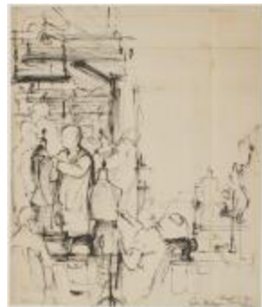
Talmack Design Room (KA008601_MCB4_f04_01)