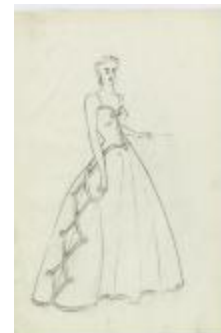
Evening Dress with Decorative Trim (KA0067_000288)