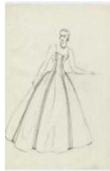
Evening Dress with Full Skirt and Bands of Tucks or Pleats (KA0067_000308)