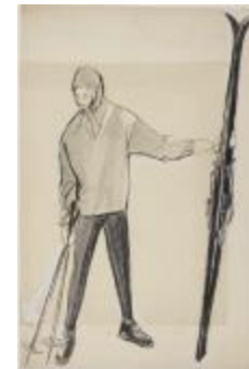
Women's Ski Ensemble with Polka-Dotted Parka and Striped Trousers (KA008601_MCB3_f06_01)