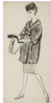
Double-Breasted Fur Coat with Pencil Skirt and Pillbox Hat (KA008601_MCB4_f01_03)