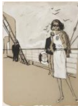
Woman on Ship Deck Wearing Short Sheath Dress with Cut-Out Design (KA002201_OSxxx1_f04_01)