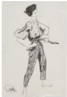
Women's Ensemble with Striped Capri Pants and Collared Blouse (KA008601_OSx1_f02_06)