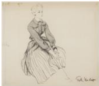
Women's Polka Dotted Blouse with Pleated Midi Skirt (KA008601_MCB4_f02_02)