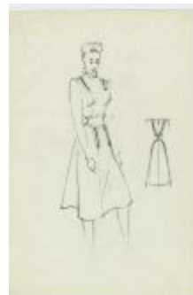
Long-Sleeved Dress with Decorative Bands and Small Buttons (KA0067_000275)