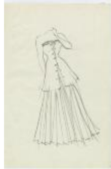
Pleated Evening Dress with Buttoned Tunic Layer (KA0067_000331)