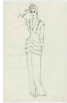
Evening Dress with Tiered Tunic and Embellished Bodice (KA0067_000344)