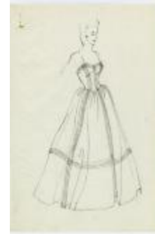
Striped Evening Dress with Full Skirt (KA0067_000268)