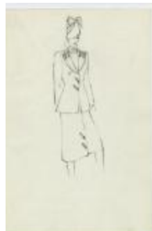
Women's Suit with Small Strip Embellishments (KA0067_000261)