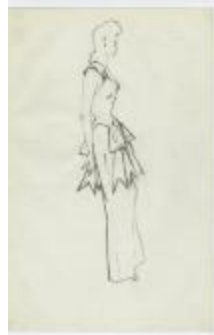
Sleeveless Evening Dress with Wide Ribbon (KA0067_000241)