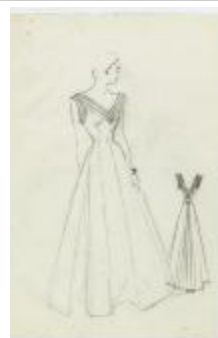
Evening Dress with Pleated Panel and Bands of Tucks (KA0067_000312)