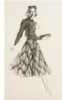
Women's Ensemble Featuring Pleated Plaid Skirt and Sweater (KA002201_OSxxx1_f04_07)