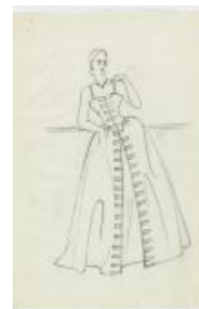
Evening Dress with Open Skirt and Cartridge Embellishments (KA0067_000304)