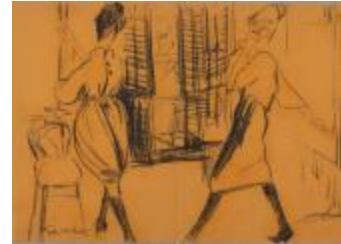
Bubble Dress and Two-Piece Women's Ensemble (KA008601_MCB1_f07_01)