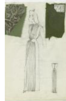
Pleated Evening Dress with Solid Panels (KA0067_000357)