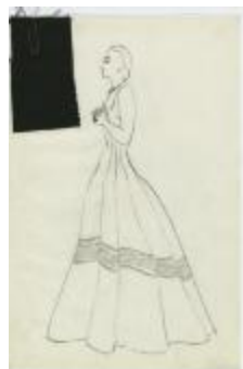
Floor-Length Evening Dress with Full Skirt and Stripes (KA0067_000302)