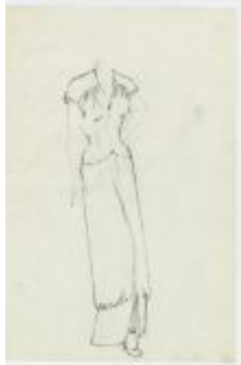
Floor-Length Dress with Shirred Yoke (KA0067_000342)