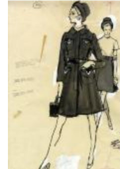
Two Women in Casual Ensembles and Capulet Hats (KA002201_OSxx3_f10_03)