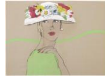
Lime Green Dress and White Mushroom Hat with Multicolor Flowers (KA002201_OSxxx1_f11_02)