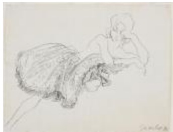
Voluminous Circle Skirt with Lace Border and Petticoat (KA008601_OSxx2_f06_01)