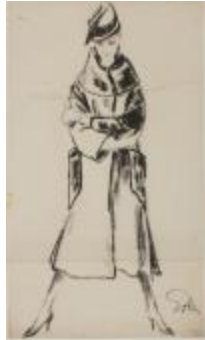
Women's Coat with Oversized Pockets and Standing Collar (KA008601_MCB1_f06_01)