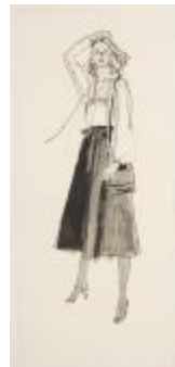
Women's Ensemble Featuring Peasant Blouse and Midi-Length Skirt (KA002201_OSxxx1_f04_13)