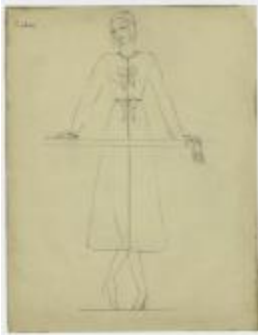
Long-Sleeved Dress with Bows (KA0067_000025)