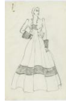
Women's Evening Ensemble with Wide Stripes and Sleeve Cuffs (KA0067_000292)