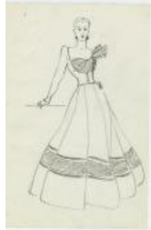
Evening Dress with Buttoned Waist and Oversized Bow (KA0067_000294)