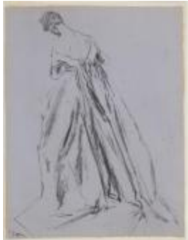
Voluminous Long-Sleeved Evening Dress with Scooped Back Neckline (KA008601_OSxxx1_f06_03)