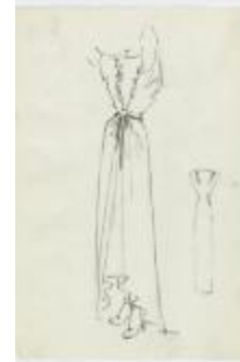
Evening Dress with Draped Skirt and Embellished Bodice (KA0067_000284)