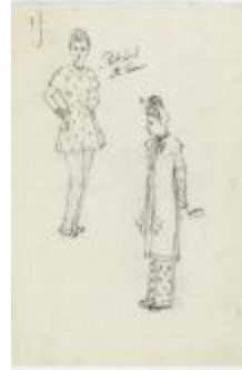
Printed Tunic Ensembles or Pajamas (KA0067_000348)