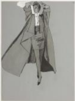
Women's Ensemble Featuring Duster Jacket and Pencil Skirt (KA002201_OSxxx1_f04_04)