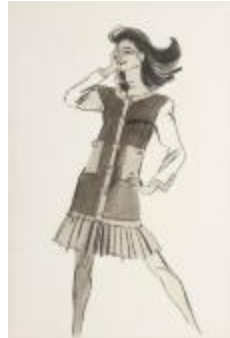
Long Color-Blocked Cardigan with Pleated Skirt (KA002201_OSxxx1_f04_06)