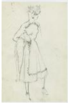
Long-Sleeved Dress with Zigzag Trim (KA0067_000277)