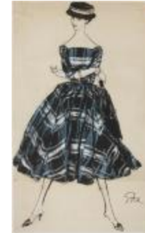
Blue, Black, and White Plaid Dress with Full Skirt (KA008601_MCB2_f05_01)