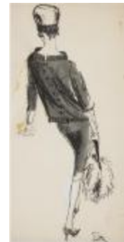
Women's Ensemble with Pencil Skirt and Buttoned Top (KA008601_MCB4_f01_04)