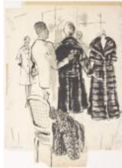
Saks Fifth Avenue Sales Associate and Two Women in Fur Coats (KA002201_OSxxx1_f10_03)