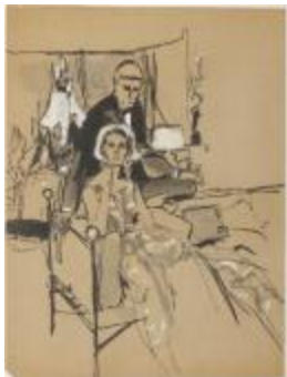
Man and Woman in Evening Wear (KA002201_OSxxx1_f03_08)