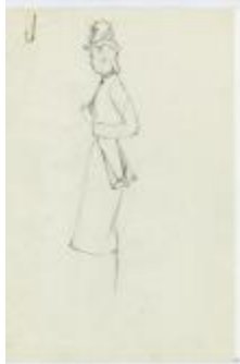
Skirt and Cutaway Jacket with Folded Tails (KA0067_000269)