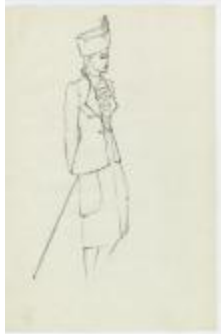
Women's Ensemble with Ruffled Collar (KA0067_000264)