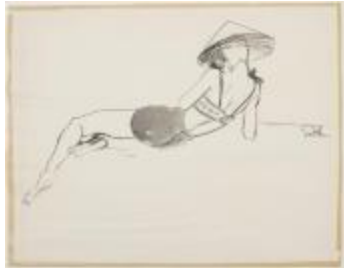
Women's Two-Piece Bathing Suit with "Coolie" Hat (KA008601_MCB2_f01_01)