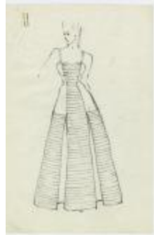
Evening Dress with Full Skirt and Striped Panels (KA0067_000359)