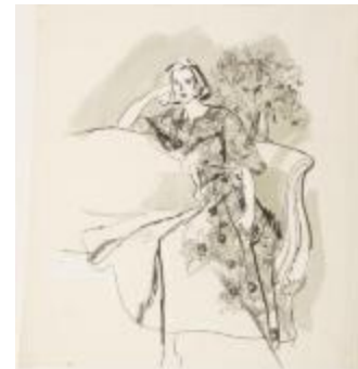
Woman Lounging in Floral Printed Dress with Puff Sleeves (KA002201_OSxxx1_f04_02)