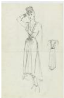
Long-Sleeved Dress with Leaf Pattern (KA0067_000326)