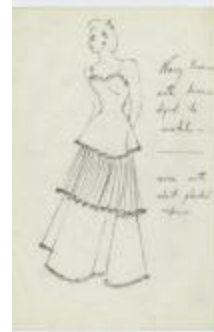
Navy Linen Evening Dress with Pleated Skirt Tier (KA0067_000250)