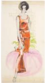
Orange Women's Ensemble Featuring Bellbottom Pants (KA002201_OSxxx1_f11_04)