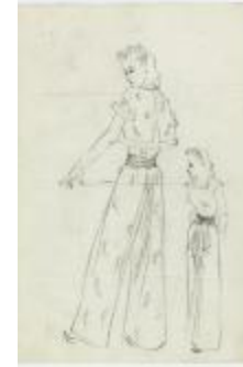
Printed Pajamas with Short-Sleeved Bolero Top (KA0067_000349)