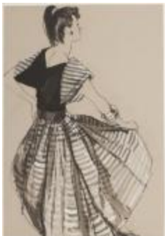
Striped Dress with Full Skirt (KA002201_OSxxx1_f04_11)