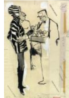
Women's Ensemble Featuring Knee-High Boots and Zebra Striped Coat with Hood (KA002201_OSxx3_f10_05)