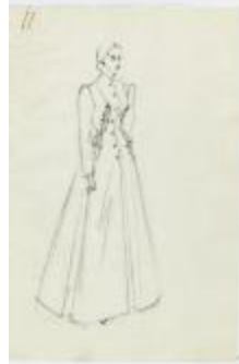
Women's Evening Coat with Decorative Trim (KA0067_000315)