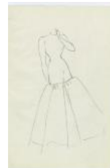
Long-Sleeved Evening Dress with Flounced Skirt (KA0067_000329)