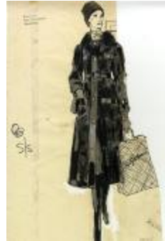
Woman in Long Coat with Saks Fifth Avenue Shopping Bag (KA002201_OSxx3_f10_04)