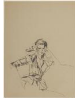
Woman with Long Hair Wearing Fitted Jacket with Oversized Ruffle Collar and Peplum Waist