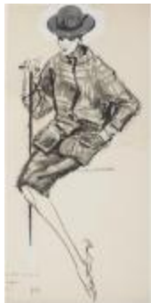
Plaid Women's Ensemble with a Pencil Skirt, Boxy Coat, and Ribbed Turtleneck (KA008601_MCB4_f01_02)