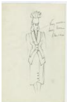
Women's Ensemble with Lace Blouse and Cutaway Coat (KA0067_000260)