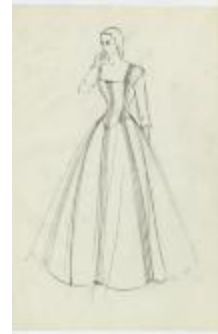
Evening Dress with Full Skirt and Rows of Pleats or Tucks (KA0067_000332)