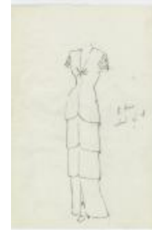
Tiered Evening Dress with Short Embellished Sleeves (KA0067_000345)