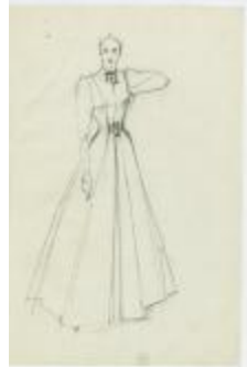
Evening Coat with Full Skirt (KA0067_000282)