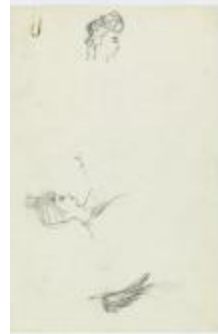
Toque and Floral Hats (KA0067_000267)