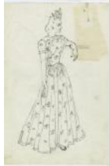
Short-Sleeved Printed Dress with Surplice Bodice (KA0067_000355)