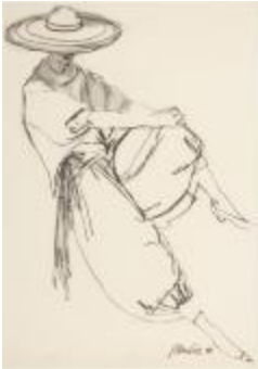
Women's Ensemble Featuring Balloon Pants, Cartwheel Hat, and Top with Funnel Neckline (KA002201_OSxxx1_f01_02)