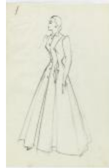
Women's Evening Coat with Full Skirt and Decorative Trim (KA0067_000316)