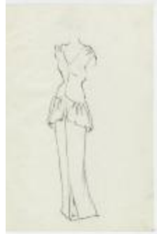
Evening Dress with Floor-Length Peplum Skirt (KA0067_000343)