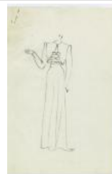
Women's Evening Ensemble with Bolero Jacket and Bows (KA0067_000313)