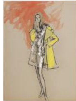
High-Waisted Sequined Sheath Dress with Yellow Swing Coat (KA002201_OSxxx1_f11_01)