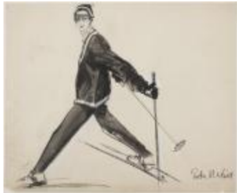
Women's Ski Ensemble with V-Necked Poplin Parka (KA008601_MCB3_f06_02)