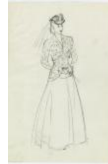
Women's Evening Ensemble with Lace Bolero Jacket (KA0067_000337)