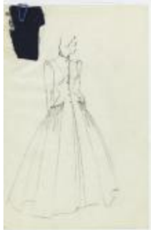
Women's Evening Coat with Full Skirt and Pleated Pockets (KA0067_000314)