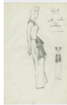
Printed Evening Dress with Wide Ribbon (KA0067_000242)