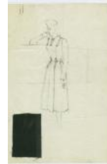
Long-Sleeved Dress with Decorative Bands (KA0067_000361)