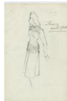
Long-Sleeved Dress with Shirred Yoke and Skirt Panel (KA0067_000276)