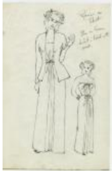
Ensemble with Pajama Pants or Long Skirt (KA0067_000354)