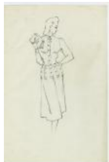
Long-Sleeved Dress with Multiple Plackets (KA0067_000274)