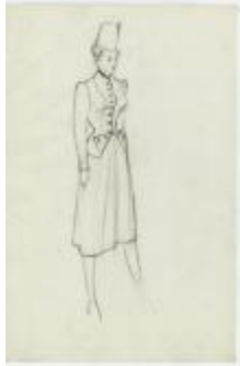
Women's Ensemble with Collarless Jacket and High Cossack Hat (KA0067_000256)