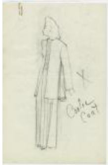
Floor-Length Pleated Dress with "Coolie" Coat (KA0067_000358)