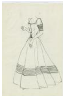
Evening Dress with Full Skirt and Short Sleeves (KA0067_000298)