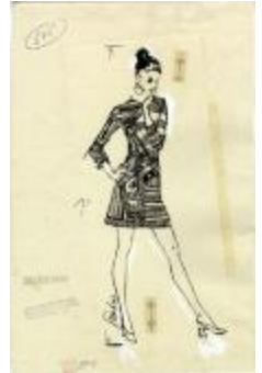
Wrap Dress with All-Over Geometric Print (KA002201_OSxx3_f10_06)