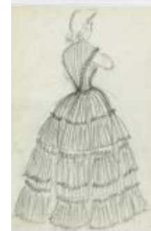
Striped Evening Dress with Very Full Skirt (KA0067_000251)