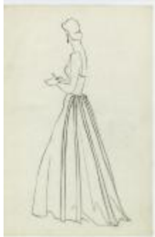
Floor-Length Evening Dress with Long Fins (KA0067_000252)