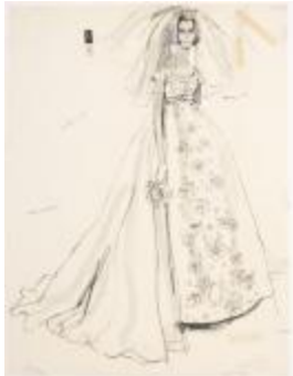
Floral Printed Bridal Gown with Empire Waistline and Flyaway Veil (KA002201_OSxxx1_f10_02)