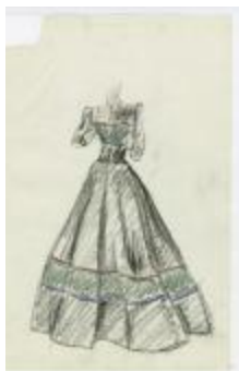
Black Evening Dress with Red, Green, and Blue Stripes (KA0067_000301)