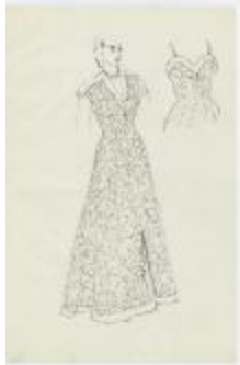
Short-Sleeved Lace Evening Dress (KA0067_000334)