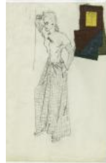
Women's Ensemble with Wide-Legged Checked Pants (KA0067_000356)