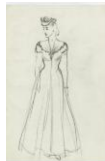
Long-Sleeved Evening Dress with Yoke (KA0067_000340)