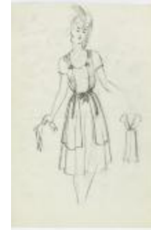
Short-Sleeved Dress with Draped Panels (KA0067_000325)