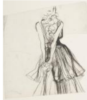
Sleeveless Pleated Dress with Long Tiered Skirt (KA002201_OSxxx1_f01_03)