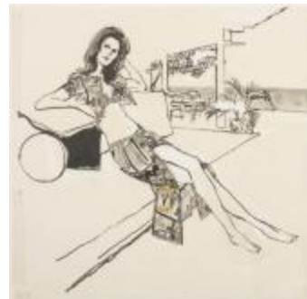
Women's Printed Ensemble with Wrap Skirt, Bikini Top, and Bolero Jacket (KA002201_OSxxx1_f04_08)