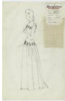
Sleeveless Evening Dress with Separated Torso (KA0067_000244)