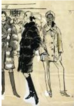
Three Women in Various Fur Coats (KA002201_OSxx3_f10_01)