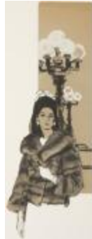
Waist-Length Fur Jacket with Wide Collar (KA002201_OSxxx1_f03_01)