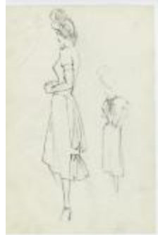
Short-Sleeved Dress with Tucked Panels (KA0067_000278)