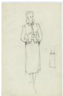
Long-Sleeved Dress with Small Buttons and Hidden Pockets (KA0067_000273)