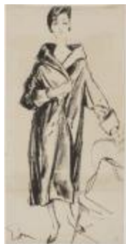
Women's Wrap Coat with Shawl Collar (KA008601_MCB1_f06_02)