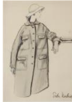
Oversized Women's Coat with Large Square Flap Pockets (KA008601_MCB3_f04_05)