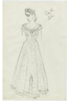
Double Net Evening Dress with Wide Neckline (KA0067_000335)