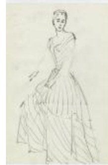
Striped Evening Dress with Full Skirt and Wide Neckline (KA0067_000320)