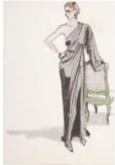
One-Sleeved Evening Dress with High Skirt Slit (KA002201_OSxxx1_f07_11)