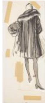
Fur Swing Coat with Oversized Collar (KA002201_OSxxx1_f12_01)