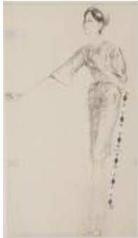
Knee-Length Fitted Dress with Bell Sleeves (KA008601_MCB2_f04_02)