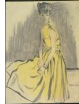
Sleeveless Yellow Dress with Small Bows (KA0038_000047)