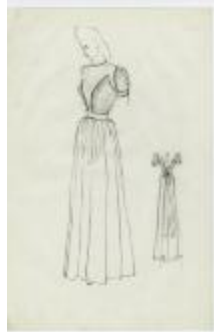
Evening Dress with Shirred Bodice and Sleeves (KA0067_000248)