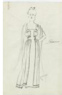
Floor-Length Dress with Wide Shawl (KA0067_000352)