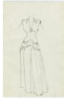
Floor-Length Dress with Shirred Skirt and Plunging V-Neckline (KA0067_000283)