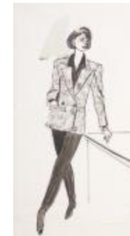
Women's Floral Printed Blazer and Stirrup Pants (KA002201_OSxxx1_f06_05)