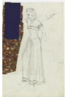
Floor-Length Dress with Cropped Jacket (KA0067_000351)