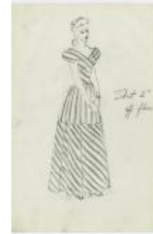
Striped Evening Dress with Short Puffed Sleeves (KA0067_000247)