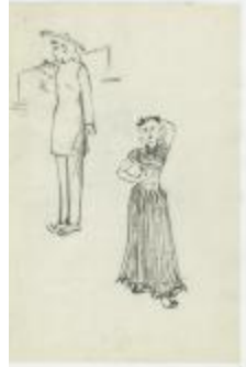
Asian and Polynesian Inspired Ensembles (KA0067_000347)