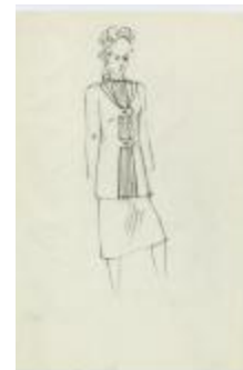
Women's Ensemble with Pleated Gilet and Flap Closures (KA0067_000263)