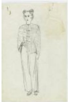
Women's Lounge Ensemble with Checked Jacket (KA0067_000350)