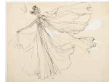
Flowing Evening Dress with Wrapped Bodice (KA002201_OSxxx1_f04_09)