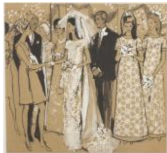
Wedding Party and Guests Featuring Bride in Patterned Dress with Wattleau Train (KA002201_OSxxx1_f03_09)