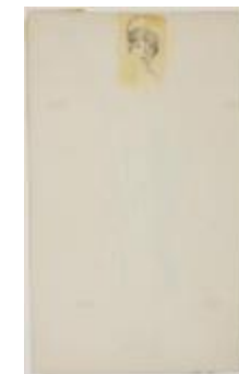
Woman's Head with Pillbox Hat (KA008601_MCB2_f04_01v)