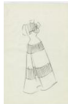
Evening Dress with Pleated, Striped, or Shirred Panels (KA0067_000328)