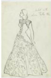
Sleeveless Evening Dress with Full Lace Skirt (KA0067_000318)