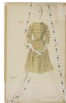
Yellow Plaid Ensemble with Pleated Skirt and Double-Breasted Jacket (KA008601_MCB2_f04_01)