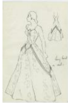
Lace Evening Dress with Heavy Braid or Cord (KA0067_000319)