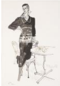
Women's Ensemble Featuring Collared Top and Narrow Skirt with Horse Race Motifs (KA002201_OSxxx1_f07_10)