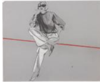
Women's Ensemble Featuring Pullover and Pants (KA002201_OSxxx1_f09_02)