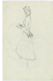
Skirt and Jacket with Folded Tails (KA0067_000258)