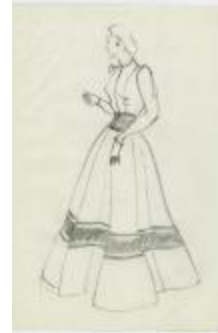
Long-Sleeved Evening Dress with Contrasting Stripe and Waistband (KA0067_000295)