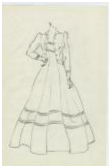
Women's Evening Ensemble with Full Skirt and Decorative Bands (KA0067_000297)