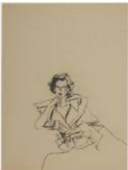
Woman with Short Hair Wearing Fitted Jacket with Oversized Ruffle Collar and Peplum Waist