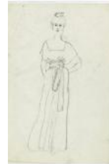
Floor-Length Dress with Obi Belt and Short Kimono Sleeves (KA0067_000353)