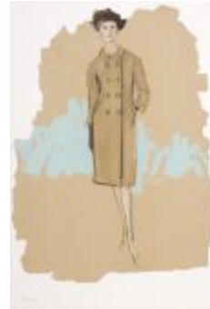
Brown Double-Breasted Herringbone Coat and Mushroom Hat (KA002201_kOSxxx7_f01_01)