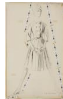
Women's Ensemble with Pleated Skirt and Double-Breasted Jacket (KA008601_MCB2_f04_01overlay)