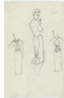
Long-Sleeved Dress with Tucked Panels (KA0067_000255)