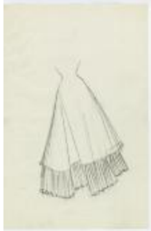
Skirt with Layer of Pleating (KA0067_000330)