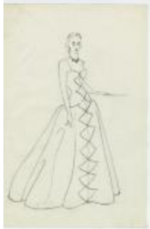
Evening Dress with Diamond Shaped Pattern (KA0067_000289)