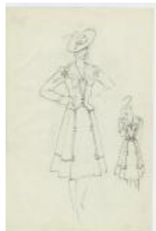
Women's Suit with Wide Ruffled Collar (KA0067_000286)