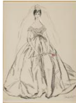
Wedding Dress with Voluminous Skirt and Lace Top (KA008601_MCB2_f02_02)