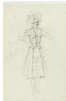
Women's Suit with Wide Pointed Collar (KA0067_000287)