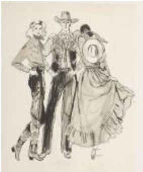
Man and Two Women Wearing Cowboy Inspired Ensembles (KA002201_OSxxx1_f04_05)