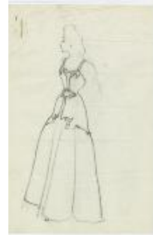
Evening Dress with Decorative Trim (KA0067_000360)