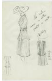
Striped Women's Suit with Topstitching (KA0067_000245)