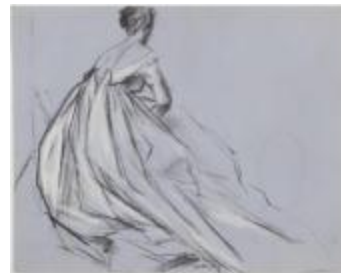
Voluminous Evening Dress with Scooped Back Neckline (KA008601_OSxxx1_f06_01)