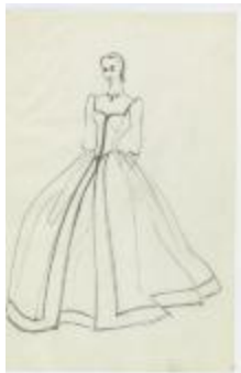
Evening Dress with Buttoned Bodice and Opened Skirt (KA0067_000305)