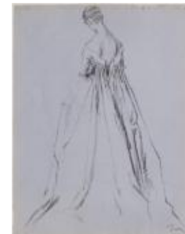
Long-Sleeved Voluminous Evening Dress (KA008601_OSxxx1_f06_02)