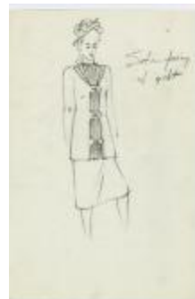
Women's Ensemble with Pleated Gilet (KA0067_000262)