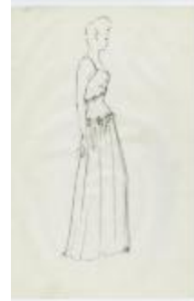
Evening Dress with Separated Torso (KA0067_000246)