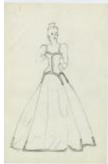
Evening Dress with Full Skirt and Decorative Trim (KA0067_000290)