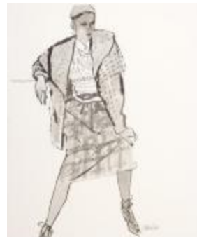
Women's Ensemble with Coat, Sweater Vest, and Plaid Skirt (KA002201_OSxxx1_f05_04)