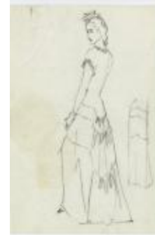
Short-Sleeved Evening Dress with Tiered Skirt (KA0067_000280)