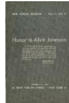
New School Bulletin Vol. VII, No. 17 (NS030102_bull0717)