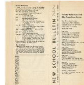
New School Bulletin Vol. IX, No. 21 (NS030102_bull0921)