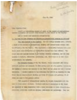
Letter to Benjamin Fine on International Studies at the New School (NS030105_000660_pg73-77)