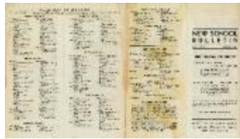
New School Bulletin Vol. IV, No. 24 (NS030102_bull0424)