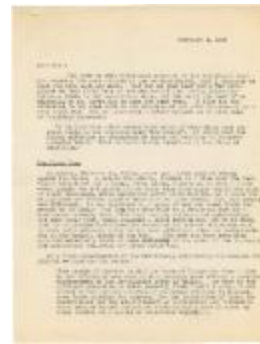
Letter to Benjamin Fine on Adult Education at the New School (NS030105_000658_pg52-55)