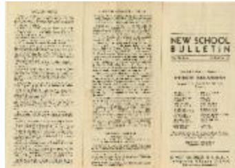
New School Bulletin Vol. VIII, No. 21 (NS030102_bull0821)