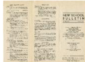
New School Bulletin Vol. VIII, No. 29 (NS030102_bull0829)