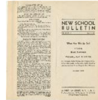
New School Bulletin Vol. VIII, No. 33 (NS030102_bull0833)