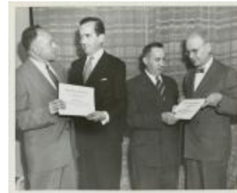
Presentation of Louis S. Weiss Memorial Award (NS040101_000159)