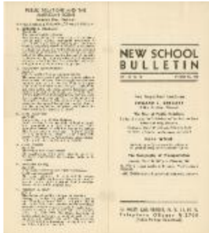
New School Bulletin Vol. VII, No. 30 (NS030102_bull0730)