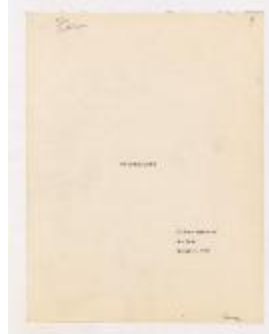
On Correlations (PC010401_000018)