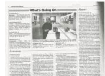
Page from The New School Observer (PC010401_000008)