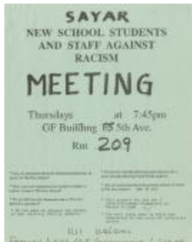
New School Students and Staff Against Racism: MEETING (PC010401_000006)