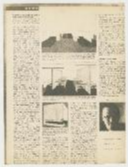
Four Parsons Students Tackle Women's Prison Design (PC010401_000019)