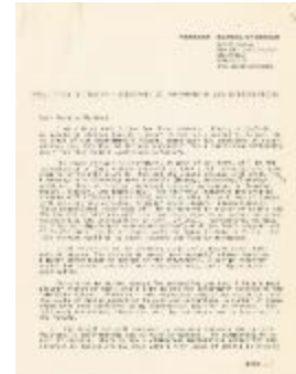
Open Letter to Faculty--Department of Environmental and Interior Design (PC010401_000015)