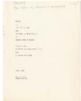
Report to the Executive Dean and Environmental Design Faculty of Parsons Concerning Department of Environmental