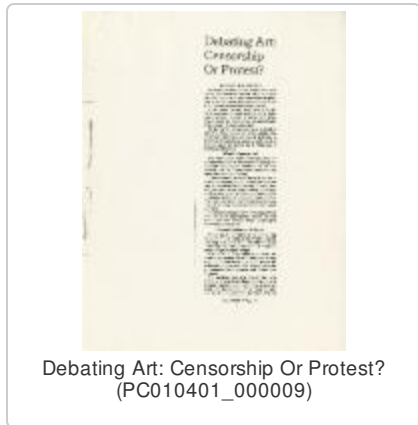
Debating Art: Censorship Or Protest? (PC010401_000009)