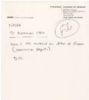
Altos de Chavon (PC010401_000020)