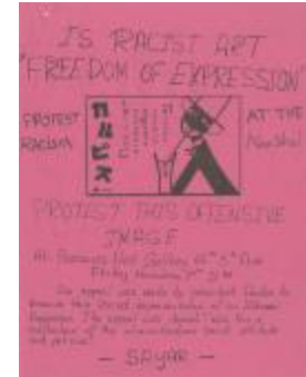
Is Racist Art "Freedom of Expression": Protest Racism at The New School (PC010401_000005)