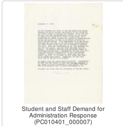
Student and Staff Demand for Administration Response (PC010401_000007)