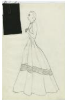
Floor-Length Evening Dress with Full Skirt and Stripes (KA0067_000302)