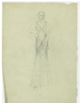
Lace Evening Dress with Petal Peplum (KA0067_000032)