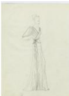
Draped Evening Dress with Twisted Rope (KA0067_000181)