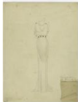
Floor-Length Evening Dress with Draped Bodice (KA0067_000097)