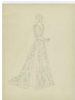
Medieval Inspired Dress with Juliet Cap and Paneled Sleeves (KA0067_000226)