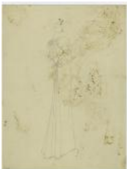
Floor-Length Evening Dress with Open Back (KA0067_000107)