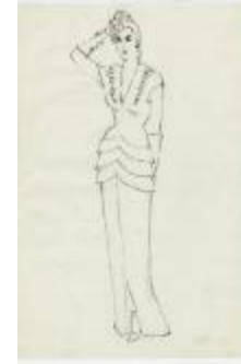
Evening Dress with Tiered Tunic and Embellished Bodice (KA0067_000344)