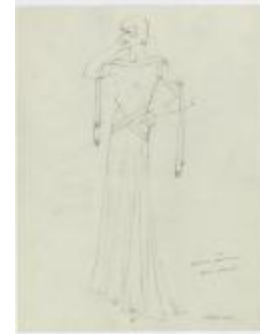
Green Satin Evening Dress with Sea Shells (KA0067_000014)