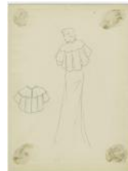
Capelet with Scalloped Yoke and Inverted Pleats (KA0067_000086)