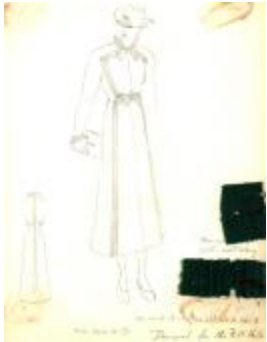
Thin Wool Street Coat with Inset Tucking (KA0067_b03_f08_07)