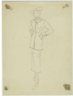
Women's Ensemble with Tunic Jacket and Ascot Scarf (KA0067_000088)