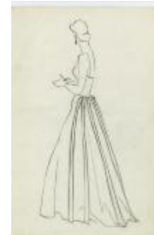
Floor-Length Evening Dress with Long Fins (KA0067_000252)