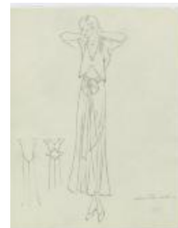
Calf-Length Evening Dress with Separate Collar and Sash Belt (KA0067_000022)