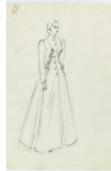
Women's Evening Coat with Decorative Trim (KA0067_000315)