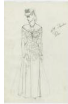
Long-Sleeved Evening Dress with Lace (KA0067_000339)