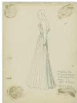
Strapless Evening Dress with Shaped Tucks (KA0067_000084)