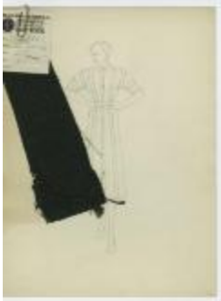
Shirtdress with Inverted Pleats (KA0067_000171)