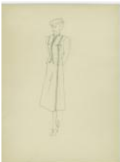
Women's Suit with Vertical Bands of Striped or Ribbed Fabric (KA0067_000131)