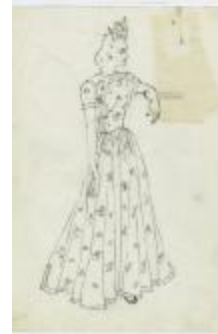
Short-Sleeved Printed Dress with Surplice Bodice (KA0067_000355)