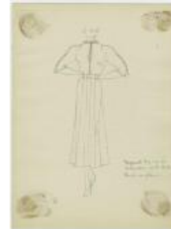
Calf-Length Coat with Small Dome Buttons (KA0067_000082)