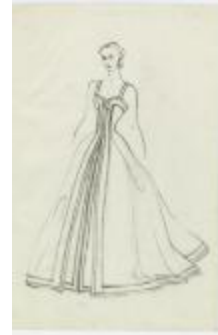
Evening Dress with Narrow Trim and Layered Skirt (KA0067_000307)