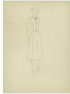
Women's Suit with Small Collar and Arrow Details (KA0067_000141)