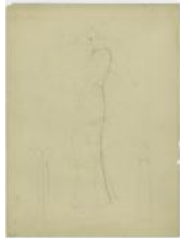
Long-Sleeved Bridal Gown with Cowl Neckline (KA0067_000112)