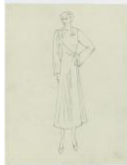
Calf-Length Wrap Coat or Dress (KA0067_000017)