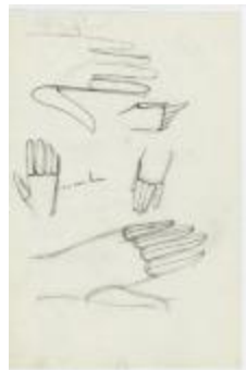
Assortment of Women's Gloves with Seamed Fingers (KA0067_000002)