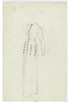
Long-Sleeved Dress with Rows of Unknown Embellishments (KA0067_000266)