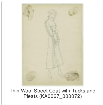
Thin Wool Street Coat with Tucks and Pleats (KA0067_000072)