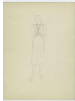
Long-Sleeved Dress with Gathered Bodice and Narrow Trim (KA0067_000219)