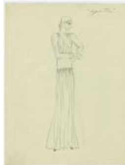
Sleeveless Evening Dress with Shirred Drop-Waist Skirt (KA0067_000030)