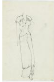
Floor-Length Dress with Shirred Yoke (KA0067_000342)