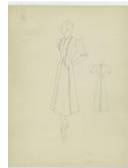
Calf-Length Shirtdress with Narrow Trim (KA0067_000122)