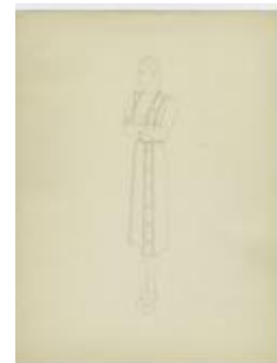
Long-Sleeved Dress with Ribbed Bands and Dots (KA0067_000215)