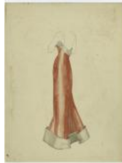
Red Evening Dress with Grey Border (KA0067_000041)