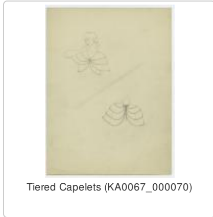
Tiered Capelets (KA0067_000070)