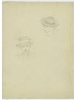
Small Brimmed Hats with Ribbons and Braids (KA0067_000172)