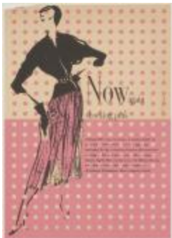
"Now Again: Shocking Pink" (KA008601_OSx1_f13_07)