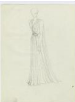
Pleated Evening Dress with Leaf Embellishment (KA0067_000179)