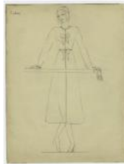
Long-Sleeved Dress with Bows (KA0067_000025)