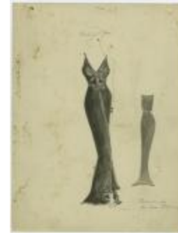
Black Evening Dress with Bow Ties (KA0067_000046)