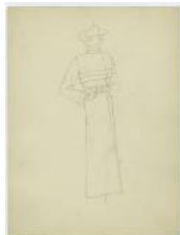
Ankle-Length Wrap Coat with Tiered Bodice (KA0067_000060)