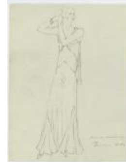
Floor-Length Evening Dress with Hanging Panels (KA0067_000018)