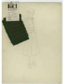
Women's Suit with Small Buttons and Arrow Accents (KA0067_000168)