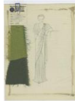
Pleated Evening Dress with Toga Wrap (KA0067_000240)