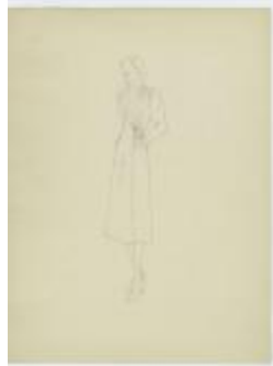
Long-Sleeved Dress with Embellished Waistline (KA0067_000218)