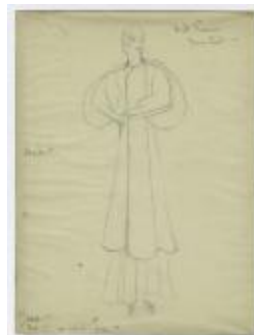
Evening Coat with Batwing Sleeves (KA0067_000034)