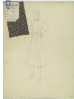
Princess Style Coat with Pleated Front (KA0067_000161)