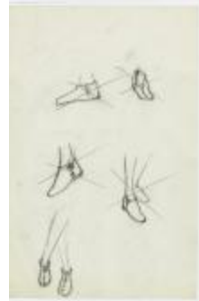
Assortment of Laced Women's Shoes (KA0067_000037)