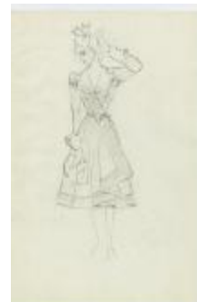
Long-Sleeved Wrap Dress with Wide Ruffled Collar (KA0067_000323)