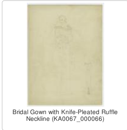
Bridal Gown with Knife-Pleated Ruffle Neckline (KA0067_000066)