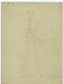
Buttoned Housecoat with Wide Belt (KA0067_000119)