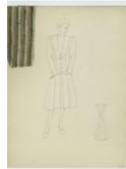
Flared Coat or Dress with Panels (KA0067_000170)