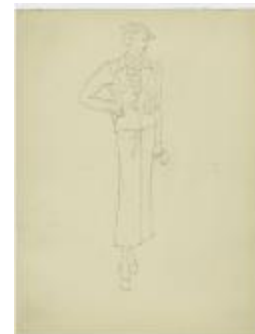
Women's Suit with Ruffle Jabot Collar (KA0067_000062)