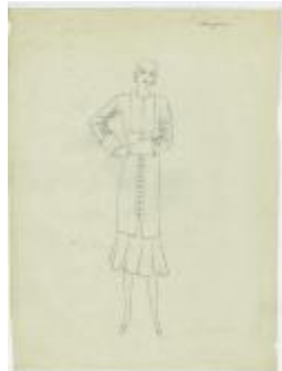
Women's Ensemble with Stitched Accents (KA0067_000024)