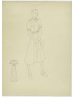
Short-Sleeved Dress with Bow Collar and Decorative Bands (KA0067_000136)