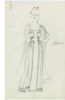
Floor-Length Dress with Wide Shawl (KA0067_000352)