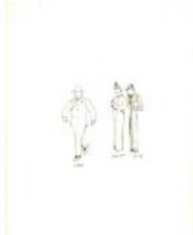
Human Figures for the 1939 World's Fair Futurama Exhibit (KA0067_b02_f13_03)