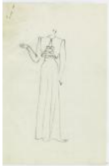
Women's Evening Ensemble with Bolero Jacket and Bows (KA0067_000313)