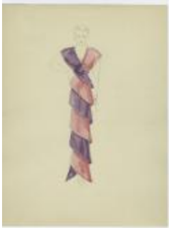
Purple and Pink Evening Dress with Twisted Tiers (KA0067_000204)