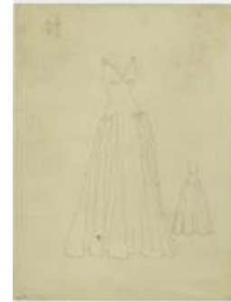
Evening Dress with Full Skirt and Plunging Neckline (KA0067_000118)