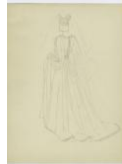
Medieval Inspired Dress with Patterned Trim and Heart Shaped Hennin (KA0067_000224)