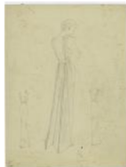
Evening Dress with Open Back and Inverted Pleats (KA0067_000109)