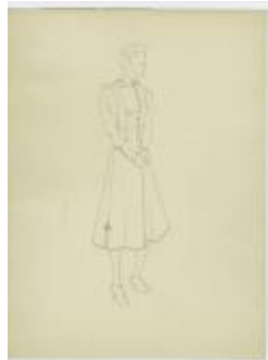
Calf-Length Princess Coat with Frogging (KA0067_000144)