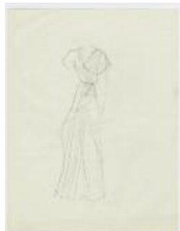
Floor-Length Wrap Dress with Short Kimono Sleeves (KA0067_000192)