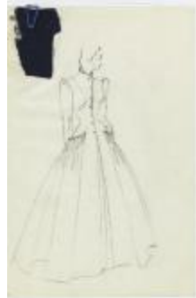
Women's Evening Coat with Full Skirt and Pleated Pockets (KA0067_000314)