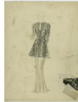
Women's Evening Ensemble with Lace Tunic Jacket (KA0067_000094)