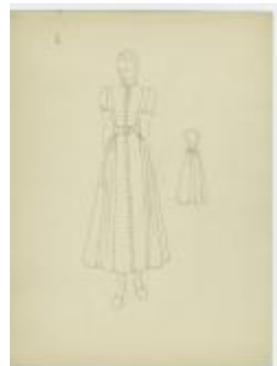
Short-Sleeved Dress with Small Buttons (KA0067_000120)