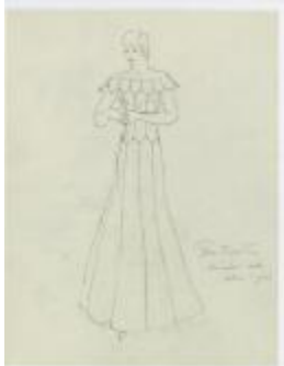
Paneled Evening Dress with Off-the-Shoulder Collar (KA0067_000015)