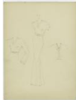
Floor-Length Dress with Bow Collar in Back (KA0067_000057)