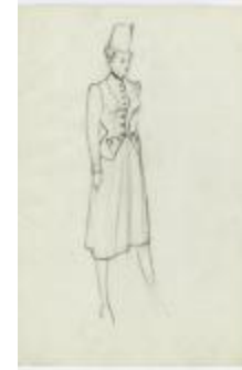
Women's Ensemble with Collarless Jacket and High Cossack Hat (KA0067_000256)