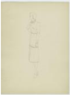
Long-Sleeved Dress with Scalloped Edges and Diamond Shaped Trim (KA0067_000216)