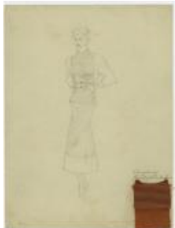
Women's Ensemble of Ribbed Fabric (KA0067_000096)