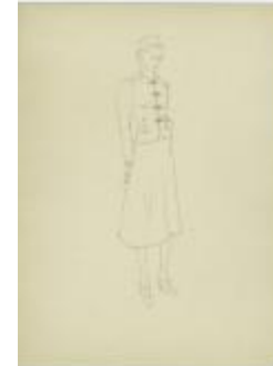
Women's Suit with Flap Closures (KA0067_000130)