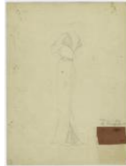
Long-Sleeved Dress with Open Back (KA0067_000053)