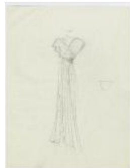
Pleated Wrap Dress with Short Kimono Sleeves (KA0067_000193)