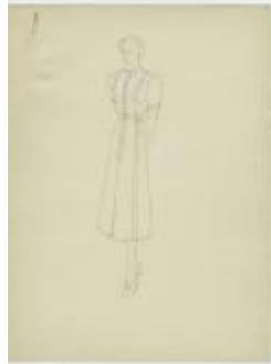
Short-Sleeved Shirtdress with Tucks and Inverted Pleats (KA0067_000152)