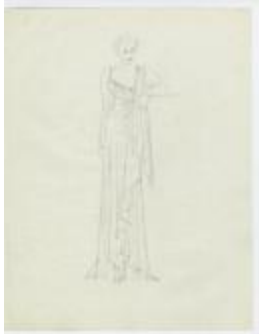
Himation Style Evening Dress (KA0067_000183)