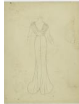
Floor-Length Evening Dress with Flared Skirt (KA0067_000054)