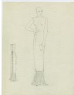
Evening Dress with Tunic and Pleated Skirt (KA0067_000016)