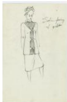
Women's Ensemble with Pleated Gilet (KA0067_000262)