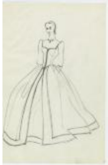
Evening Dress with Buttoned Bodice and Opened Skirt (KA0067_000305)