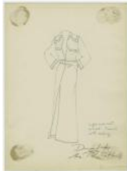
Light Wool Coat with Narrow Trim (KA0067_000076)