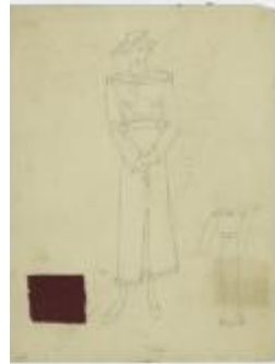
Long-Sleeved Dress with Bands of Tiered Fabric (KA0067_000105)