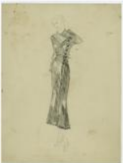
Black Striped Wrap Dress or Coat (KA0067_000047)