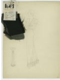
Short-Sleeved Evening Dress with Striped Hem (KA0067_000165)