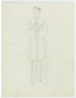
Embellished Coat with Wide Sleeves (KA0067_000187)