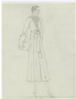
Calf-Length Wrap Coat with Self Belt (KA0067_000007)