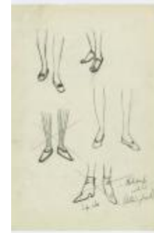
Women's Sandals, Flats, and Waterproof Shoes (KA0067_000035)