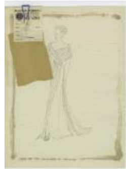
Draped Evening Dress with Leaf Belt (KA0067_000238)