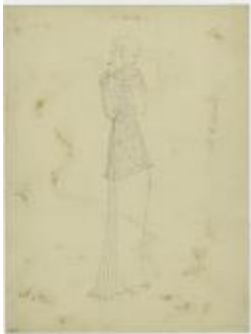
Evening Dress with Lace Tunic (KA0067_000111)