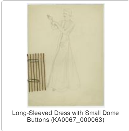
Long-Sleeved Dress with Small Dome Buttons (KA0067_000063)