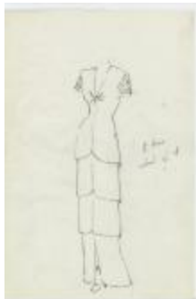
Tiered Evening Dress with Short Embellished Sleeves (KA0067_000345)