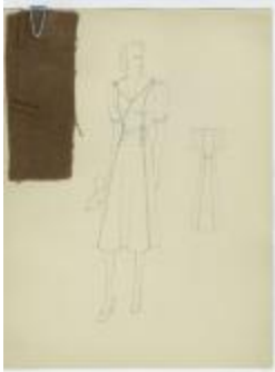
Short-Sleeved Dress with Pointed Collar and Small Buttons (KA0067_000229)