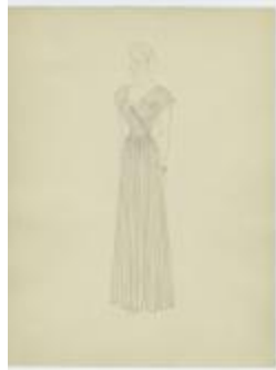
Striped Dress with Surplice Bodice and Kimono Sleeves (KA0067_000205)