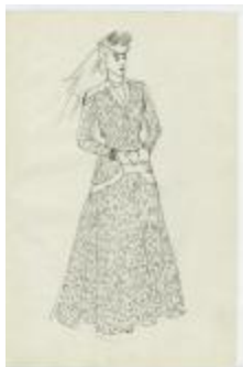
Women's Lace Evening Ensemble with Bolero Jacket (KA0067_000333)