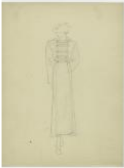
Full-Length Coat with Buttoned Strips (KA0067_000151)