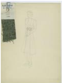
Long-Sleeved Dress with Split Neckline and Embellished Waistband (KA0067_000212)