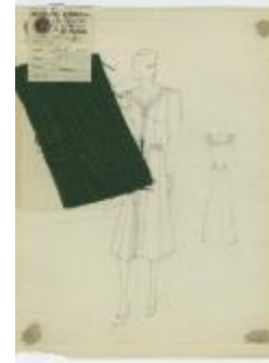
Long-Sleeved Day Dress with Sailor Collar (KA0067_000232)