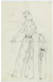
Printed Pajamas with Short-Sleeved Bolero Top (KA0067_000349)