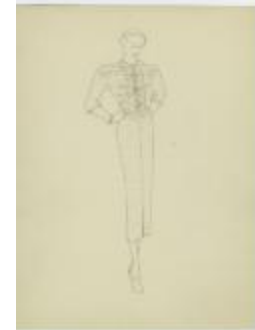
Calf-Length Polka-Dotted Dress with Bows (KA0067_000178)