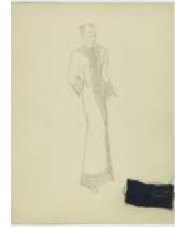
Floor-Length Housecoat with Ribbed Panels (KA0067_000174)