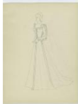
Medieval Inspired Bridal Gown or Costume with Split Sleeves (KA0067_000223)