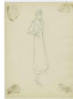
Calf-Length Coat with Shawl Collar (KA0067_000078)