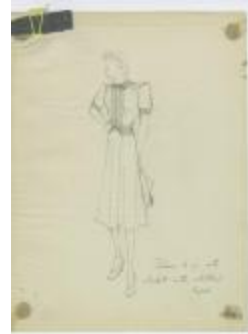
Short-Sleeved Dress with Small Buttons and Striped or Ribbed Bands (KA0067_000235)