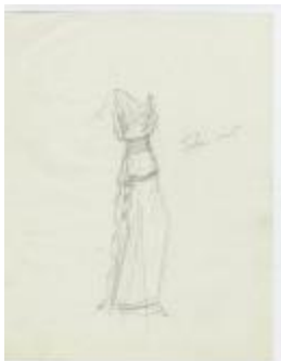
Doric Chiton Style Evening Dress with Girdle (KA0067_000191)