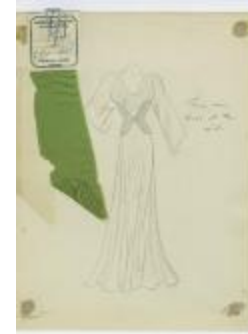
Loose Evening Dress with Tucking (KA0067_000236)