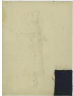
Navy Blue Coat or Dress with Bands of Ribbed Fabric (KA0067_000104)