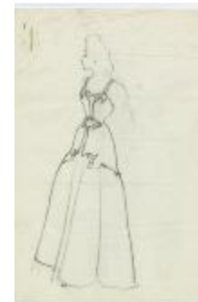
Evening Dress with Decorative Trim (KA0067_000360)