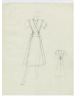
A-Line Jumper with Buttoned Waist (KA0067_000196)