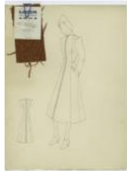
Calf-Length Princess Coat (KA0067_000169)