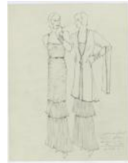
Golden Yellow Chiffon Evening Dress with Metal Cloth Jacket (KA0067_000010)