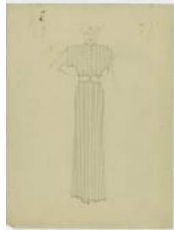
Floor-Length Pleated Dress (KA0067_000089)