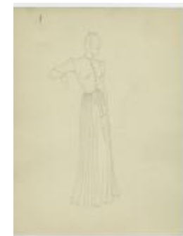
Long-Sleeved Dress with Buttoned Bodice and Gathered Skirt (KA0067_000203)