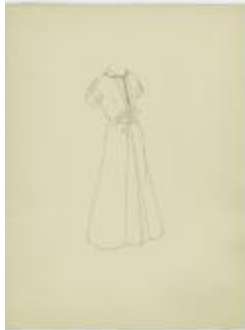
Short-Sleeved Shirtdress with Tied Waist (KA0067_000176)