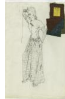
Women's Ensemble with Wide-Legged Checked Pants (KA0067_000356)