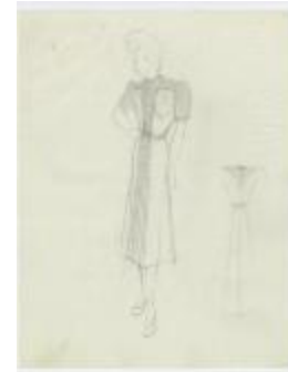
Short-Sleeved Dress with Bands of Tucks and Pleats (KA0067_000198)