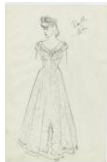
Double Net Evening Dress with Wide Neckline (KA0067_000335)