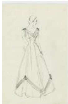
Evening Dress with Small Bows and Bands of Stripes or Tucks (KA0067_000310)