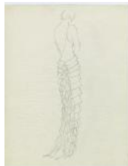
Evening Dress with Tiered and Ruffled Skirt (KA0067_000021)