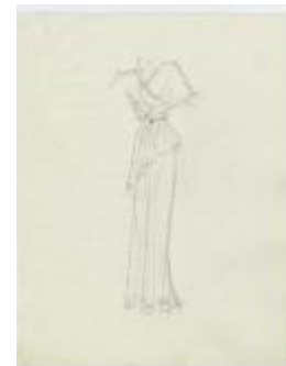
Ionic Chiton Style Evening Dress (KA0067_000194)