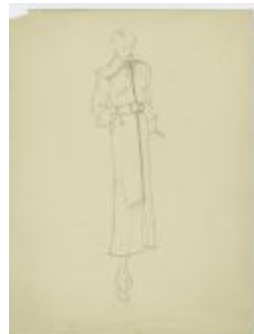
Ankle-Length Coat with Wing Collar and Small Dome Buttons (KA0067_000061)