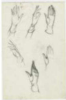
Assortment of Women's Gloves (KA0067_000005)