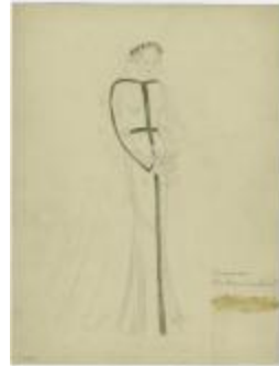
Long-Sleeved Bridal Gown with Green Trim (KA0067_000093)