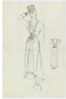
Long-Sleeved Dress with Leaf Pattern (KA0067_000326)