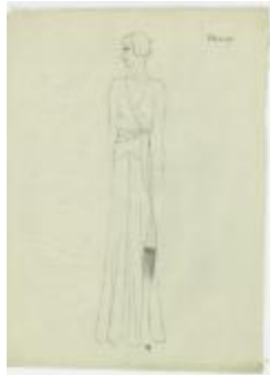
Evening Dress with Fringed Sash Belt (KA0067_000027)