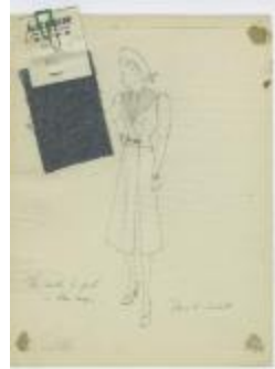
Women's Ensemble with Wide Pointed Collar (KA0067_000234)