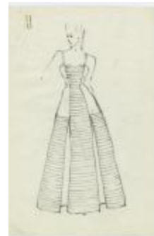
Evening Dress with Full Skirt and Striped Panels (KA0067_000359)