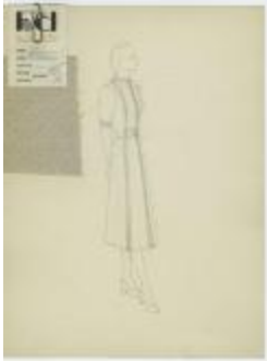
Short-Sleeved Dress with Striped or Ribbed Bands (KA0067_000123)