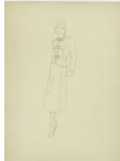
Women's Suit with Narrow Trim and Bound Buttonholes (KA0067_000129)