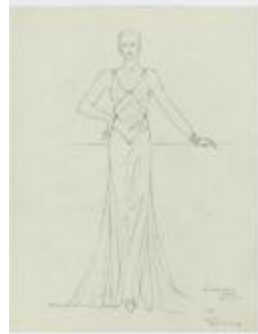
Multicolor Satin Evening Dress with Flared Skirt (KA0067_000013)