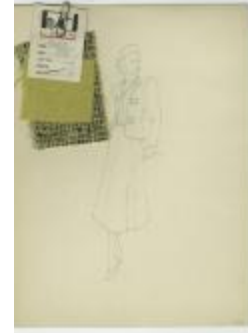
Women's Suit with Small Welt Pockets (KA0067_000166)