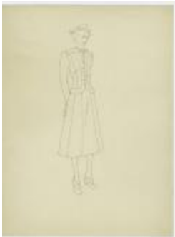
Women's Suit with Gored Skirt and Collarless Jacket (KA0067_000143)