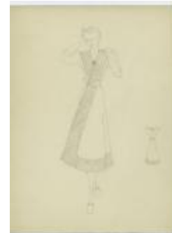
Wrap Dress with Wide Striped Border (KA0067_000146)