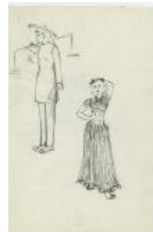
Asian and Polynesian Inspired Ensembles (KA0067_000347)