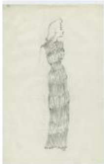
Sleeveless Evening Dress with Shirred and Pleated Panels (KA0067_000249)