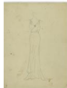
Floor-Length Evening Wrap Dress (KA0067_000110)