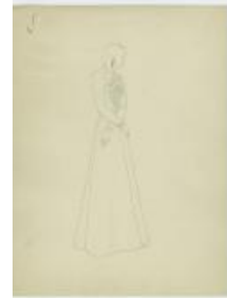
Long-Sleeved Evening Dress or Coat with Embellished Bodice (KA0067_000211)