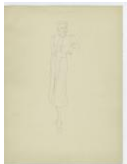
Long-Sleeved Dress with Crossed Bands and Zig Zag Trim (KA0067_000217)