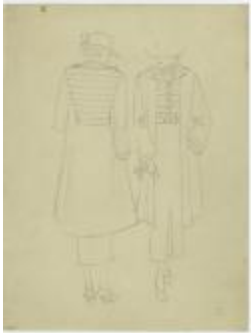
Three-Piece Women's Ensemble with Stripes or Tiers (KA0067_000103)