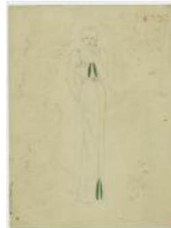
Floor-Length Evening Dress with Green Lining (KA0067_000049)