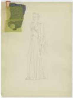
Evening Dress with Long Hanging Sleeves (KA0067_000208)