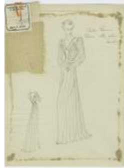
Shirred Crepe Evening Dress with Satin Bands (KA0067_000231)