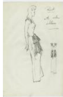
Printed Evening Dress with Wide Ribbon (KA0067_000242)