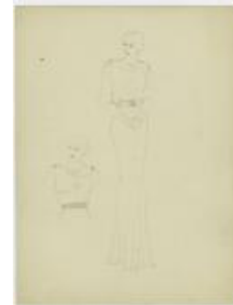
Long-Sleeved Dress with Cowl Neckline and Shoulder Embellishments (KA0067_000058)