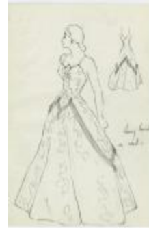
Lace Evening Dress with Heavy Braid or Cord (KA0067_000319)