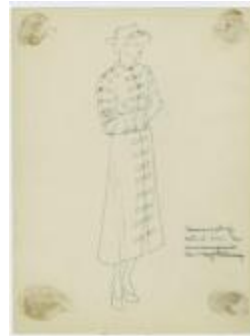
Natural Linen Coat with Strip and Button Embellishments (KA0067_000077)