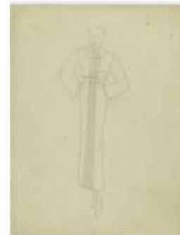
Long-Sleeved Dress with Pleated Panel (KA0067_000050)