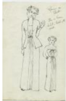
Ensemble with Pajama Pants or Long Skirt (KA0067_000354)