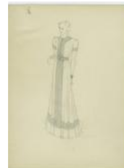
Floor-Length Dress with Short Sleeves and Striped Bands (KA0067_000158)