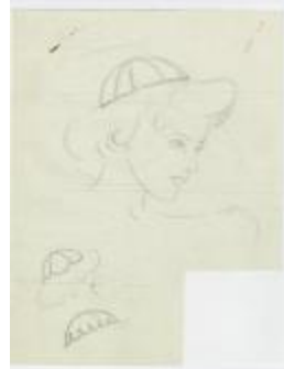
Women's Caps (KA0067_000201)