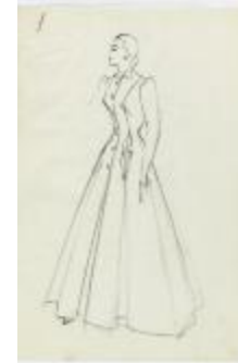
Women's Evening Coat with Full Skirt and Decorative Trim (KA0067_000316)