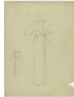
Wrap Coat or Robe with Rabbit Ear Bows (KA0067_000114)