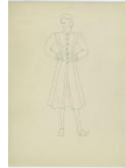
Flared Coat with Diamond Shaped Buttons (KA0067_000126)