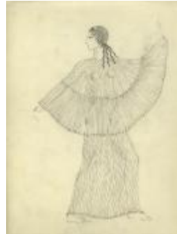
Costume Designs for Adaptation of Lysistrata (KA0067_000362-381)