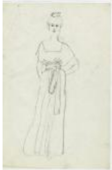
Floor-Length Dress with Obi Belt and Short Kimono Sleeves (KA0067_000353)