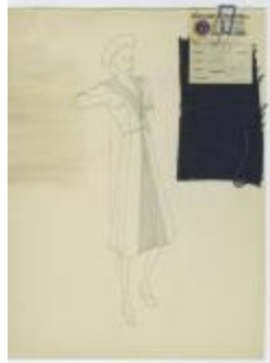
Day Dress with Sailor Collar and Striped or Ribbed Panels (KA0067_000230)