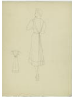
Pleated Dress or Coat (KA0067_000148)