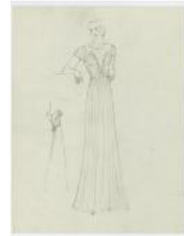
Evening Dress with Shirred Bodice and Short Sleeves (KA0067_000006)