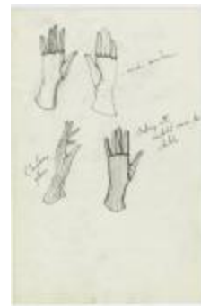
Corduroy Gloves with Crocheted Seams (KA0067_000004)