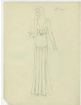
Evening Dress with Belted Waist and Box Pleats (KA0067_000028)