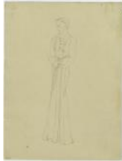
Long-Sleeved Dress or Nightgown (KA0067_000116)