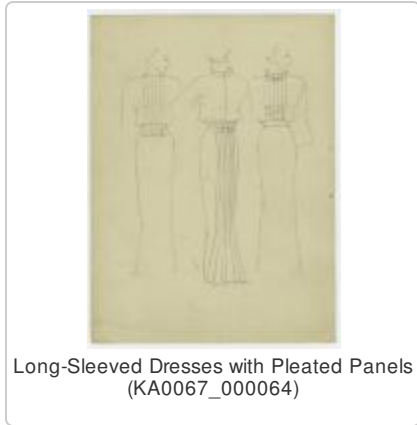
Long-Sleeved Dresses with Pleated Panels (KA0067_000064)