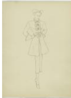
Women's Tunic Ensemble with Polka- Dotted Bows (KA0067_000177)