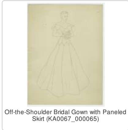
Off-the-Shoulder Bridal Gown with Paneled Skirt (KA0067_000065)