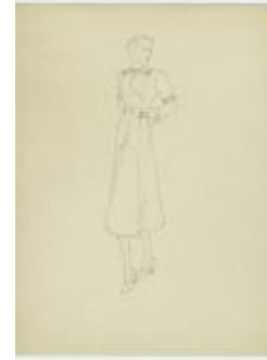
Short-Sleeved Dress with Piping or Narrow Trim (KA0067_000138)