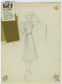
Day Dress with Small Collar and Vine Trim (KA0067_000233)