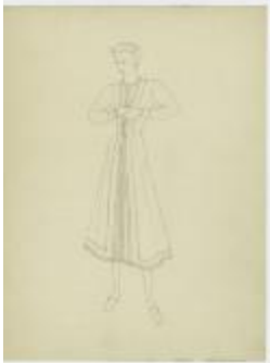
Flared Dress or Coat with Narrow Trim (KA0067_000159)