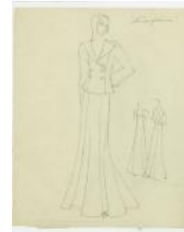
Women's Evening Ensemble with Double-Breasted Jacket (KA0067_000026)