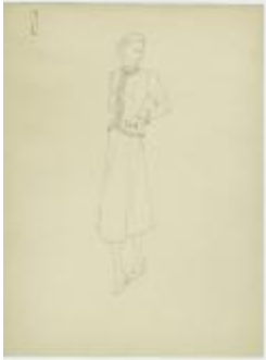
Women's Suit with Collarless Jacket and Calf-Length Skirt (KA0067_000139)