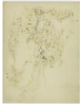
Tunic Top with Standing Collar and Puffed Sleeves (KA0067_000052)