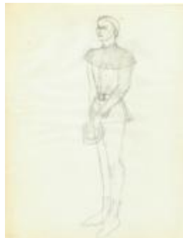
Costume Design for Joan of Arc (KA0067_b02_f08_02)