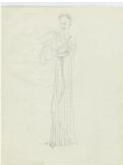
Draped Evening Dress with String or Ropes (KA0067_000180)