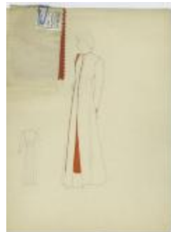
Floor-Length Evening Coat or Housecoat (KA0067_000156)