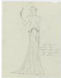
Evening Dress with Flesh Colored Top and Copper Skirt (KA0067_000012)