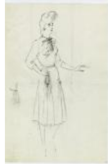
Dress with Drawstring Pockets and Keyhole Neckline (KA0067_000327)