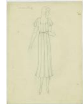
Short-Sleeved Dress with Wide Box Pleats (KA0067_000031)