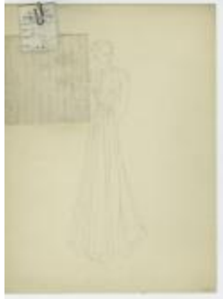
Short-Sleeved Dress with Vertical Seams (KA0067_000163)