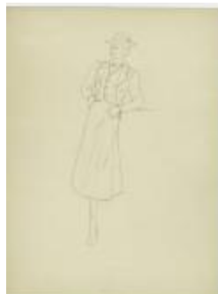
Women's Three-Piece Suit with Narrow Trim (KA0067_000132)