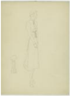
Women's Ensemble with Small Strips and Gathered Skirt (KA0067_000147)