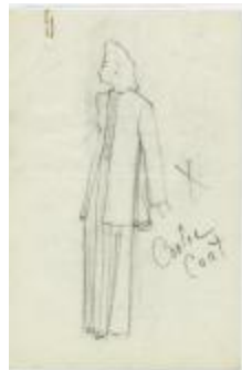
Floor-Length Pleated Dress with "Coolie" Coat (KA0067_000358)