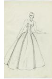
Evening Dress with Full Skirt and Bands of Tucks or Pleats (KA0067_000308)