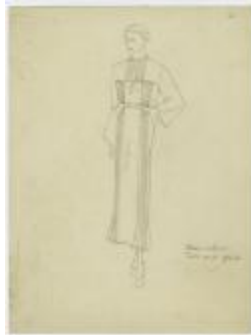
Sheer Coat or Dress with Tucks and Pleats (KA0067_000080)