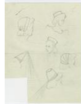
Historical Style Women's Hats (KA0067_000202)