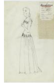
Sleeveless Evening Dress with Separated Torso (KA0067_000244)