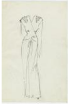
Evening Dress with Wrapped Bodice and Embellished Shoulders (KA0067_000341)