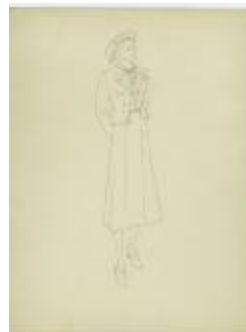
Women's Suit with Double Collar (KA0067_000133)