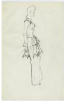
Sleeveless Evening Dress with Wide Ribbon (KA0067_000241)