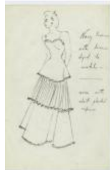
Navy Linen Evening Dress with Pleated Skirt Tier (KA0067_000250)