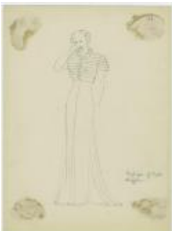
Triple Chiffon Negligée with Tiered Bodice (KA0067_000083)