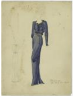
Long-Sleeved Blue Dress with Black Trim (KA0067_000092)