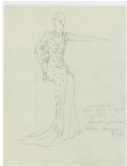
One-Sleeved, Polka-Dotted Evening Dress (KA0067_000008)