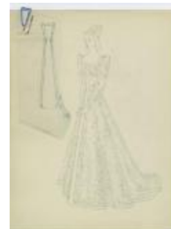
Medieval Inspired Dress of Patterned Fabric with Heart Shaped Hennin (KA0067_000228)