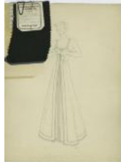
Floor-Length Evening Dress with Narrow Trim and Sweetheart Neckline (KA0067_000210)