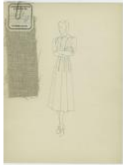
Calf-Length Dress with Pleats and Tucks (KA0067_000124)