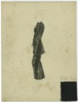
Black Moire Women's Suit with Pleated Panels (KA0067_000091)