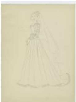
Medieval Inspired Dress with Patterned Sleeves and Torque (KA0067_000225)