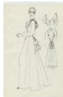
Evening Dress with Wide Ribbon Bows (KA0067_000311)