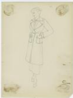
Knee-Length Coat with Notched Collar and Pleated Flap Pockets (KA0067_000079)