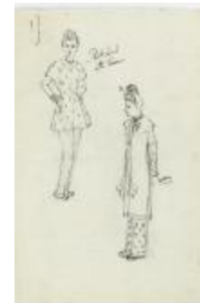
Printed Tunic Ensembles or Pajamas (KA0067_000348)