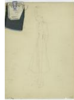
Calf-Length Dress with Stitched Accents (KA0067_000162)