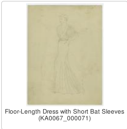
Floor-Length Dress with Short Bat Sleeves (KA0067_000071)