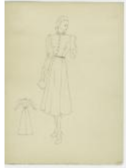
Long-Sleeved Shirtdress with Contrast Collar and Cuffs (KA0067_000164)