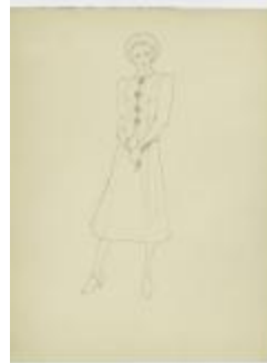
Women's Suit with Buttoned Strips (KA0067_000153)