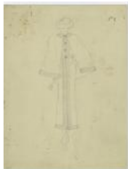
Women's Ensemble with Wrist-Length Cape (KA0067_000108)