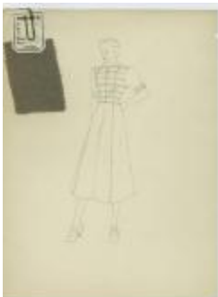
Short-Sleeved Shirtdress with Narrow Trim (KA0067_000155)