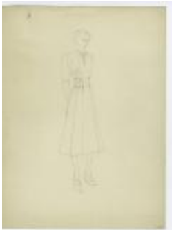
Pleated Dress with Arrow Details (KA0067_000167)