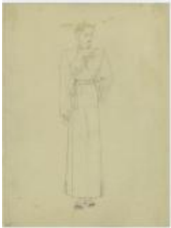
Housecoat or Robe with Sash Belt (KA0067_000115)