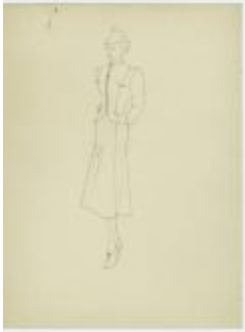
Women's Suit with Collarless Jacket (KA0067_000135)