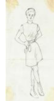
Women's Ensemble with Tights, Tunic, and Leather Pouches (KA0067_b02_f03_02)