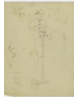
Dress or Short-Sleeved Housecoat with Frog Embellishments (KA0067_000090)