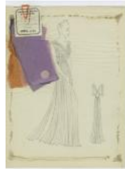
Pleated Evening Dress with Wrapped Bodice (KA0067_000239)