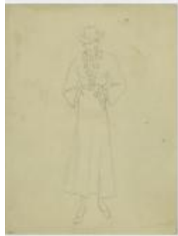
Ankle-Length Wrap Coat with Bell Sleeves (KA0067_000100)