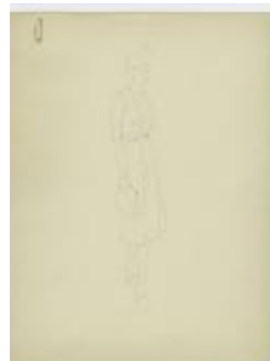
Women's Ensemble with Bolero Jacket (KA0067_000214)