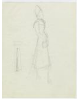
Women's Coat with Notched Sailor Collar (KA0067_000188)