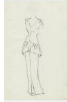
Evening Dress with Floor-Length Peplum Skirt (KA0067_000343)