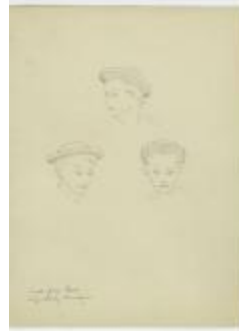
Bumper or Breton Style Hats (KA0067_000173)