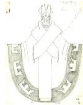
Costume Design for Player King (KA0067_b02_f09_01)