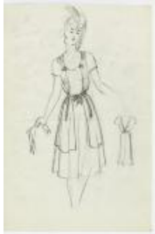
Short-Sleeved Dress with Draped Panels (KA0067_000325)