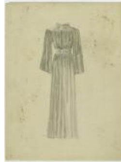
Pleated Grey Coat with Wide Sleeves (KA0067_000045)