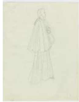
Women's Ensemble with Swing Cape (KA0067_000189)