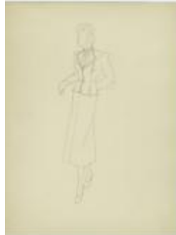
Women's Suit with Narrow Trim and Ascot Scarf (KA0067_000128)