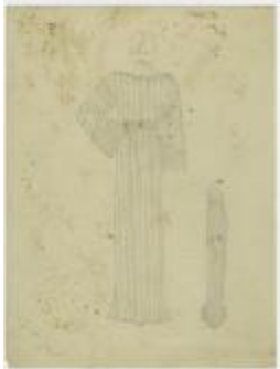
Long-Sleeved Pleated Dress (KA0067_000051)