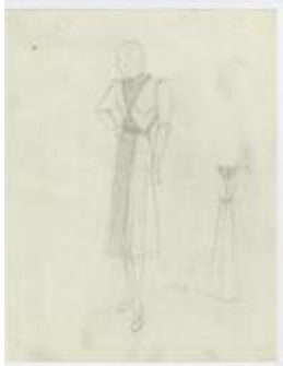
Calf-Length Dress with Triangular Panels of Tucks (KA0067_000199)