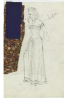
Floor-Length Dress with Cropped Jacket (KA0067_000351)