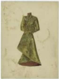
Patterned Wrap Coat with Wide Sleeves (KA0067_000099)