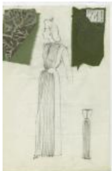
Pleated Evening Dress with Solid Panels (KA0067_000357)