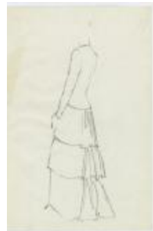
Women's Evening Ensemble with Tiered Skirt (KA0067_000346)