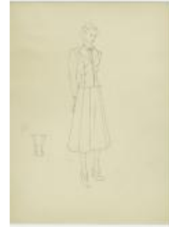
Women's Suit with Wide Pointed Collar and Arrow Details (KA0067_000142)