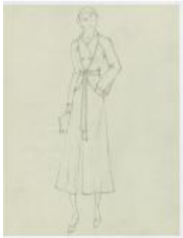
Calf-Length Women's Coat with Shawl Collar (KA0067_000023)