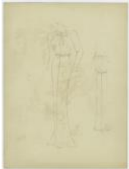
Long-Sleeved Dress with Drawstring Neckline (KA0067_000055)