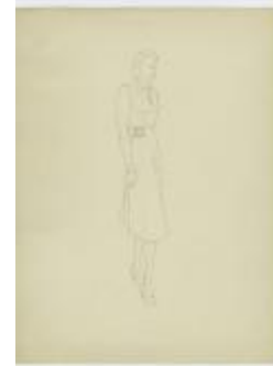
Long-Sleeved Shirtdress with Surplice Bodice (KA0067_000220)