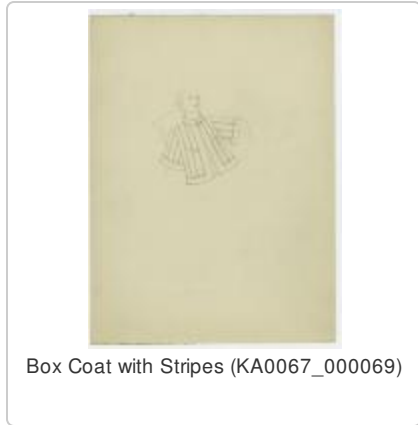
Box Coat with Stripes (KA0067_000069)