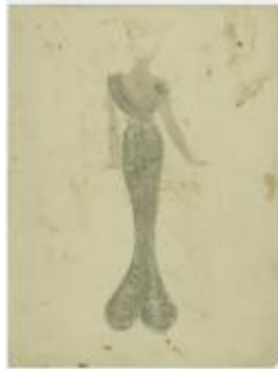
Light Green Ruched Evening Dress with Mermaid Silhouette (KA0067_000044)