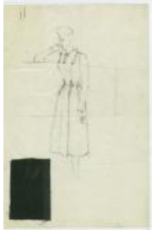
Long-Sleeved Dress with Decorative Bands (KA0067_000361)