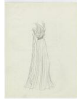
Evening Dress with Long Draped Panel and Embellished Belt (KA0067_000186)