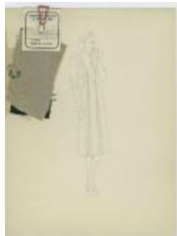
Long-Sleeved Dress with Tucks and Pleats (KA0067_000213)