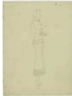
Women's Ensemble with Panels of Tucking or Ribbed Fabric (KA0067_000101)