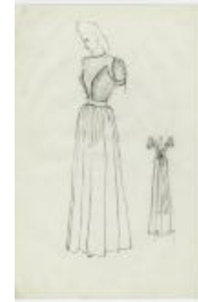
Evening Dress with Shirred Bodice and Sleeves (KA0067_000248)