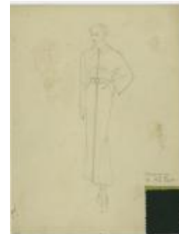
Calf-Length Coat with Rolled Collar and Bands of Tucking (KA0067_000098)