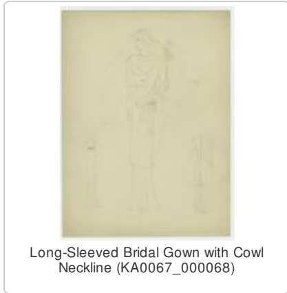
Long-Sleeved Bridal Gown with Cowl Neckline (KA0067_000068)