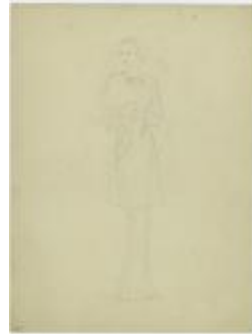
Bridal Gown with Long-Sleeved Tunic (KA0067_000113)