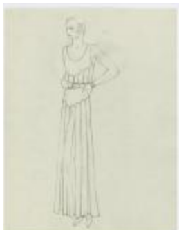
Box-Pleated Evening Dress with Belted Waist (KA0067_000019)