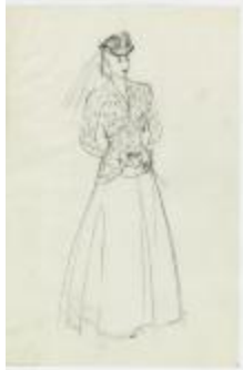
Women's Evening Ensemble with Lace Bolero Jacket (KA0067_000337)