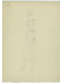
Long-Sleeved Dress with Pleats and Tucks (KA0067_000149)