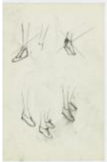
Assortment of Laced and Buttoned Women's Shoes (KA0067_000036)