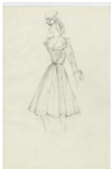
Long-Sleeved Dress with Ruffled Collar and Cuffs (KA0067_000321)