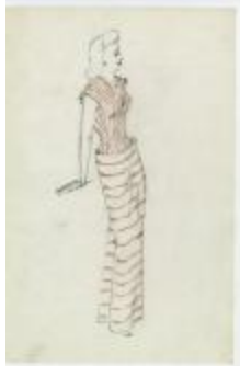
Red Striped Evening Dress (KA0067_000253)