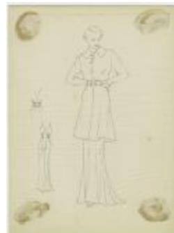
Floor-Length Evening Dress with Tunic Coat (KA0067_000085)