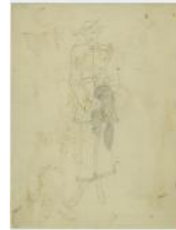
Women's Ensemble with Tiered Bands and Fur Shawl (KA0067_000106)