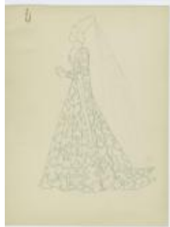
Medieval Inspired Dress with Conical Hennin (KA0067_000222)