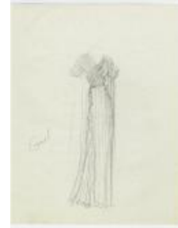
Pleated Evening Dress with Surplice Bodice (KA0067_000190)