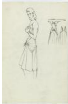
Long-Sleeved "Handkerchief" Dress (KA0067_000254)