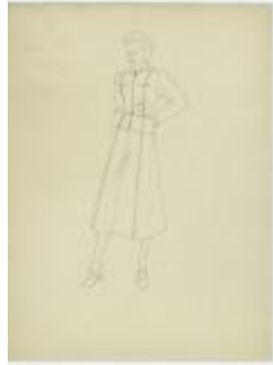
Women's Suit with Vertical Piping or Narrow Trim (KA0067_000140)