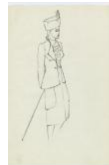
Women's Ensemble with Ruffled Collar (KA0067_000264)