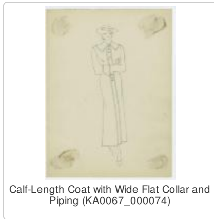
Calf-Length Coat with Wide Flat Collar and Piping (KA0067_000074)