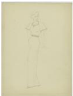
Floor-Length Dress with Short Bell Sleeves (KA0067_000059)