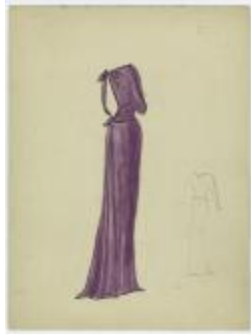
Long-Sleeved Purple Evening Dress (KA0067_000040)