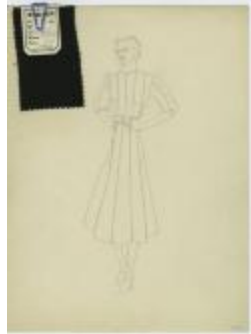
Gored Dress with Topstitching (KA0067_000160)