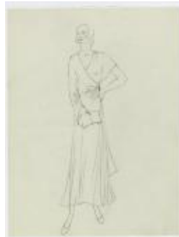
Asymmetrical Dress with Long and Short Sleeves (KA0067_000009)