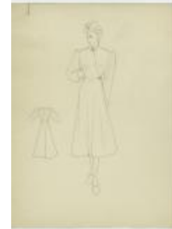
Women's Wrap Coat with Round Closures (KA0067_000154)