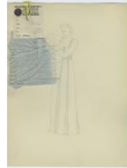
Sleeveless Evening Dress with Pleated Panels (KA0067_000207)