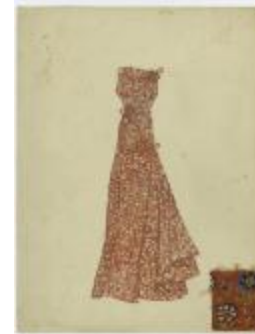
Floor-Length Wrap Dress with Floral Pattern (KA0067_000042)