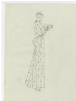
Long-Sleeved Pattern Dress with Wide Loops (KA0067_000033)