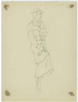
Women's Ensemble with Tunic Coat (KA0067_000087)