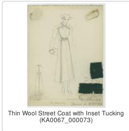
Thin Wool Street Coat with Inset Tucking (KA0067_000073)