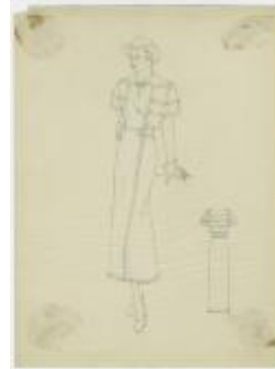
Short-Sleeved Wrap Coat with Decorative Trim (KA0067_000081)