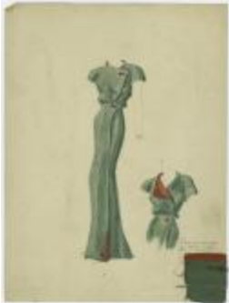
Green Satin Wrap Dress with Red Lining (KA0067_000043)