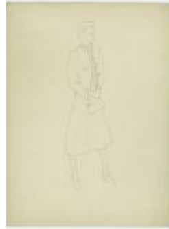
Women's Suit with Small Buttons and Narrow Trim (KA0067_000137)