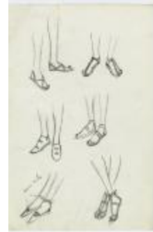
Assortment of Women's Sandals and Pointed Shoes (KA0067_000038)