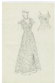
Short-Sleeved Lace Evening Dress (KA0067_000334)