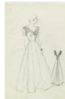
Evening Dress with Pleated Panel and Bands of Tucks (KA0067_000312)