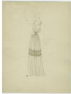
Sleeveless Evening Dress with Decorative Band (KA0067_000209)