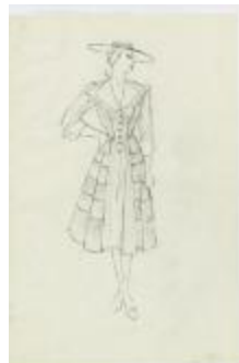
Midi-Length Shirtdress with Ruffled Edges (KA0067_000322)