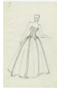
Evening Dress with Full Skirt and Decorative Bands (KA0067_000303)