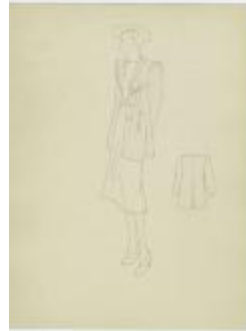
Women's Ensemble with Loose Striped Jacket (KA0067_000125)