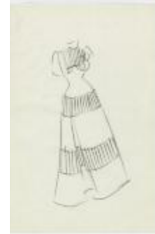
Evening Dress with Pleated, Striped, or Shirred Panels (KA0067_000328)