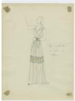
Sleeveless Evening Dress with Decorative Band and Surplice Bodice (KA0067_000237)