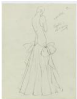
Black and Blue Taffeta Evening Dress with Large Bows (KA0067_000020)