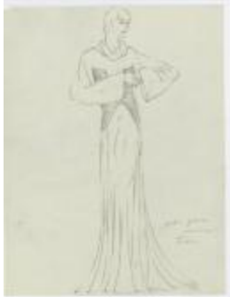
Jade Green Dress with Tucks and Long Bell Sleeves (KA0067_000011)