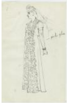
Women's Evening Ensemble with Lace and Long Pink Gloves (KA0067_000317)