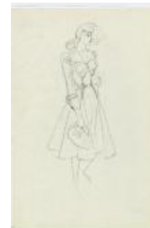
Collared Dress with Small Buttons and Ruffled Edges (KA0067_000324)