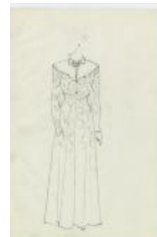
Women's Evening Ensemble with Collared Bolero Jacket (KA0067_000336)