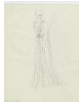
Evening Dress with Pleated Panel and Leaf Embellishment (KA0067_000182)