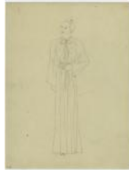
Loose Dress or Nightgown with Drawstring Neckline (KA0067_000117)