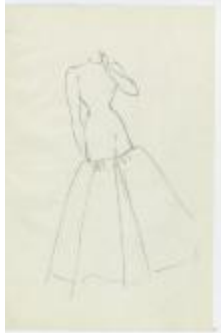
Long-Sleeved Evening Dress with Flounced Skirt (KA0067_000329)