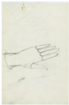
Women's Glove (KA0067_000001)