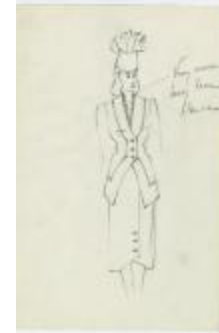
Women's Ensemble with Lace Blouse and Cutaway Coat (KA0067_000260)