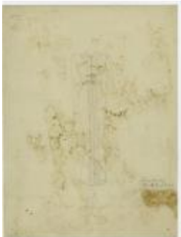
Calf-Length Coat with Bands of Tucking (KA0067_000095)