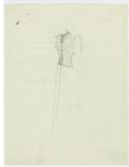
Women's Ensemble with Tucks and Rope Trim (KA0067_000200)