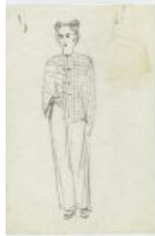
Women's Lounge Ensemble with Checked Jacket (KA0067_000350)