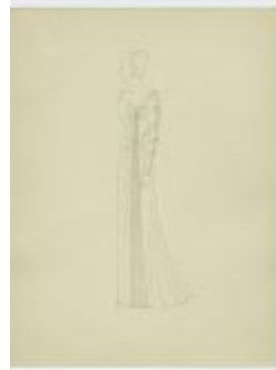
Evening Dress with Knotted Bodice and Long Open Sleeves (KA0067_000206)