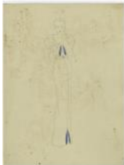
Floor-Length Evening Dress with Ruffle Collar and Blue Lining (KA0067_000048)