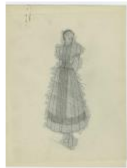
Short-Sleeved Dress with Bands of Striped or Ribbed Fabric (KA0067_000121)