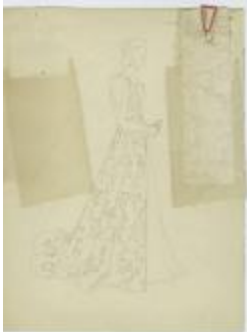
Medieval Inspired Bridal Gown or Costume with Veiled Torque (KA0067_000221)