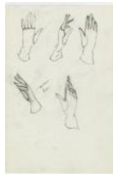
Wrist-Length Women's Gloves (KA0067_000003)