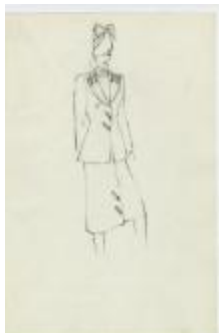
Women's Suit with Small Strip Embellishments (KA0067_000261)