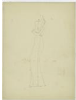
Floor-Length Dress with Sleeve Embellishments (KA0067_000056)