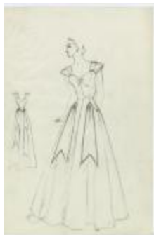
Evening Dress with Full Skirt and Wide Ribbons (KA0067_000309)