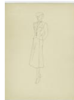
Women's Suit with Wide Pointed Collar (KA0067_000134)