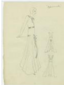
Sleeveless Evening Dress with Ribbon and Geometric Design (KA0067_000029)