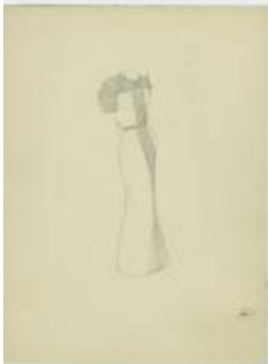
Short-Sleeved Dress with Bow Collar and Pleats (KA0067_000175)