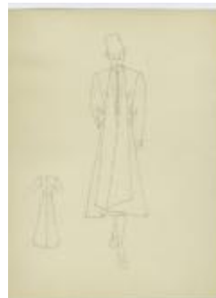
Calf-Length Women's Coat with Draped Panels (KA0067_000157)