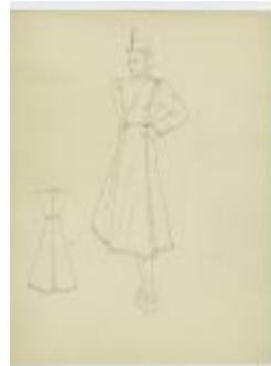
Wrap Coat with Decorative Trim (KA0067_000145)