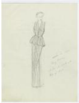
Pleated Evening Dress with Peplum (KA0067_000195)