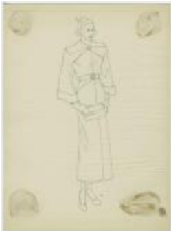
Calf-Length Coat with Wide Flat Collar and Pointed Yoke (KA0067_000075)