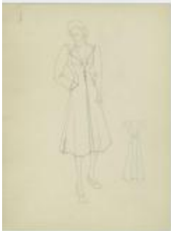
Princess Coat with Narrow Trim and Wide Pointed Collar (KA0067_000127)