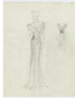
Shirred Evening Dress with Wrapped Bodice (KA0067_000185)