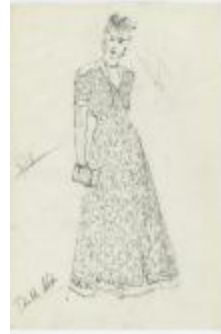
Women's Lace Evening Ensemble with Long Pink Gloves (KA0067_000338)