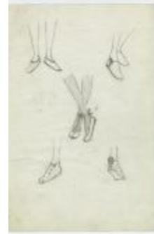
Women's Ballet Flats and Assorted Booties (KA0067_000039)