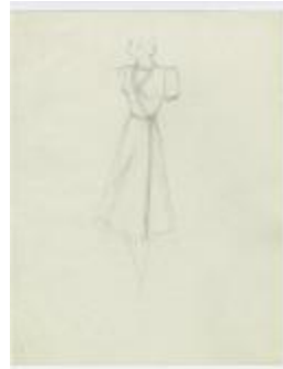
Short-Sleeved Wrap Dress with Striped Bands (KA0067_000197)