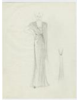
Himation Style Pleated Evening Dress (KA0067_000184)