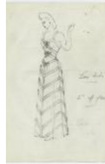
Evening Dress with Bows and Box Tucks (KA0067_000243)