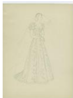
Medieval Inspired Wedding Gown or Costume with Juliet Sleeves (KA0067_000227)