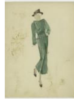
Long-Sleeved Green Dress or Jumpsuit (KA0067_000150)