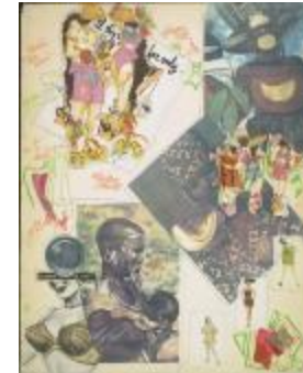
Mood Board Featuring Cone Bras, Plates, Metallic Fabrics, and African Imagery (PC020201_000002)