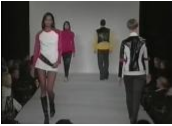
Parsons 2004 Benefit & Fashion Show Honoring Marc Jacobs (PC070205_VHS015)