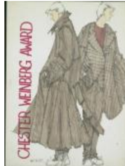
Menswear Suiting Coordinates (PC020201_000004)