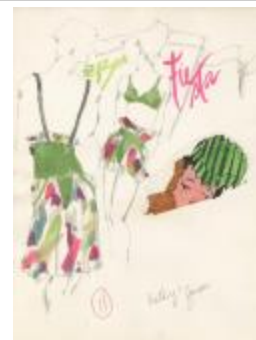
Tropical Fantasies Circa 1953 (PC020201_000075)