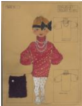
Children's Knitted "Pearl Dress" (PIC02002-1_b04_f10_01)