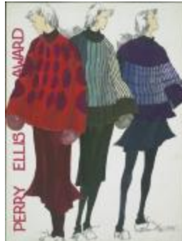
'OP' Sweaters, Flannel Bottoms, Wool Jersey Tops (PC020201_000003)