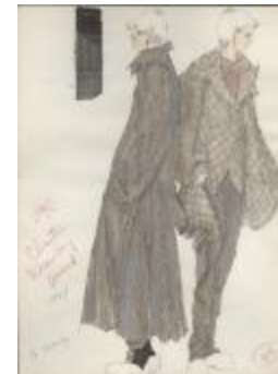
Menswear Suiting Coordinates (PIC02002- 1_b39_f02_01a)