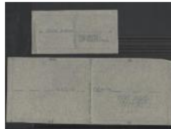
Pattern Pieces for Children's Knitted "Pearl Dress" (PIC02002-1_b04_f10_03)