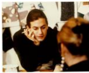
Parsons School of Design Alumnus Marc Jacobs (PIC04001_b05_f03_02)