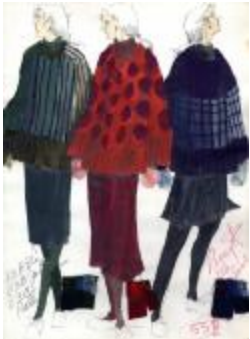
'OP' Sweaters, Flannel Bottoms, Wool Jersey Tops (PIC02002-1_b39_f02_02)