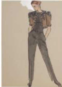
Black Women's Ensemble with Short-Sleeved Embellished Bolero Jacket (KA002201_OSxxx1_f07_14)