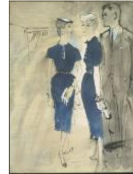
Navy Blue Sheath Dresses with White Buttons (KA0038_000024)