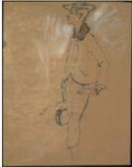
Topaz Wool Ensemble with Mink Collar (KA0038_000065)