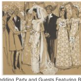
Wedding Party and Guests Featuring Bride in Patterned Dress with Watteau Train (KA002201_OSxxx1_f03_09)