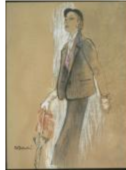
Box-Jacket Suit with Pink Velvet Vest (KA0038_000022)