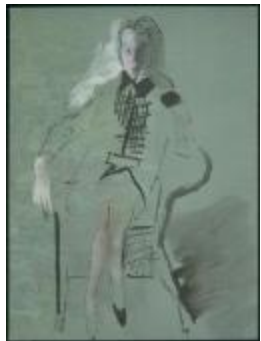
Women's Ensemble with Dark Collar and Matching Sleeve Cuffs (KA0038_000096)