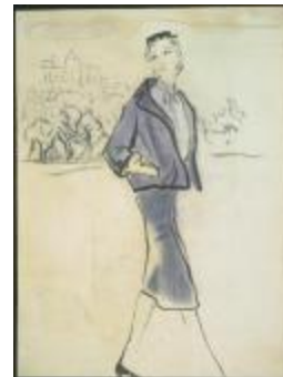
Short Navy Blue Coat and Fitted Skirt (KA0038_000113)