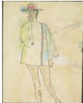
Multicolor Poncho and Sunhat (KA0038_000118)