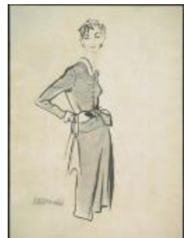
Navy Women's Suit with Framed Handbag (KA0038_000070)