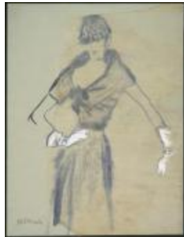
Short Dress with Fichu Wrap and Spotted Cap (KA0038_000086)