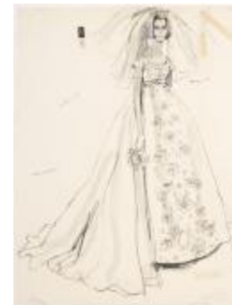
Floral Printed Bridal Gown with Empire Waistline and Flyaway Veil (KA002201_OSxxx1_f10_02)