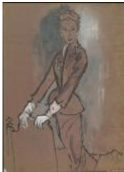
Women's Late-Day Suit in Wine Velvet (KA0038_000032)