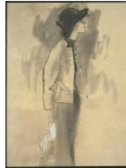
Women's Ensemble with Short Jacket and Cloche Hat (KA0038_000049)