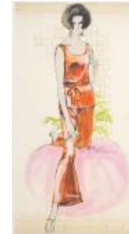
Orange Women's Ensemble Featuring Bellbottom Pants (KA002201_OSxxx1_f11_04)