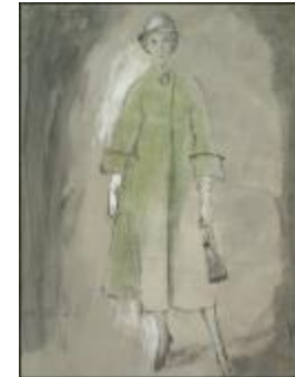
Women's Green Coat with Large Button Closure (KA0038_000075)