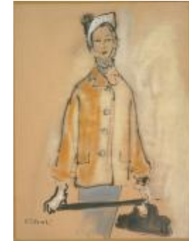
Women's "BÃ©nÃ©dictine" Wool Coat (KA0038_000026)