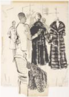
Saks Fifth Avenue Sales Associate and Two Women in Fur Coats (KA002201_OSxxx1_f10_03)