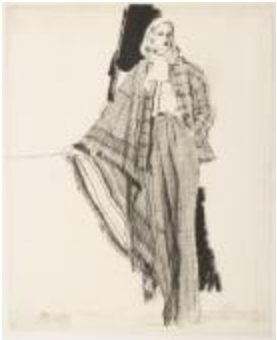
Plaid Women's Ensemble Featuring Blanket Cape (KA002201_OSxxx1_f04_10)