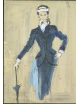
Fitted Blue Women's Suit (KA0038_000115)