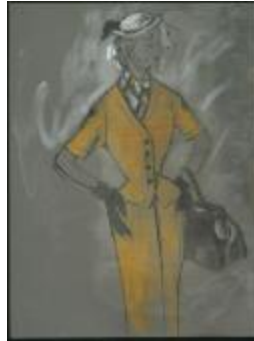
"BÃ©nÃ©dictine" Linen Suit with Cardigan Jacket (KA0038_000023)