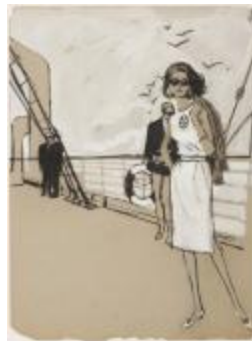
Woman on Ship Deck Wearing Short Sheath Dress with Cut-Out Design (KA002201_OSxxx1_f04_01)