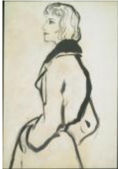
Belted Women's Coat with Dark Collar (KA0038_000117)