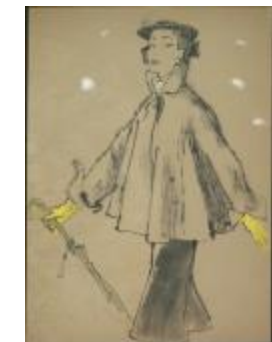
Short Swing Coat with Trumpet Skirt (KA0038_000067)