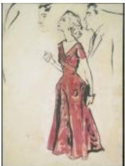
Short-Sleeved Pink Dress with Wrapped Bodice (KA0038_000068)