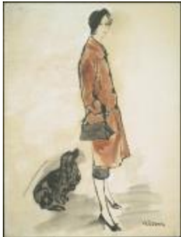
Auburn Velvet Coat (KA0038_000035)