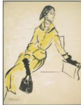
Yellow Silk Shantung Women's Suit (KA0038_000074)