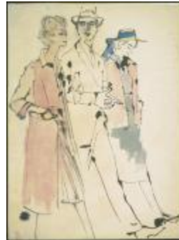
Women's Pink Coat and Jacket Ensembles (KA0038_000027)