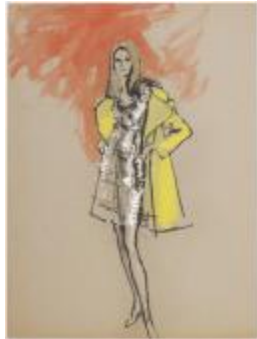
High-Waisted Sequined Sheath Dress with Yellow Swing Coat (KA002201_OSxxx1_f11_01)