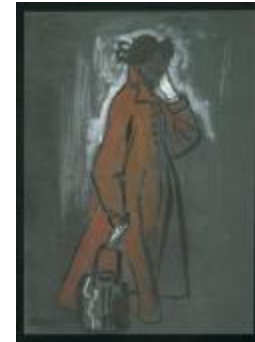
Women's Burnt Tangerine Tavel Coat and Veiled Hat (KA0038_000012)