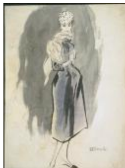
Navy Dress with Rhinestone Embellishments (KA0038_000072)