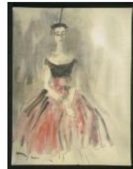
Black Top with Pink Taffeta Skirt (KA0038_000011)