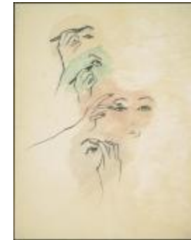
Women Applying Eye Makeup and Plucking Eyebrows (KA0038_000058)