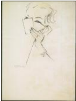
Woman Applying Mascara (KA0038_000060)