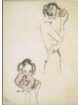
Women Applying "Diet-Form" and Heated Facial Mask (KA0038_000045)