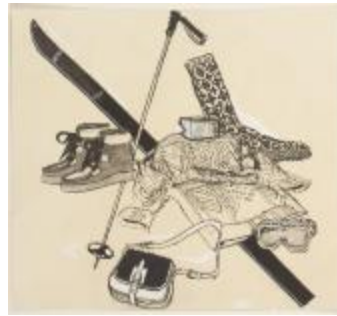
Sweater, Boots, Socks, and Purse with Assorted Ski Equipment (KA002201_OSxxx1_f04_03)