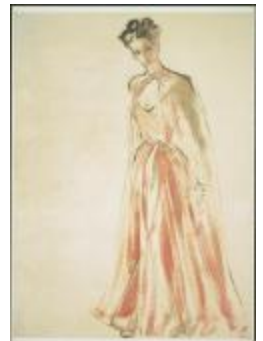
Coral Evening Dress with Cape (KA0038_000028)