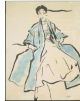
Blue Linen Coat with Embroidered Dinner Dress (KA0038_000053)