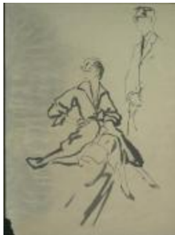
Women's Loose Overcoat and Men's Suit (KA0038_000111)