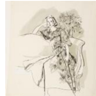
Woman Lounging in Floral Printed Dress with Puff Sleeves (KA002201_OSxxx1_f04_02)