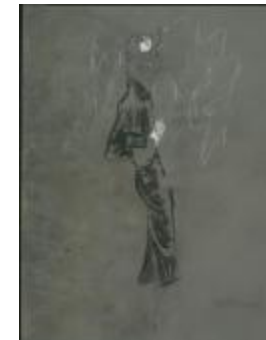
Women's Ensemble with Short Loose Coat and Long Fitted Skirt (KA0038_000112)