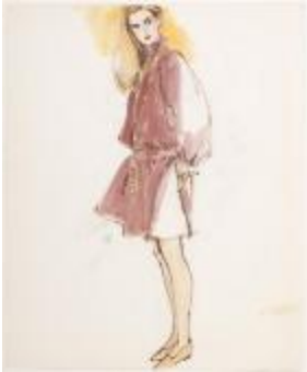
Loose Red Dress with Gold Jewelry (KA002201_OSxxx1_f07_09)