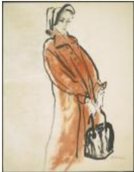
Women's Burnt Tangerine Travel Coat (KA0038_000071)