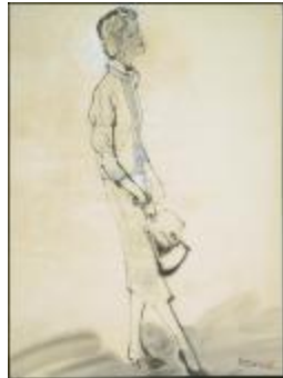
Women's Cardigan Suit with Blue Border (KA0038_000040)