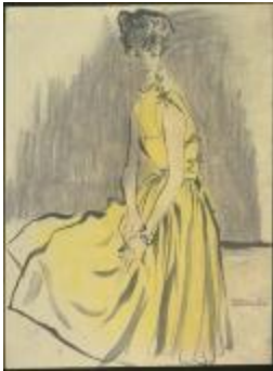
Sleeveless Yellow Dress with Small Bows (KA0038_000047)