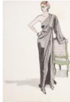
One-Sleeved Evening Dress with High Skirt Slit (KA002201_OSxxx1_f07_11)