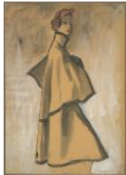
Flannel Cape Coat with Black Braid Piping (KA0038_000054)