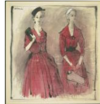
Red Jersey Dresses (KA0038_000036)