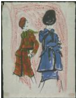
Women's Red Plaid Ensemble and Solid Blue Ensemble (KA0038_000089)