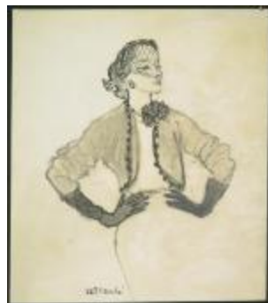
Blond Fleece Jacket with Black Braid and Tassels (KA0038_000063)