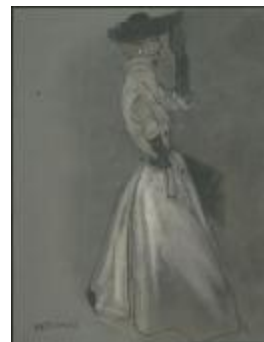
Blond Taffeta Coat Dress (KA0038_000064)