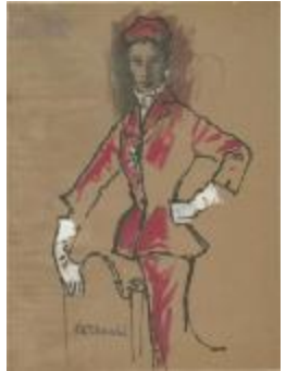
Wine Velvet Late-Day Suit (KA0038_000038)