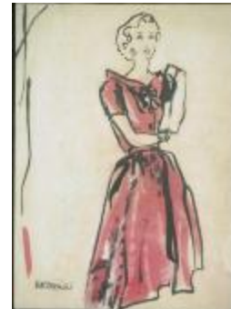
Pink Shirtdress with Chelsea Collar (KA0038_000085)