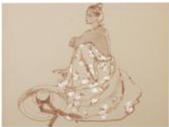
Backless Floral Printed Dress (KA002201_OSxxx1_f07_03)