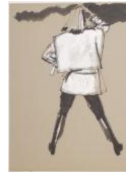
Women's Ensemble Featuring High Leather Boots and Jacket with Cape Back (KA002201_OSxxx1_f06_02)