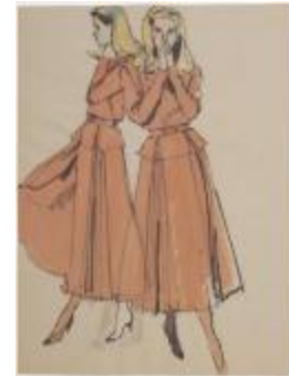
Long-Sleeved Orange Top with Matching Maxi Skirt (KA002201_OSxxx1_f07_12)