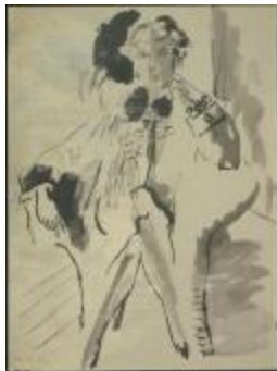
Women's Ensemble with Dark Collar and Matching Sleeve Cuffs (KA0038_000099)