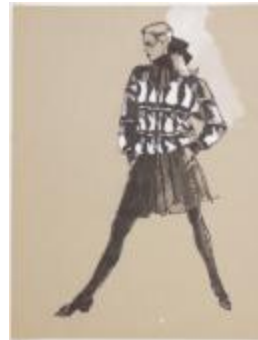
Women's Ensemble Featuring Patterned Cardigan and Short Gathered Skirt (KA002201_OSxxx1_f06_01)