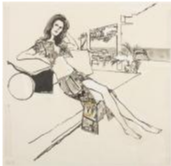
Women's Printed Ensemble with Wrap Skirt, Bikini Top, and Bolero Jacket (KA002201_OSxxx1_f04_08)