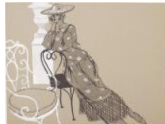
Long Dotted Dress and "Coolie" or "Saucer" Hat (KA002201_OSxxx1_f07_06)