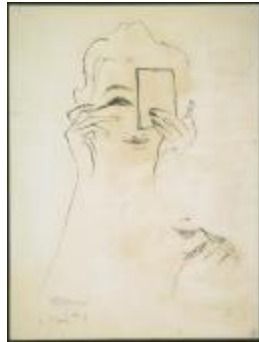
Women Applying Mascara and Lip Pencil (KA0038_000061)