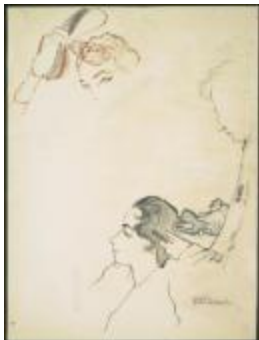
Women Using Hair Color Selector and Pinking Machine (KA0038_000090)