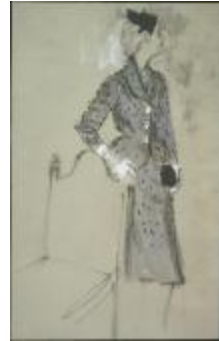
Blue Women's Suit with Black Dots (KA0038_000019)