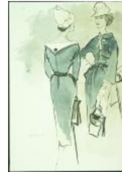
Navy Blue Dresses with White Hats (KA0038_000017)