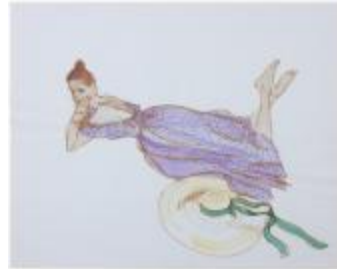
Purple and Green Dotted Sundress with Off-the-Shoulder Ruffled Neckline (KA002201_OSxxx1_f08_01)