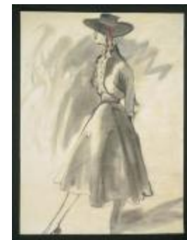
Women's Ensemble with Bolero Jacket and Full Skirt (KA0038_000006)