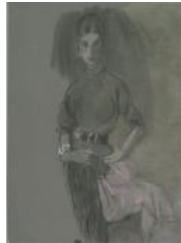
Women's Ensemble with Belted Sweater and Pleated Skirt (KA0038_000055)