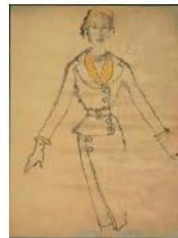
Grey Wool Jersey Dress with Wrap-Around Skirt (KA0038_000066)