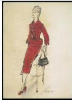
Red Women's Suit with Rounded Yoke (KA0038_000001)