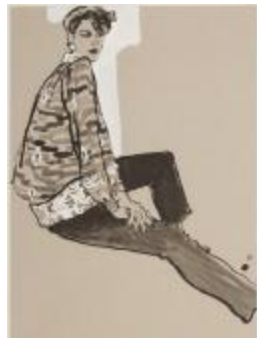
Women's Ensemble with Dark Pants and Loose Patterned Top (KA002201_OSxxx1_f03_07)