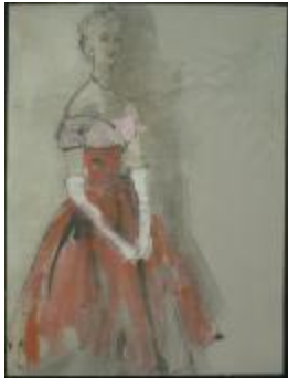
Pale Pink Chiffon Top and Crimson Satin Skirt (KA0038_000041)