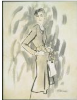
Women's Suit with Framed Handbag (KA0038_000020)