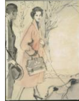
Pink Fleece Women's Coat (KA0038_000052)