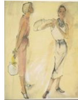
Shell Pink Dress and Lavender-Blue Ensemble (KA0038_000056)