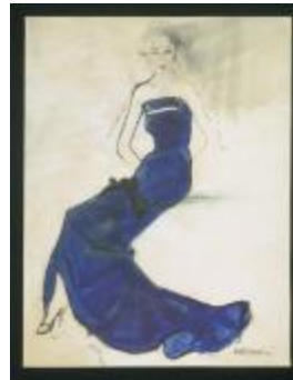
Strapless Blue Evening Dress with Mermaid Skirt (KA0038_000005)