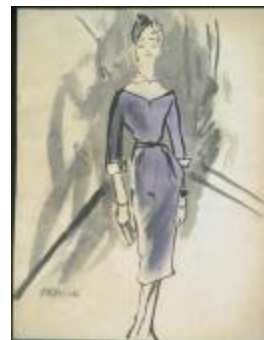
Blue Sheath Dress with White Collar and Sleeve Cuffs (KA0038_000092)