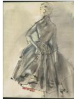
Black Taffeta Dress with Colorful Petticoat (KA0038_000046)