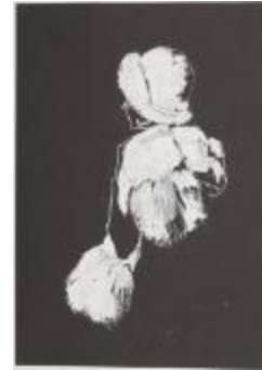
Woman Wearing Cloche Hat with Fur Wrap and Scarf (KA002201_OSxxx1_f03_06)