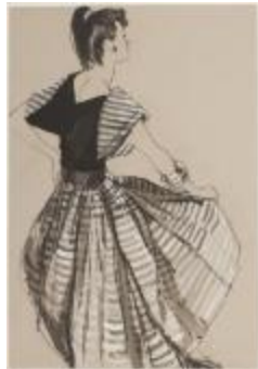
Striped Dress with Full Skirt (KA002201_OSxxx1_f04_11)