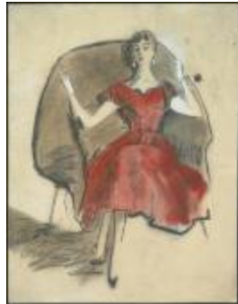
Red Lace Evening Dress with Cape Collar (KA0038_000073)