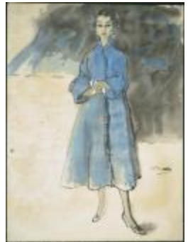
Turquoise Blue Coat with Fringe (KA0038_000076)