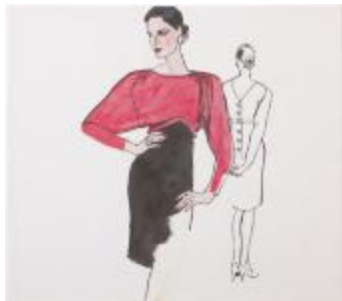
Black and Bright Pink Dress with Fitted Skirt and Dolman Sleeves (KA002201_OSxxx1_f08_03)