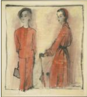
Red Jersey Ensemble and Shirtwaist Dress (KA0038_000037)