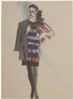
Women's Ensemble Featuring Multicolor Striped Dress and Long Black Blazer (KA002201_OSxxx1_f07_13)