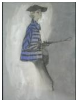
Blue and Black Striped Jacket with Raglan Sleeves (KA0038_000051)