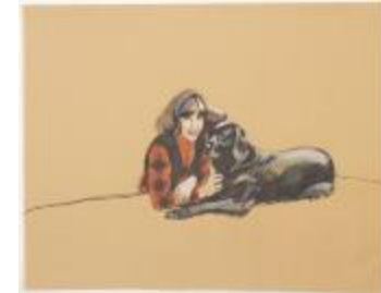
Woman in Red and Black Plaid Top with Dog (KA002201_OSxxx1_f08_02)