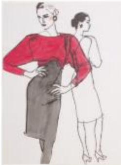
Black and Bright Pink Dress with Fitted Skirt and Dolman Sleeves (KA002201_OSxxx1_f07_08)