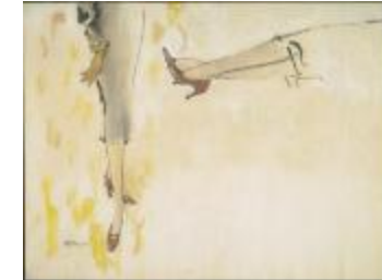
Fitted Skirts with Red or Orange Pumps (KA0038_000083)