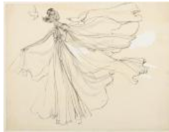
Flowing Evening Dress with Wrapped Bodice (KA002201_OSxxx1_f04_09)