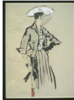
Women's Ensemble with Veiled Hat (KA0038_000009)