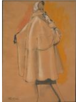
Women's "BÃ©nÃ©dictine" Coat with Low Yoke (KA0038_000021)