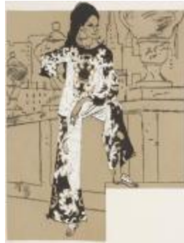
Women's Printed Pajama Suit with Tiered Tassel Earrings (KA002201_OSxxx1_f03_02)