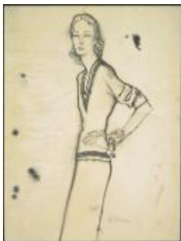
Middy-Bodice Sheath Dress (KA0038_000059)