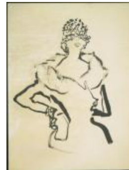
Evening Coat and Birdcage Veil (KA0038_000034)