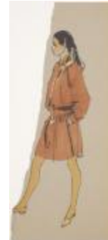
Loose Orange Dress with Gold Jewelry and Yellow Stockings (KA002201_OSxxx1_f07_01)