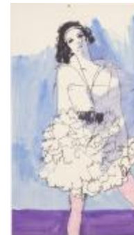
Ruffled Skirt, Wide Belt, and Collared Blouse (KA002201_OSxxx1_f07_07)