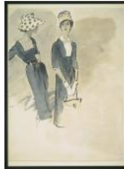
Blue Sheath Dresses (KA0038_000013)