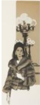
Waist-Length Fur Jacket with Wide Collar (KA002201_OSxxx1_f03_01)