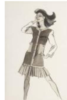
Long Color-Blocked Cardigan with Pleated Skirt (KA002201_OSxxx1_f04_06)