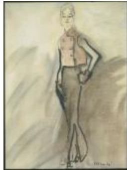
Evening Ensemble with Sleeveless Pink Pillbox Jacket (KA0038_000043)