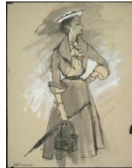
Women's Ensemble with Bolero Jacket and Large Bows (KA0038_000057)