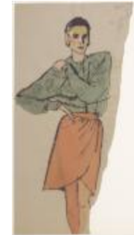
Peach Wrap Skirt with Printed Green Blouse (KA002201_OSxxx1_f07_02)