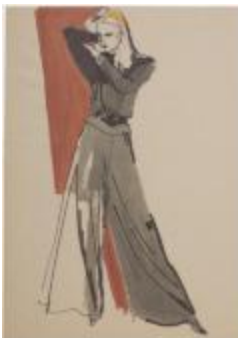
Black Women's Ensemble with Wide- Legged Pants (KA002201_OSxxx1_f07_04)