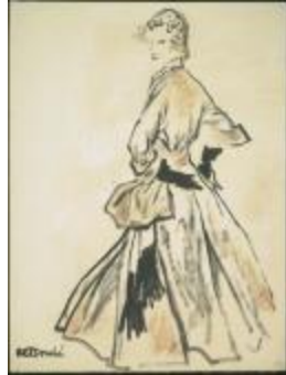
"Etching" Late-Day Dress with Fringed Cummerbund (KA0038_000039)