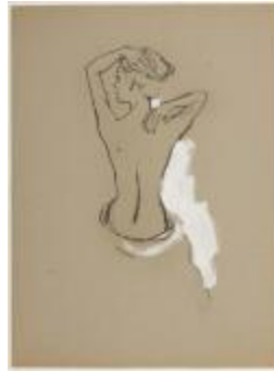
Back View of Nude Woman (KA002201_OSxxx1_f03_05)