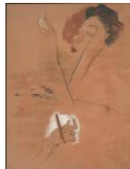
Women Plucking Eyebrows, Applying Makeup, and Filing Nails (KA0038_000062)