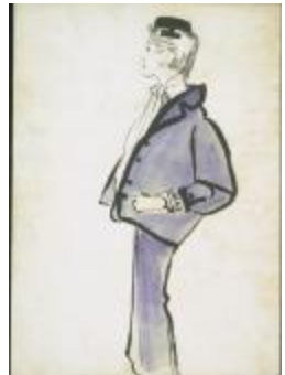
Short Navy Blue Coat with Silk Braided Trim (KA0038_000114)