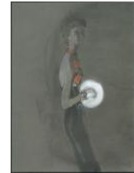
Wool Plaid and Velveteen Directoire Suit (KA0038_000050)