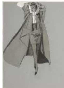
Women's Ensemble Featuring Duster Jacket and Pencil Skirt (KA002201_OSxxx1_f04_04)