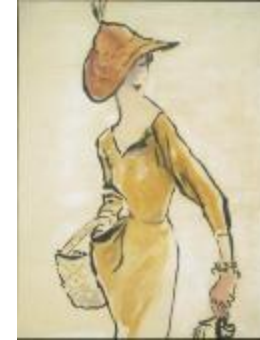
Yellow Sheath Dress with Orange Hat and Basket Purse (KA0038_000116)