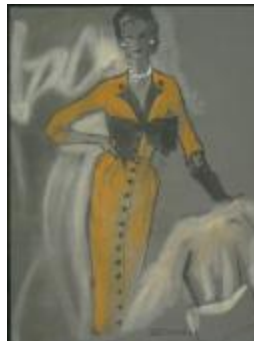
Orange Coat Dress with Large Black Bow (KA0038_000033)