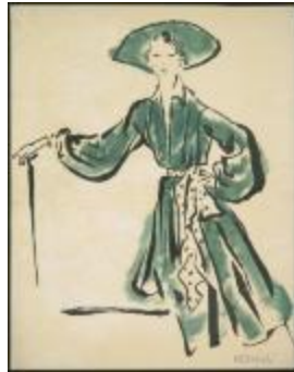
Fir-Green Silk Surah Suit (KA0038_000048)