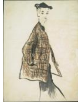
Rust and Black Tweed Collarless Coat (KA0038_000044)