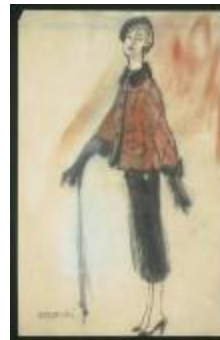
Orange and Black Plaid Jacket with Black Velveteen Skirt (KA0038_000101)