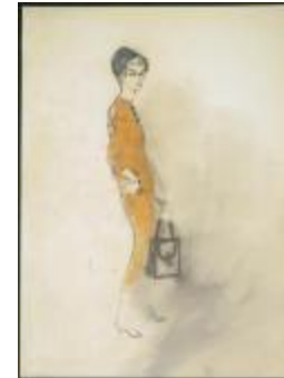
Women's Matchbox Suit in Persimmon (KA0038_000087)