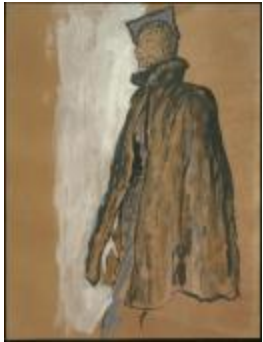
Fur Cape, Grey Dress, and Veiled Headpiece (KA0038_000110)