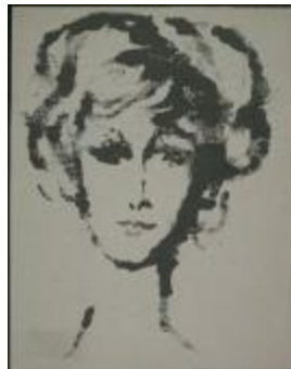
Portrait of Unknown Woman (KA0038_000091)