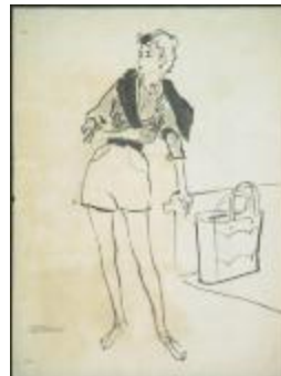
Women's Ensemble with Gabardine Shorts and Filled Gingham Blouse (KA0038_000132)