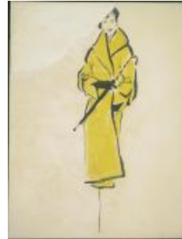
Women's Yellow Wrap Coat with Shawl Collar (KA0038_000080)