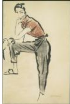
Women's Ensemble with Black Pants and Short-Sleeved Red Blouse (KA0038_000120)