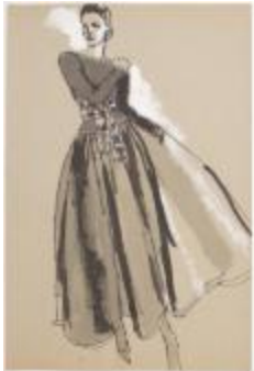
Women's Evening Ensemble Featuring Ball Gown Skirt and Floral Sash Belt (KA002201_OSxxx1_f06_03)