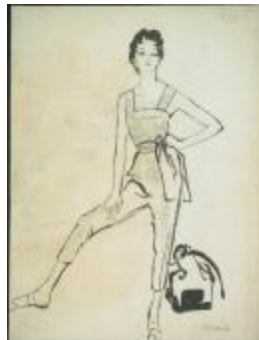
Corded Overalls with Sash Belt (KA0038_000109)