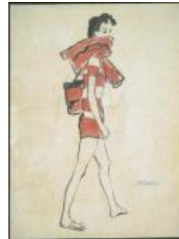
Red Striped Pullover with Gabardine Shorts (KA0038_000088)