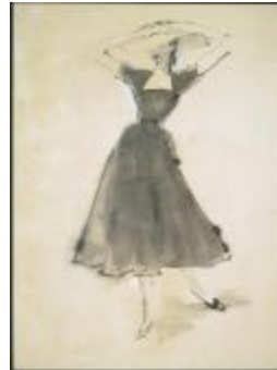
Black Cotton Piqué Dress with Straw Hat (KA0038_000069)