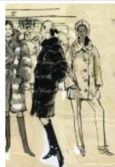
Three Women in Various Fur Coats (KA002201_OSxx3_f10_01)