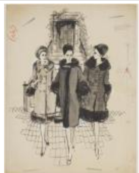
Fur-Trimmed Coats and Matching Toques (KA008601_OSxxx6_f05_01)