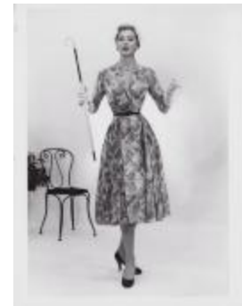
Printed White, Black, Green Crepe (KA0018_000031)