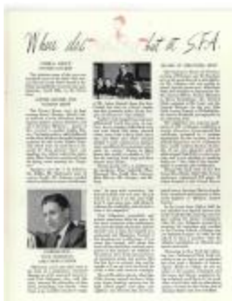
"Where else but at S.F.A.," Saks News, Vol. 7, No. 2, unpaginated (KA0102_k07_f01_01i)