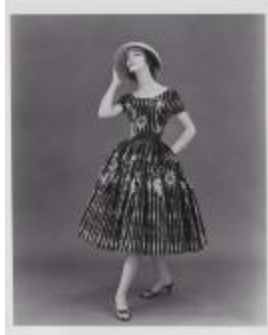
Anne Fogarty Dress with Poppies and Mushroom Hat (KA0018_000028)