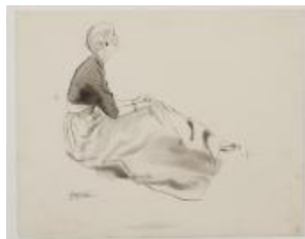
Floor-Length Dress or Skirt with Dolman Sleeve Top (KA011201_kOSxx2_f05_02)