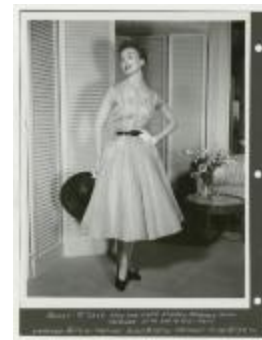
Navy and White Striped Organza Dress Trimmed with White Rick-Rack (KA0018_000036)