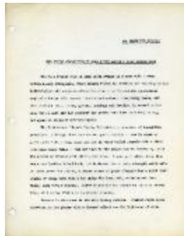
The Spring Collection of Saks Fifth Avenue's Park Avenue Room (KA0018_binder51_06)