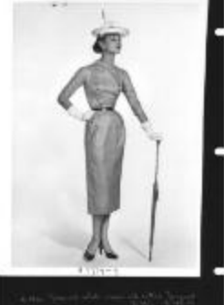
Grey and White Rayon and Cotton Jacquard Dress (KA0018_binder05_01)