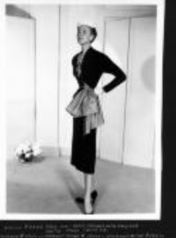
Navy Wool Dress Trimmed with Navy and White Plaid Taffeta (KA0018_binder02_03)