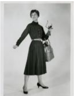
Charcoal Grey Flannel Shirt Dress (KA0018_000022)