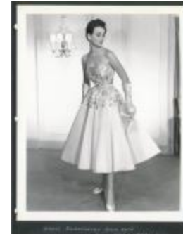
Embroidered Pink Satin Evening Dress (KA0018_binder02_02b)