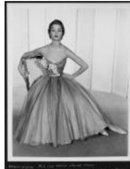
Blue and Green Gauze Dress (KA0018_000026)