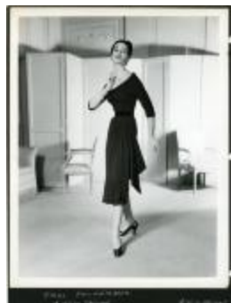
Black Crepe Dress (KA0018_binder02_07)