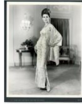
Long Gold and White Sari Gown and Stole (KA0018_binder15_01)