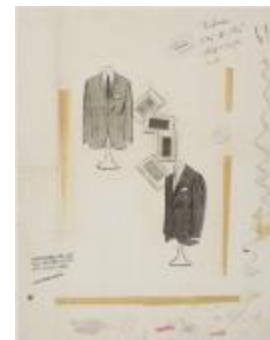
Men's Suit Jackets and Fabric Swatches (KA008601_OSxx2_f09_03)