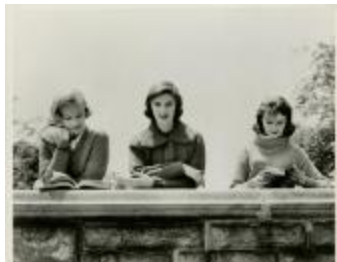
Various Knit Sweaters (KA0018_000011)