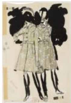
Women's Day Coat and Matching Dress with Black-Out (KA008601_OSx1_f20_01overlay)