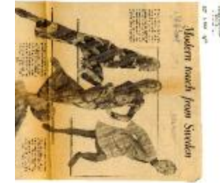
Modern Touch from Sweden (KA0018_binder60_03)