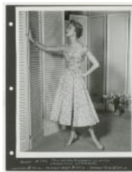
Pink and Blue Flowered Cotton Dress Embroidered with Sequins (KA0018_000035)