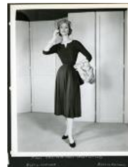
Black Crepe Dress - Velvet Cut-Outs (KA0018_binder02_08)