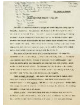
College and Career Fashions - Fall 1956 (KA0018_000005)