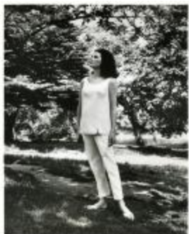
Bathing Suit Overblouse and Slacks (KA0018_binder51_04)