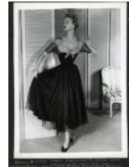
Black Marquessette Dress with Embroidered White Lace Yoke (KA0018_binder01_01)