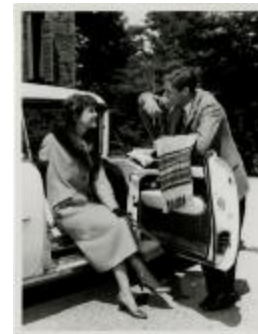
Double Greatcoat in Chamois Yellow Tweed with a Raccoon Collar (KA0018_000006)