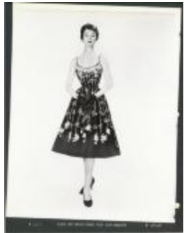
Black Net Dress Embroidered with Blue Sequins (KA0018_binder10_01)