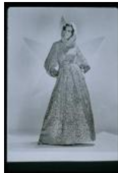
Long-Sleeved Embroidered Sequined Gown (KA0018_binder65_04)