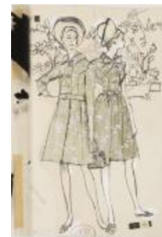
Women's Day Coat and Matching Dress (KA008601_OSx1_f20_01)