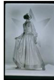
One-Piece Gold Moire Pajama (KA0018_binder65_06)