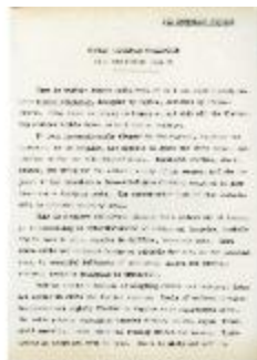
Sophie Originals Collection Fall and Winter 1954-55 (KA0018_binder02_06)