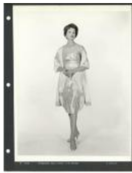
Strapless Sari Dress with Stole (KA0018_binder11_03)