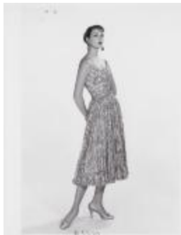
Embroidered Multi Color Chiffon (KA0018_000032)