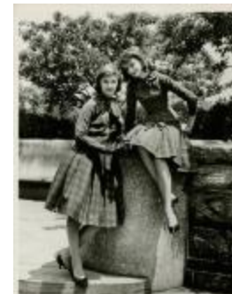
Two Young Dresses (KA0018_000013)