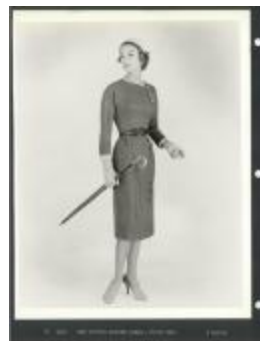
Grey Chiffon Flannel Dress with Pique Trim (KA0018_binder11_04)