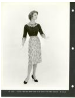
White, Pink and Green Silk Print Dress with Grey Sweater (KA0018_binder11_07)