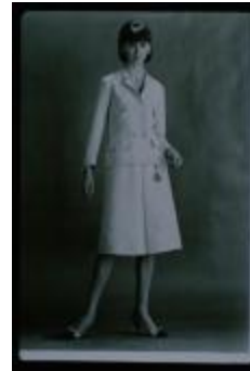
Women's Ribbed Silk Suit with Double-Breasted Jacket (KA0018_binderXX_01)