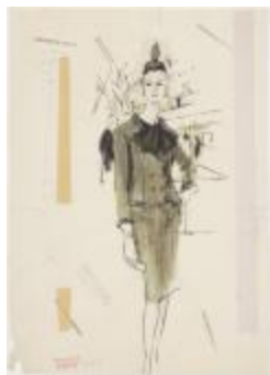
Women's Suit with Oversized Bow Collar (KA008601_OSx2_f04_01)