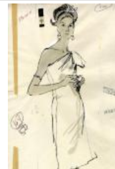
Asymmetrical Evening Dress with Oversized Bow (KA002201_OSxx3_f10_02)