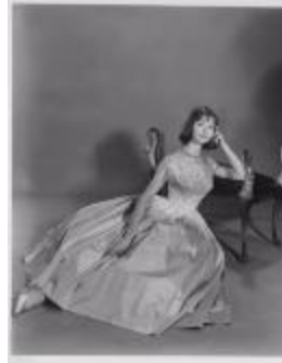
Chartreuse Embroidered Evening Gown with Crystal and Gold Necklace by Anne Fogarty (KA0018_000029)