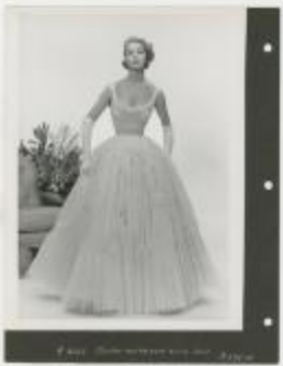
Pleated White Net with Lace (KA0018_000037)