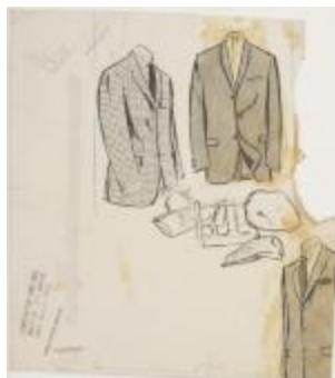
Assortment of Men's Jackets, Pipes, and Flat Caps (KA008601_OSx1_f18_02)