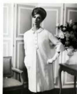
White Matelasse Dress with Bateau Neckline and Straight Coat (KA0018_binder16_12)