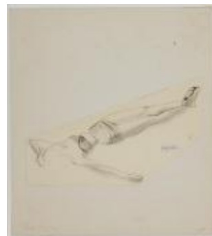
Two-Piece Swimsuit with Bandeau Top and Ruched Bottoms (KA011201_kOSxx2_f05_03)