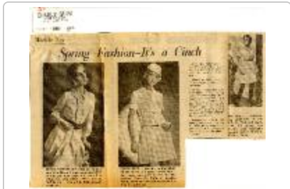
Spring Fashion - It's a Cinch (KA0018_binder66_02)