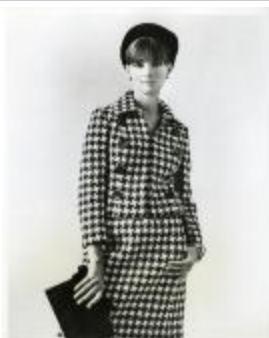
Black and White Houndstooth Tweed Suit (KA0018_binder52_04)