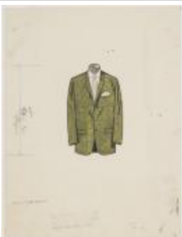
Men's Green Patterned Jacket (KA008601_OSx1_f18_01)