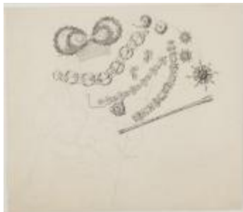
Assorted Jewelry and Accessories Over Image of Santa Claus (KA011201_kOSxx2_f09_01.tif)