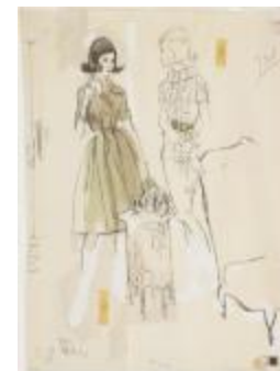
Short-Sleeved Shirt Dress and Herringbone Sheath Dress with Rolled Collar (KA008601_OSx2_f03_02)