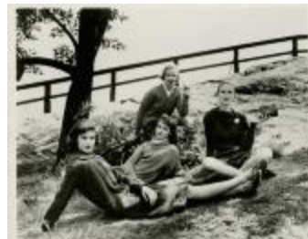
Various Sweater Ensembles (KA0018_000012)