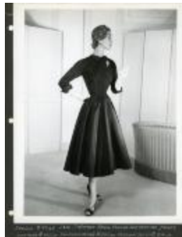
Lace-Trimmed Black Peau de Soie Dress and Jacket (KA0018_binder01_03)