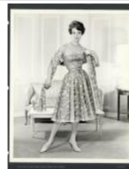
Blue and Gold Sari Dress and Stole (KA0018_binder12_01)