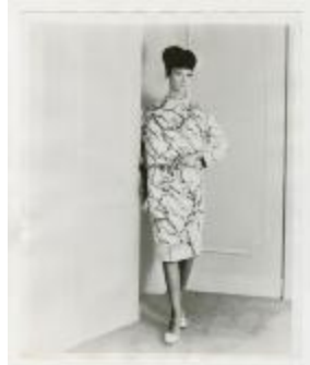
Suit with Cherry Blossom Print (KA0018_000039)