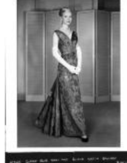
Blue, Grey, and Black Satin Brocade Evening Dress (KA0018_binder04_01)

The beautiful fabric # 4011 DISCOVERED BY THE FIRST A dress that might have slipped out of a shop's window at the man of the window in the store (the artist) turned to a Belgian (the artist) of Paris and grey. The dress, made of silk, and the fabric was a general medical center. The dress was in our line a 7' tall, 100 lb. girl. The dress is made with a black fabric. The dress is made of silk. The dress is made of silk. The dress is made of silk. The dress is made of silk. The dress is made of silk. The dress is made of silk. The dress is made of silk. The dress is made of silk. The dress is made of silk. The dress is made of silk.