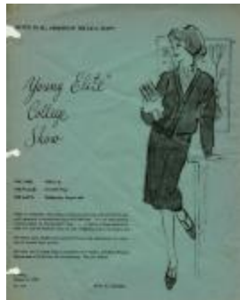
Young Elite College Show Announcement for Saks Fifth Avenue Staff (KA0018_000003)