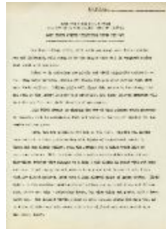
American Girls Will Pioneer New Styles in the College Year of 1958-59: Saks Fifth Avenue Collection Shows the Way