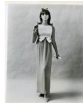
Silk Chiffon Dress (KA0018_binder52_02)