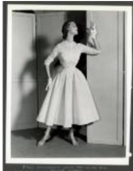
Embroidered White Peau de Soie Dress with Cashmere Sweater (KA0018_binder02_01b)