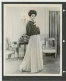
Deep Turquoise Mushroom Pleated Velvet Balloon Cape with Ombre Marquisette Dress (KA0018_000041)