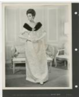
White Brocade Ball Gown and Jacket Collared in Russian Sable (KA0018_000038)