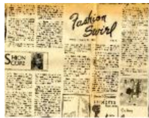
Color, Coordination in Katja collection (KA0018_binder66_03)