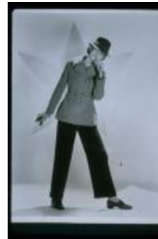
Grey Flannel Slacks, Polka Dotted Blouse, and Double-Breasted Melton Wool Jacket (KA0018_binder65_01)