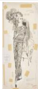
Printed Women's Ensemble with Harem Trousers (KA002201_OSxxx1_f10_01)