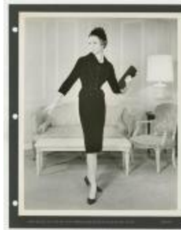
Black Cut Velvet Suit, White Satin-Pleated Blouse and Cuffs (KA0018_000040)