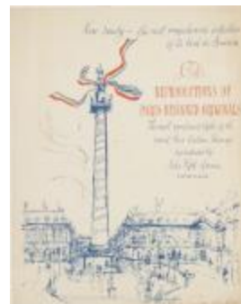
"S.F.A's Reproductions of Paris-Designed Originals" (KA008601_OSx1_f19_02)