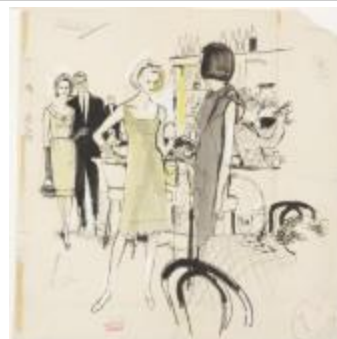
Sheath, Empire Waist, and Pencil Dresses (KA008601_OSxxx7_f02_01)