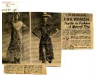
Textile to Fashion - A Natural Step (KA0018_binder74_01)