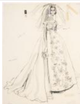
Floral Printed Bridal Gown with Empire Waistline and Flyaway Veil (KA002201_OSxxx1_f10_02)