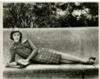
Chemise Jumper of Red and Saffron Checked Wool (KA0018_000010)