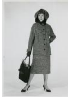
Black and White Tweed Business Suit (KA0018_000021)