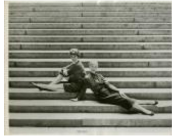
Two Popular College Fashions (KA0018_000016)