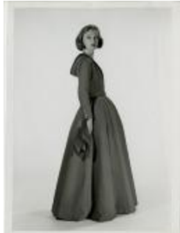
Wool Evening Costume (KA0018_000008)