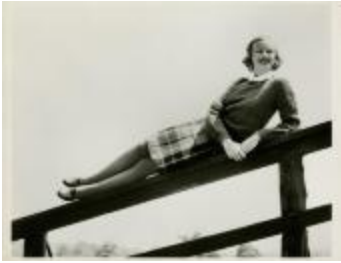
Blue Mohair Pull Over with Plaid Blanket Wool Skirt (KA0018_000014)