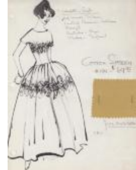
Chartreuse Embroidered Evening Gown with Crystal and Gold Necklace by Anne Fogarty (KA0018_000030)