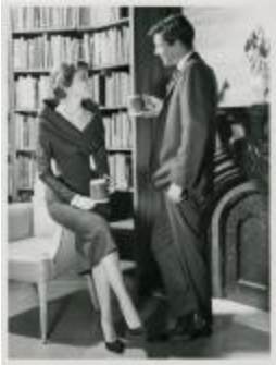
Long-Sleeved Wool Dress with Fichu Neckline and Cumberbund (KA0018_000018)