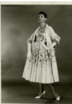
Dress in White Taffeta with Mauve and Pink Flowers and Matching Coat (KA0018_000001)