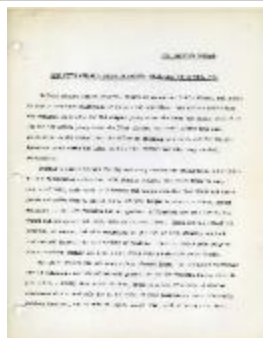
Saks Fifth Avenue's Exclusive Safinia Collection for Summer, 1965 (KA0018_binder52_01)