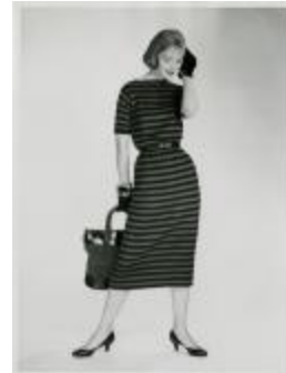
Black and Tyrolean Green Striped Dress (KA0018_000020)