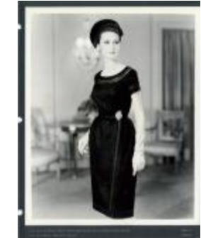
Black Wool Dress with Grosgrain Braid Insert Detailing in Crepe (KA0018_binder15_02)