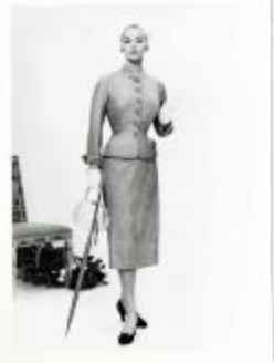
Black and White Pesante Ensemble (KA0018_binder03_01)