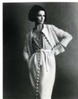
Diagonal Wool Twill Suit (KA0018_binder51_07)