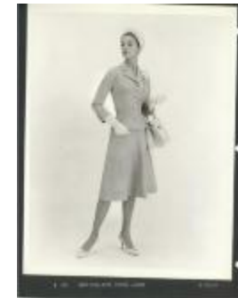
Grey Wool Suit with Fitted Jacket (KA0018_binder11_01)