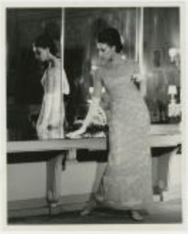
Evening Gown of Yellow Chiffon (KA0018_000045)