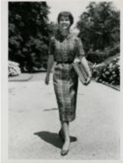
One-Piece Tartan Dress in Sheer Wool (KA0018_000015)