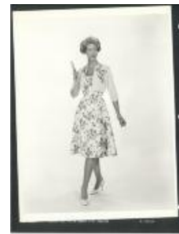
Yellow and White Dress with Sweater (KA0018_binder11_06)