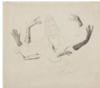
Assortment of Women's Gloves on Multi-Armed Deity Figure (KA011201_kOSxx2_f09_03)