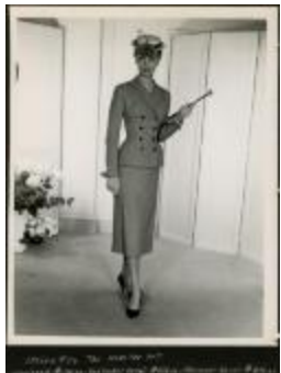
Tan Worsted Suit (KA0018_binder01_02)