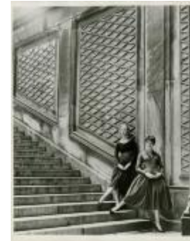
Long-Sleeved Wool Dresses (KA0018_000017)