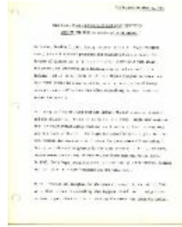
Saks Fifth Avenue Presents an Exclusive Collection Created for Them by Famous Katja of Sweden (KA0018_binder60_01)