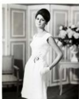
White Pique Dress with Low Square Neckline and Flower at Waist (KA0018_binder16_11)