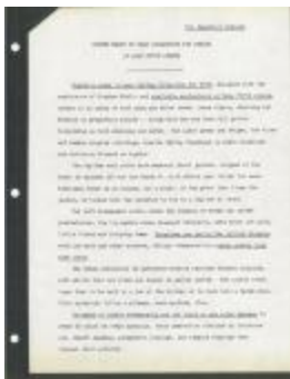
Sophie Ready to Wear Collection for Spring at Saks Fifth Avenue (KA0018_binder11_02)