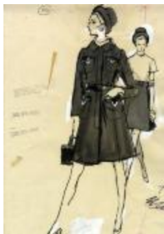
Two Women in Casual Ensembles and Capulet Hats (KA002201_OSxx3_f10_03)