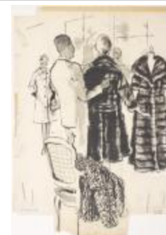
Saks Fifth Avenue Sales Associate and Two Women in Fur Coats (KA002201_OSxxx1_f10_03)