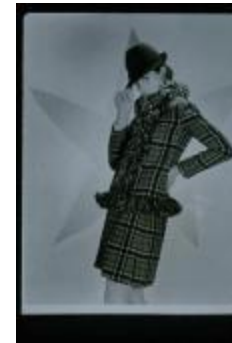
Three-Piece Plaid Suit (KA0018_binder65_02)