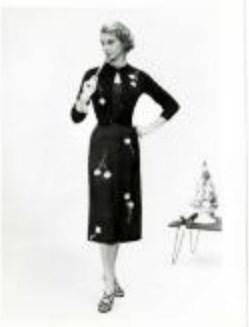
Black Shantung Dress with White Carnation Print and Cashmere Sweater (KA0018_binder03_06)