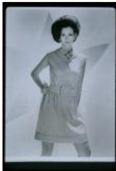
Sleeveless Oyster Jersey Dress (KA0018_binder65_03)