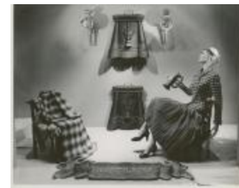
Saks Fifth Avenue Store Window (KA0023_000008)