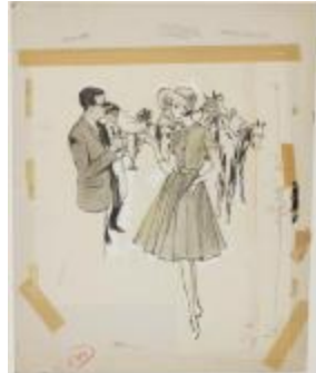
Short-Sleeved Belted Shirtdress with Sunhat (KA008601_OSxx2_f10_01)