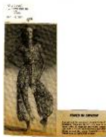
Touch of Sweden (KA0018_binder74_02)