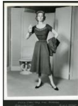
Cadet Grey Wool Ensemble (KA0018_binder02_11)