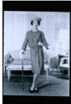
Plaid Women's Suit (KA0018_binder13_01)