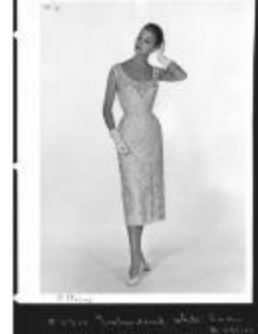
Embroidered White Lace Dress (KA0018_binder05_02)