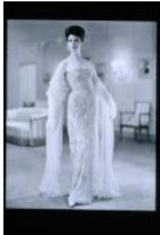
Embellished Evening Dress with Sheer Wrap (KA0018_binder12_02)