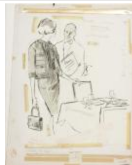
Women's Ensemble with Decorative Bands of Trim (KA008601_OSxxx7_f03_01overlay)