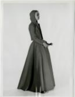
Wool Evening Costume (KA0018_000007)