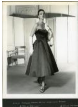
Emerald Green Satin Shantung Dress (KA0018_binder02_10)