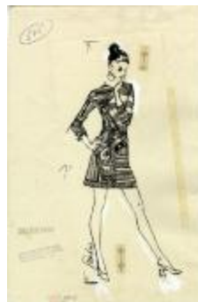
Wrap Dress with All-Over Geometric Print (KA002201_OSxx3_f10_06)