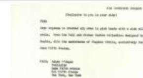
Grey Organza Evening Dress Studded with Pink Beads (KA0018_binder18_01)