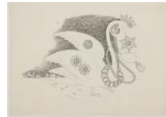
Assorted Jewelry on Stylized Swan (KA011201_kOSxx2_f09_04)