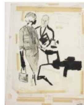
Overlay Featuring Women's Ensemble with Decorative Bands of Trim (KA008601_OSxxx7_f03_01)