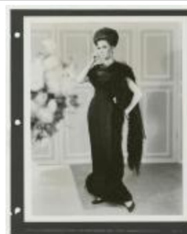
Black Marquiesette Evening Gown with Ostrich Trim (KA0018_000044)