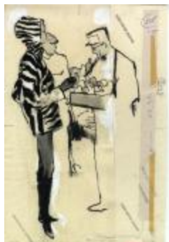
Women's Ensemble Featuring Knee-High Boots and Zebra Striped Coat with Hood (KA002201_OSxx3_f10_05)