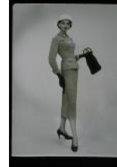
Gray and White Worsteds Suit (KA0018_binder06_01)