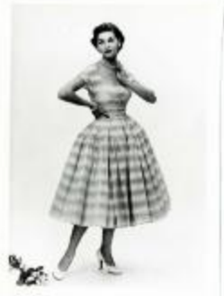
Embroidered Blue and White Gauze Dress (KA0018_binder03_02)