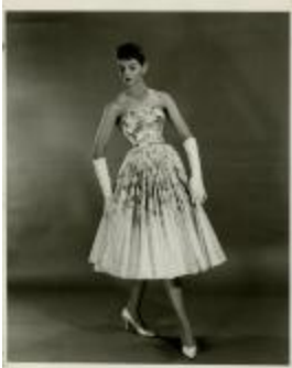
Dress in White Taffeta with Mauve and Pink Flowers and Matching Coat (KA0018_000002)