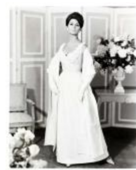
White Pique Evening Gown and Matching Stole with Applique on Bodice of Gown (KA0018_binder16_09)