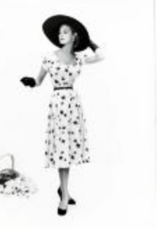
Printed Navy and White Shantung Dress (KA0018_binder03_07)