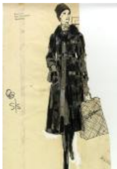
Woman in Long Coat with Saks Fifth Avenue Shopping Bag (KA002201_OSxx3_f10_04)