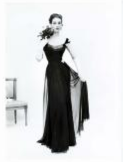
Black Chiffon and Velvet Evening Dress (KA0018_binder03_05)