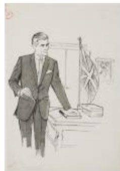
Men's Pinstripe Suit with Narrow Necktie (KA008601_OSxx2_f09_01)