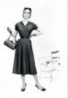
Grey Pesante Shirtdress (KA0018_binder03_03)