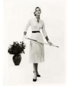
White Faille Dress with Brown Velvet Belt (KA0018_binder03_04)