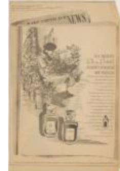
Saks Fifth Avenue Advertisement Featuring Givenchy Perfumes (KA008601_OSx1_f17_01)