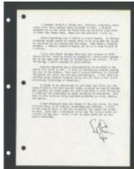
Thoughts on Fashion by Sophie Gimbel (KA0018_binder11_05)