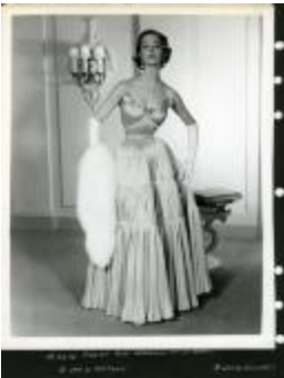
Pleated Rose-Geranium Satin Dress (KA0018_binder02_09)