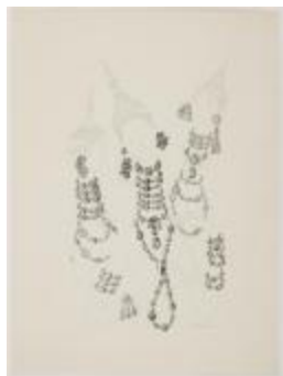
Assorted Jewelry on Figures with Bengali Tops (KA011201_kOSxx2_f09_05)