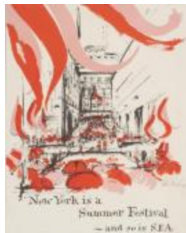
"New York is a Summer Festival" (KA008601_OSx1_f19_01)