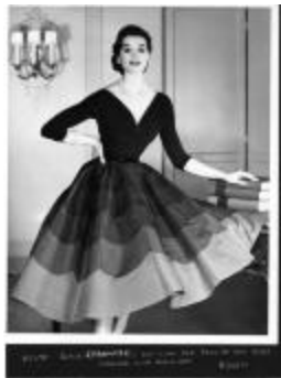
Black Cashmere Top and Red Peau de Soie Skirt (KA0018_binder04_03)