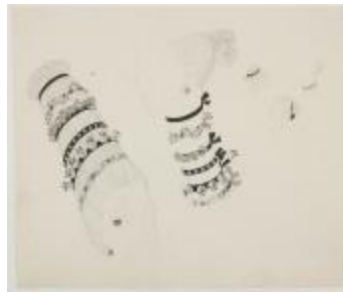
Embellished Hairbands and Necklaces (KA011201_kOSxx2_f09_02)