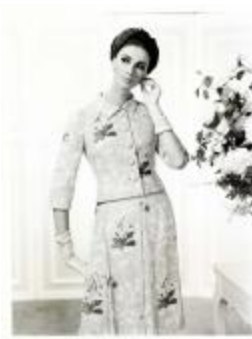
Aqua Printed Spun Linen Suit with Blouse (KA0018_binder16_08)