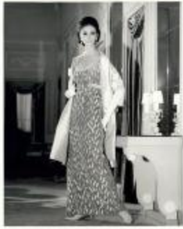
Grey Organza Evening Dress Studded with Pink Beads (KA0018_binder18_02)