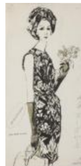
Patterned Sheath Dress with Matching Turban (KA008601_OSxx2_f08_01)