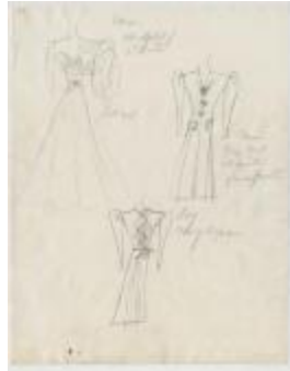
Set of Three Sketches Depicting a Black Evening Dress, Navy Crepe Dress, and Blue Coat with Painted Flower Buttons