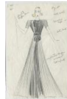
Black Satin Evening Dress with Pleated Chiffon Overskirt and Sleeves (KA0039_V8p43-005)