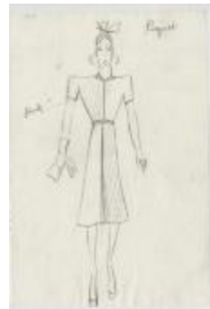
Short-Sleeved Two-Toned Dress (KA0039_V8p33-005)