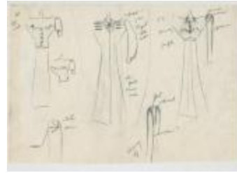
Set of Six Sketches Depicting Three Dresses and Partial Sleeve and Bodice Details (KA0039_V8p54-005)