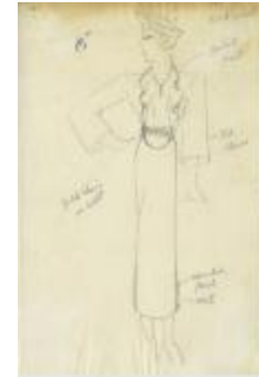
Black Wool Dress with Long Jabot Collar and Gold Chain Belt (KA0039_V9p64-002)