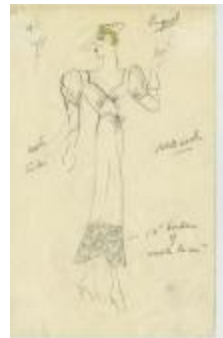
Black Wool Dress with Lace Border (KA0039_V9p38-002)