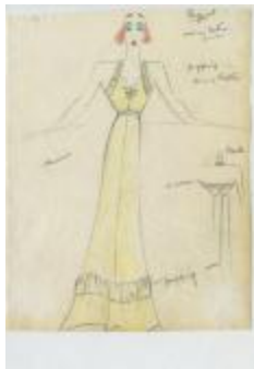
Ivory Satin Evening Dress with Bands of Puffing (KA0039_V9p35-009)