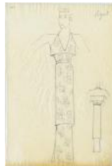
Printed Tunic Evening Dress with Halter Neckline (KA0039_V9p62-009)