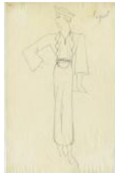
Calf-Length Dress with Long Jabot Collar and Chain Belt (KA0039_V9p62-003)