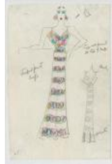
Crepe Evening Dress with Printed Stripes and Bodice (KA0039_V9p05-004)