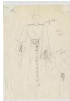
Blue Crêpe Military Inspired Women's Ensemble (KA0039_V8p38-002)