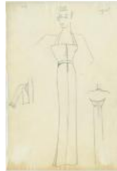
Evening Dress with Halter Strap and Matching Jacket (KA0039_V9p63-007)