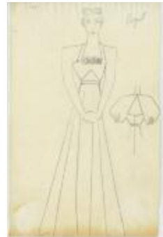
Evening Dress with Floral Embellishments and Matching Shrug (KA0039_V9p64-009)