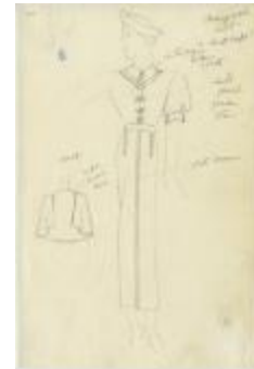
Short-Sleeved Navy Wool Dress with White Pearl Star Embellishments and Matching Cape (KA0039_V9p65-006)