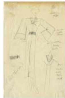
Brown CrÃape Dress with Beige Wood Beaded Girdle (KA0039_V9p26-003)