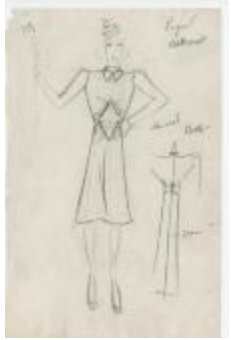
Collared Black Wool Dress with Diamond Shaped Center (KA0039_V8p05-005)