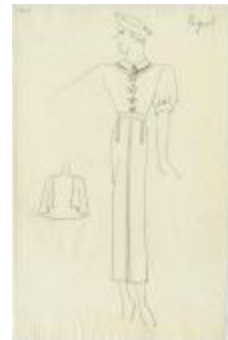
Short-Sleeved Dress with Star Embellishments and Matching Cape (KA0039_V9p62-005)