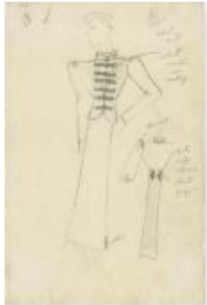
Women's Wool Suit with White Crepe Blouse and Velvet Accents (KA0039_V9p70-005)