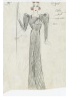
Long-Sleeved Black Velvet Evening Dress with Lace Accents (KA0039_V8p10-009)