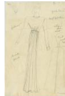
Gold Lamé Evening Dress with Antique Gold Belt and Rust Wool Cape (KA0039_V9p40-006)