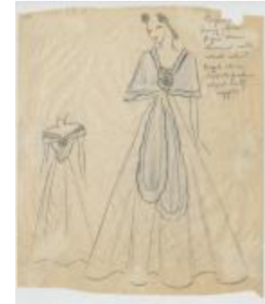
Heavy White Piqué Dress with Royal Blue Taffeta Shawl (KA0039_V8p73-004)