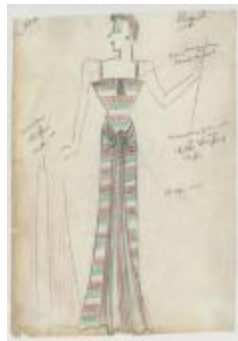
Maroon, Green, and White Striped Crepe Evening Dress with Maroon Chiffon Cape (KA0039_V9p16-007)