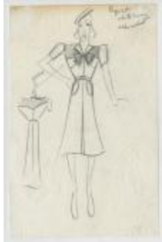
White Linen Dress with Black Velvet Yoke and Bow (KA0039_V9p03-002)