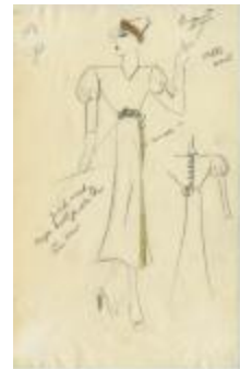
Black Wool Dress with Gold Mesh Accents (KA0039_V9p38-004)