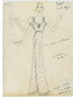
Sheer White Evening Dress with Silver Nailhead Embellishments (KA0039_V9p54-008)