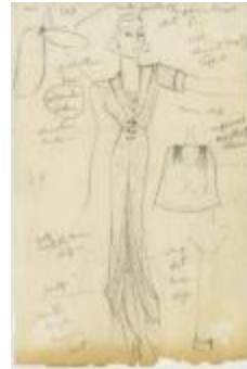
Black Shirred Taffeta Women's Ensemble with Chantilly Lace Slip (KA0039_V9p70-009)