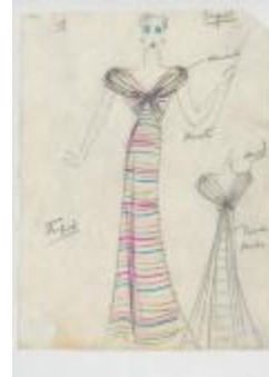
Multicolor Striped Evening Dress (KA0039_V9p19-008)