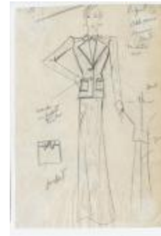
Women's Black Moiré Dinner Suit (KA0039_V8p01-006)