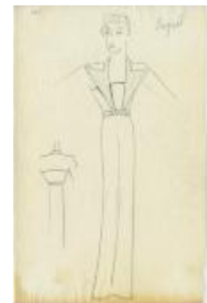
Floor-Length Evening Dress with Notched Lapel (KA0039_V9p67-009)