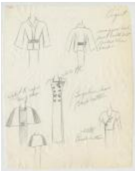
Set of Six Sketches Depicting a Coat, Cape, and Dresses (KA0039_V8p67-004)