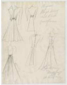
Set of Five Sketches Depicting Beige and Black Linen Dresses (KA0039_V8p53-001)