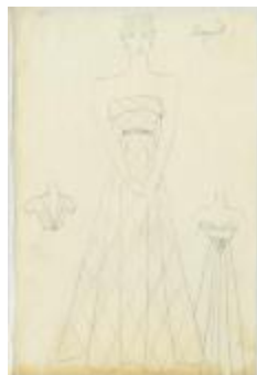
Plaid Evening Dress with Cuffed Bodice and Jacket (KA0039_V9p65-008)