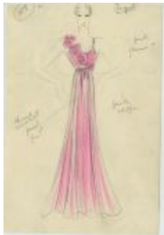
Pink Chiffon Evening Dress with Large Pink Flowers (KA0039_V9p56-005)