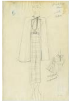
Plaid CrÃ¢pe Dress with Pleated Sleeves and Wool Cape (KA0039_V9p63-003)