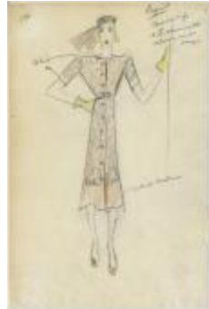
Brown CrÃpe Dress with White Vermicelli Embroidery (KA0039_V9p48-001)