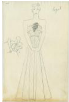
Plaid Evening Dress with Cuffed Bodice and Floral Embellishment (KA0039_V9p64-008)