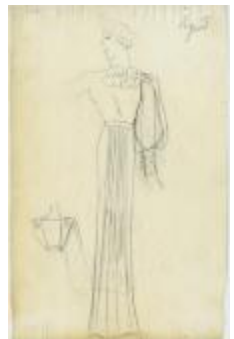
Evening Dress with Floral Embellishments and Long Puffed Sleeves (KA0039_V9p62-007)