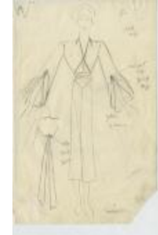
Black Crepe Dress with Gold Clips and Gathered Sleeve Details (KA0039_V9p28-005)