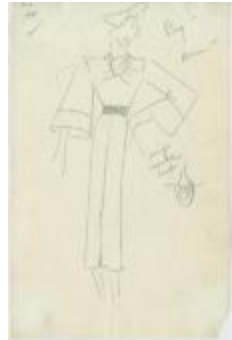
Brown Dress with Bell Sleeves and Beige Wood Beaded Girdle (KA0039_V9p70-006)