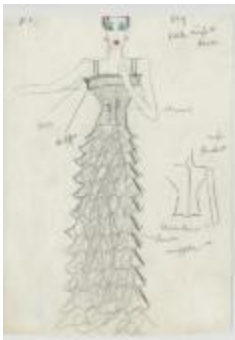
Black Crêpe and Lace Evening Dress with Ruffled Skirt and Matching Jacket (KA0039_V8p12-008)