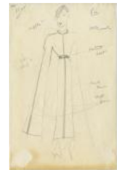
Women's Black Wool Cape Ensemble with Ruffle Collar (KA0039_V9p68-008)