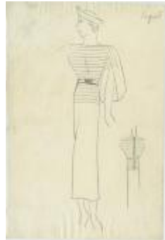
Women's Ensemble with Striped Top and Looped Sleeves (KA0039_V9p63-005)