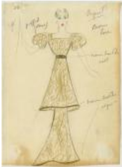
Brown Lace Tunic Dress with Leather Accents (KA0039_V9p43-009)