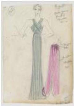
Jade Green Pleated Chiffon Evening Dress with Purple Chiffon Cape (KA0039_V9p15-009)