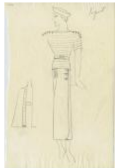
Women's Ensemble with Striped Top and Wrapped Skirt (KA0039_V9p62-006)