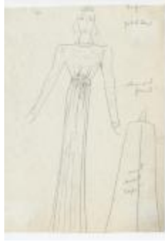
Gold Lamé Evening Dress with Embellished Belt and Rust Wool Cape (KA0039_V8p07-009)