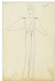
Floor-Length Dress with Batwing Sleeves (KA0039_V9p65-009)