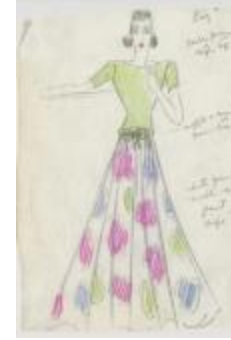
Women's Evening Ensemble with Jade Green Crêpe Top and Multicolored Crêpe Skirt (KA0039_V8p12-007)