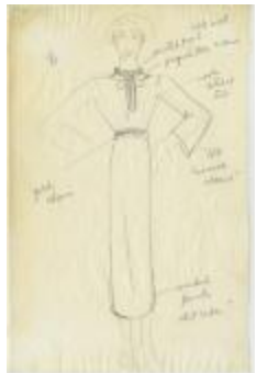
Black Wool Dress with Pleated PiquÃ Accents and Gold Chain Belt (KA0039_V9p62-001)