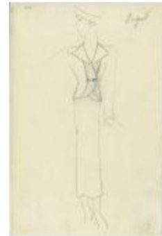
Women's Suit with Contrast Border (KA0039_V9p65-004)