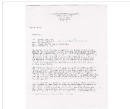
Memorandum from Sam Beck to BA/BFA Committee (NS010302_000003)