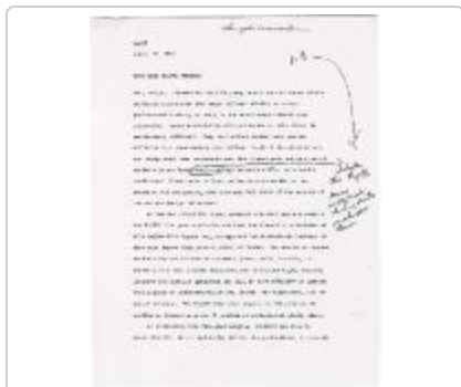
Five-Year BA/BFA Program Draft Copy (NS010302_000001)