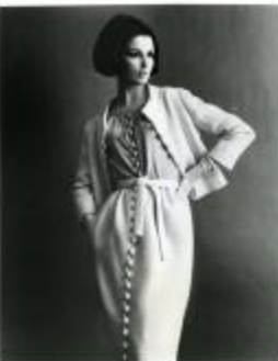
Diagonal Wool Twill Suit (KA0018_binder51_07)