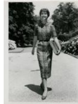
One-Piece Tartan Dress in Sheer Wool (KA0018_000015)