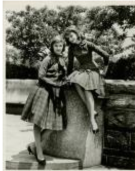
Two Young Dresses (KA0018_000013)