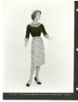
White, Pink and Green Silk Print Dress with Grey Sweater (KA0018_binder11_07)