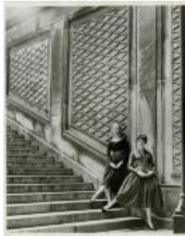
Long-Sleeved Wool Dresses (KA0018_000017)