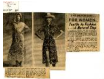
Textile to Fashion - A Natural Step (KA0018_binder74_01)