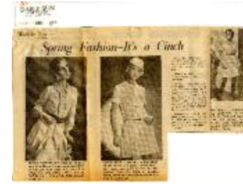
Spring Fashion - It's a Cinch (KA0018_binder66_02)