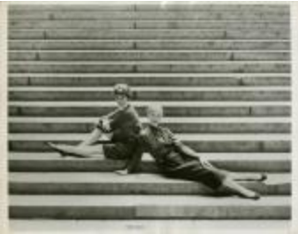
Two Popular College Fashions (KA0018_000016)