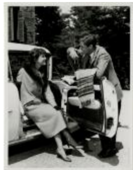
Double Greatcoat in Chamois Yellow Tweed with a Raccoon Collar (KA0018_000006)