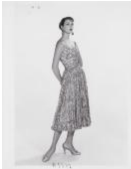
Embroidered Multi Color Chiffon (KA0018_000032)