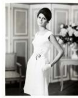
White Pique Dress with Low Square Neckline and Flower at Waist (KA0018_binder16_11)