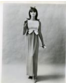
Silk Chiffon Dress (KA0018_binder52_02)