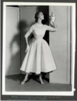
Embroidered White Peau de Soie Dress with Cashmere Sweater (KA0018_binder02_01b)