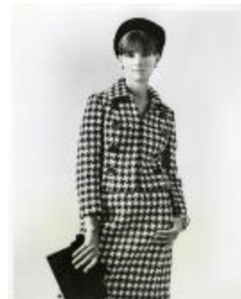
Black and White Houndstooth Tweed Suit (KA0018_binder52_04)