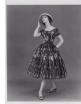
Anne Fogarty Dress with Poppies and Mushroom Hat (KA0018_000028)