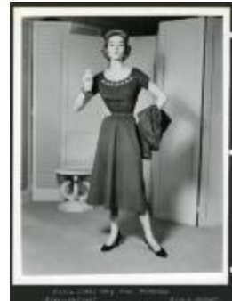
Cadet Grey Wool Ensemble (KA0018_binder02_11)