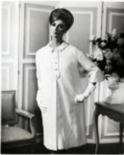
White Matelasse Dress with Bateau Neckline and Straight Coat (KA0018_binder16_12)