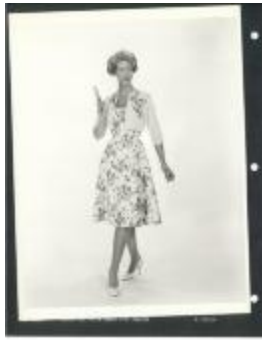
Yellow and White Dress with Sweater (KA0018_binder11_06)