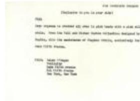
Grey Organza Evening Dress Studded with Pink Beads (KA0018_binder18_01)