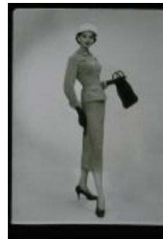
Gray and White Worsted Suit (KA0018_binder06_01)