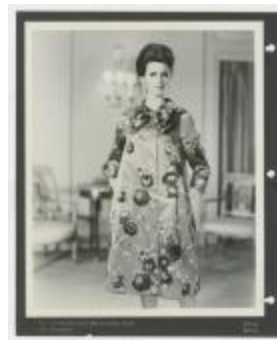
Cut Velvet Coat and Matching Dress (KA0018_000043)