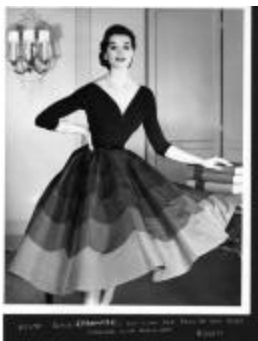
Black Cashmere Top and Red Peau de Soie Skirt (KA0018_binder04_03)