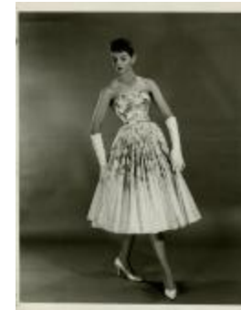
Dress in White Taffeta with Mauve and Pink Flowers and Matching Coat (KA0018_000002)