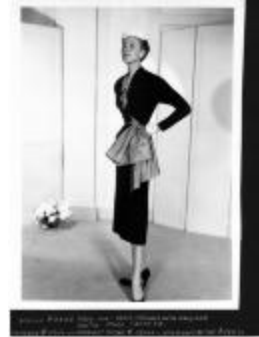
Navy Wool Dress Trimmed with Navy and White Plaid Taffeta (KA0018_binder02_03)