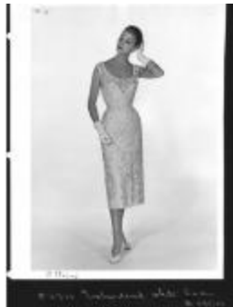
Embroidered White Lace Dress (KA0018_binder05_02)