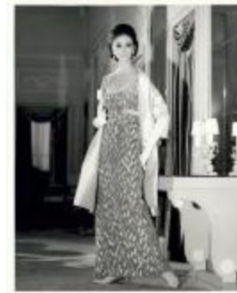
Grey Organza Evening Dress Studded with Pink Beads (KA0018_binder18_02)