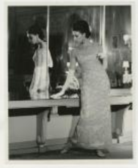
Evening Gown of Yellow Chiffon (KA0018_000045)