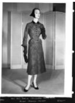
Red and Black Jacquard Dress with Velvet Trimmed Jacket (KA0018_binder04_04)