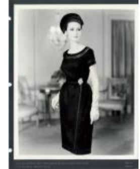
Black Wool Dress with Grosgrain Braid Insert Detailing in Crepe (KA0018_binder15_02)