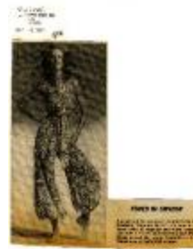
Touch of Sweden (KA0018_binder74_02)