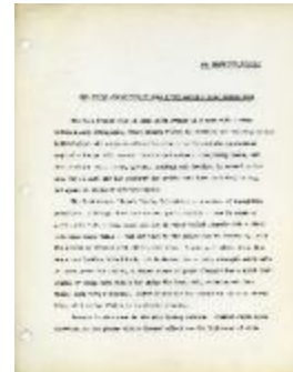
The Spring Collection of Saks Fifth Avenue's Park Avenue Room (KA0018_binder51_06)