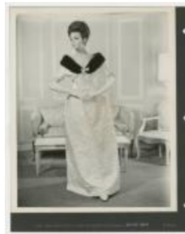
White Brocade Ball Gown and Jacket Collared in Russian Sable (KA0018_000038)