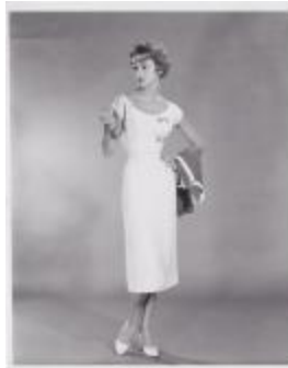
Eggshell Peau de Soie Dressed Trimmed with Pink Roses (KA0018_000034)