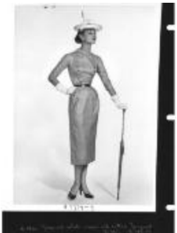
Grey and White Rayon and Cotton Jacquard Dress (KA0018_binder05_01)