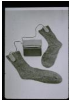
Heated Socks (KA0018_binderXX_02)