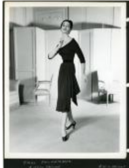
Black Crepe Dress (KA0018_binder02_07)