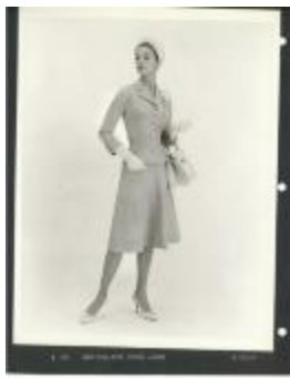
Grey Wool Suit with Fitted Jacket (KA0018_binder11_01)