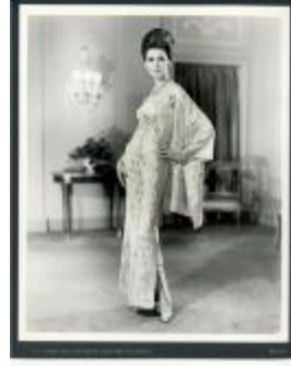
Long Gold and White Sari Gown and Stole (KA0018_binder15_01)