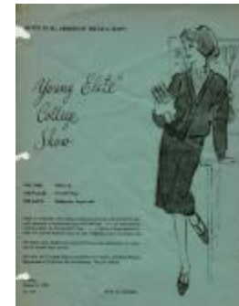
Young Elite College Show Announcement for Saks Fifth Avenue Staff (KA0018_000003)