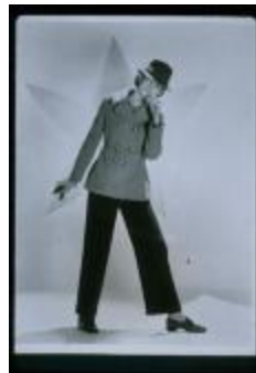
Grey Flannel Slacks, Polka Dotted Blouse, and Double-Breasted Melton Wool Jacket (KA0018_binder65_01)