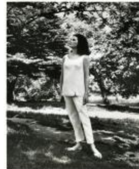
Bathing Suit Overblouse and Slacks (KA0018_binder51_04)