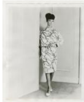
Suit with Cherry Blossom Print (KA0018_000039)