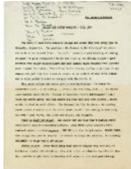
College and Career Fashions - Fall 1956 (KA0018_000005)