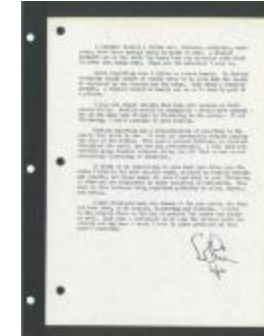
Thoughts on Fashion by Sophie Gimbel (KA0018_binder11_05)