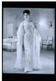
Embellished Evening Dress with Sheer Wrap (KA0018_binder12_02)