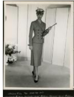
Tan Worsted Suit (KA0018_binder01_02)