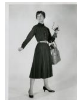
Charcoal Grey Flannel Shirt Dress (KA0018_000022)