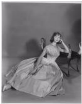
Chartreuse Embroidered Evening Gown with Crystal and Gold Necklace by Anne Fogarty (KA0018_000029)