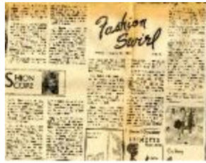
Color, Coordination in Katja collection (KA0018_binder66_03)