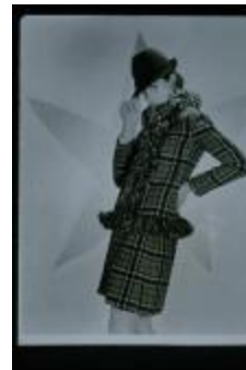
Three-Piece Plaid Suit (KA0018_binder65_02)