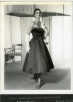
Emerald Green Satin Shantung Dress (KA0018_binder02_10)