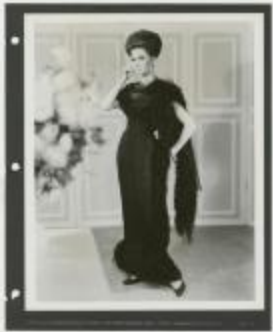
Black Marquisette Evening Gown with Ostrich Trim (KA0018_000044)