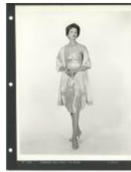
Strapless Sari Dress with Stole (KA0018_binder11_03)