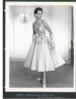
Embroidered Pink Satin Evening Dress (KA0018_binder02_02b)