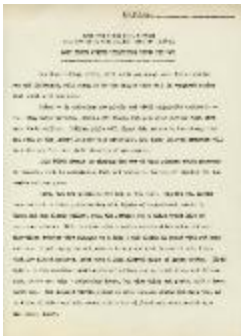
American Girls Will Pioneer New Styles in the College Year of 1958-59: Saks Fifth Avenue Collection Shows the Way