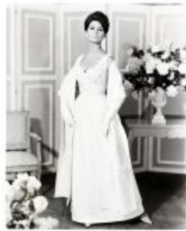
White Pique Evening Gown and Matching Stole with Applique on Bodice of Gown (KA0018_binder16_09)