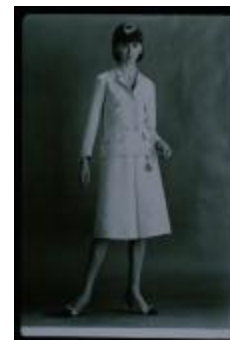
Women's Ribbed Silk Suit with Double- Breasted Jacket (KA0018_binderXX_01)