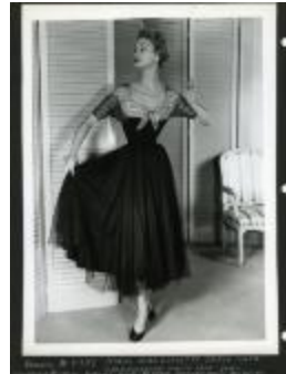
Black Marquisette Dress with Embroidered White Lace Yoke (KA0018_binder01_01)