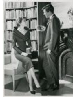
Long-Sleeved Wool Dress with Fichu Neckline and Cummerbund (KA0018_000018)