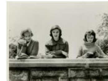
Various Knit Sweaters (KA0018_000011)