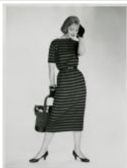
Black and Tyrolean Green Striped Dress (KA0018_000020)