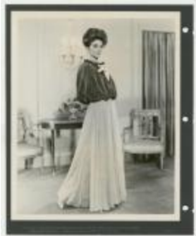
Deep Turquoise Mushroom Pleated Velvet Balloon Cape with Ombre Marquisette Dress (KA0018_000041)