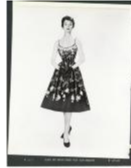
Black Net Dress Embroidered with Blue Sequins (KA0018_binder10_01)