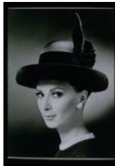
Black Bali Straw Sailor Hat with Velvet Band (KA0018_binder43_01)