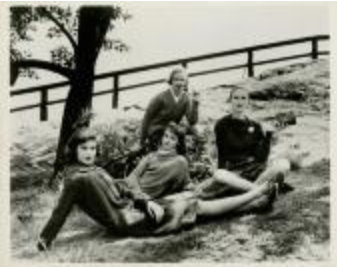
Various Sweater Ensembles (KA0018_000012)