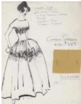
Chartreuse Embroidered Evening Gown with Crystal and Gold Necklace by Anne Fogarty (KA0018_000030)