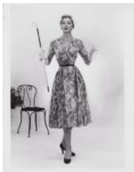
Printed White, Black, Green Crepe (KA0018_000031)