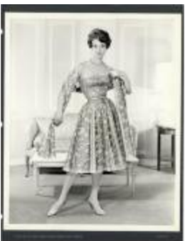
Blue and Gold Sari Dress and Stole (KA0018_binder12_01)