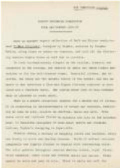
Sophie Originals Collection Fall and Winter 1954-55 (KA0018_binder02_06)