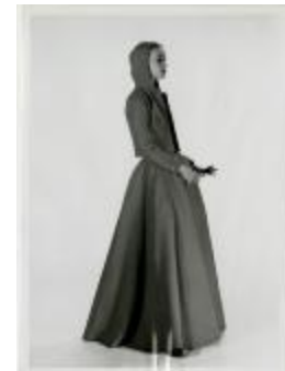
Wool Evening Costume (KA0018_000007)