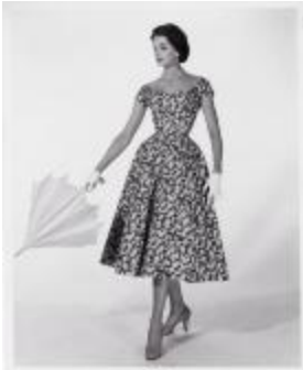
Dress of Pink and Green Flower-printed Silk Shantung (KA0018_000033)