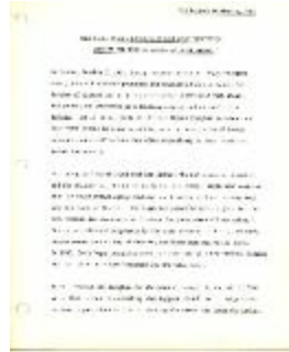
Saks Fifth Avenue Presents an Exclusive Collection Created for Them by Famous Katja of Sweden (KA0018_binder60_01)