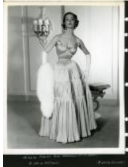
Pleated Rose-Geranium Satin Dress (KA0018_binder02_09)