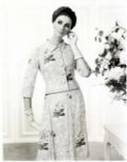
Aqua Printed Spun Linen Suit with Blouse (KA0018_binder16_08)