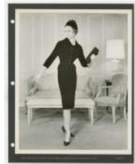
Black Cut Velvet Suit, White Satin-Pleated Blouse and Cuffs (KA0018_000040)