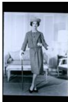
Plaid Women's Suit (KA0018_binder13_01)