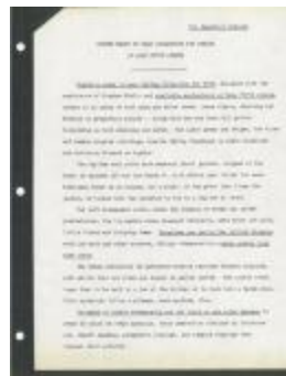
Sophie Ready to Wear Collection for Spring at Saks Fifth Avenue (KA0018_binder11_02)