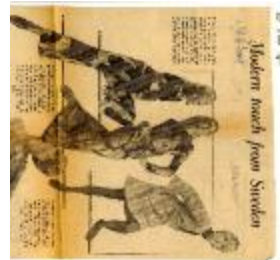
Modern Touch from Sweden (KA0018_binder60_03)