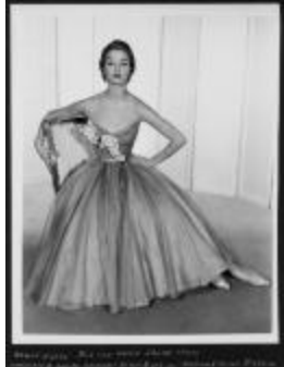
Blue and Green Gauze Dress (KA0018_000026)