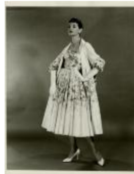
Dress in White Taffeta with Mauve and Pink Flowers and Matching Coat (KA0018_000001)