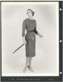
Grey Chiffon Flannel Dress with Pique Trim (KA0018_binder11_04)