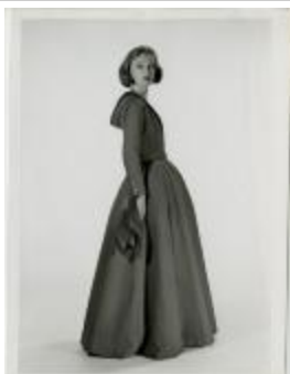
Wool Evening Costume (KA0018_000008)