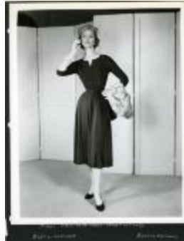
Black Crepe Dress - Velvet Cut-Outs (KA0018_binder02_08)