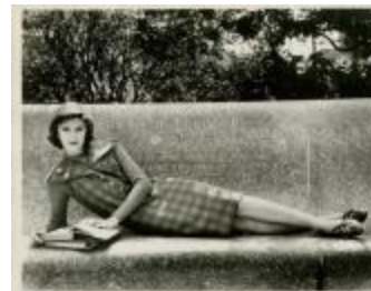
Chemise Jumper of Red and Saffron Checked Wool (KA0018_000010)