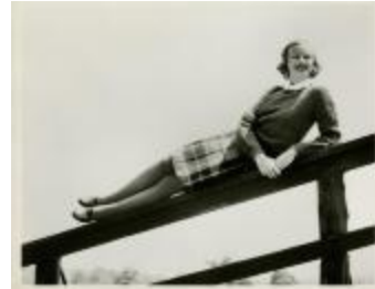
Blue Mohair Pull Over with Plaid Blanket Wool Skirt (KA0018_000014)