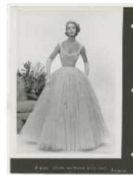
Pleated White Net with Lace (KA0018_000037)