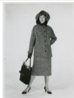
Black and White Tweed Business Suit (KA0018_000021)