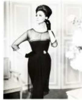
Black Marquisette Dress with Tunic Skirt and Satin Ball Trim (KA0018_binder16_10)