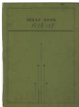
Press clippings 17: 1938-1939 (NS030101_PC_017)