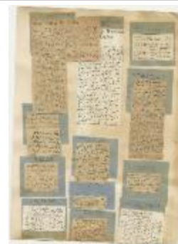
Press clippings 15: 1937-1938 (NS030101_PC_015)