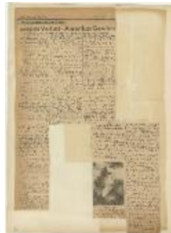
Press clippings 26: 1944-1945 (NS030101_PC_26)