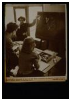
Clipping showing advertising art class, "Future Fashion Leaders," Buffalo Courier- Express, 13 November 1949.