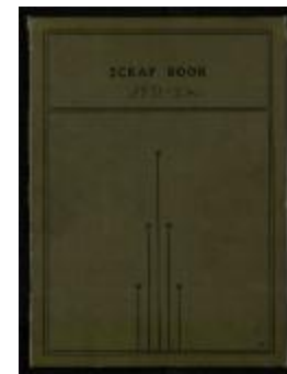
Press clippings 5: 1931-1932 (NS030101_PC_05_OCR)