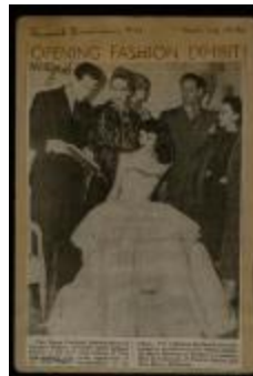
Opening Fashion Exhibit. November 28 1940. (PIC03002SB_vol1_64)