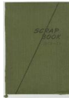
Press clippings 36: 1952-1953 (NS030101_PC_036)