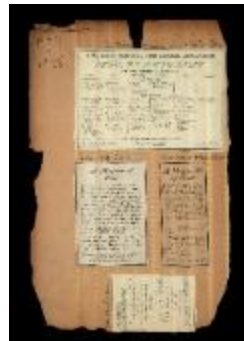
Press clippings 3: 1927-1931 May, 1940-1941 (NS030101_PC_03_OCR)