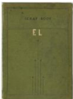
Press clippings 22: 1941-1956 (NS030101_PC_022)