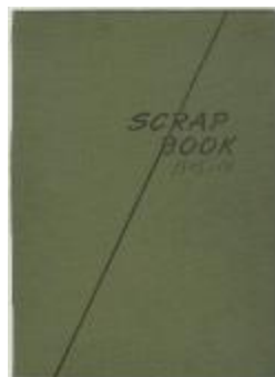
Press clippings 32: 1949 (NS030101_PC_032)