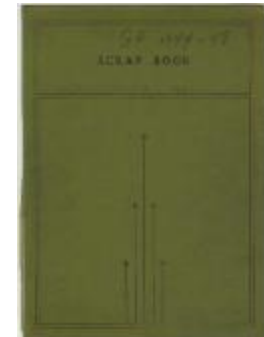
Press Clippings 27: 1944 - 1949 (NS030101_PC_027)