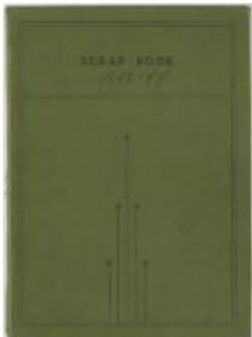
Press clippings 24: 1943-1944 (NS030101_PC_024)