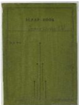
Dramatic Workshop and Studio Theatre Scrapbook IV, Part 1 (NS030105_DW_0401)