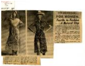
Textile to Fashion - A Natural Step (KA0018_binder74_01)