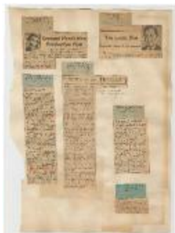
Dramatic Workshop and Studio Theatre Scrapbook IV, Part 2 (NS030105_DW_0402)