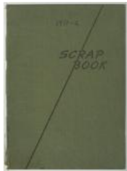
Press clippings 35: 1951-1952 (NS030101_PC_035)