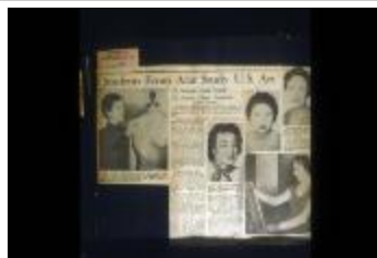
"Students From Afar Study U.S. Art," U.S. Telegram article (PIC03002SB_vol3_28)