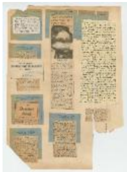
Dramatic Workshop and Studio Theatre Scrapbook I, Part 2 (NS030105_DW_0102)