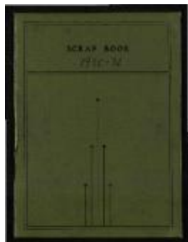
Press clippings 11: 1935-1936 (NS030101_PC_011_OCR)