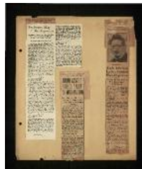
Press clippings 9: 1930-1936, 1939 (NS030101_PC_09_01_OCR)