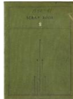
Press clippings 20: 1940 - 1942 June (NS030101_PC_020)