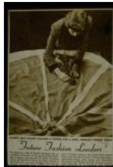
Clipping showing student sewing, "Future Fashion Leaders," Buffalo Courier-Express, 13 November 1949.