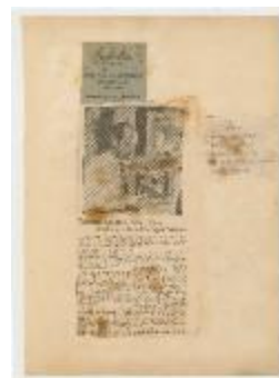
Dramatic Workshop and Studio Theatre Scrapbook II, Part 2 (NS030105_DW_0202)