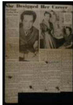
Clipping about Claire McCardell, "She Designed Her Career," NY World-Telegram, 3 August 1949. (PIC03002SB_vol2_53)