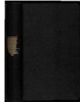
Promotions 3: 1943-1944 (NS030101_Promo_03_OCR)