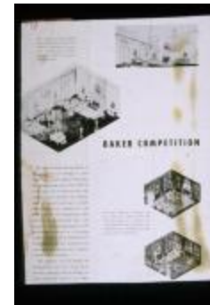
Clipping about entries for Baker Competition, in which students designed the living-dining area of an existing house