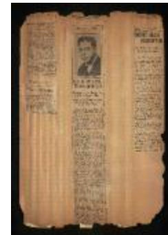
Press clippings 4: 1927-1931 Apr, 1933, 1935, 1939 (NS030101_PC_04_OCR)