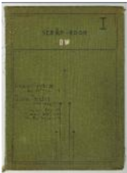
Dramatic Workshop and Studio Theatre Scrapbook I, Part 1 (NS030105_DW_0101)