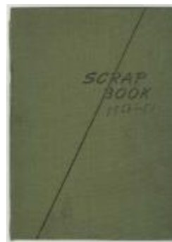
Press clippings 34: 1950-1951 (NS030101_PC_034)