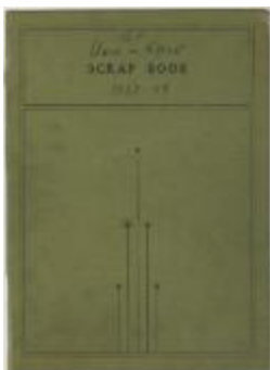
Press clippings 16: 1937-1939 (NS030101_PC_016)