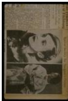
Spurns Society for Designer Career March 6 1934 (PIC03002SB_vol1_104)