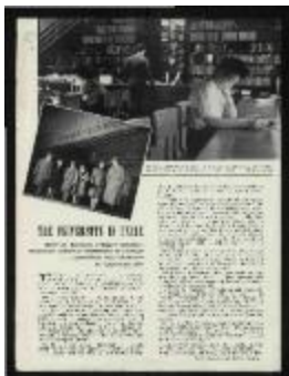
Press clippings: Additional Articles: 1931-1943 (NS030101_PC_Additional_Article)