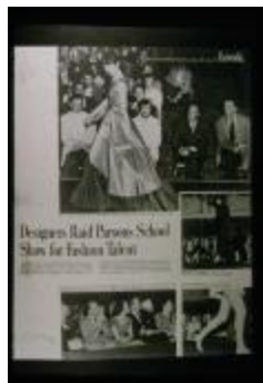
Clipping about Parsons Fashion Show, "Designers raid Parsons School Show for Fashion Talent," Look, 8 November