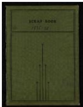
Press clippings 10: 1935-1936 (NS030101_PC_010_OCR)