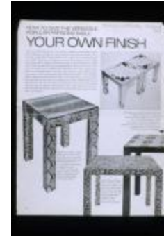
How to Give the Versatile Popular Parsons Table Your Own Finish (PIC03002SB_vol10_33)