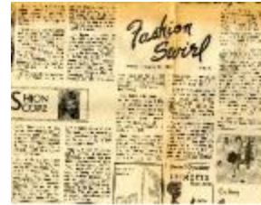
Color, Coordination in Katja collection (KA0018_binder66_03)