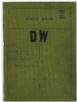
Dramatic Workshop and Studio Theatre Scrapbook III, Part 1 (NS030105_DW_0301)