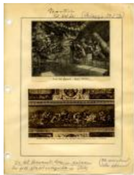
Scrapbook Page on the Palazzo del Te, Mantua (KA0063_b01_f06_01)