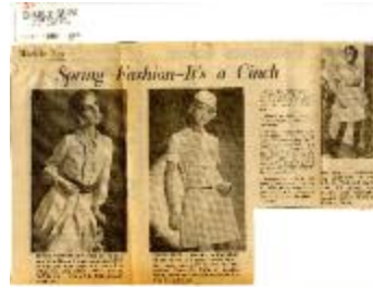
Spring Fashion - It's a Cinch (KA0018_binder66_02)