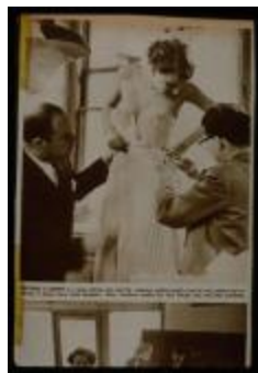
Clipping showing gown fitting from "Future Fashion Leaders," Buffalo Courier-Express, 13 November 1949.