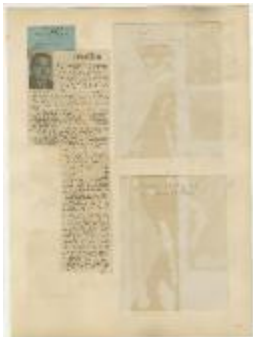
Press clippings 25: 1943-1944 (NS030101_PC_25)