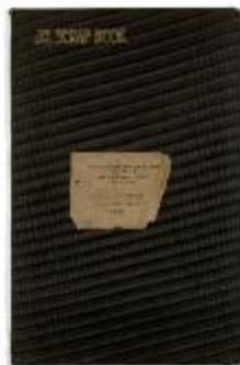
Press clippings 2: 1926-1927 (NS030101_PC_02_OCR)