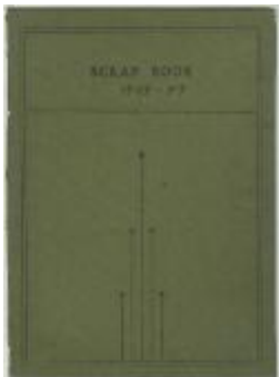
Press clippings 31: 1948-1949 (NS030101_PC_031)