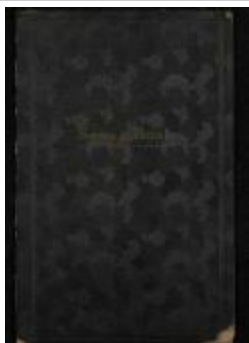
Press clippings 13: 1935 Feb-1937 Jun (NS030101_PC_13-01_OCR)