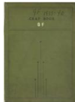
Press clippings 19: 1939-1941 (NS030101_PC_019)