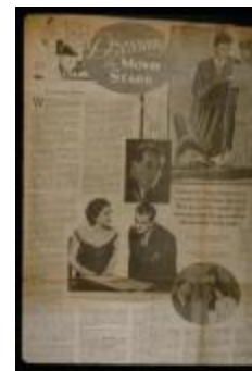
Dressing the Movie Stars (PIC03002SB_vol1_123)