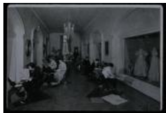
Students Study Costumes (PIC03002SB_vol1_40_02)