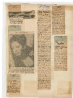
Dramatic Workshop and Studio Theatre Scrapbook IV, Part 3 (NS030105_DW_0403)