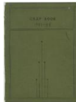
Press clippings 30: 1947-1948 (NS030101_PC_030)