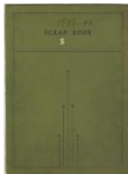
Press clippings 18: 1939-1942 (NS030101_PC_018)