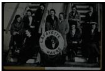
Students Aboard MS Lafayette (PIC03002SB_vol1_40_01)