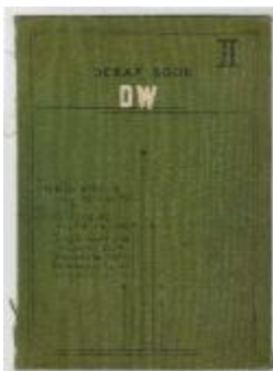
Dramatic Workshop and Studio Theatre Scrapbook II, Part 1 (NS030105_DW_0201)