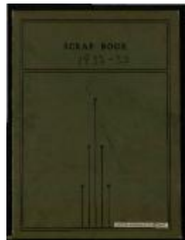
Press clippings 7: 1931 Aug, 1932 Sep-1933 Apr (NS030101_PC_07_OCR)