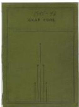
Press clippings 28: 1945-1946 (NS030101_PC_028)