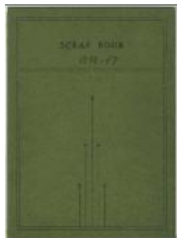
Press clippings 29: 1945-1947 (NS030101_PC_029)