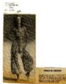
Touch of Sweden (KA0018_binder74_02)