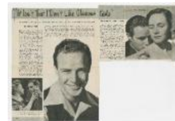
Dramatic Workshop and Studio Theatre Scrapbook IV, Part 4 (NS030105_DW_0404)