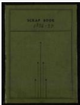
Press clippings 14: 1936-1937 (NS030101_PC_014_OCR)