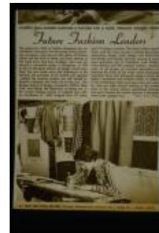
Clipping showing student at drawing board, "Future Fashion Leaders," Buffalo Courier- Express, 13 November 1949.