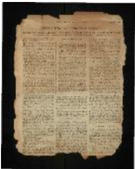
Press clippings 1: 1918-1935 May, 1939 (NS030101_PC_01_OCR)