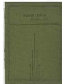
Press clippings 33: 1949 (NS030101_PC_033)