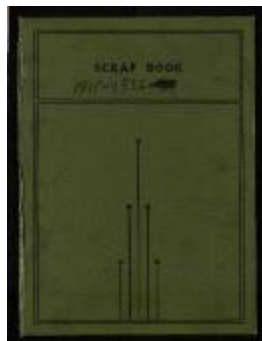
Press clippings 12: 1935-1936 (NS030101_PC_012_OCR)