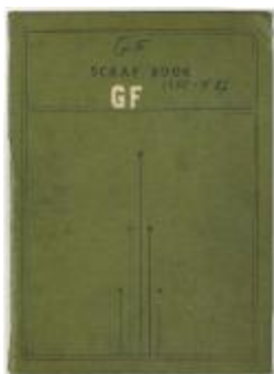
Press clippings 21: 1941-1944 (NS030101_PC_021)