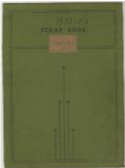
Press clippings 23: 1942-1943 (NS030101_PC_023)