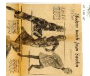
Modern Touch from Sweden (KA0018_binder60_03)