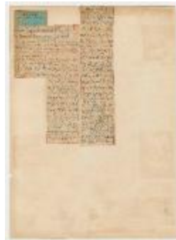
Dramatic Workshop and Studio Theatre Scrapbook III, Part 2 (NS030105_DW_0302)