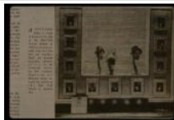
"He Sets Fashions in Shop Windows," June 17, 1936. (PIC03002SB_vol1_57)