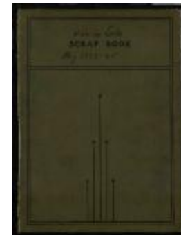
Press clippings 8: 1933-1935 (NS030101_PC_08_OCR)