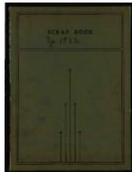
Press clippings 6: 1932 (NS030101_PC_06_OCR)