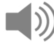
William Phillips Lecture by Norman Manea (2014NS37_D001)