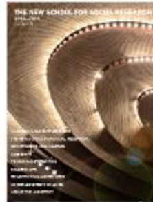
New School for Social Research 2014- 2015 (NS050101_gf2014ye)