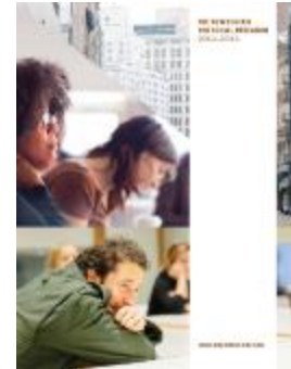
New School for Social Research 2012- 2013 Vol. 70 No. 2 (NS050101_gf2012ye)