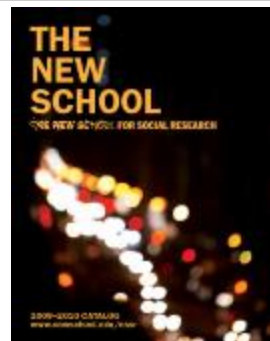
New School for Social Research 2009- 2010 Vol. 67 No. 2 (NS050101_gf2009ye)