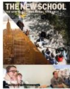
New School for Social Research 2011- 2012 Vol. 69 No. 2 (NS050101_gf2011ye)