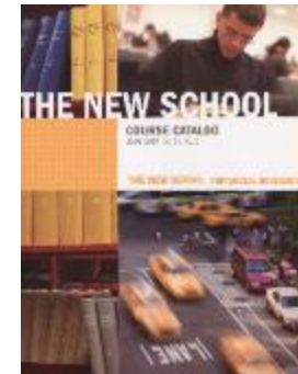
New School for Social Research 2006 - 2007 Vol. 64 No. 2 (NS050101_gf2006ye)