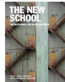
New School for Social Research 2010- 2011 Vol. 68 No. 2 (NS050101_gf2010ye)