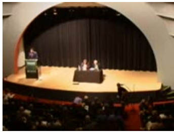
Some Observations on Female Sexuality (NS070206_2014NS23_D002)