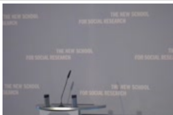
Opening Remarks in Ceremony Bestowing German Chancellor Angela Merkel with an Honorary Degree (2014NS06_D004)