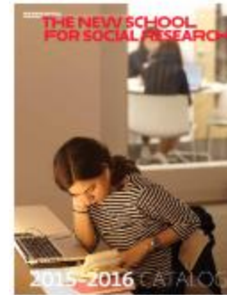
New School for Social Research 2015- 2016 (NS050101_nssr_2015ye_Final)