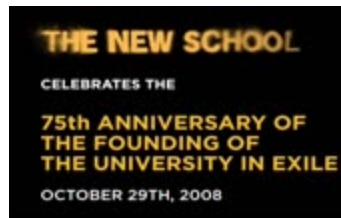
75th Anniversary of the Founding of the University in Exile Slideshow (2014NS06_D001)