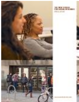
New School for Social Research 2013- 2014 (NS050101_gf2013ye)