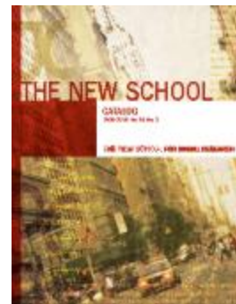
New School for Social Research 2008- 2009 Vol. 65 No. 3 (NS050101_gf2008ye)