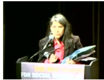
The Parallax of Evil: Jean Baudrillard and Sylvère Lotringer (NS070206_2014NS23_D006)