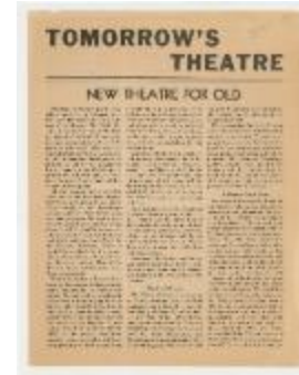
Dramatic Workshop Newspaper - "Tomorrow's Theatre" (NS030105_000293)