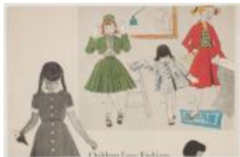
Simplicity Patterns 4581, 4576, and 4451: Girls' Coat and Two Full Ensembles (KA008601_OSx1_f07_09)