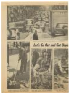
New York Daily News, Page 1 (KA0123_kOSx4_f08_02)