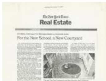
For the New School, a New Courtyard: $2.6 Million, 4,500-Square-Foot Minicampus Doubles as a Community Garden (NS030103_000004)