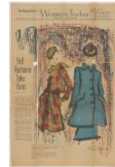
"Fall Fashions Take Form" (KA008601_OSxx1_f06_01)