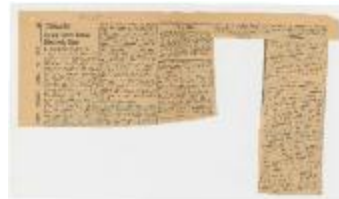
Positive Review of "The Flies" by Jean-Paul Sartre (NS030105_000413)