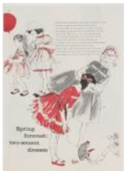
"Spring Forecast: Two-Season Dresses" (KA008601_OSx1_f07_10v)