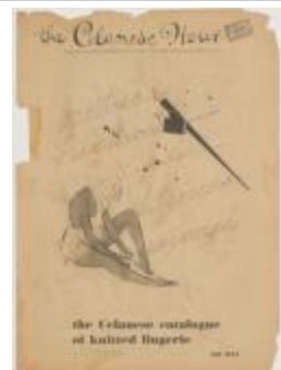
The Celanese Catalogue of Knitted Lingerie (KA008601_OSx1_f04_02)