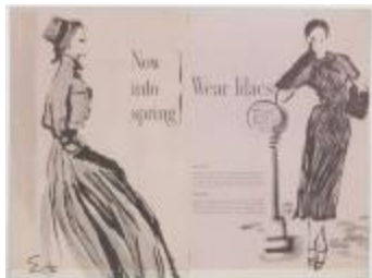
"Now Into Spring: Wear Lilacs" (KA008601_OSx1_f13_18)