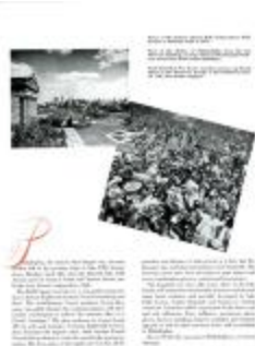
"It's Up to You," Saks News, Vol. 7, No. 2 (Easter 1952) (KA0102_k07_f01_01a)