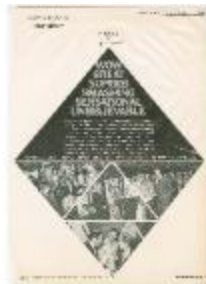
American Viscose Advertisement in Women's Wear Daily (KA0023_000003)