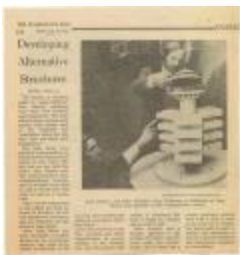
An Infinite Number of Modular Structures (page 2) (KA0123_b01_f07_20)