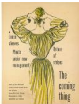
"The Coming Thing" (KA008601_b01_f17_01)