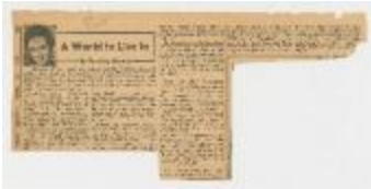
Article Detailing Erwin Piscator Daring Production of "The Flies" (NS030105_000411)