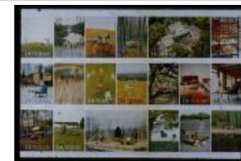
Dunbar Catalog Covers (KA0048_b01_f15_s06)