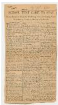
Dramatic Workshop Celebrates 10th Anniversary, Hopes to Become a University (NS030105_000285)