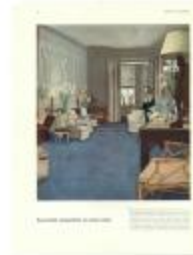
Ugly Duckling Becomes Swan (PIC03002_OSx3_f05_01)