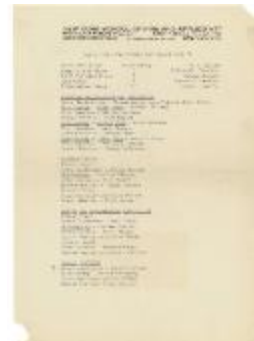
List of Honors and Scholarships to the New York School of Fine and Applied Art for 1915-1916 (KA0057_k5_f15_01)