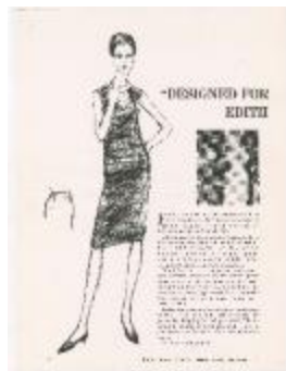
Designed for Stretch by Edith d'Errealde (KA0023_000005)