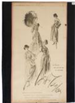
For the girl who got the sun for Christmas (KA0045_OSxx2_f01_01)