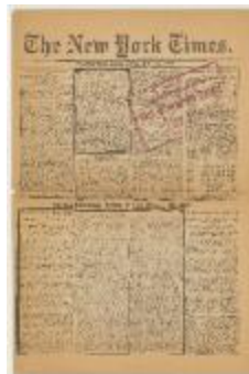
Various Reproduced Clippings from The New York Times, Ranging from 1882-1883, with a Stamp Advertising a Dramatic