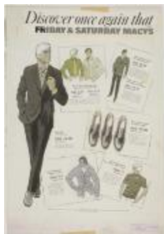
Assortment of Men's Suits, Shirts, Jackets, and Shoes (KA008601_OSxxx3_f03_01)