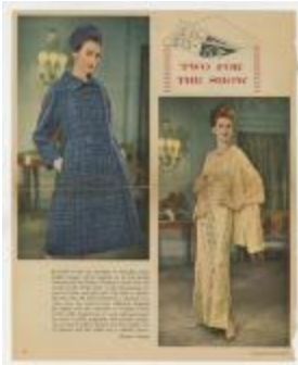
Two for the Show (KA0018_000042)