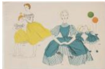
Simplicity Patterns 3874, 4292, 3791, and 3808: Two Matching Mother and Daughter Ensembles (KA008601_OSx1_f07_09v)