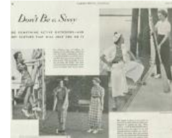
Don't Be a Sissy (KA0045_b01_f12_01)