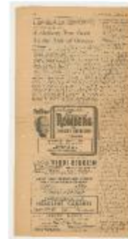
Review of "The Flies" by Jean-Paul Sartre (NS030105_000412)