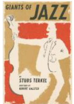
Book Jacket for "Giants of Jazz" (KA014101_000003)