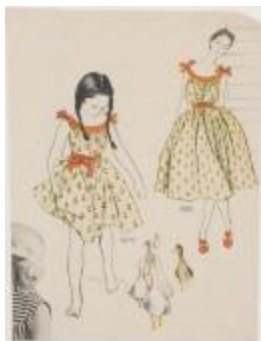
Simplicity Patterns 4582 and 4579: Matching Mother and Daughter Dresses (KA008601_OSx1_f07_03)