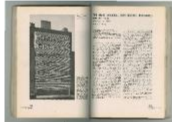
The New School for Social Research (NS030105_00510)