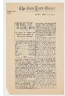
New York Times Review of "The Flies" by Jean Paul Sartre (NS030105_000405)