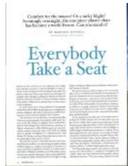
Photocopy of clipping from Smithsonian magazine about one-piece plastic chairs: "Everybody Take a Seat"