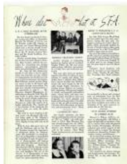
"Nine-fifteen at the Waldorf", Saks News, Vol. 7, No. 6, unpaginated (KA0102_k07_f01_01g)