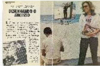
Desenhando O Sucesso (KA0014_0000011)