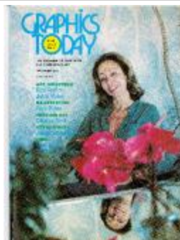
Bea Feitler Sense ability (KA0014_000010)