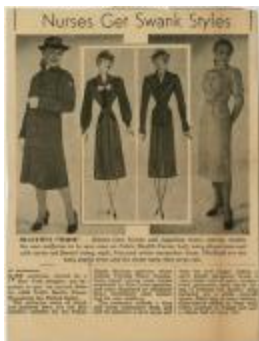
Nurses Get Swank Styles (KA0023_000001)