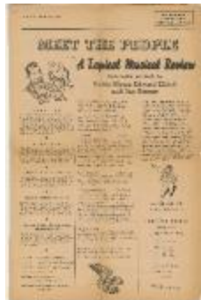
A Musical Review of the First Production of the Musical Play Department - "Meet The People" (NS030105_000406)