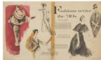
"Fashions Revive the '30s" (KA008601_OSxx1_f07_01)