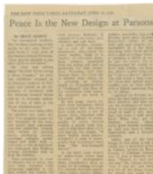
Peace Is the New Design at Parsons (NS030502_000005)