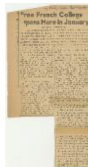
"Free French College Opens Here in January" from The New York Daily News (NS030105_000091)