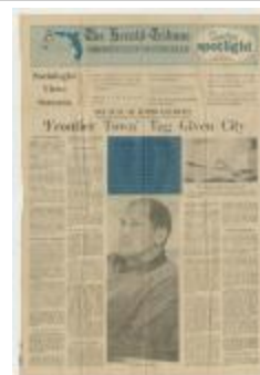
Sociologist Views Sarasota (NA000901_000011)