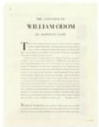
The Influence of William Odom on American Taste (PIC03002_OSx3_f05_03)