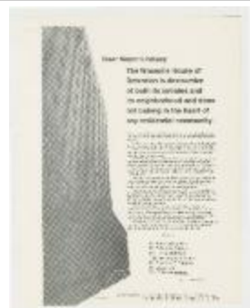
Open Letter to Mayor Lindsay Regarding Women's House of Detention (NS010102_000001)