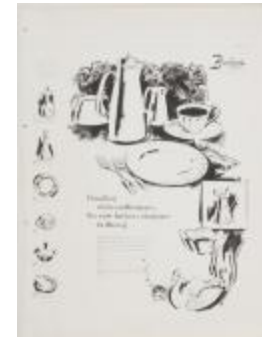
Bamberger's Advertisement Featuring White Earthenware (KA008601_OSxx1_f01_02)