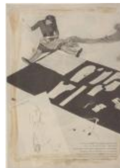
Simplicity Pattern 1521: Juniors' and Misses' Two-Piece Suit (KA008601_OSx1_f05_02)