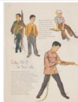
"School Report- For Boys Only" (KA008601_OSx1_f07_16v)