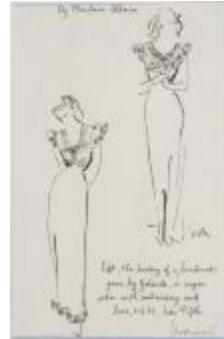
Bridal Nightgowns (KA008601_OSx1_f16_03)