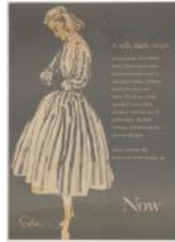
"A Tall, Dark Stripe" (KA008601_OSx1_f13_01)