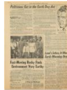
New York Daily News, Page 4 (KA0123_kOSx4_f08_05)