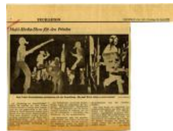
Multi-Media-Show fuer den Frieden (NS030502_000013)