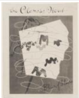
Blouses of Celanese (KA008601_OSx1_f04_01)