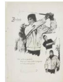
Bamberger's Advertisement Featuring Men's Activewear (KA008601_OSxx1_f01_06)