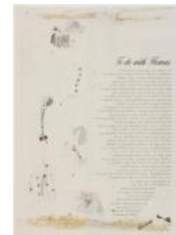
"To Do With Flowers" (KA008601_OSx1_f05_04)