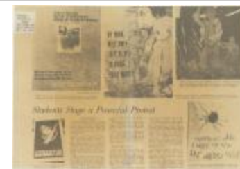
Students Stage a Peaceful Protest (NS030502_000006)