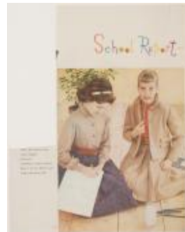
"School Report-" (KA008601_OSx1_f07_14)