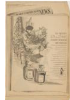
Saks Fifth Avenue Advertisement Featuring Givenchy Perfumes (KA008601_OSx1_f17_01)