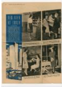
New York at Lunch (KA0045_OSxx2_f04_01)