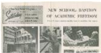
New School: Bastion of Academic Freedom (NS030105_000803)