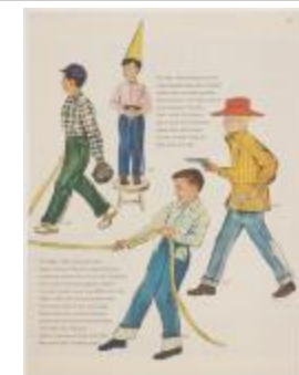
Simplicity Patterns 4452, 4166, 4100, and 4990: Boys' School Clothes (KA008601_OSx1_f07_17)