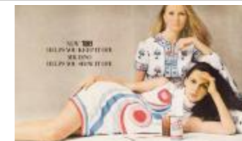
Advertisement for Tab Soft Drink and Mr. Dino Fashions (KA0049_KOSxx-2_f01_01)