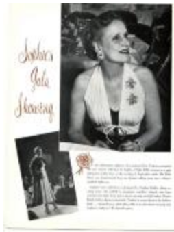
"The Thirties: The Lean Years," Saks News, Vol. 29 , No. 5 (1974) (KA0102_k07_f01_01c)