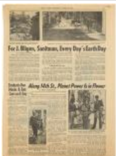
New York Daily News, Page 5 (KA0123_kOSx4_f08_06)