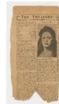
Newspaper Review of "The Flies" by Jean- Paul Sartre (NS030105_000408)