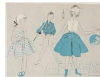
Simplicity Patterns 4276, 4452, and 4541: Boys' Lumber Jacket and Two Girls' Ensembles (KA008601_OSx1_f07_06)