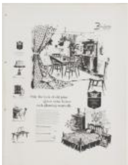
Bamberger's Advertisement Featuring Old Pine Furniture (KA008601_OSxx1_f01_03)