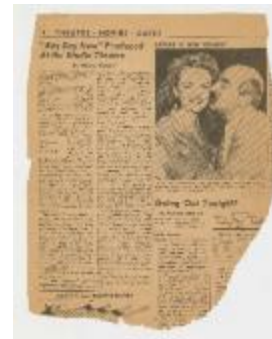
Review of "Any Day Now", a Comedy by Philip Yordan (NS030105_000414)