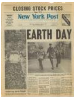
New York Post, Cover (KA0123_kOSx4_f08_07)