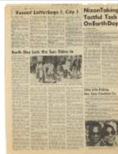
New York Post, Page 3 (KA0123_kOSx4_f08_08)