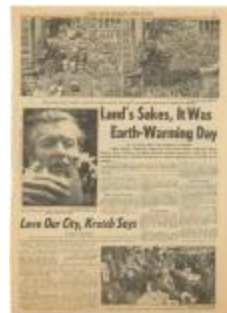
New York Daily News, Page 3 (KA0123_kOSx4_f08_04)