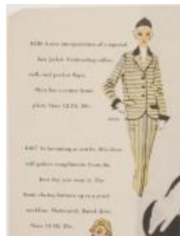
Simplicity Pattern 4436: Misses' and Women's Two-Piece Suit (KA008601_OSx1_f07_03v)