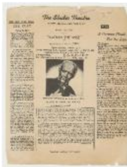
Collection of Reviews of "Nathan The Wise", a Play by Gotthold Ephraim Lessing (NS030105_000404)