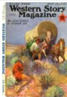
Western Story magazine cover (KA0090_b01_f08_01)