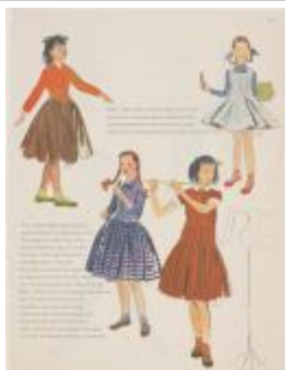
Simplicity Patterns 4394, 1256, 1253, and 1252: Four Girls' Ensembles (KA008601_OSx1_f07_16)