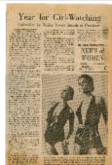
Year for Girl-Watching (KA0005_000003)