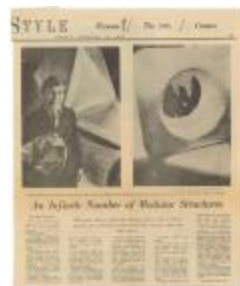
An Infinite Number of Modular Structures (page 1) (KA0123_kOSx4_f12_01)