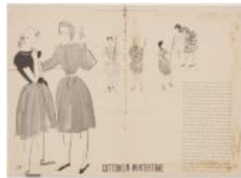
"Cottons In Wintertime" (KA008601_OSx1_f05_05)