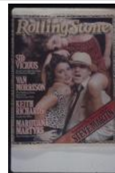
Exposed The Secret Life Of Steve Martin (KA0014_b03_f05_s21)