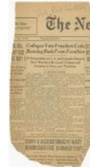
Colleges Vote Freedom Code Banning Reds from Faculties (NS030105_000039)