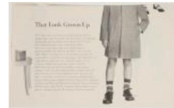
"That Look Grown Up" (KA008601_OSx1_f07_04v)