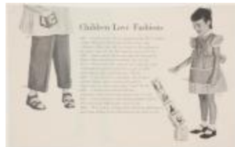
"Children Love Fashions" (KA008601_OSx1_f07_04)