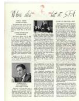
"Where else but at S.F.A.," Saks News, Vol. 7, No. 2, unpaginated (KA0102_k07_f01_01i)