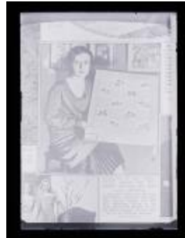
Evidence of Her Versatility Among the Talented Younger Set (KA0122_g01_f02_01)