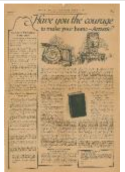
Have You the Courage to Make Your Home—Artistic? (KA0057_000002)