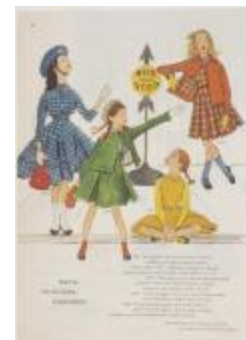
"Back-to-School Fashions" (KA008601_OSx1_f07_11v)