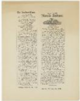
Articles on Ecole Libre from New York Herald Tribune and New York Times (NS030105_000119)