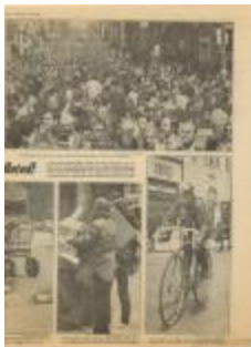
New York Daily News, Page 2 (KA0123_kOSx4_f08_03)