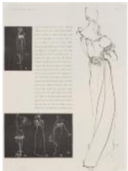
Assortment of Nightgowns and Lingerie (KA008601_OSx1_f05_03)