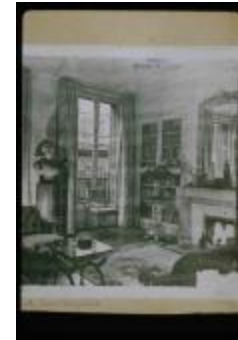
Van Day Truex's Paris Apartment (PIC03002_p04_f05_01)