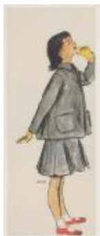
Simplicity Pattern 4418: Girls' Short Swagger Coat (KA008601_OSx1_f07_01)