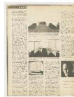
Four Parsons Students Tackle Women's Prison Design (PC010401_000019)