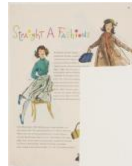
"Straight A Fashions" (KA008601_OSx1_f07_15)