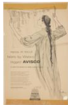
Avisco Advertisement Featuring Acetate Tricot Nightgown (KA008601_OSx1_f03_01)