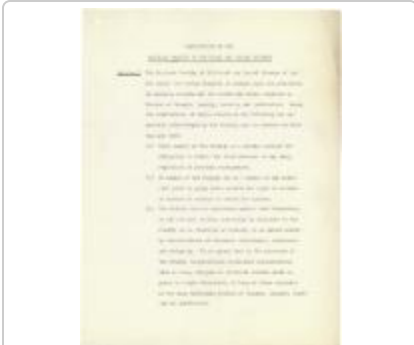
Draft of the Constitution of the Graduate Faculty of Political and Social Science (NS020201_000005)