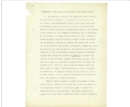
Suggestions of the Coordinating Committee to the Graduate Faculty (NS020201_000008)