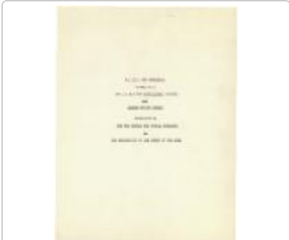
Exhibits and Memoranda Accompanying Application for Provisional Charter and Degree-Giving Powers for the Graduate