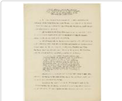
Proposed Agreement between Government of France and New School for Social Research (NS020201_000003)