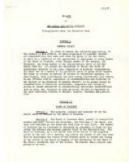
By-Laws of New School for Social Research (NS020201_000013)