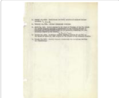
Timeline of Ratification of Constitution and Amendment (NS020201_000007)