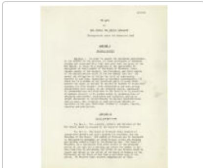
By-Laws of New School for Social Research (NS020201_000009)