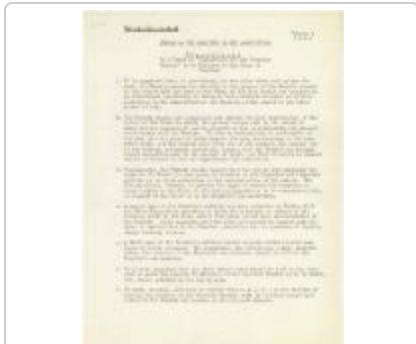
Report of the Committee on the Constitution: Suggestions On a Draft of "Regulations for the Graduate Faculty" to