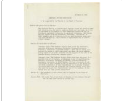
Amendments to the Constitution of the New School Graduate Faculty (NS020201_000010)