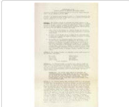
Constitution of the Graduate Faculty of Political and Social Science (NS020201_000004)