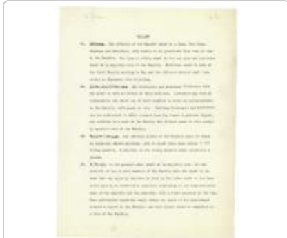
Draft By-Laws (NS020201_000006)