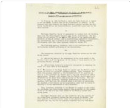
Report of the Legal Committee on the Two-Thirds and Three-Fourths Majority Rule of the Faculty Constitution