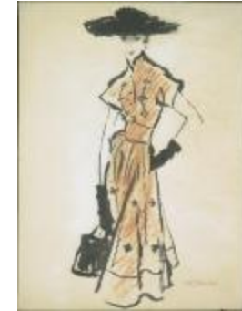
Two-Piece Sepia Linen Dress with Black Embroidery (KA0038_000125)