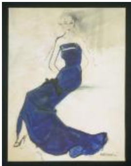
Strapless Blue Evening Dress with Mermaid Skirt (KA0038_000005)