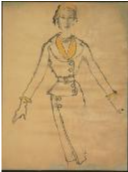
Grey Wool Jersey Dress with Wrap-Around Skirt (KA0038_000066)