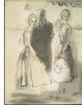
Blue Dresses with Tucks (KA0038_000015)