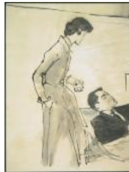
Two Women's Ensembles with Short Jackets and Gingham Blouses (Drawing in 2 Parts) (KA0038_000108)