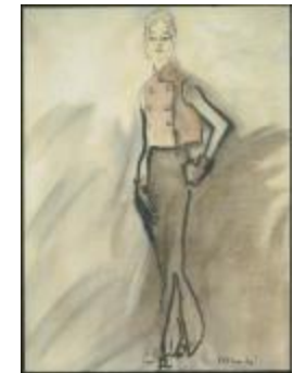
Evening Ensemble with Sleeveless Pink Pillbox Jacket (KA0038_000043)