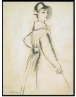
High-Waisted Women's Coat with Back Belt (KA0038_000002)