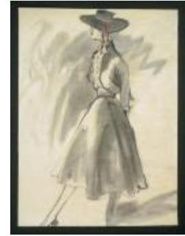
Women's Ensemble with Bolero Jacket and Full Skirt (KA0038_000006)