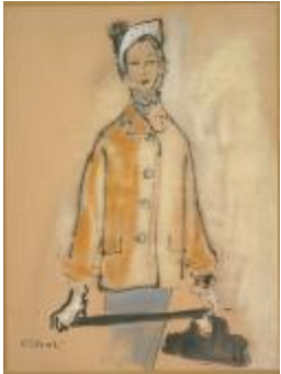
Women's "BÃ©dictine" Wool Coat (KA0038_000026)