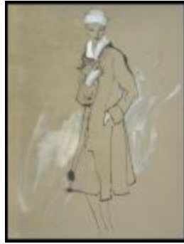
Women's Coat with White Ermine Collar (KA0038_000003)