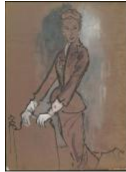
Women's Late-Day Suit in Wine Velvet (KA0038_000032)