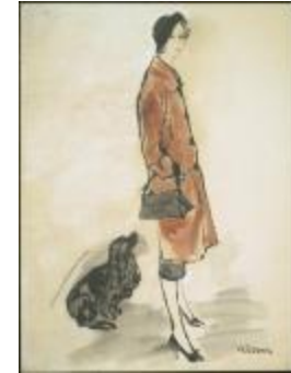
Auburn Velvet Coat (KA0038_000035)