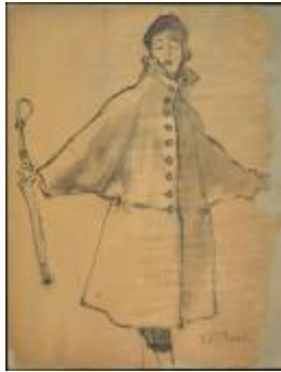
Women's Tent Coat with Dolman Sleeves (KA0038_000018)