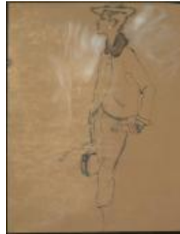
Topaz Wool Ensemble with Mink Collar (KA0038_000065)