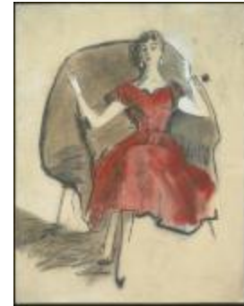
Red Lace Evening Dress with Cape Collar (KA0038_000073)