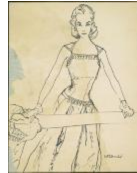
Evening Dress with Beaded Trim and Matching Stole (KA0038_000127)