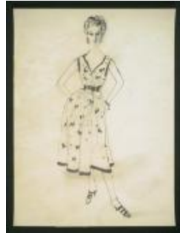
Day Dress with Butterfly Embroidery (KA0038_000010)