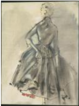
Black Taffeta Dress with Colorful Petticoat (KA0038_000046)