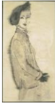
Women's Cardigan Jacket and Beret (KA0038_000119)