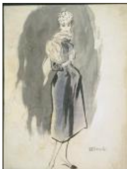
Navy Dress with Rhinestone Embellishments (KA0038_000072)