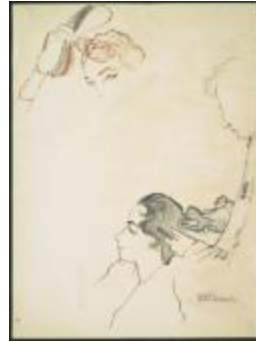
Women Using Hair Color Selector and Pinking Machine (KA0038_000090)