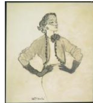
Blond Fleece Jacket with Black Braid and Tassels (KA0038_000063)