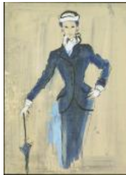
Fitted Blue Women's Suit (KA0038_000115)