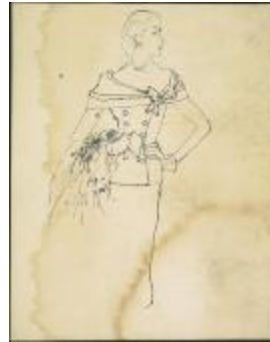
Women's Evening Ensemble with Double-Breasted Top and Fichu Wrap (KA0038_000126)