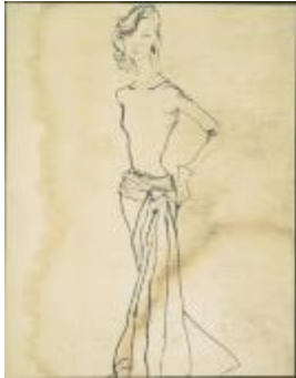
Long-Sleeved Evening Dress with Low-Slung Girdle (KA0038_000130)