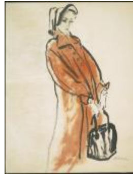
Women's Burnt Tangerine Travel Coat (KA0038_000071)