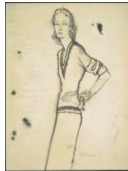
Middy-Bodice Sheath Dress (KA0038_000059)