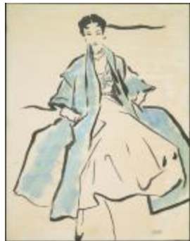
Blue Linen Coat with Embroidered Dinner Dress (KA0038_000053)