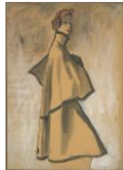
Flannel Cape Coat with Black Braid Piping (KA0038_000054)