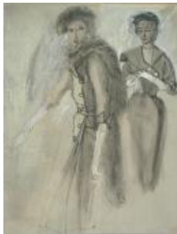
Coat Dresses (KA0038_000025)