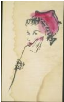
Rose Handkerchief Hat with French Ribbon Trim (KA0038_000121)