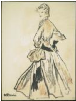
"Etching" Late-Day Dress with Fringed Cummerbund (KA0038_000039)