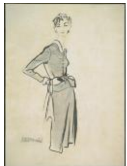
Navy Women's Suit with Framed Handbag (KA0038_000070)