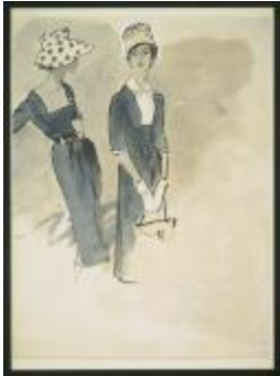
Blue Sheath Dresses (KA0038_000013)