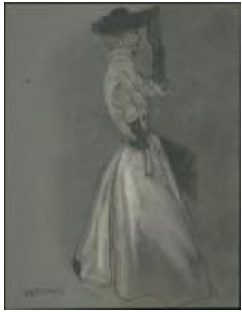
Blond Taffeta Coat Dress (KA0038_000064)