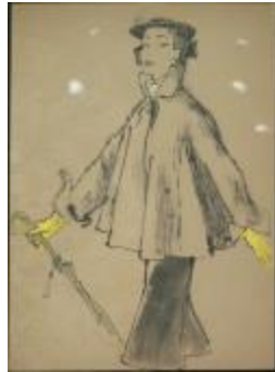
Short Swing Coat with Trumpet Skirt (KA0038_000067)