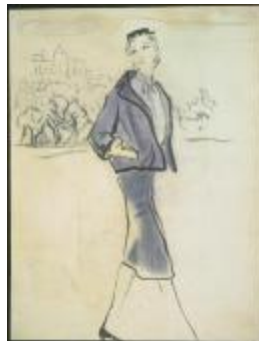
Short Navy Blue Coat and Fitted Skirt (KA0038_000113)