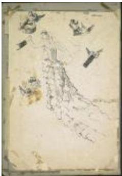
Ruffled Bridal Gown and Containers of "Salut de Schiaparelli" (KA0038_000077)