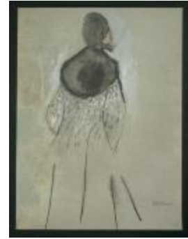
Women's Tweed Coat with Sealskin Collar (KA0038_000007)