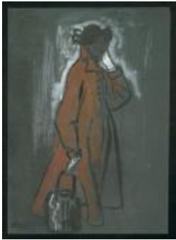
Women's Burnt Tangerine Tavel Coat and Veiled Hat (KA0038_000012)