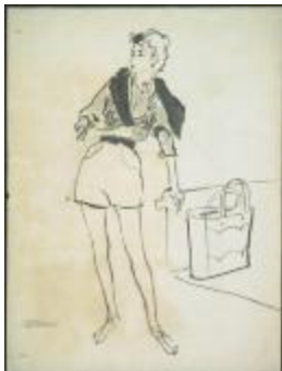
Women's Ensemble with Gabardine Shorts and Frilled Gingham Blouse (KA0038_000132)