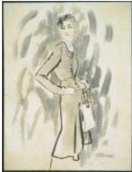
Women's Suit with Framed Handbag (KA0038_000020)