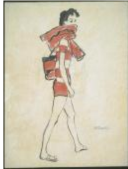
Red Striped Pullover with Gabardine Shorts (KA0038_000088)