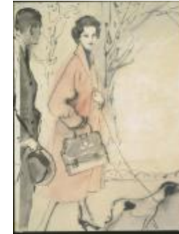
Pink Fleece Women's Coat (KA0038_000052)