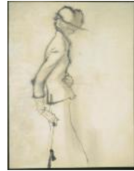
Women's Fitted Jacket and Quilled Hat (KA0038_000105)