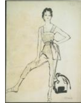
Corded Overalls with Sash Belt (KA0038_000109)