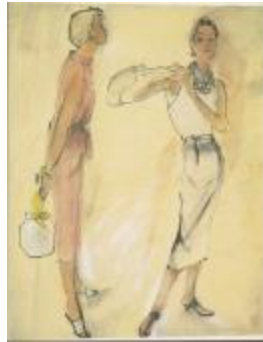
Shell Pink Dress and Lavender-Blue Ensemble (KA0038_000056)