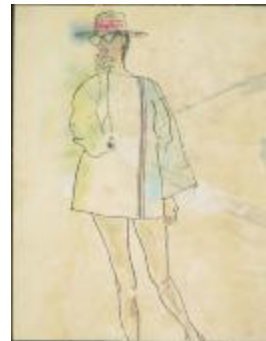
Multicolor Poncho and Sunhat (KA0038_000118)