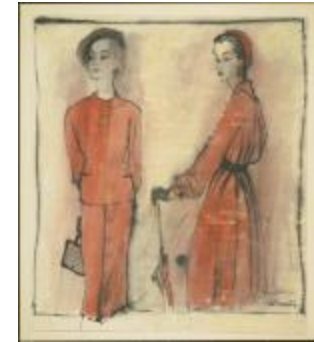
Red Jersey Ensemble and Shirtwaist Dress (KA0038_000037)