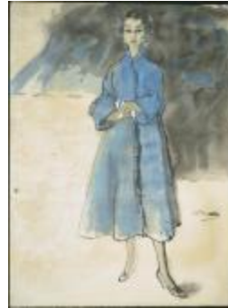
Turquoise Blue Coat with Fringe (KA0038_000076)