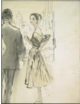
Pleated Dress with Bell Sleeves (KA0038_000042)