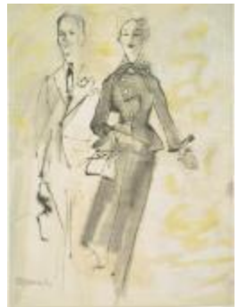
Black Alpaca Skirt and Fitted Jacket (KA0038_000030)