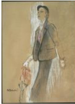
Box-Jacket Suit with Pink Velvet Vest (KA0038_000022)