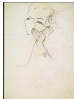
Woman Applying Mascara (KA0038_000060)