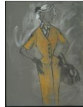
"BÃ©dictine" Linen Suit with Cardigan Jacket (KA0038_000023)