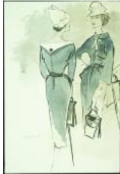
Navy Blue Dresses with White Hats (KA0038_000017)