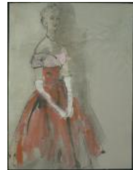
Pale Pink Chiffon Top and Crimson Satin Skirt (KA0038_000041)