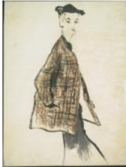
Rust and Black Tweed Collarless Coat (KA0038_000044)