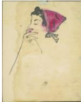
Rose Handkerchief Hat with French Ribbon Trim (KA0038_000124)