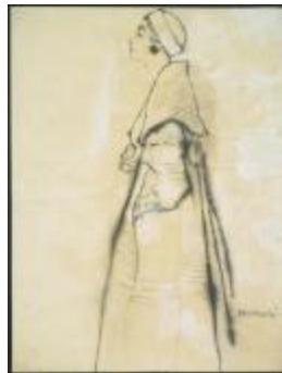
High-Waisted Women's Coat with Shawl Collar (KA0038_000031)