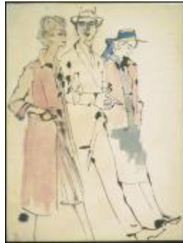
Women's Pink Coat and Jacket Ensembles (KA0038_000027)