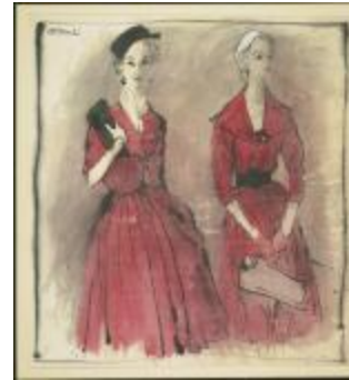
Red Jersey Dresses (KA0038_000036)