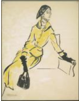
Yellow Silk Shantung Women's Suit (KA0038_000074)