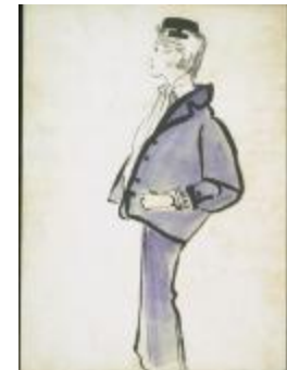
Short Navy Blue Coat with Silk Braided Trim (KA0038_000114)