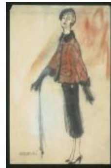
Orange and Black Plaid Jacket with Black Velvet Skirt (KA0038_000101)