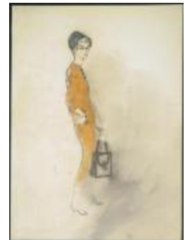
Women's Matchbox Suit in Persimmon (KA0038_000087)