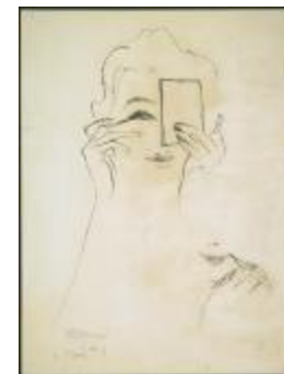
Women Applying Mascara and Lip Pencil (KA0038_000061)