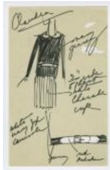
Pleated White Crepe Skirt with Navy Jersey Overblouse (KA0035_000214)