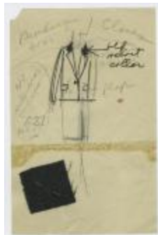
Women's Ensemble with Pleated Skirt and Black Velvet Collar (KA0035_000211)