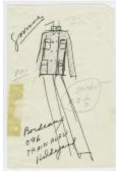
Women's Pants Ensemble with Double-Breasted Jacket (KA0035_000239)