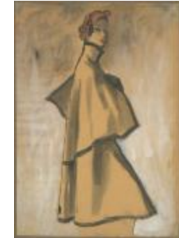
Flannel Cape Coat with Black Braid Piping (KA0038_000054)