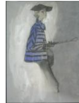
Blue and Black Striped Jacket with Raglan Sleeves (KA0038_000051)