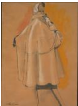
Women's "B&N" Coat with Low Yoke (KA0038_000021)