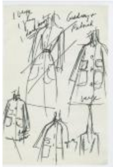
Belted Coat with Assortment of Swing Coats (KA0035_000090)