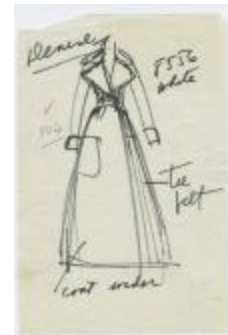
Long White Coat with Tie-Belt and Wide Lapels (KA0035_000133)