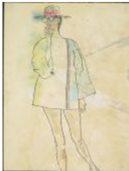
Multicolor Poncho and Sunhat (KA0038_000118)