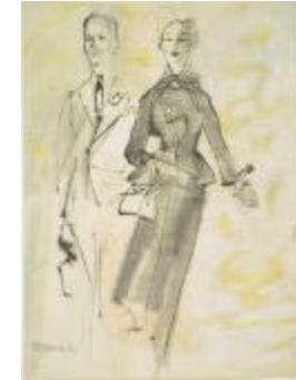
Black Alpaca Skirt and Fitted Jacket (KA0038_000030)