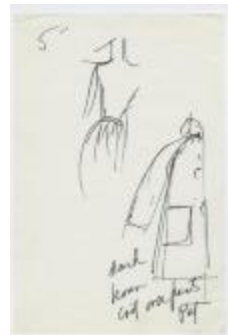
Partial Sketch of Dress and Tent Coat (KA0035_000080)