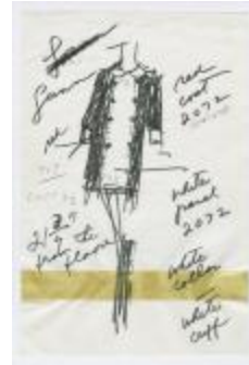
Red Coat with White Panel (KA0035_000223)