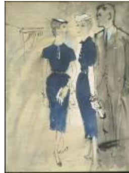
Navy Blue Sheath Dresses with White Buttons (KA0038_000024)