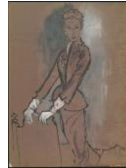
Women's Late-Day Suit in Wine Velveteen (KA0038_000032)