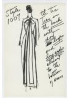
Floor-Length Evening Dress with Long Bow Collar (KA0035_000244)