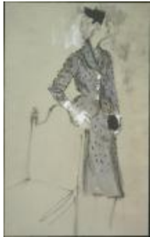
Blue Women's Suit with Black Dots (KA0038_000019)