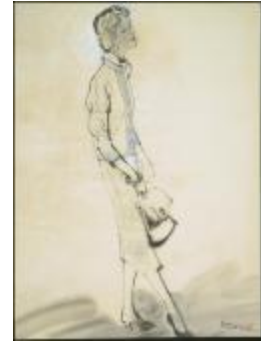
Women's Cardigan Suit with Blue Border (KA0038_000040)