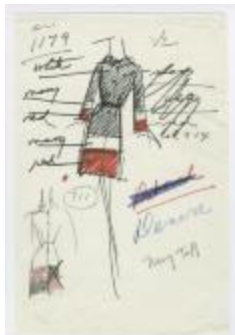
Navy Taffeta Coat with White and Red Stripes (KA0035_000234)