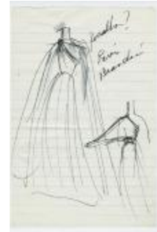
Asymmetrical Evening Dresses (KA0035_000115)