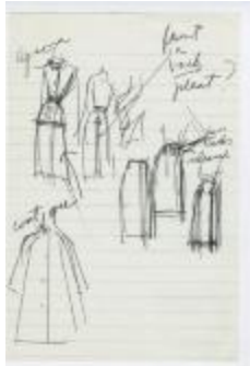
Women's Ensemble with Tent Coat and Pleated Skirt (KA0035_000114)