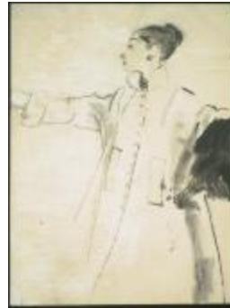
Women's Loose Overcoat with Small Buttons and Fur Muff (KA0038_000107)