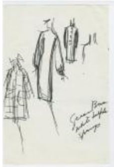
Checked Coat and Long-Sleeved Dress (KA0035_000098)