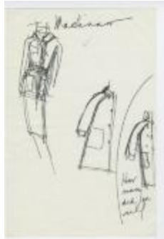
Women's Suit and Overcoat (KA0035_000121)