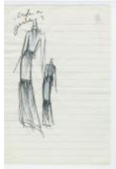
Crepe or Jersey Dress with Flounced Skirt (KA0035_000152)