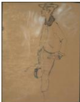
Topaz Wool Ensemble with Mink Collar (KA0038_000065)