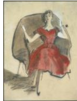
Red Lace Evening Dress with Cape Collar (KA0038_000073)