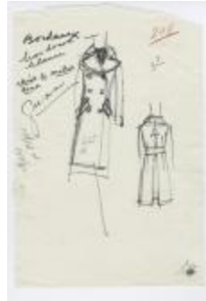
Women's Double-Breasted Coat with Wide Notched Collar (KA0035_000230)