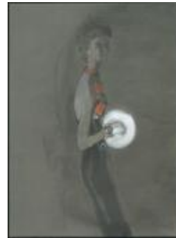
Wool Plaid and Velveteen Directoire Suit (KA0038_000050)