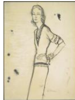
Middy-Bodice Sheath Dress (KA0038_000059)