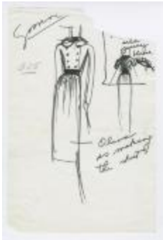
Women's Ensemble with Midi-Length Skirt and Cropped Jacket (KA0035_000224)