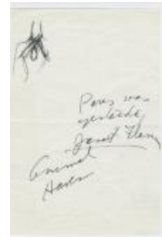
Twisted Halter Top (KA0035_000102)