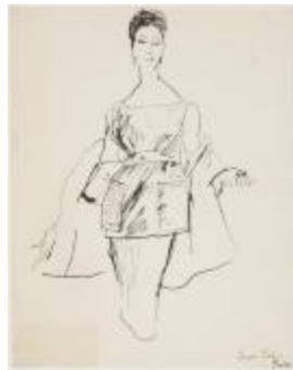
Women's Ensemble with Large Square Pockets (KA008601_OSx1_f01_01)