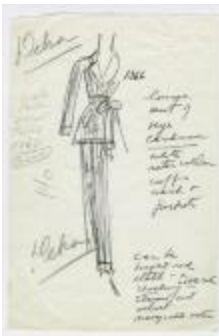
Beige Cashmere Lounge Suit (KA0035_000222)