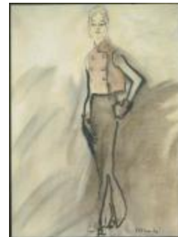
Evening Ensemble with Sleeveless Pink Pillbox Jacket (KA0038_000043)