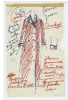
Double-Breasted "House Gown" (KA0035_000210)