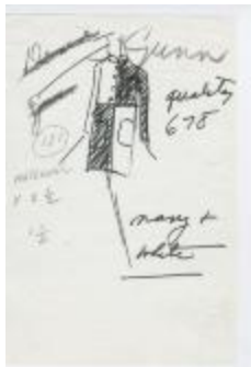
Navy and White "Quadrant" Coat (KA0035_000127)