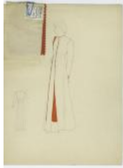
Floor-Length Evening Coat or Housecoat (KA0067_000156)