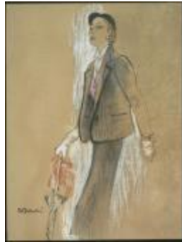
Box-Jacket Suit with Pink Velveteen Vest (KA0038_000022)