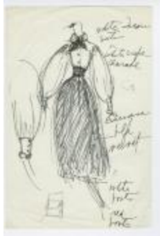
White Satin and Black Velvet Puff-Sleeved Dress (KA0035_000069)