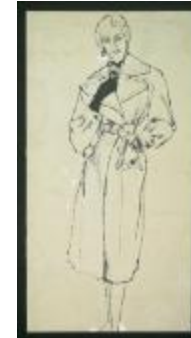
Women's Trench Coat with Wide Notched Collar (KA0038_000102)