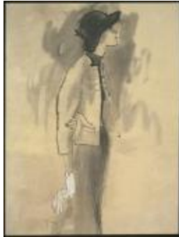
Women's Ensemble with Short Jacket and Cloche Hat (KA0038_000049)