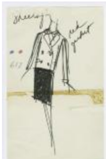
Double-Breasted Red Jacket with Pencil Skirt (KA0035_000208)