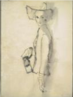
Women's Ensemble with Fitted Jacket and Wide-Brimmed Hat (KA0038_000079)