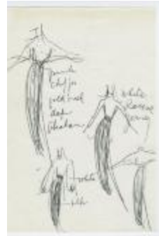
White, Black, and Pink Long-Sleeved Dresses (KA0035_000106)