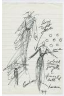
Colored Georgette Evening Dress with Spangled Dots (KA0035_000110)