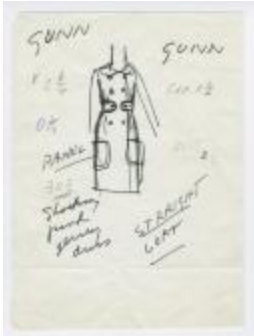
Shocking Pink Jersey Dress (KA0035_000220)