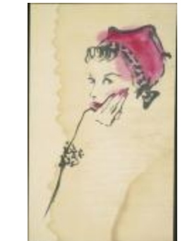
Rose Handkerchief Hat with French Ribbon Trim (KA0038_000121)