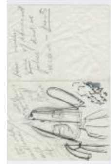
Tent Coat with Oversized Patch Pockets (KA0035_000111)