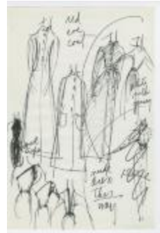
Red Evening Coat with Assortment of Dresses (KA0035_000105)