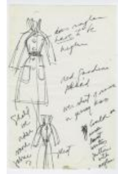
Red Plaid Coat with Raglan Sleeves (KA0035_000075)