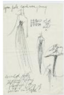
Long-Sleeved Cashmere and Silk Jersey Dresses (KA0035_000100)