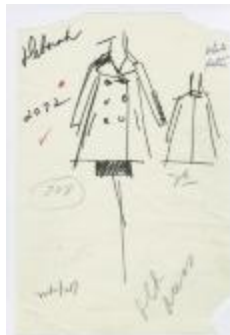
White Satin Tent Coat and Black Dress (KA0035_000235)