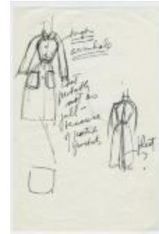
Women's Coat with Raglan Sleeves and Oversized Patch Pockets (KA0035_000123)