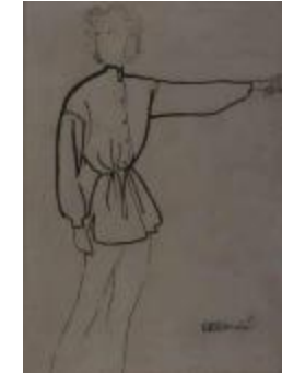
Long-Sleeved Tunic Blouse with Cinched Waistline (KA0038_k09_05_01)