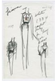
Floor-Length Evening Dress with Nautical Themed Jacket (KA0035_000225)