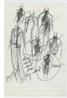
Women's Evening Ensemble with Halter Neckline (KA0035_000089)