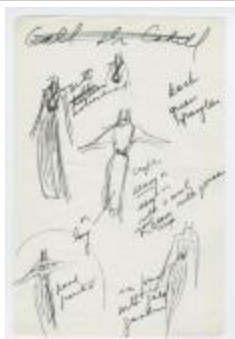
Embroidered, Spangled, and Hand-Painted Dresses (KA0035_000078)