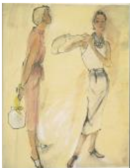
Shell Pink Dress and Lavender-Blue Ensemble (KA0038_000056)