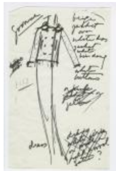
Beige Jacket with Floor-Length White Dress (KA0035_000217)