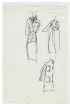
Women's Suit and Partial Ensembles (KA0035_000084)