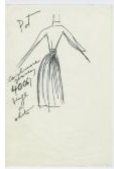
Long-Sleeved Cashmere Jersey Dress (KA0035_000093)