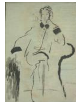
Women's Ensemble Featuring Coat with Flap Closure and Dark Collar (KA0038_000078)