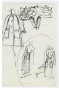
Collarless Tent Coat, White Cashmere Dress, and White Agnona Wool Coat (KA0035_000150)