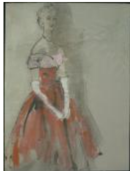
Pale Pink Chiffon Top and Crimson Satin Skirt (KA0038_000041)