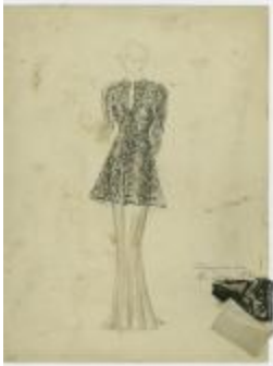
Women's Evening Ensemble with Lace Tunic Jacket (KA0067_000094)