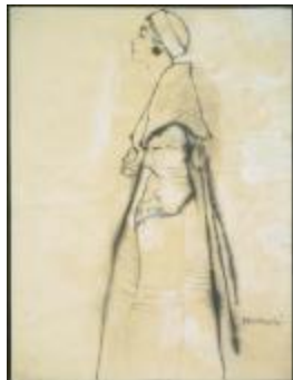
High-Waisted Women's Coat with Shawl Collar (KA0038_000031)