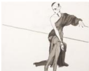
One-Sleeved Evening Dress with High Skirt Slit (KA002201_OSxxx1_f05_03)