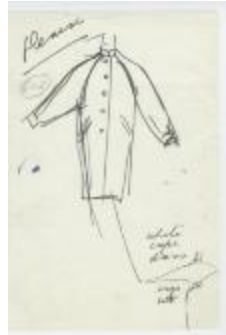
Raglan-Sleeved Coat with Mandarin Collar (KA0035_000140)