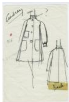
Tent Coat with Standing Collar and Three Pockets (KA0035_000146)