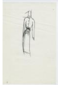
Shirtdress with Standing Collar (KA0035_000092)