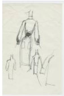
Long-Sleeved Dress with High Collar and Patch Pockets (KA0035_000094)