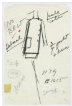
Women's Day Suit with Asymmetrical Jacket (KA0035_000236)