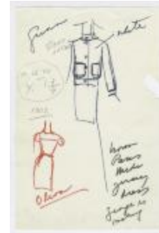
Short-Sleeved Brown Dress with White Jacket (KA0035_000240)