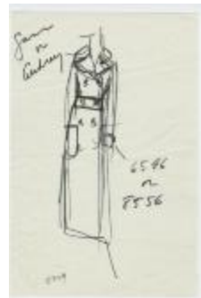
Double-Breasted Coat with Self-Belt and Oversized Patch Pocket (KA0035_000132)