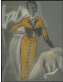
Orange Coat Dress with Large Black Bow (KA0038_000033)