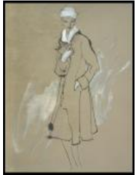
Women's Coat with White Ermine Collar (KA0038_000003)