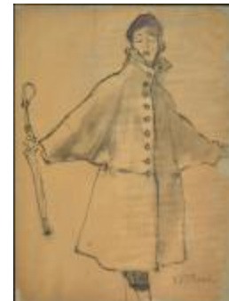
Women's Tent Coat with Dolman Sleeves (KA0038_000018)