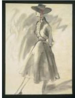
Women's Ensemble with Bolero Jacket and Full Skirt (KA0038_000006)