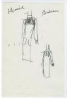
"Bordeau" Dress (KA0035_000091)