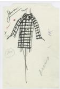
Checked Coat with Raglan Sleeves (KA0035_000238)