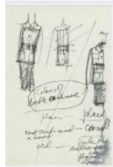
Women's Ensemble with Belted Jacket (KA0035_000122)