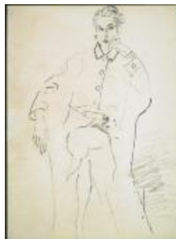
Women's Ensemble Featuring Coat with Flap Closure (KA0038_000100)