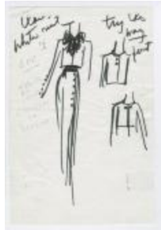
White Women's Suit with Bow Collar (KA0035_000229)