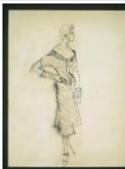
Short-Sleeved Dress with Diagonal Stripes (KA0038_000103)