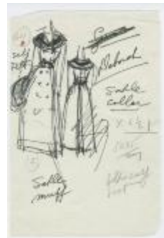
Women's Double-Breasted Coat with Sable Accents (KA0035_000128)