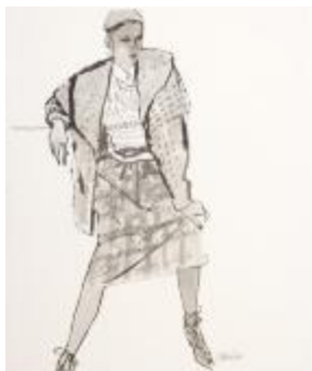
Women's Ensemble with Coat, Sweater Vest, and Plaid Skirt (KA002201_OSxxx1_f05_04)