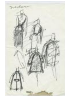
Tent Coat and Belted Shirtdress (KA0035_000082)