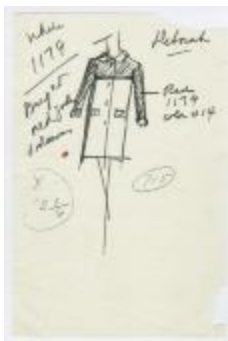
White Coat with Red Yoke and Sleeves (KA0035_000237)