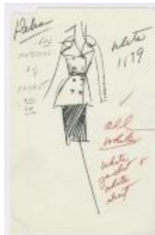
White Women's Ensemble with Belted Jacket (KA0035_000241)