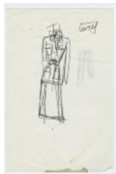
Women's Tweed Suit with Flap Pockets (KA0035_000070)