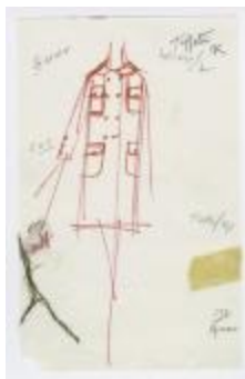
Double-Breasted Taffeta Coat with Large Flap Pockets (KA0035_000232)