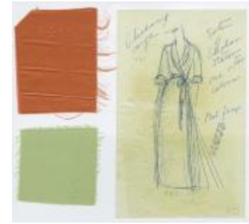
Bright Satin Housecoat (KA0035_000174)