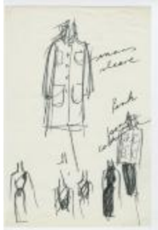
Pink Coat with Assortment of Dresses (KA0035_000086)