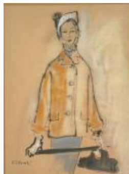
Women's "B&N" Wool Coat (KA0038_000026)