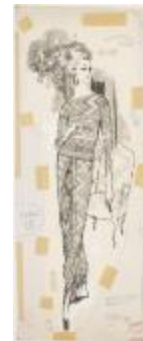
Printed Women's Ensemble with Harem Trousers (KA002201_OSxxx1_f10_01)