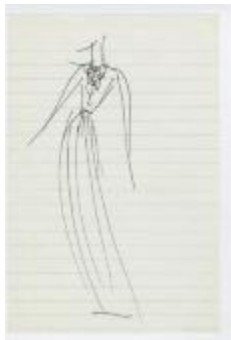
Long-Sleeved Evening Dress with Embellished Bodice (KA0035_000116)