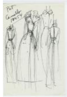
Full-Length Belted Overcoats (KA0035_000120)