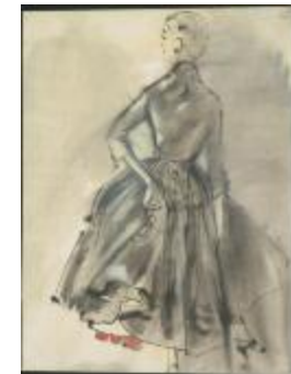
Black Taffeta Dress with Colorful Petticoat (KA0038_000046)