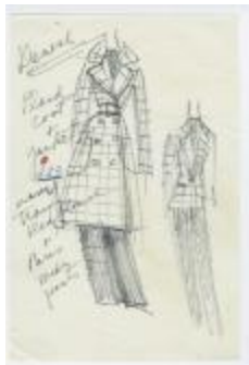
Plaid Coat and Jacket Ensemble (KA0035_000136)