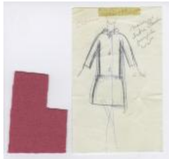
Bright Pink Coat Dress (KA0035_000186)