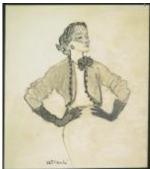
Blond Fleece Jacket with Black Braid and Tassels (KA0038_000063)