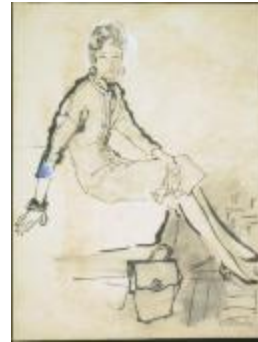
Women's Cardigan Suit (KA0038_000014)