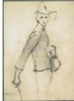
Women's Ensemble with Fitted Jacket and Tall Hat (KA0038_000095)