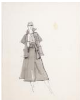
Women's Ensemble Featuring A-Line Wrap Skirt and Short-Sleeved Jacket (KA002201_OSxxx1_f05_02)