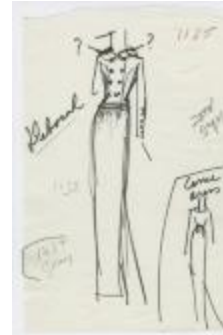
Women's Evening Ensemble with Double- Breasted Jacket (KA0035_000233)