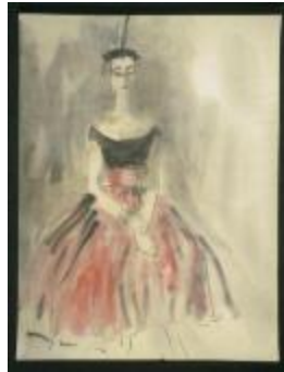
Black Top with Pink Taffeta Skirt (KA0038_000011)