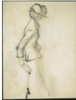
Women's Fitted Jacket and Quilled Hat (KA0038_000105)