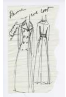
Double-Breasted Evening Coat (KA0035_000242)