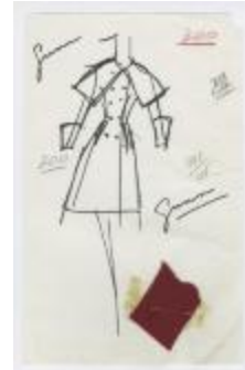
Double-Breasted Cape Coat (KA0035_000231)