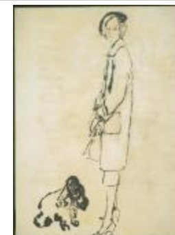
Women's Topcoat with Square Patch Pocket (KA0038_000106)