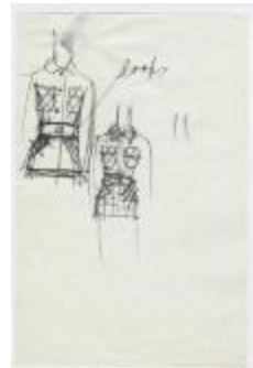
Checked Coat with Belted Waist (KA0035_000099)