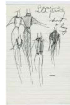
Racine Silk Jersey Dresses (KA0035_000113)