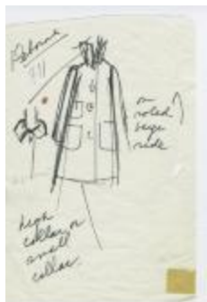
Tent Coat with Three Pockets and High Collar (KA0035_000145)