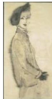
Women's Cardigan Jacket and Beret (KA0038_000119)