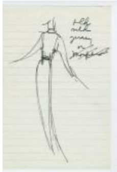
Black Silk Jersey Evening Dress with Dolman Sleeves (KA0035_000118)