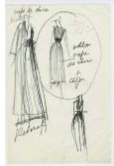
White Crepe de Chine Pleated Dresses (KA0035_000087)