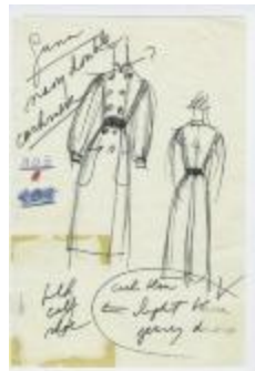
Navy Double Cashmere Coat with Mandarin Collar (KA0035_000138)