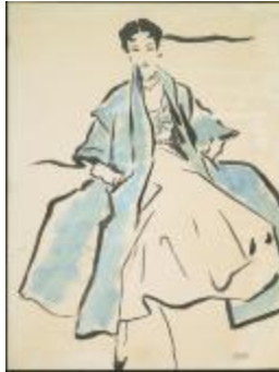
Blue Linen Coat with Embroidered Dinner Dress (KA0038_000053)