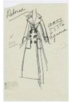
Navy Wool Sash Coat with Wide Lapels (KA0035_000131)