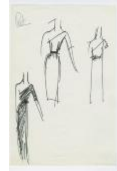
One-Sleeved Dresses (KA0035_000076)