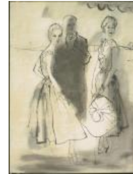
Blue Dresses with Tucks (KA0038_000015)