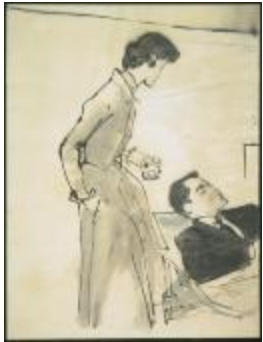
Two Women's Ensembles with Short Jackets and Gingham Blouses (Drawing in 2 Parts) (KA0038_000108)