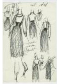
Long-Sleeved Dress with Brown Jersey Skirt (KA0035_000088)