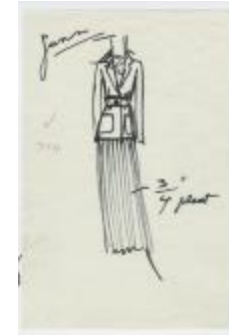
Long Pleated Skirt with Belted Jacket (KA0035_000135)