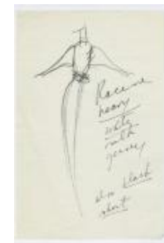
White Silk Jersey Dress with Dolman Sleeves (KA0035_000072)