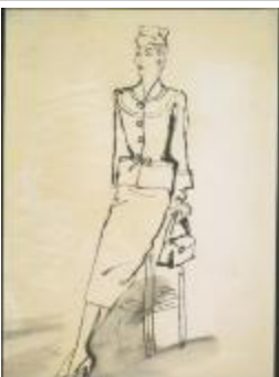
Women's Suit with Yoke and Bow Accents (KA0038_000081)