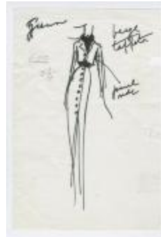
Beige Taffeta Women's Ensemble with Buttoned Skirt (KA0035_000226)