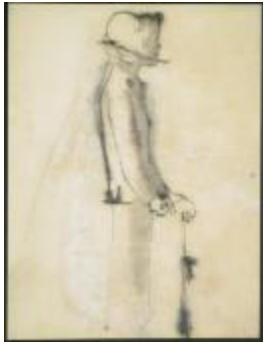
Women's Fitted Jacket and Quilled Hat (KA0038_000098)