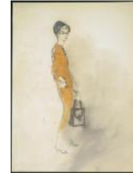
Women's Matchbox Suit in Persimmon (KA0038_000087)