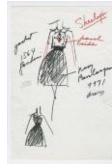
Sleeveless Navy Dress with Nautical Themed Jacket (KA0035_000227)