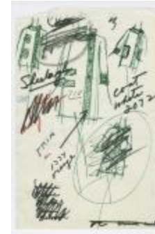
White Coat with Orange Trim (KA0035_000228)