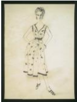
Day Dress with Butterfly Embroidery (KA0038_000010)