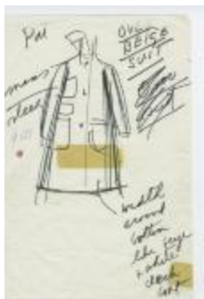
Tent Coat with High Collar (KA0035_000143)