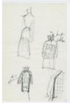
Checked Coats and Long-Sleeved Flounced Dress (KA0035_000109)