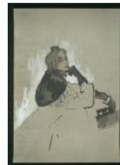
Women's Coat with Oversized Collar (KA0038_000008)