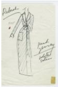
Pink Jersey and White Satin Wrap Coat (KA0035_000144)