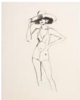
Swimsuit with Cut-Out Center (KA002201_OSxxx1_f05_01)