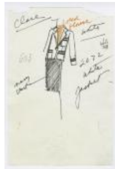
White Jacket, Red Blouse, and Navy Skirt (KA0035_000213)