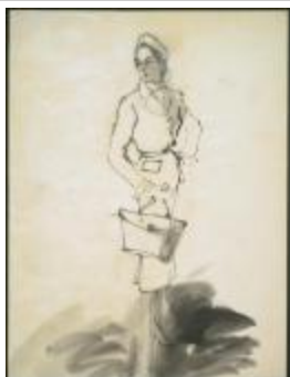
Women's Suit with Belted Coat and Fitted Skirt (KA0038_000084)