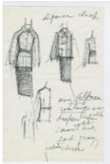
Alpaca Checked Coats and Solid Skirts (KA0035_000148)