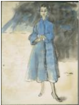
Turquoise Blue Coat with Fringe (KA0038_000076)