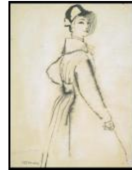
High-Waisted Women's Coat with Back Belt (KA0038_000002)