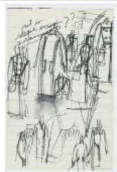
Long-Sleeved Dresses and Raincoats (KA0035_000083)