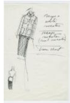
Beige, White, and Brown Women's Ensemble (KA0035_000151)