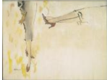
Fitted Skirts with Red or Orange Pumps (KA0038_000083)