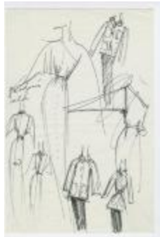
Gandini Silk Dresses and Two-Piece Women's Ensembles (KA0035_000149)