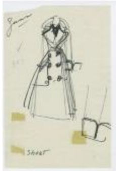
Women's Double-Breasted Coat with Wide Lapels (KA0035_000134)