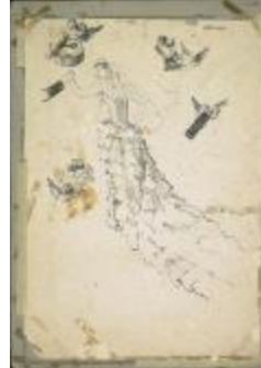
Ruffled Bridal Gown and Containers of "Salut de Schiaparelli" (KA0038_000077)