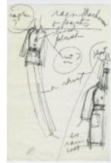
Women's Raincoat and Two-Piece Ensemble (KA0035_000095)