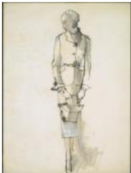
Women's Suit with Belted Jacket and Fitted Skirt (KA0038_000093)