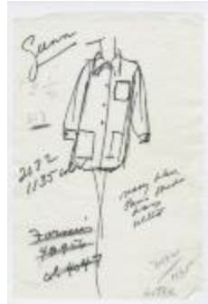
Women's Coat with Pointed Collar and Patch Pockets (KA0035_000221)