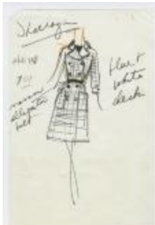
Blue and White Checked Coat (KA0035_000212)