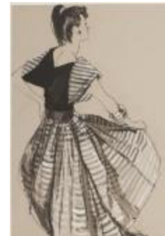
Striped Dress with Full Skirt (KA002201_OSxxx1_f04_11)