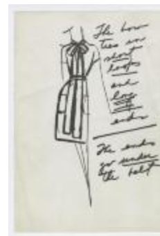
Short-Sleeved Dress with Long Bow (KA0035_000243)