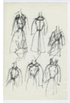
Belted Coats (KA0035_000074)