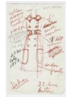
Double-Breasted Coat with Peter Pan Collar and Buttoned Straps (KA0035_000219)