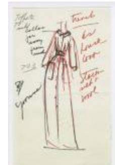
Trench-Style House Coat (KA0035_000215)