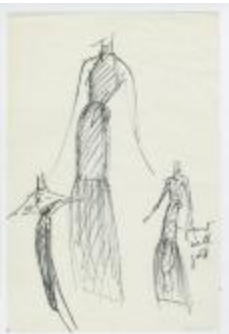
Assortment of Evening Dresses (KA0035_000097)