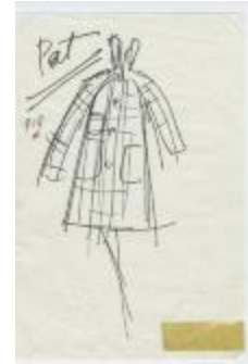
Checked Tent Coat with High Collar (KA0035_000142)