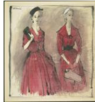
Red Jersey Dresses (KA0038_000036)