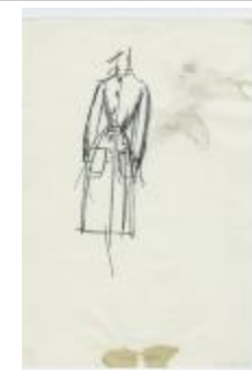
Collarless Coat or Dress with Patch Pockets (KA0035_000085)