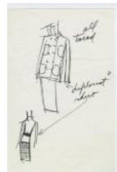
Women's Tweed Suit with "Diplomat" Skirt (KA0035_000147)