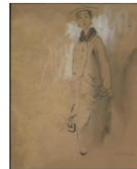
Cutaway Jacket with Fur Collar (KA0038_000094)