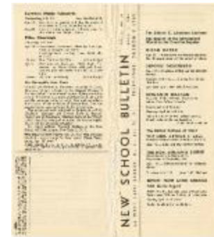
New School Bulletin Vol. XII, No. 32 (NS030102_bull1232)