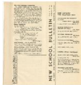
New School Bulletin Vol. X, No. 24 (NS030102_bull1024)