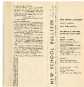
New School Bulletin Vol. X, No. 10 (NS030102_bull1010)