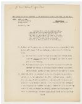
Excerpts from Talk by Benjamin Graham (NS030105_000502)