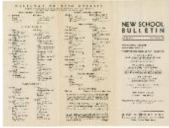
New School Bulletin Vol. VI, No. 14 (NS030102_bull0614)