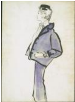
Short Navy Blue Coat with Silk Braided Trim (KA0038_000114)