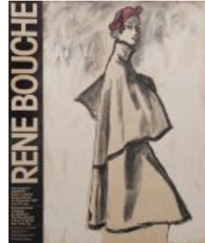
Rene Bouche: The Inaugural Exhibition (PIC05007-1_OSxxx1_f02_02)