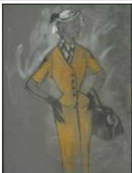
"BÃ©nÃ©dictine" Linen Suit with Cardigan Jacket (KA0038_000023)