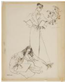
Woman and Two Young Girls in Long Robes (KA011201_kOSxxx3_f04_01)