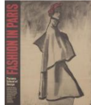
Fashion in Paris (PIC05007- 1_OSxx1_f08_02)