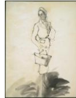
Women's Suit with Belted Coat and Fitted Skirt (KA0038_000084)