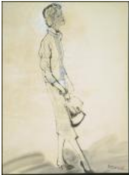
Women's Cardigan Suit with Blue Border (KA0038_000040)