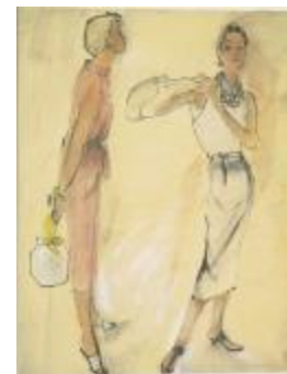
Shell Pink Dress and Lavender-Blue Ensemble (KA0038_000056)