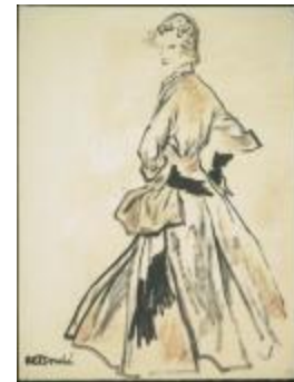
"Etching" Late-Day Dress with Fringed Cummerbund (KA0038_000039)