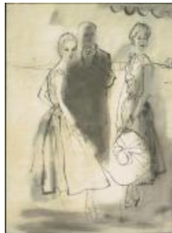
Blue Dresses with Tucks (KA0038_000015)