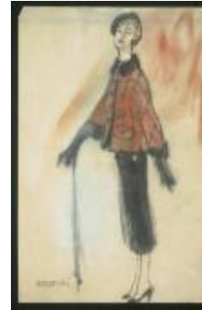
Orange and Black Plaid Jacket with Black Velveteen Skirt (KA0038_000101)