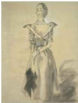
Belted Dress with Extra Wide Neckline (KA0038_000029)