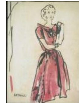
Pink Shirtdress with Chelsea Collar (KA0038_000085)