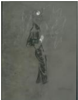
Women's Ensemble with Short Loose Coat and Long Fitted Skirt (KA0038_000112)