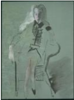
Women's Ensemble with Dark Collar and Matching Sleeve Cuffs (KA0038_000096)