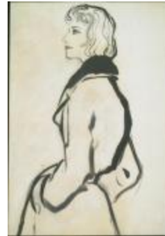
Belted Women's Coat with Dark Collar (KA0038_000117)