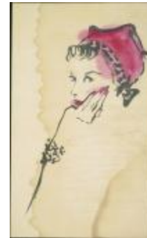
Rose Handkerchief Hat with French Ribbon Trim (KA0038_000121)