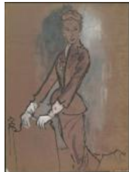
Women's Late-Day Suit in Wine Velvet (KA0038_000032)