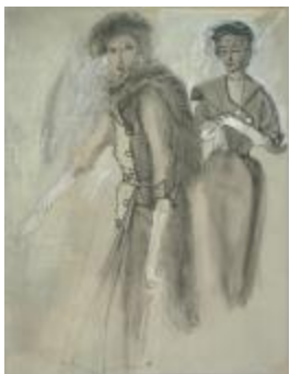
Coat Dresses (KA0038_000025)