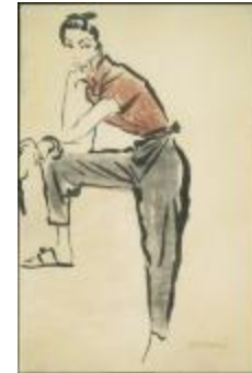
Women's Ensemble with Black Pants and Short-Sleeved Red Blouse (KA0038_000120)