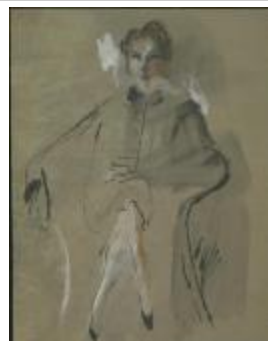
Women's Ensemble with Dark Collar and Matching Sleeve Cuffs (KA0038_000122)