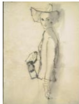
Women's Ensemble with Fitted Jacket and Wide-Brimmed Hat (KA0038_000079)