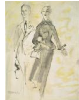
Black Alpaca Skirt and Fitted Jacket (KA0038_000030)