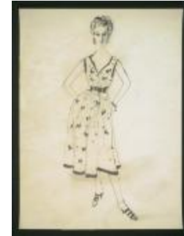
Day Dress with Butterfly Embroidery (KA0038_000010)