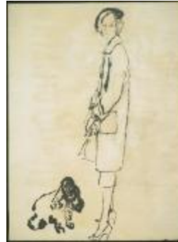
Women's Topcoat with Square Patch Pocket (KA0038_000106)