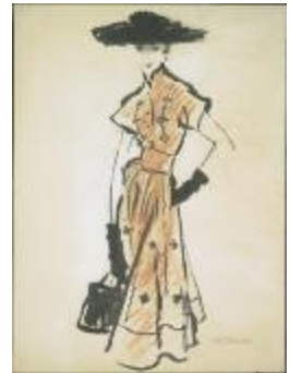
Two-Piece Sepia Linen Dress with Black Embroidery (KA0038_000125)