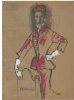
Wine Velvet Late-Day Suit (KA0038_000038)