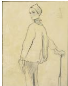
Women's Ensemble with Loose Coat (KA0038_000131)