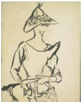
Scoop-Necked Dress with Embellished Hat (KA0038_000123)