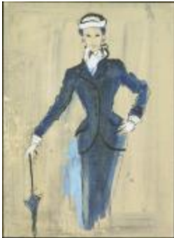
Fitted Blue Women's Suit (KA0038_000115)