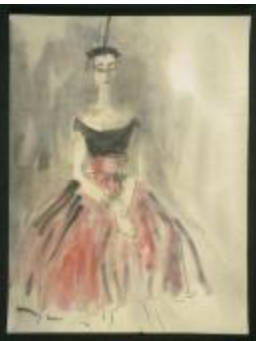
Black Top with Pink Taffeta Skirt (KA0038_000011)