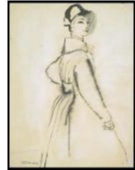
High-Waisted Women's Coat with Back Belt (KA0038_000002)