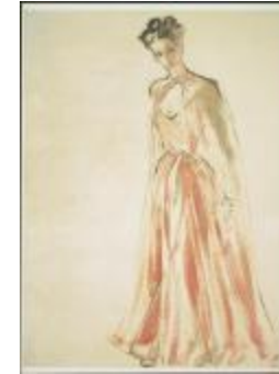
Coral Evening Dress with Cape (KA0038_000028)