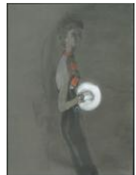
Wool Plaid and Velveteen Directoire Suit (KA0038_000050)