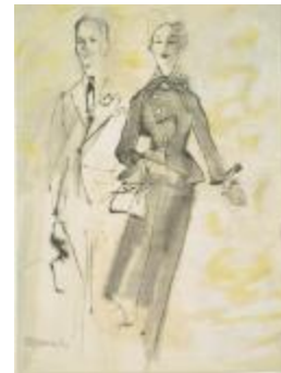
Black Alpaca Skirt and Fitted Jacket (KA0038_000030)