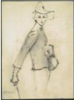
Women's Ensemble with Fitted Jacket and Tall Hat (KA0038_000095)