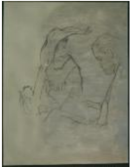
Oversized Women's Hat with Bow (KA0038_000082)