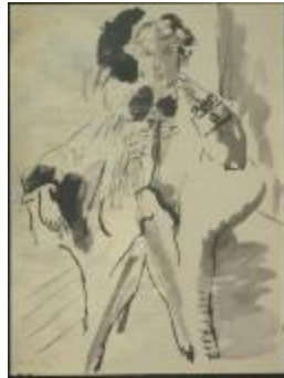
Women's Ensemble with Dark Collar and Matching Sleeve Cuffs (KA0038_000099)