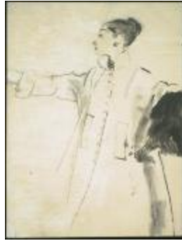
Women's Loose Overcoat with Small Buttons and Fur Muff (KA0038_000107)