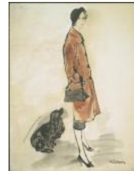
Auburn Velvet Coat (KA0038_000035)