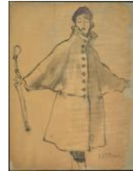
Women's Tent Coat with Dolman Sleeves (KA0038_000018)