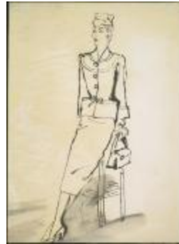
Women's Suit with Yoke and Bow Accents (KA0038_000081)