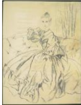
Portrait of Unknown Woman in Full Evening Dress and Drop Necklace (KA0038_000097)