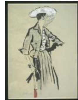
Women's Ensemble with Veiled Hat (KA0038_000009)