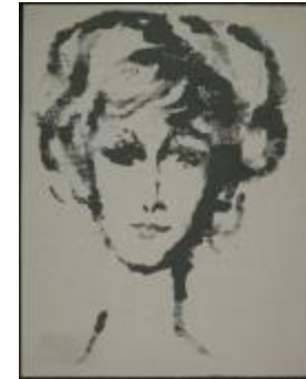
Portrait of Unknown Woman (KA0038_000091)