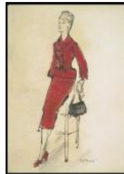
Red Women's Suit with Rounded Yoke (KA0038_000001)