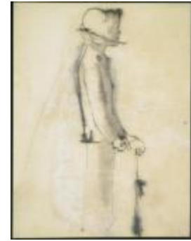
Women's Fitted Jacket and Quilled Hat (KA0038_000098)