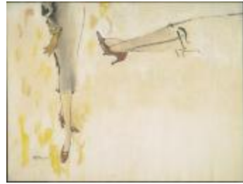
Fitted Skirts with Red or Orange Pumps (KA0038_000083)