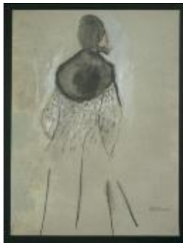
Women's Tweed Coat with Sealskin Collar (KA0038_000007)