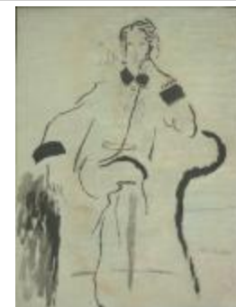
Women's Ensemble Featuring Coat with Flap Closure and Dark Collar (KA0038_000078)