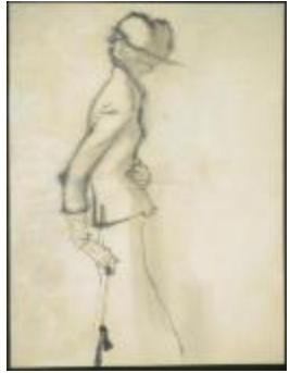
Women's Fitted Jacket and Quilled Hat (KA0038_000105)