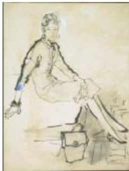
Women's Cardigan Suit (KA0038_000014)