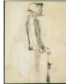
Women's Fitted Jacket and Quilled Hat (KA0038_000098)