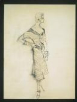
Short-Sleeved Dress with Diagonal Stripes (KA0038_000103)