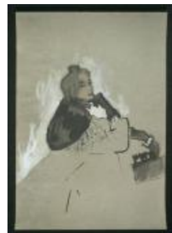
Women's Coat with Oversized Collar (KA0038_000008)