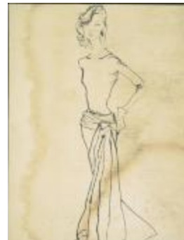
Long-Sleeved Evening Dress with Low-Slung Girdle (KA0038_000130)