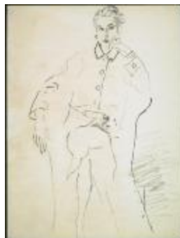
Women's Ensemble Featuring Coat with Flap Closure (KA0038_000100)