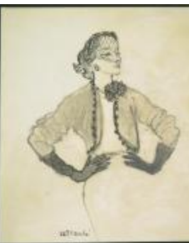
Blond Fleece Jacket with Black Braid and Tassels (KA0038_000063)