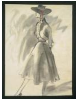
Women's Ensemble with Bolero Jacket and Full Skirt (KA0038_000006)