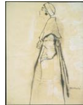
High-Waisted Women's Coat with Shawl Collar (KA0038_000031)