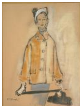
Women's "BÃ©nÃ©dictine" Wool Coat (KA0038_000026)