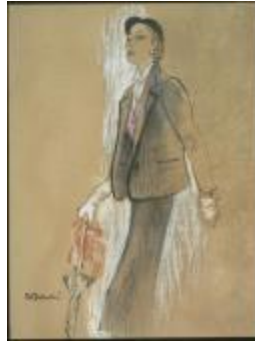
Box-Jacket Suit with Pink Velvet Vest (KA0038_000022)