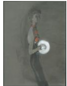
Wool Plaid and Velveteen Directoire Suit (KA0038_000050)