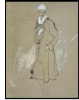
Women's Coat with White Ermine Collar (KA0038_000003)