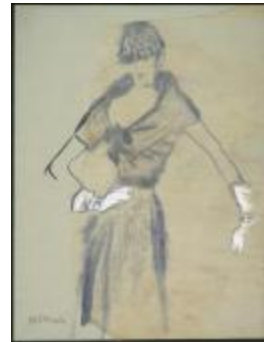
Short Dress with Fichu Wrap and Spotted Cap (KA0038_000086)