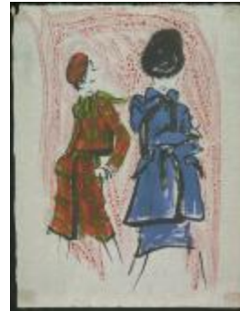
Women's Red Plaid Ensemble and Solid Blue Ensemble (KA0038_000089)