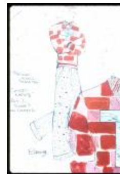
Brick Wall Sweater (KA0006_b01_f06_s20)