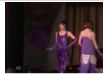
Parsons Fashion Critics Awards Show, Part 2 of 2 (PC070205_UM005)