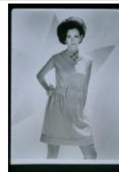
Sleeveless Oyster Jersey Dress (KA0018_binder65_03)