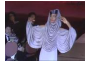
Fashion Critics Awards Show, Part 2 of 2 (PC070205_UM011)