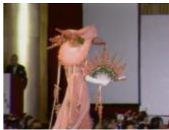
Parsons Fashion Critics Awards Show, Part 2 of 2 (PC070205_UM007)