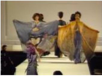
Fashion Critics Awards Benefit, Part 2 of 2 (PC070205_UM030)