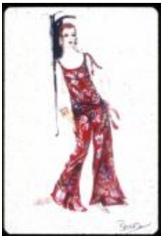
Costume Design Drawing for Star! (KA0006_b01_f06_s06)