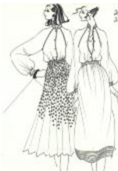
Two Skirt and Shirt Ensembles (KA0006_b02_f04_02)