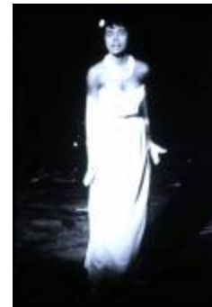
Diahann Carroll in No Strings (KA0006_b01_f06_s49)