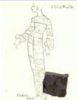
Jewel Neck Evening Gown (KA0006_b02_f02_02)