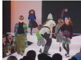
Parsons Fashion Critics Awards Benefit (PC070205_VHS008)