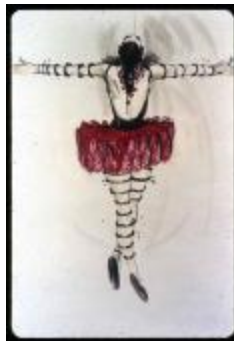
Costume Design Drawing of Circus Performer for Star! (KA0006_b01_f06_s07)