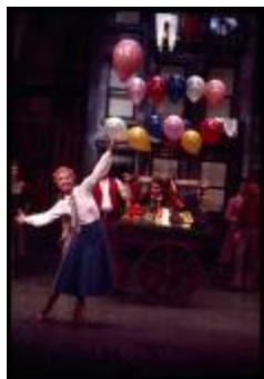
Publicity Photograph of Jane Powell in Irene (KA0006_b01_f06_s33)