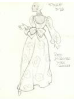
Evening Gown with Bow (KA0006_b02_f01_04)