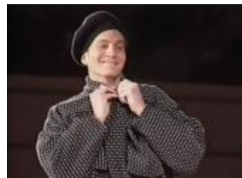
Parsons Fashion Critics Awards Show (PC070205_VHS003)