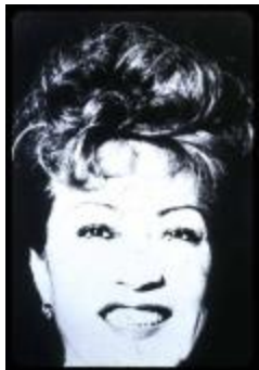
Ethel Merman (KA0006_b01_f06_s47)