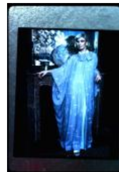
Joanne Woodward in Publicity Photograph for The Drowning Pool (KA0006_b01_f06_s31)