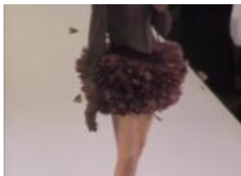
Parsons School of Design Fashion Critics Awards Show, Part 2 of 2 (PC070205_UM025)