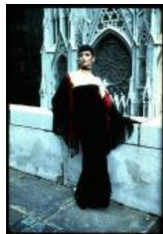
Publicity Photograph for The Bell Jar (KA0006_b01_f06_s34)