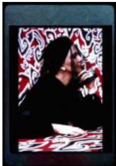
Joanne Woodward Wearing Veil (KA0006_b01_f06_s35)