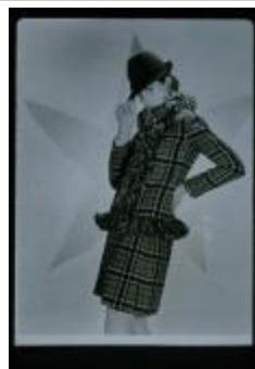
Three-Piece Plaid Suit (KA0018_binder65_02)