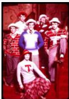
Publicity Photograph for Good News (KA0006_b01_f06_s21)