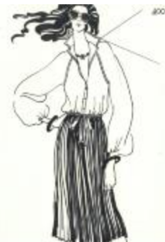
Transeasonal Blouse and Skirt (KA0006_b02_f04_01)