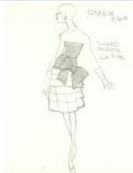
Strapless Drop Waist Cocktail Dress (KA0006_b02_f01_02)