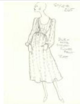
Tea Length Dress (KA0006_b02_f01_03)