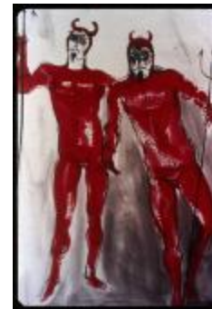
Costume Design Drawing of Devils for Star! (KA0006_b01_f06_s14)