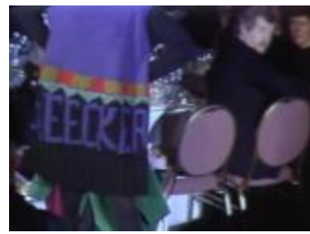
Fashion Critics Awards Show, Part 1 of 2 (PC070205_UM010)