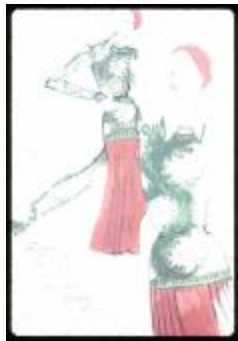
Costume Design Drawing for Good News (KA0006_b01_f06_s23)