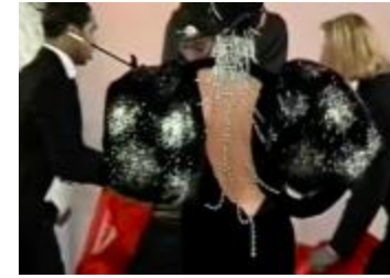
Parsons Fashion Critics Awards Benefit 1998 (PC070205_VHS019)