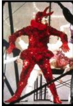
Promotional Still of Devil for Star! (KA0006_b01_f06_s03)