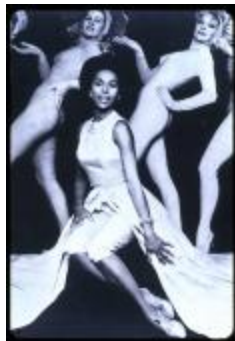
Diahann Carroll with Dancers (KA0006_b01_f06_s45)