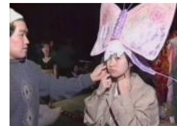
Parsons Fashion Critics Awards Benefit (PC070205_VHS004)