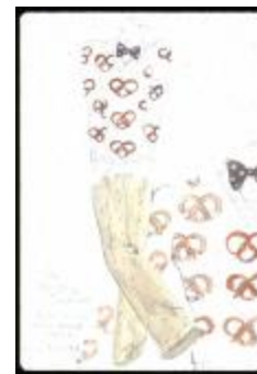
Pretzel Sweater (KA0006_b01_f06_s16)