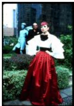
Publicity Photograph for The Bell Jar (KA0006_b01_f06_s30)