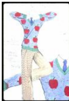
Big Apple Sweater (KA0006_b01_f06_s19)