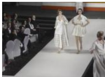
Parsons School of Design Fashion Critics Awards Show, Part 2 of 2 (PC070205_UM027)