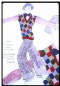
Basket Weave Knit Rib (KA0006_b01_f06_s28)