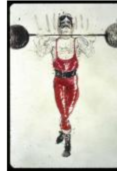
Costume Design Drawing of Strongman for Star! (KA0006_b01_f06_s05)