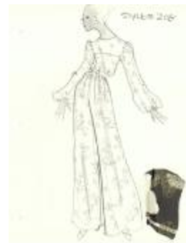
Wide Leg Jumpsuit (KA0006_b02_f02_01)