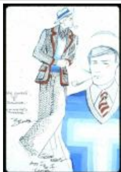
The Ombre (KA0006_b01_f06_s22)