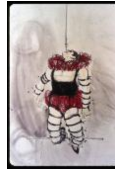
Costume Design Drawing of Trapeze Artist for Star! (KA0006_b01_f06_s01)