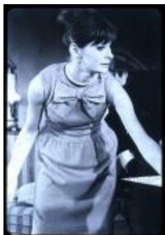
Elizabeth Ashley in Barefoot in the Park (KA0006_b01_f06_s44)