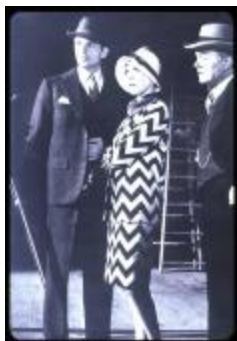
Julie Andrews in Promotional Still for Star! (KA0006_b01_f06_s15)