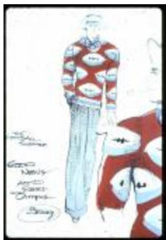
Football Sweater (KA0006_b01_f06_s26)