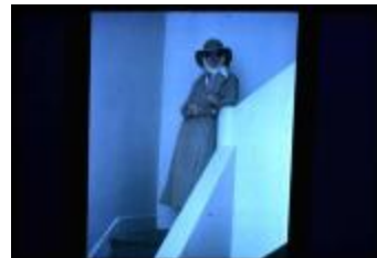
Joanne Woodward (KA0006_b01_f06_s42)