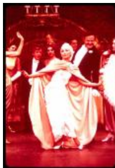
Publicity Photograph for Jane Powell in Irene (KA0006_b01_f06_s48)