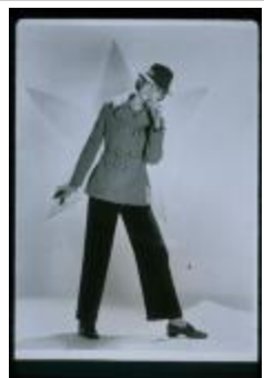
Grey Flannel Slacks, Polka Dotted Blouse, and Double-Breasted Melton Wool Jacket (KA0018_binder65_01)