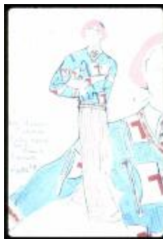
Pennant Sweater (KA0006_b01_f06_s29)