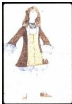
Costume Design for The Amorous Flea (KA0006_b01_f06_s36)