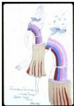
Rainbow Sweater (KA0006_b01_f06_s18)