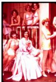
Publicity Photograph for Good News (KA0006_b01_f06_s24)