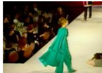
Parsons Fashion Critics Awards Show '89 (PC070205_VHS002)