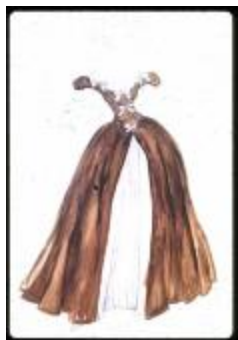
Costume Design for The Amorous Flea (KA0006_b01_f06_s32)