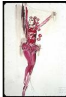
Costume Design Drawing of Circus Performer for Star! (KA0006_b01_f06_s08)