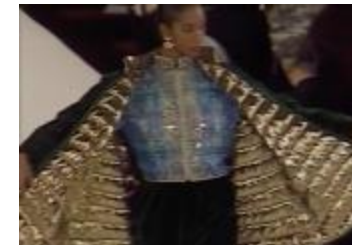
Parsons Fashion Critics Awards Show, Part 2 of 3 (PC070205_UM019)