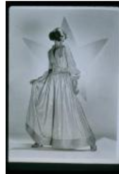
One-Piece Gold Moire Pajama (KA0018_binder65_06)