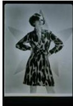
Jersey Fur Print Dress (KA0018_binder65_05)