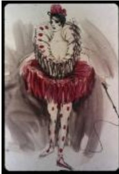
Costume Design Drawing of Ballerina for Star! (KA0006_b01_f06_s02)