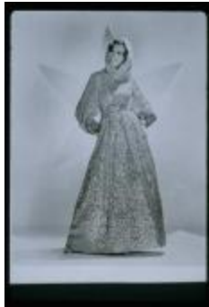
Long-Sleeved Embroidered Sequined Gown (KA0018_binder65_04)