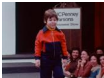
J.C. Penney Parsons Boyswear Show (PC070205_F16_015)