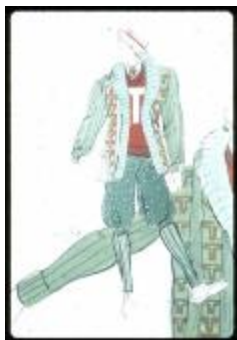
T-Shaped Cable Knit Sweater (KA0006_b01_f06_s17)