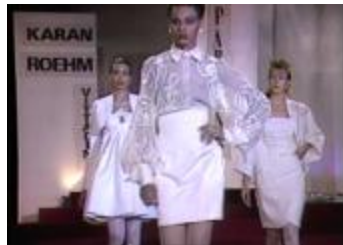
Parsons Fashion Critics Awards Show, Part 1 of 2 (PC070205_UM013)