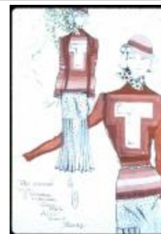
The Ombre, T Sweater and Cardigan (KA0006_b01_f06_s25)