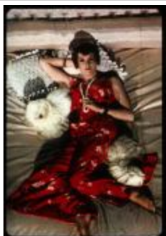
Julie Andrews Models Silk Lounging Pajamas (KA0006_b01_f06_s09)