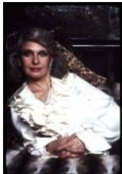
Joanne Woodward (KA0006_b01_f06_s39)