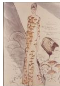
Design for Barbra Streisand's Gown for President Lyndon B. Johnson's Inaugural Gala (KA0006_000001)