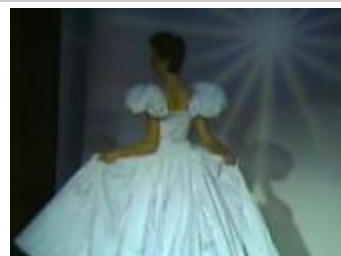
Parsons School of Design Fashion Critics Awards Show, Part 2 of 2 (PC070205_UM033)