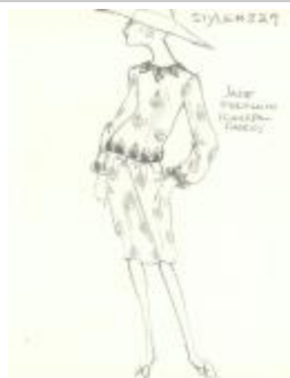
Drop Waist Knee Length Dress (KA0006_b02_f02_03)