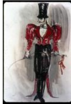
Costume Design Drawing of Ringmaster for Star! (KA0006_b01_f06_s04)