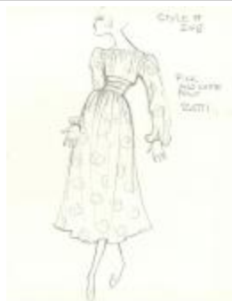
Tea Length Dress (KA0006_b02_f01_01)