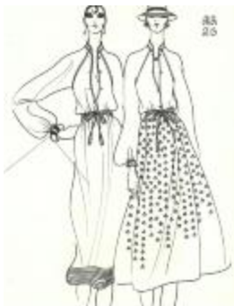
Two Skirt and Shirt Ensembles (KA0006_b02_f04_03)