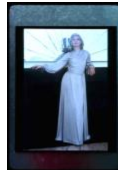
Joanne Woodward (KA0006_b01_f06_s46)