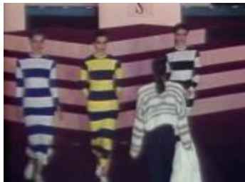
Parsons Fashion Critics Awards Show (PC070205_UM032)