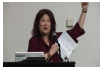
Gender Studies: What Histories Do We Want to Claim? (Session 2) (NS070205_000002)