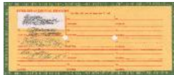
Matsunaga Affair Statements and Publications (NS020801_000011)