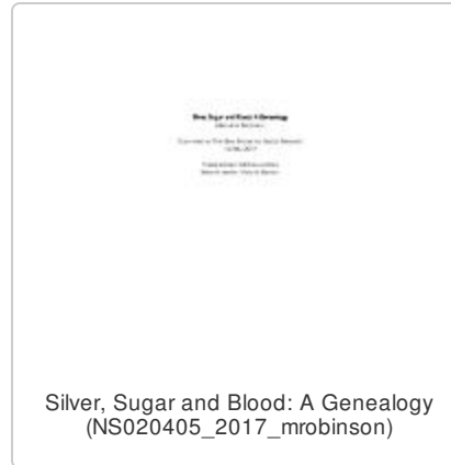
Silver, Sugar and Blood: A Genealogy (NS020405_2017_mrobinson)