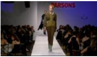
Parsons Fashion Benefit 2010 Welcome (2014NS31_D021)