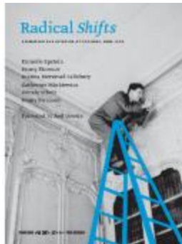
Radical Shifts: Reshaping the Interior at Parsons (1955-1985) exhibition catalog, 2011 (NS080103_000002)