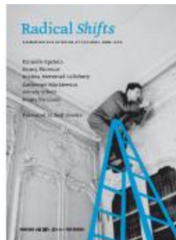
Radical Shifts: Reshaping the Interior at Parsons (1955-1985) exhibition catalog, 2011 (NS080103_000002)