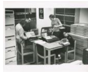
The Anna-Maria and Stephen Kellen Archives of Parsons School of Design (NS030109_000587)