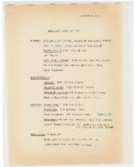
Shopping List New York (KA0023_000016)