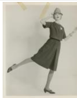
The Stocking, Modern, Magnificent (KA0023_000007)