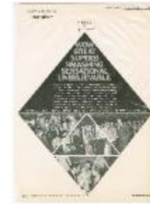
American Viscose Advertisement in Women's Wear Daily (KA0023_000003)