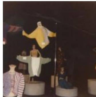
Fashion Group Exhibit (KA0023_000012)