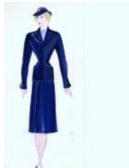
Public Health Nurse Uniform Drawing (KA0023_k04_f04_01)