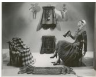
Saks Fifth Avenue Store Window (KA0023_000008)