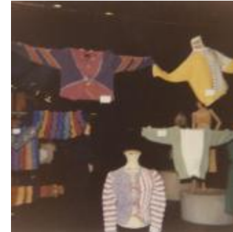
Fashion Group Exhibit (KA0023_000009)