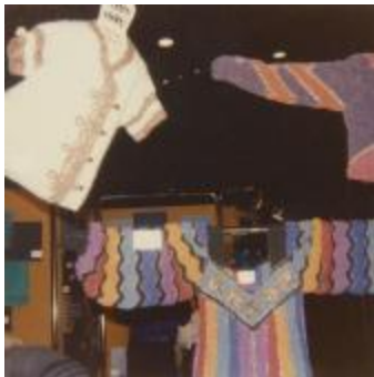
Fashion Group Exhibit (KA0023_000010)