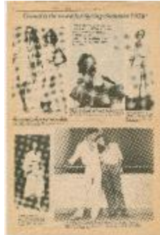
Casual Is the Word for Spring-Summer 1978 (KA0023_000004)