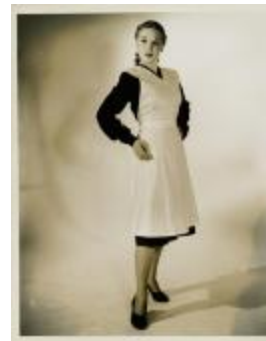
Public Health Nurse Uniform Consisting of Dress and Apron (KA0023_000002)