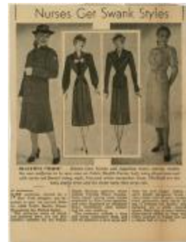
Nurses Get Swank Styles (KA0023_000001)