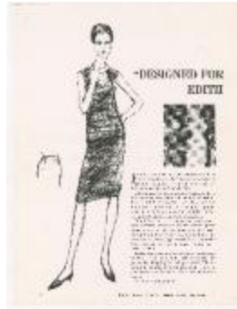
Designed for Stretch by Edith d'Errecalde (KA0023_000005)