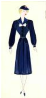
Public Health Nurse Uniform Drawing (KA0023_k04_f04_03)