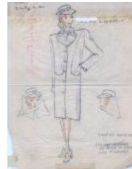
Drawing of Uniform for Public Health Nurses by Edith d'Errecalde for Mainbocher (KA0023_k04_f04_02)