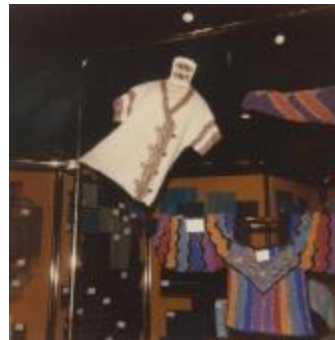
Fashion Group Exhibit (KA0023_000011)