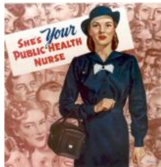
She's Your Public Health Nurse (KA0023_kOSxx2_f06_01)