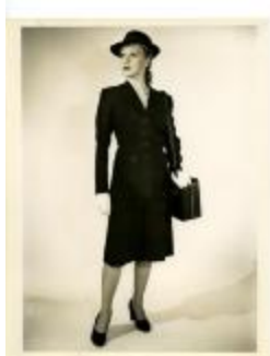
Public Health Nurse (KA0023_b01_f11_01)