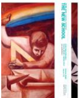
New School Bulletin 2013 Spring Vol. 70 No. 2 (NS050101_ns2013sp)