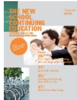
New School Bulletin 2011 Summer Vol. 68 No. 4 (NS050101_ns2011su)