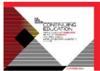
The New School Continuing Education Summer 2016 (NS050101_ce_2016su)