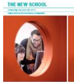
The New School for Public Engagement Continuing Education Fall 2013 Course Bulletin (NS050101_ns2013fa)