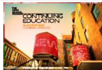
The New School Continuing Education Summer 2015 (NS050101_ce_2015su)