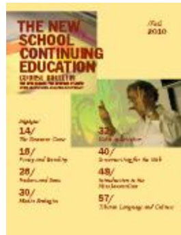
New School Bulletin 2010 Fall Vol. 68 No. 1 (NS050101_ns2010fa)