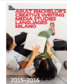
Schools of Public Engagement 2015-2016 (NS050101_pe_2015ye_Final)