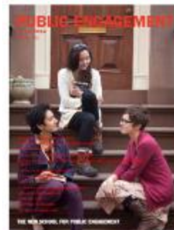
The New School for Public Engagement 2013-2014 (NS050101_pe_2013ye)