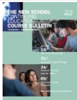
New School Bulletin 2012 Spring Vol. 69 No. 3 (NS050101_ns2012sp)