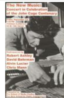
The New Music: Concert in Celebration of the John Cage Centenary (NS020501_000023)