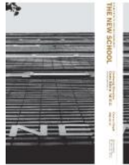
New School Bulletin 2012 Fall Vol. 70 No. 1 (NS050101_ns2012fa)