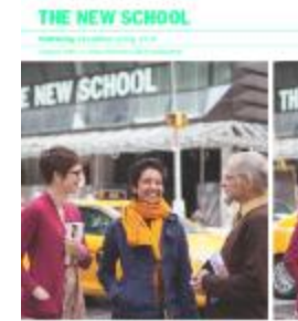
The New School for Public Engagement Continuing Education Spring 2014 Course Bulletin (NS050101_ns2014sp)