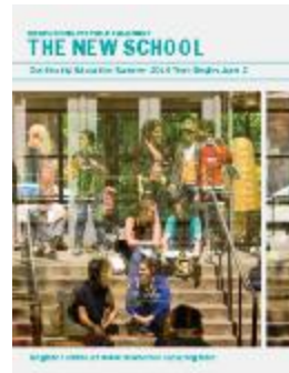
The New School for Public Engagement Continuing Education Summer 2014 Course Bulletin (NS050101_ns2014su)