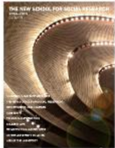
New School for Social Research 2014-2015 (NS050101_gf2014ye)