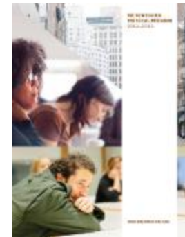
New School for Social Research 2012-2013 Vol. 70 No. 2 (NS050101_gf2012ye)