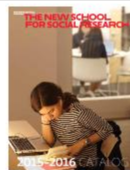
New School for Social Research 2015-2016 (NS050101_nssr_2015ye_Final)