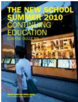
New School Bulletin 2010 Summer Vol. 67 No. 4 (NS050101_ns2010su)