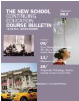
New School Bulletin 2012 Summer Vol. 69 No. 4 (NS050101_ns2012su)