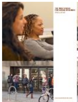
New School for Social Research 2013-2014 (NS050101_gf2013ye)