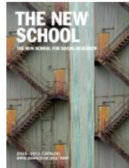
New School for Social Research 2010-2011 Vol. 68 No. 2 (NS050101_gf2010ye)