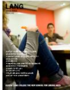
Eugene Lang College The New School for Liberal Arts 2011-2012 (NS050101_lc2011ye)