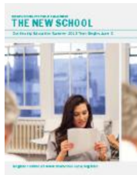
The New School for Public Engagement Continuing Education Summer 2013 Course Bulletin (NS050101_ns2013su)