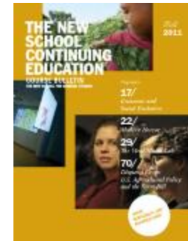
New School Bulletin 2011 Fall Vol. 69 No. 1 (NS050101_ns2011fa)