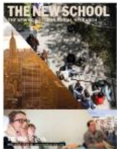
New School for Social Research 2011-2012 Vol. 69 No. 2 (NS050101_gf2011ye)