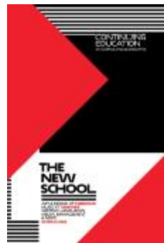
The New School Continuing Education Spring 2016 (NS050101_ce_2016sp)