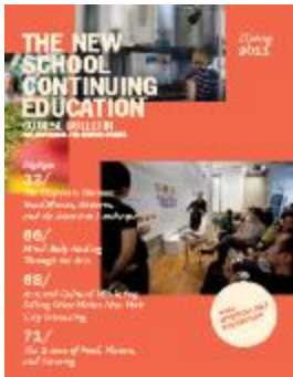
New School Bulletin 2011 Spring Vol. 68 No. 3 (NS050101_ns2011sp)