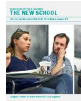
The New School for Public Engagement Continuing Education Fall 2014 Course Bulletin (NS050101_ns2014fa)