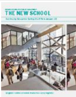
The New School for Public Engagement Continued Education Spring 2015 Course Bulletin (NS050101_ns2015sp)