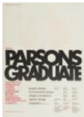
Hire a Parsons Graduate (PIC05007-1_OSxxx1_f01_07)