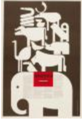
Zoo: Parsonsâ€™™ Design for Environment Competition (PIC05007-1_MCD5_f02_02)