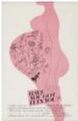
Have You Got It In You? (PIC05007-1_Tube2_01)