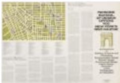
Parsons School of Design Offers You New York's Rive Gauche (PIC05007-1_MCD5_f02_01)