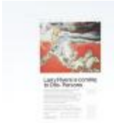
Larry Rivers Is Coming to Otis/Parsons (PIC05007-1_pOSx2_f01_05)