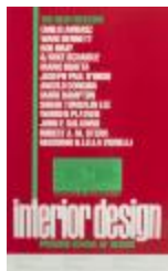
Interior Design: The New Freedom (PIC05007-1_OSxxx1_f05_06)