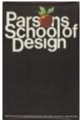
Parsons School of Design (PIC05007-1_Tube1_05)