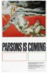
Parsons Is Coming (PIC05007-1_pOSx2_f01_04)