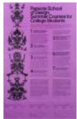
Parsons School of Design Summer Courses for College Students (PIC05007-1_OSxxx1_f04_05)