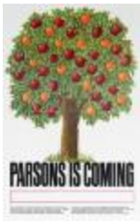
Parsons Is Coming (PIC05007-1_pOSx2_f02_02)