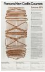
Parsons New Crafts Courses Summer 1979 (PIC05007-1_OSxx1_f03_02)