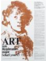
ART Was Rembrandtâ€™™s Major (what's yours?) (PIC05007-1_OSxxx1_f01_10)