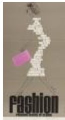
Inside Fashion Now (PIC05007-1_MCD5_f03_03)