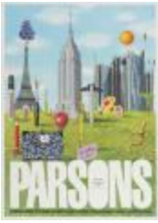
One College, Three Cities: Parsons New York, Los Angeles, Paris (PIC05007-1_OSxxx1_f03_01)