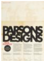
Parsons Designs Your Summer (PIC05007-1_OSxxx1_f01_06)