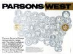
Parsons West: Parsons School of Design Announces Its Merger with the Otis Art Institute of Los Angeles County (PIC05007-1_OSxxx1_f04_02)