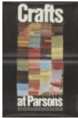
Crafts at Parsons (PIC05007-1_Tube1_01)