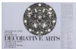
Master of the Arts in the History of Decorative Arts: Cooper Hewitt Museum & Parsons School of Design (PIC05007-1_OSxxx1_f03_04)