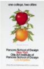
One College, Two Cities: Parsons School of Design New York Otis Art Institute of Parsons School of Design Los Angeles (PIC05007-1_OSxx1_f04_07)