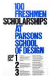
100 Freshmen Scholarships at Parsons School of Design (PIC05007-1_OSxx1_f03_03)