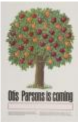
Otis/Parsons Is Coming (PIC05007-1_pOSx2_f02_03)