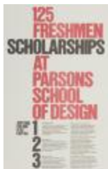
125 Freshmen Scholarships at Parsons School of Design (PIC05007-1_OSxx1_f06_06)