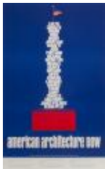
American Architecture Now (PIC05007-1_OSxxx1_f05_02)