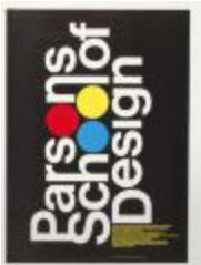
Parsons School of Design (PIC05007-1_OSxxx1_f01_08)