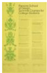
Parsons School of Design Summer Courses for College Students (PIC05007-1_OSxxx1_f04_07)