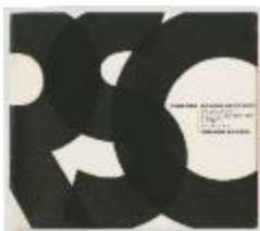
Fashion Award Show (PC020201_000041)