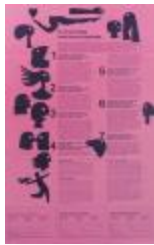
Parsons School of Design Summer Courses for College Students (PIC05007-1_OSxxx1_f04_06)