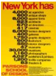
New York Has (PIC05007-1_OSxxx1_f04_08)