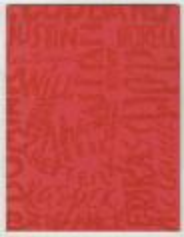
Parsons School of Design Presents A Student and Alumni Fashion Show and Ceremony Marking the College's Seventy-Fifth Anniversary and the Establishment of the Adam L. Gimbel Design Library (PC020201_000016)