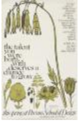
the talent you were born with deserves a chance to grow (PIC05007-1_Tube2_04)