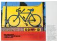
Parsons School of Design Portfolio and Catalog (PIC05007-1_OSxxx1_f02_01)