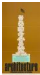
American Architecture Now (PIC05007-1_MCD5_f03_02)