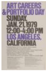
Art Careers & Portfolio Day (PIC05007-1_OSxx1_f03_04)