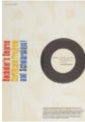
Bachelor's Degree, Certificate Program, and Scholarships! (PIC05007-1_OSxxx1_f01_05)