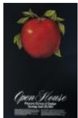
Open House (PIC05007-1_pOSx2_f03_05)