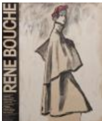
Rene Bouche: The Inaugural Exhibition (PIC05007-1_OSxxx1_f02_02)