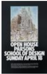
Open House (PIC05007-1_pOSx2_f03_06)