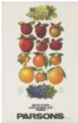
Parsons New York, Los Angeles, Paris (PIC05007-1_Tube1_03)