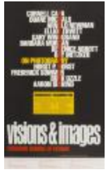
Visions & Images (PIC05007-1_OSxxx1_f05_05)