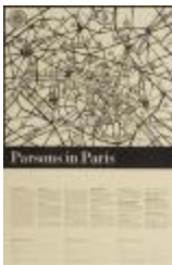
Parsons in Paris (PIC05007-1_OSxxx1_f02_06)