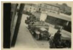
New York School of Fine and Applied Art Students on Group Tour (PIC03002_b17_f15_10)