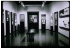
Gallery View (PIC03002_b14_f05_02)