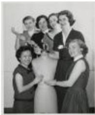
Gold Thimble Award Winners (PC030201_b16_f02_02)