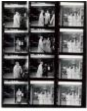
Students Exit Parsons School of Design (PIC03002_b17_f09_03)