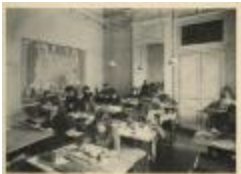
Paris Ateliers Classroom (PIC03002_b17_f15_33)