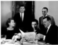
Dinner Plans at Restaurant Lut ce (PIC03002_b09_f13_01)