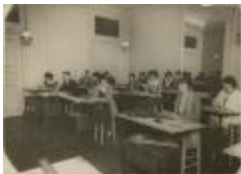
Parsons School of Design Students, Paris Ateliers (PC030201_b17_f18_02)