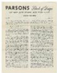
Parsons School of Design Alumni Bulletin (Apr 1951) (NS050601_PSDAlum_195104)