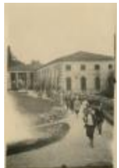
New York School of Fine and Applied Art Students Exit Building (PIC03002_b17_f15_19)