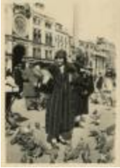
Woman with Pigeons (PIC03002_b17_f15_51)