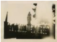
New York School of Fine and Applied Art Students with Statue (PIC03002_b17_f15_16)