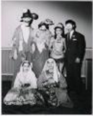
Three Couples in Costume (PIC03002_b17_f01_13)