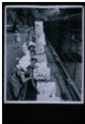
Parsons School of Design Illustration Students at the Bronx Zoo (PIC03002_b19_f09_03)