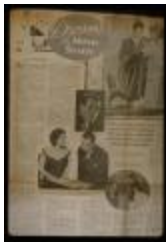
Dressing the Movie Stars (PIC03002SB_vol1_123)