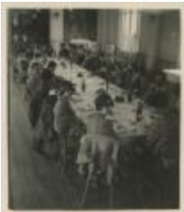
New York School of Fine and Applied Art Students Dine (PIC03002_b17_f15_23)