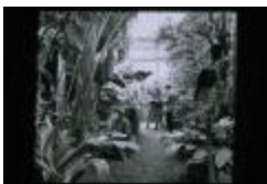
Parsons School of Design Student Illustrators in Greenhouse (PIC03002_b19_f13_02)