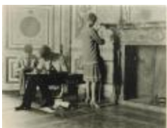
New York School of Fine and Applied Art Students Work in Palazzo Ducale (PIC03002_b17_f14_03)