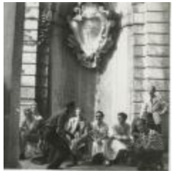
Parsons School of Design Students in Venice Courtyard (PC030201_b19_f01_01)