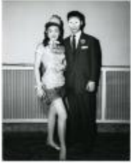
Couple in Costume (PIC03002_b17_f01_08)