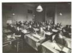
Class in the Paris Ateliers (PIC03002_b17_f19_03)