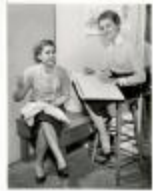
Two Parsons School of Design Fashion Design Students with Sketchpads (PIC03002_b12_f11_03)