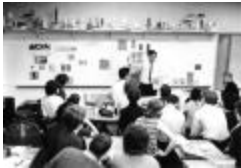
Graphic Design Class (PIC03002_b12_f16_01)