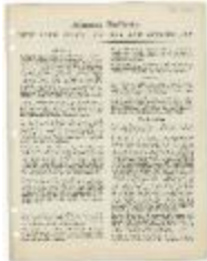
Alumni Bulletin New York School of Fine and Applied Art (Nov 1940) (NS050601_PSDAlum_194011)