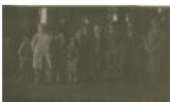
Group from New York School of Fine and Applied Art (PIC03002_b17_f15_30)