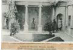
New York School of Fine and Applied Art Students at Palazzo Ducale (PIC03002_b17_f14_02)