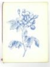
Menu for Norman Norell Supper at Restaurant Lut ce (PIC03002_b32_f09_01_cov)