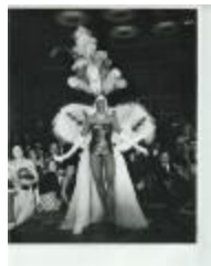
Parsons School of Design Student in Carnival Costume at Mardi Gras Ball (PIC03002_b17_f05_01)