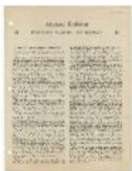
Alumni Bulletin Parsons School of Design (July 1945) (NS050601_PSDAlum_194507)