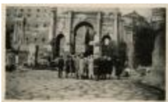
New York School of Fine and Applied Art Students Gather Amid Ruins (PIC03002_b17_f15_35)