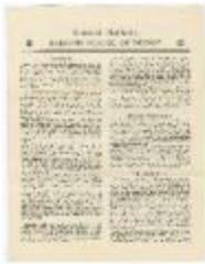
Alumni Bulletin Parsons School of Design (Jan. 1944) (NS050601_PSDAlum_194401)