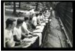
Parsons School of Design Students of Advertising Art Draw Bears at the Bronx Zoo (PIC03002_b19_f09_01)