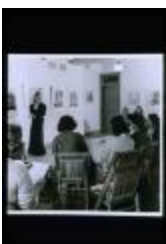
Parsons School of Design Students Sketch Model (PIC03002_b17_f08_06)