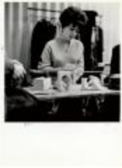
Graphic Design Student with Clay Forms (PIC03002_b12_f16_08)