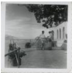
Parsons School of Design Students at Capri (PC030201_b19_f22_03)