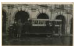
New York School of Fine and Applied Art Students on Bus (PIC03002_b17_f15_37)