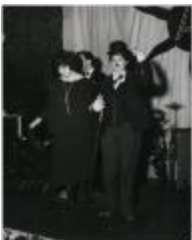
Parsons School of Design Students on Stage at Mardi Gras Ball (PIC03002_b17_f02_04)