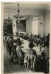
New York School of Fine and Applied Art Students Dine (PIC03002_b17_f15_56)