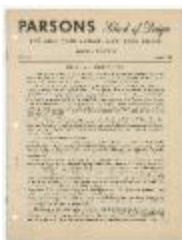
Parsons School of Design Alumni Bulletin (Aug 1948) (NS050601_PSDAlum_194808)