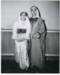
Couple in Costume (PIC03002_b17_f01_07)