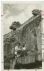
Parsons School of Design Students Sketching in Mexico (PC030201_000049)