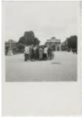
Parsons School of Design Students at the Arc de Triomphe (PC030201_b19_f22_01)