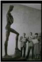
Parsons School of Design Students at Museum of Modern Art (PIC03002_b19_f12_01)