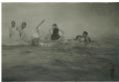
New York School of Fine and Applied Art Students Swim (PIC03002_b17_f15_03)