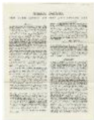
Alumni Bulletin New York School of Fine and Applied Art (Dec 1941) (NS050601_PSDAlum_194112)