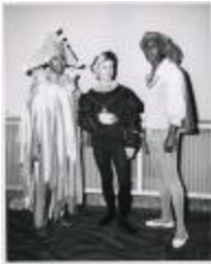
Group of Three Parsons School of Design Students Dressed in Costume at Mardi Gras Ball (PIC03002_b17_f01_10)