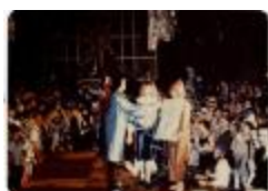
Parsons School of Design Students on Stage at Mardi Gras Ball (PIC03002_b17_f05_04)