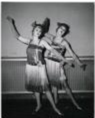
Two Parsons School of Design Students in Flapper Costumes at Mardi Gras Ball (PIC03002_b17_f01_12)