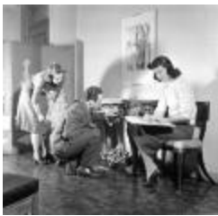
Parsons School of Design Students Examine Furniture (PIC03002_b17_f07_02)