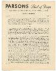
Parsons School of Design Alumni Bulletin (Mar 1949) (NS050601_PSDAlum_194903)