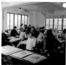
Design Class (PIC03002_b17_f08_02)