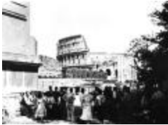
Parsons School of Design Students Visit Coliseum (PIC03002_b17_f14_01)