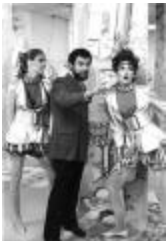
Gibbs College Fiftieth Anniversary Celebration (PIC03002_b14_f14_01)