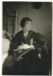
New York School of Fine and Applied Art Student with Notebook (PIC03002_b17_f15_01)