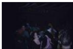
Parsons School of Design Students Dance at Mardi Gras Ball (PIC03002_b17_f04_s05)