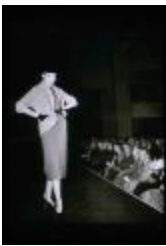
Annual Parsons School of Design Fashion Show (PIC03002_b15_f04_01)