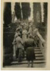
New York School of Fine and Applied Art Students Congregate on Stairs (PIC03002_b17_f15_15)