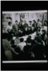
Design Class Roundtable (PIC03002_b12_f09_02)