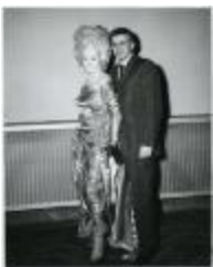
Couple in Eveningwear (PIC03002_b17_f01_06)