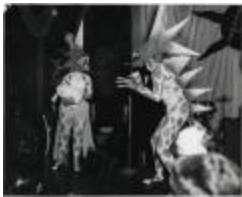
Couple Dressed As Dinosaurs (PIC03002_b17_f02_10)