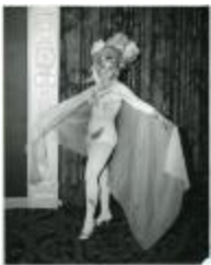
Parsons School of Design Student in Costume at Mardi Gras Ball (PIC03002_b17_f01_05)