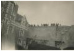
New York School of Fine and Applied Art Students atop a High Wall (PIC03002_b17_f15_14)