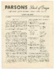
Parsons School of Design Alumni Bulletin (Aug 1949) (NS050601_PSDAlum_194908)