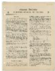
Alumni Bulletin Parsons School of Design (July 1943) (NS050601_PSDAlum_194307)