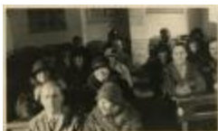
New York School of Fine and Applied Art Students in Classroom (PIC03002_b17_f15_46)