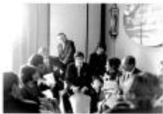
Design Correlations Student Presentation (PIC03002_b14_f19_01)