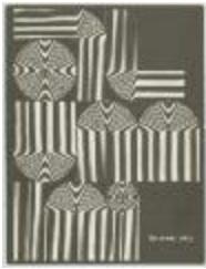
Alumni (Summer 1965) (NS050601_PSDAlum_1965su)