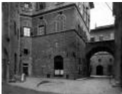
Exterior, Florence Facilities, New York School of Fine and Applied Art (PIC03002_b17_f14_05)