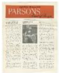
Alumni Bulletin Parsons School of Design (Nov 1954) (NS050601_PSDAlum_195411)