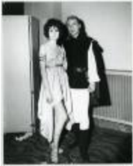
Couple in Costume (PIC03002_b17_f01_09)