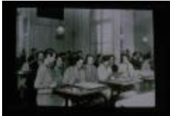
Classroom at Paris Ateliers (PIC03002_b17_f19_05)