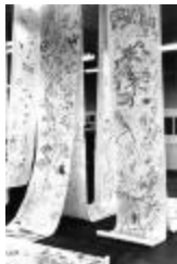
Industrial Designers Society of America at Parsons School of Design (PIC03002_b12_f17_02)