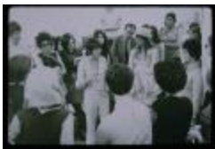
Mary Quant with Parsons School of Design Students (PIC03002_b14_f15_01)