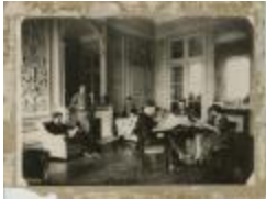
Students in Paris Ateliers (PC030201_b17_f20_02)