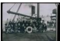
New York School of Fine and Applied Art Students Aboard the SS Rochambeau (PIC03002_b19_f19_02)