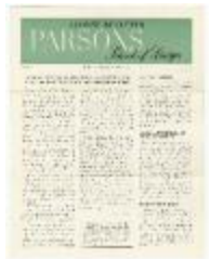
Alumni Bulletin Parsons School of Design (Jul 1954) (NS050601_PSDAlum_195407)