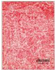
Alumni (Dec 1964) (NS050601_PSDAlum_196412)