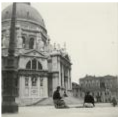
Parsons School of Design Students Sketch Santa Maria della Salute, Venice (PC030201_b19_f02_01)