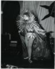
Parsons School of Design Student on Stage in Costume at Mardi Gras Ball (PIC03002_b17_f01_03)