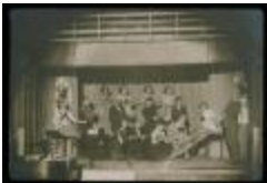
Cast on Stage (PIC03002_b13_f08_02)