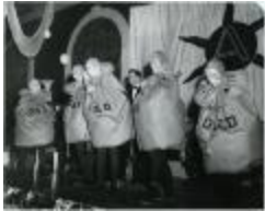
Parsons School of Design Students on Stage at Mardi Gras Ball Dressed as Bags of Gold (PIC03002_b17_f02_01)