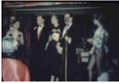
Stage of Mardi Gras Ball (PIC03002_b17_f04_s07)