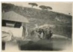
New York School of Fine and Applied Art Students Gather Outdoors (PIC03002_b17_f15_54)