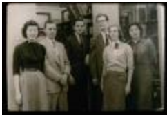
Group Portrait of Parsons School of Design Alumni Scholarship Winners (PIC03002_b18_f22_01)