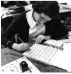
Graphic Design Student Practices Calligraphy (PIC03002_b12_f16_05)