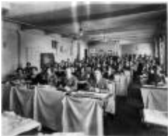
New York School of Fine and Applied Art Students in Classroom (PIC03002_b17_f06_02)