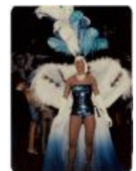
Parsons School of Design Student in Carnival Costume at Mardi Gras Ball (PIC03002_b17_f05_03)