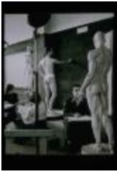
Parsons School of Design Students Studying Figure Drawing (PIC03002_b12_f07_05)