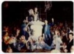
Parsons School of Design Students in Group Costume as "The Birth of Venus" at Mardi Gras Ball (PIC03002_b17_f05_05)