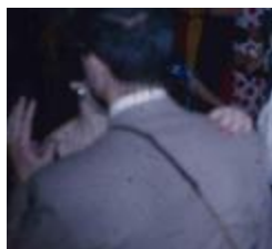
Couple Dance at Mardi Gras Ball (PIC03002_b17_f04_s03)