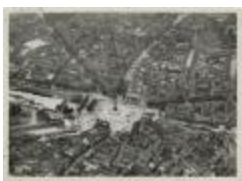
Place de la Bastille (PC030201_b17_f22_01)