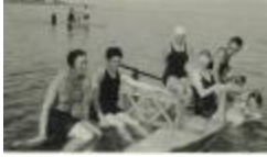
New York School of Fine and Applied Art Students in Water (PIC03002_b17_f15_06)