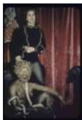
Parsons School of Design Students in Costume at Mardi Gras Ball (PIC03002_b17_f04_s01)