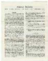
Alumni Bulletin New York School of Fine and Applied Art (July 1941) (NS050601_PSDAlum_194107)