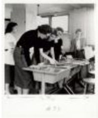
Fashion Illustration Class (PIC03002_b12_f06_03)