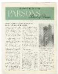
Alumni Bulletin Parsons School of Design (Jul 1952) (NS050601_PSDAlum_195207)