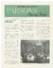
Alumni Bulletin Parsons School of Design (Jul 1953) (NS050601_PSDAlum_195307)