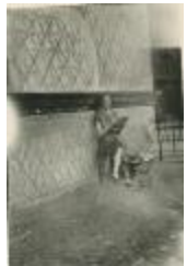
New York School of Fine and Applied Art Student Sketches Outdoors (PIC03002_b17_f15_02)