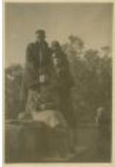
New York School of Fine and Applied Art Students Pose in Garden (PIC03002_b17_f15_50)