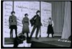
Parsons School of Design Annual Fashion Show (PIC03002_b16_f29_02)