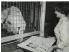
Parsons School of Design Illustration Student with Lioness (PIC03002_b19_f09_02)