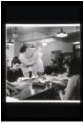
Fashion Design Studio (PIC03002_b17_f09_01)