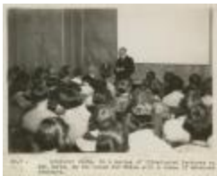
Students in Paris Ateliers (PC030201_b17_f20_03)