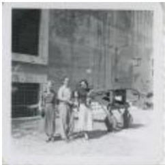
Parsons School of Design Students on European Tour (PC030201_b19_f22_04)