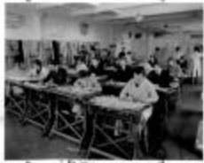
New York School of Fine and Applied Art Students in Studio (PIC03002_b17_f06_01)