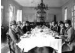
New York School of Fine and Applied Art Students at Dining Table (PIC03002_b17_f20_01)