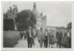
Parsons School of Design Students at Chambord (PC030201_b19_f22_02)