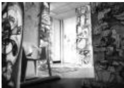
Gibbs College Fiftieth Anniversary Celebration (PIC03002_b14_f14_03)