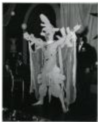
Parsons School of Design Student on Stage at Mardi Gras Ball in Snowflake Costume (PIC03002_b17_f02_08)