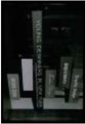
Young Designers In New York (PIC03002_b14_f05_01)