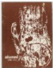
Alumni (June 1966) (NS050601_PSDAlum_196606)