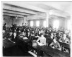
New York School of Fine and Applied Art Students in Classroom (PIC03002_b17_f06_03)