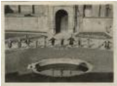
Parsons School of Design Students in Caen, Bayeux (PC040101_b07_f11_03)