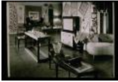
Interior Design of Living Room (PIC03002_b13_f04_01)