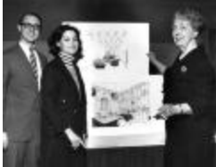
Presentation of Scholarship Award to Parsons School of Design Students (PIC03002_b13_f01_03)