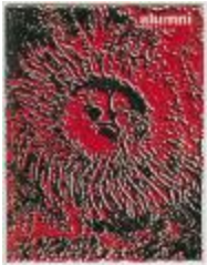
Alumni (Winter 1967) (NS050601_PSDAlum_1967wi)