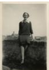
New York School of Fine and Applied Art Student on Wall (PIC03002_b17_f15_20)