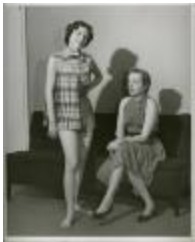
Claire McCardell with Parsons School of Design Student (PC030201_b15_f18_02)