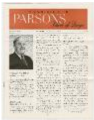
Alumni Bulletin Parsons School of Design (Nov 1959) (NS050601_PSDAlum_195911)