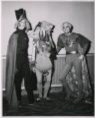
Three Parsons School of Design Students in Costume at Mardi Gras Ball (PIC03002_b17_f01_14)