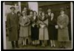
New York School of Fine and Applied Art Students on Deck (PIC03002_b19_f19_01)