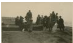
New York School of Fine and Applied Art Students on Beach (PIC03002_b17_f15_34)