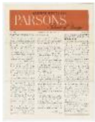
Alumni Bulletin Parsons School of Design (Dec 1955) (NS050601_PSDAlum_195512)