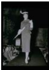
Model on Runway (PIC03002_b16_f07_01)