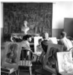
Parsons School of Design Students Sketch Bust (PIC03002_b12_f07_01)