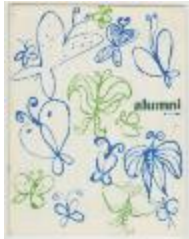
Alumni (July 1964) (NS050601_PSDAlum_196407)