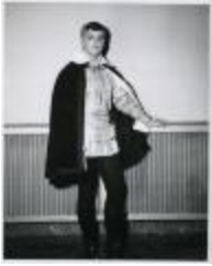
Parsons School of Design Student in Costume at Mardi Gras Ball (PIC03002_b17_f01_02)