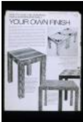
How to Give the Versatile Popular Parsons Table Your Own Finish (PIC03002SB_vol10_33)