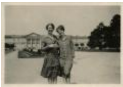
Women with Chateau (PIC03002_b17_f15_28)