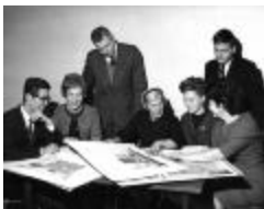
Student Design Competition Committee with Winners (PIC03002_b13_f01_01)