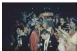
Parsons School of Design Students in Costume at Mardi Gras Ball (PIC03002_b17_f04_s06)