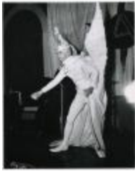
Parsons School of Design Student on Stage at Mardi Gras Ball (PIC03002_b17_f02_02)