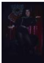
Parsons School of Design Student Poses in Dance Position at Mardi Gras Ball (PIC03002_b17_f04_s02)