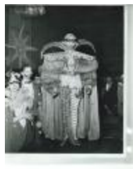
Parsons School of Design Student in Harlequin Costume at Mardi Gras Ball (PIC03002_b17_f05_02)