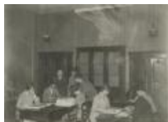
Students at Work (PC030201_b17_f20_05)