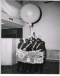
Parsons School of Design Students in Group Costume at Mardi Gras Ball (PIC03002_b17_f01_01)