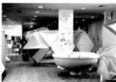
Design Correlations Student Presentation (PIC03002_b14_f19_02)