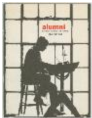
Alumni Parsons School of Design (Nov 1962) (NS050601_PSDAlum_196211)