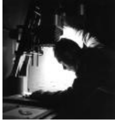
Graphic Design Student Practices Photography (PIC03002_b12_f16_07)