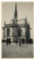
New York School of Fine and Applied Art Students Outside Chapel (PIC03002_b17_f15_40)