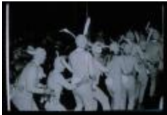
Guests Dance in Bunny Costumes (PIC03002_b17_f03_01)