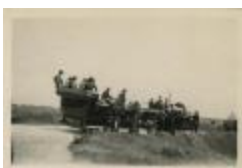
New York School of Fine and Applied Art Students on Group Tour (PIC03002_b17_f15_13)