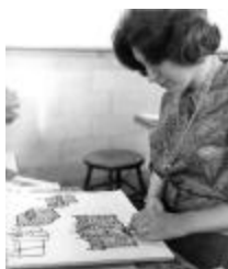
Graphic Design Student at Work (PIC03002_b12_f16_04)