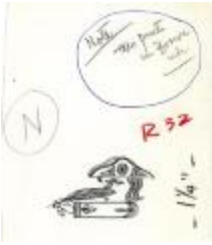
Man in Hat (PIC03002_b18_f04_02)