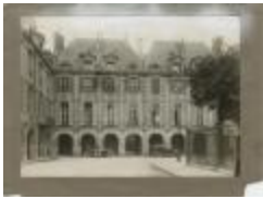
Exterior of Paris Ateliers (PC030201_b17_f16_01)