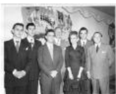
Parsons School of Design Student Award Recipients (PC030201_b13_f09_01)