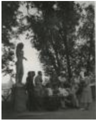
Parsons School of Design Students Gather at Palatine Hill, Rome (PC030201_b19_f04_01)