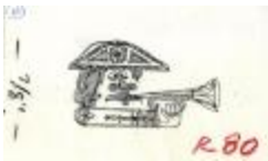
Man Blowing Trumpet (PIC03002_b18_f04_04)