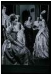
Parsons School of Design Student Illustrators at the Metropolitan Museum of Art (PIC03002_b19_f13_01)