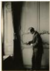
Man Inspecting Wall Paneling (PIC03002_b17_f15_11)