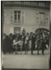
New York School of Fine and Applied Art Students Line-Dance (PIC03002_b17_f15_52)