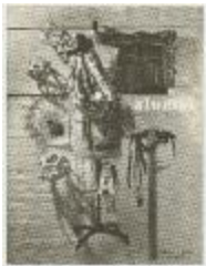
Alumni Parsons School of Design (Feb 1961) (NS050601_PSDAlum_196102)