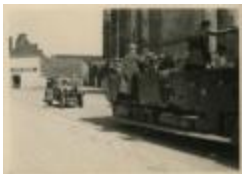
New York School of Fine and Applied Art Students Board Bus (PIC03002_b17_f15_55)