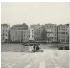
Parsons School of Design Students Sketching by a Canal in Venice (PC030201_b19_f02_02)