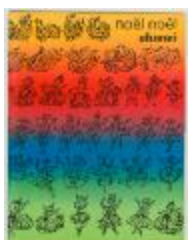
Noel Noel Alumni (Dec 1966) (NS050601_PSDAlum_196612)