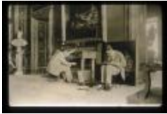
New York School of Fine and Applied Art Students Work in Villa Borghese (PIC03002_b17_f14_04)