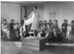
Paris Ateliers Fashion Illustration Class (PIC03002_b17_f19_01)