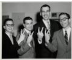
Gold Thimble Award Winners (PC030201_b16_f02_01)