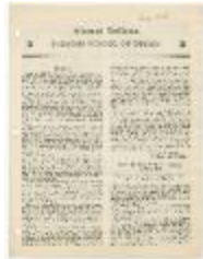
Alumni Bulletin Parsons School of Design (Aug 1946) (NS050601_PSDAlum_194608)