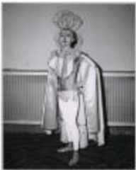
Parsons School of Design Student in Costume at Mardi Gras Ball (PIC03002_b17_f01_11)