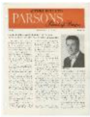
Alumni Bulletin Parsons School of Design (Nov 1952) (NS050601_PSDAlum_195211)