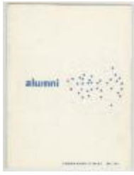
Alumni Parsons School of Design (May 1963) (NS050601_PSDAlum_196305)