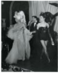
Couple on Stage (PIC03002_b17_f02_05)