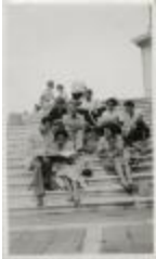
Parsons School of Design Students on Steps of Santa Maria della Salute, Venice (PC030201_b19_f01_02)