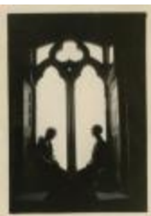
Women in Window (PIC03002_b17_f15_12)