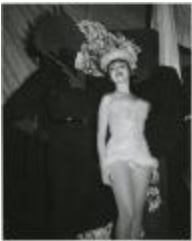
Couple in Costume (PIC03002_b17_f02_03)