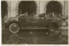
New York School of Fine and Applied Art Students in Bus (PC030201_b17_f21_03)