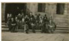
New York School of Fine and Applied Art Students Outside Building (PIC03002_b17_f15_48)