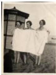
New York School of Fine and Applied Art Students on Beach in Venice (PC030201_b17_f15_58)