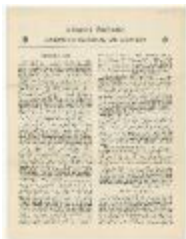
Alumni Bulletin Parsons School of Design (Dec 1944) (NS050601_PSDAlum_194412)