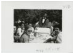
Fashion Design Department Alumni Picnic (PC030201_b14_f13_01)