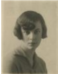
Portrait of New York School of Fine and Applied Art Student (PIC03002_b17_f15_22)