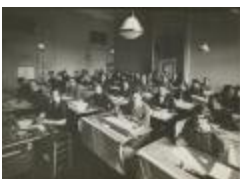
Class in the Paris Ateliers (PC030201_b17_f19_02)