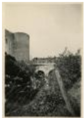
New York School of Fine and Applied Art Students on Bridge (PIC03002_b17_f15_24)