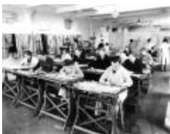
Students in Studio (PIC03002_b17_f07_01)