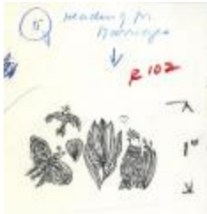
Butterfly, Flower, and Birds with Hearts (PIC03002_b18_f04_03)