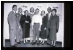
Parsons School of Design Students and Staff with Philip Johnson (PIC03002_b13_f12_01)