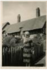
Woman by Cottage (PIC03002_b17_f15_27)