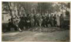
New York School of Fine and Applied Art Students Seated Along Wall (PIC03002_b17_f15_42)