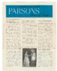
Alumni Bulletin Parsons School of Design (Mar 1954) (NS050601_PSDAlum_195403)