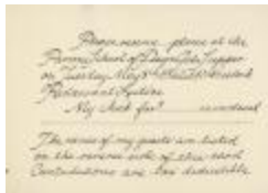
Reply card for Parsons School of Design Alumni Association's Norman Norell Supper at Lutece (PC030201_000002)