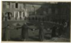
New York School of Fine and Applied Art Students in Circle Formation (PIC03002_b17_f15_39)