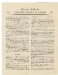
Alumni Bulletin Parsons School of Design (July 1942) (NS050601_PSDAlum_194207)