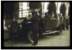
New York School of Fine and Applied Art Students in Bus (PIC03002_b17_f21_02)