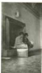
New York School of Fine and Applied Art Students with Sketchbook (PIC03002_b17_f15_04)