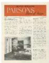
Alumni Bulletin Parsons School of Design (Nov 1953) (NS050601_PSDAlum_195311)