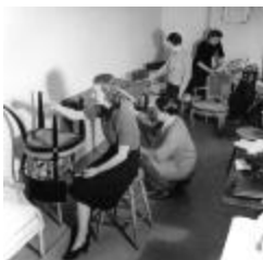
Parsons School of Design Students Measure Furniture (PIC03002_b17_f08_03)