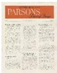
Alumni Bulletin Parsons School of Design (Nov 1951) (NS050601_PSDAlum_195111)