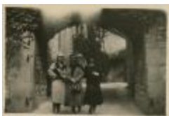
New York School of Fine and Applied Art Students Beneath Arch (PIC03002_b17_f15_26)