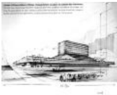
Concept of Parsons School of Design (PIC03002_b17_f12_01)