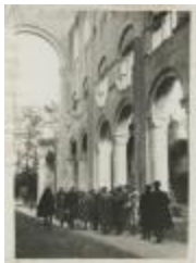
Parsons School of Design Students at Jumieges (PC030201_b19_f19_03)