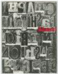
Alumni (Jan 1964) (NS050601_PSDAlum_196401)