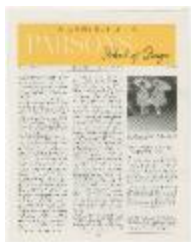
Alumni Bulletin Parsons School of Design (Jul 1957) (NS050601_PSDAlum_195707)