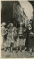
New York School of Fine and Applied Art Students with Musical Instruments (PIC03002_b17_f15_49)