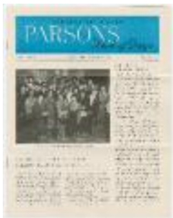
Alumni Bulletin Parsons School of Design (Nov 1958) (NS050601_PSDAlum_195811)