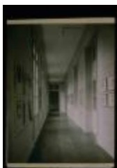
Hall in Paris Ateliers (PIC03002_b17_f17_01)