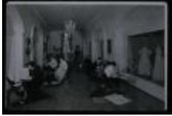
Students Study Costumes (PIC03002SB_vol1_40_02)