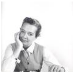
Claire McCardell (PIC03002_b11_f15_01)