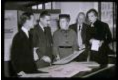
Baker Competition Judges (PIC03002_b13_f11_02)