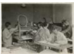
Students wearing smocks measure chairs in the Paris Ateliers (PC030201_b17_f19_04)