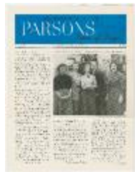
Alumni Bulletin Parsons School of Design (Jul 1956) (NS050601_PSDAlum_195607)