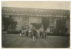
New York School of Fine and Applied Art Students on Lawn (PIC03002_b17_f15_17)