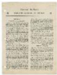
Alumni Bulletin Parsons School of Design (July 1947) (NS050601_PSDAlum_194707)