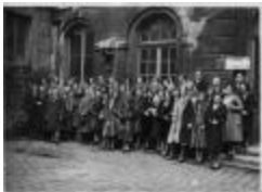
New York School of Fine and Applied Art Students in Winter Coats (PIC03002_b17_f21_01)