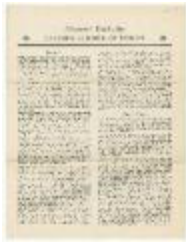
Alumni Bulletin Parsons School of Design (Dec 1942) (NS050601_PSDAlum_194212)