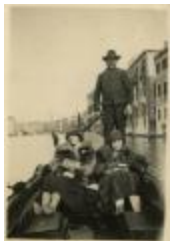
Women in Gondola (PIC03002_b17_f15_25)