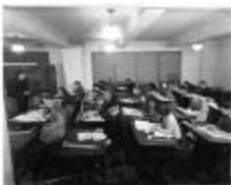
Product Illustration Class (PIC03002_b17_f08_01)