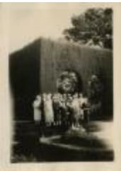
New York School of Fine and Applied Art Students with Topiary (PIC03002_b17_f15_18)