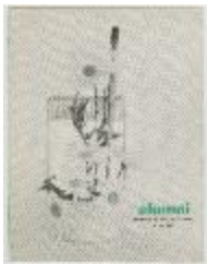
Alumni Parsons School of Design (Apr 1962) (NS050601_PSDAlum_196204)