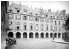
Exterior of Paris Ateliers (PIC03002_b17_f16_02)