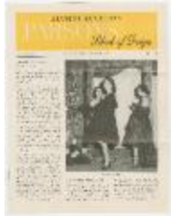
Alumni Bulletin Parsons School of Design (Jul 1958) (NS050601_PSDAlum_195807)