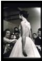
Claire McCardell with Parsons School of Design Fashion Design Students (PIC03002_b27_f04_01)