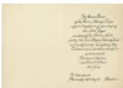
Invitation for Parsons School of Design Alumni Association Dinner (PC030201_000001)