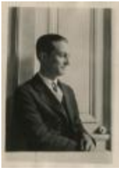
Man with Wall Paneling (PIC03002_b17_f15_57)