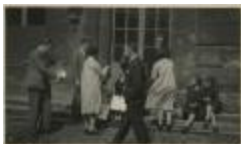
New York School of Fine and Applied Art Students Congregate, Smoke (PIC03002_b17_f15_44)