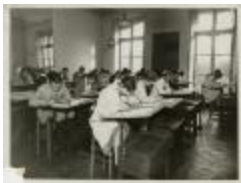
Students at Work in the Paris Ateliers (PC030201_b17_f18_01)