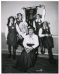
Group of Six Parsons School of Design Students Dressed in School Girls' Uniforms at Mardi Gras Ball (PIC03002_b17_f01_04)