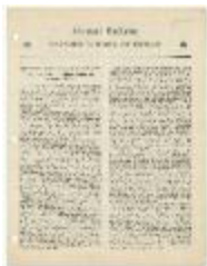
Alumni Bulletin Parsons School of Design (Jan 1947) (NS050601_PSDAlum_194701)