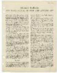
Alumni Bulletin New York School of Fine and Applied Art (May 1940) (NS050601_PSDAlum_194005)