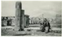
New York School of Fine and Applied Art Students at Pompeii (PIC03002_b17_f15_05)