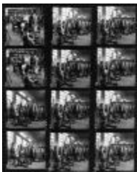
Life Drawing Class (PIC03002_b12_f06_02)