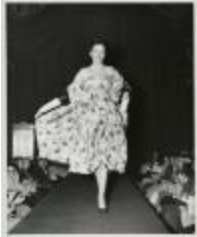
Student Fashion Show (PC030201_b16_f08_01)