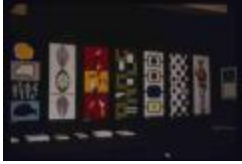
Graphic Design Exhibit (PIC03002_b13_f05_s01)