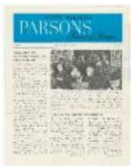
Alumni Bulletin Parsons School of Design (Mar 1952) (NS050601_PSDAlum_195203)