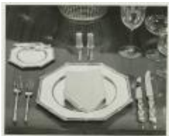
Place Setting Designed by Van Day Truex for Tiffany & Co. (PC030201_000061)