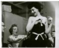
Claire McCardell Visit to Parsons School of Design (PC030201_b16_f10_02)