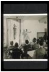
Life Drawing Class (PIC03002_b17_f09_02)