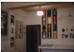
Graphic Design Exhibit (PIC03002_b13_f05_s03)