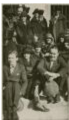
Group from New York School of Fine and Applied Art