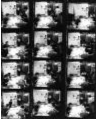
Parsons School of Design Students and Model During Fitting (PIC03002_b12_f11_01)