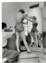
Swimwear Fitting (PIC03002_b12_f13_03)