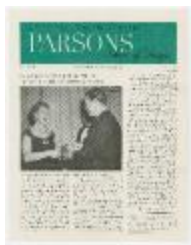
Alumni Bulletin Parsons School of Design (Mar 1957) (NS050601_PSDAlum_195703)