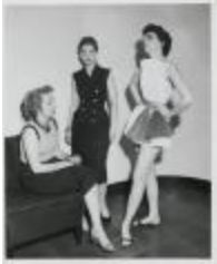
Claire McCardell with Parsons School of Design Students (PC030201_b16_f10_01)