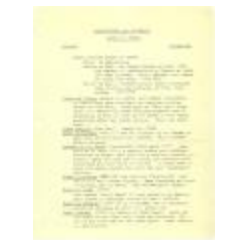
Architecture and Documents, Louis XIV Period (PIC03002_b09_f07_01)