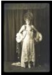
Costume from Student Production The Diplomat (PIC03002_b13_f08_01)