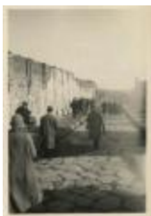
New York School of Fine and Applied Art Students Tour Ruins (PIC03002_b17_f15_53)