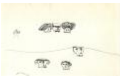
Disembodied Heads (PIC03002_b18_f04_01)