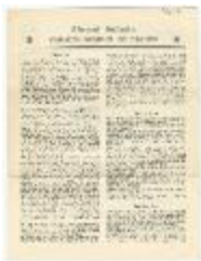
Alumni Bulletin Parsons School of Design (July 1944) (NS050601_PSDAlum_194407)