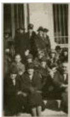
New York School of Fine and Applied Art Students Sit Outdoors (PIC03002_b17_f15_36)