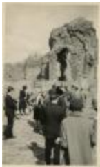
New York School of Fine and Applied Art Students Tour Ruins (PIC03002_b17_f15_31)