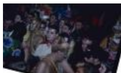
Parsons School of Design Students Dance at Mardi Gras Ball (PIC03002_b17_f04_s04)