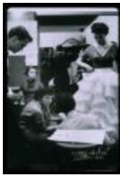
Fitting with Model (PIC03002_b16_f11_01)