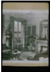
Van Day Truex's Paris Apartment (PIC03002_p04_f05_01)