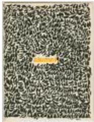
Alumni (Summer 1969) (NS050601_PSDAlum_1969su)