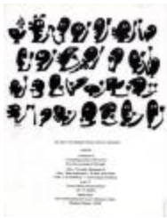
"Saude" Invitation (KA0070_k05_f08_04)