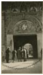
New York School of Fine and Applied Art Students Pass under Archway (PIC03002_b17_f15_38)