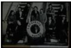
Students Aboard MS Lafayette (PIC03002SB_vol1_40_01)