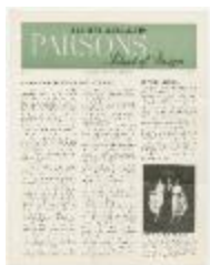
Alumni Bulletin Parsons School of Design (Aug 1955) (NS050601_PSDAlum_195508)