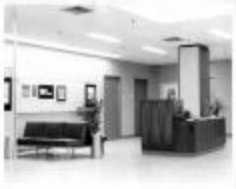
Parsons School of Design Reception Area (PIC03002_b17_f10_01)