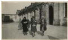
New York School of Fine and Applied Art Students Tour Chateau (PIC03002_b17_f15_45)