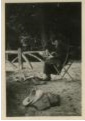
New York School of Fine and Applied Art Student Paints Outdoors (PIC03002_b17_f15_21)