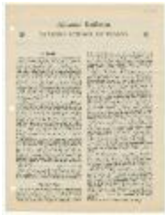
Alumni Bulletin Parsons School of Design (Feb 1946) (NS050601_PSDAlum_194602)