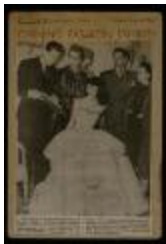
Opening Fashion Exhibit. November 28 1940. (PIC03002SB_vol1_64)