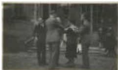
New York School of Fine and Applied Art Students in Courtyard (PIC03002_b17_f15_41)