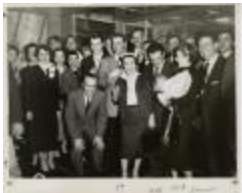
Parsons School of Design's Farewell Party on the Ile de France (PC030201_b19_f01_03)