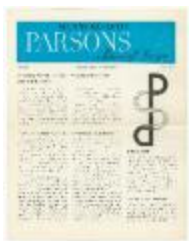
Alumni Bulletin Parsons School of Design (Feb 1955) (NS050601_PSDAlum_195502)