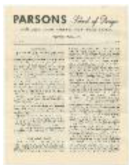
Parsons School of Design Alumni Bulletin (Jan 1950) (NS050601_PSDAlum_195001)