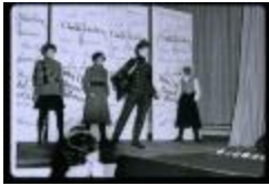
Annual Parsons School of Design Fashion Show (PIC03002_b16_f29_01)