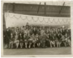
New York School of Fine and Applied Art Students at Pier (PC030201_b19_f19_04)