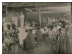
Life Drawing Class at Parsons School of Design (NS030109_000408)