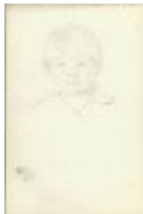
Child's Portrait (KA004201_b02_f01_02)