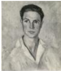
Portrait of Young Adult (KA004201_b01_f01_02)