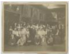
Class of William Merritt Chase (KA0042_000006)