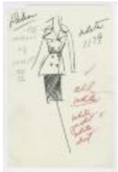
White Women's Ensemble with Belted Jacket (KA0035_000241)