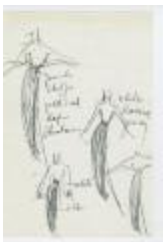
White, Black, and Pink Long-Sleeved Dresses (KA0035_000106)