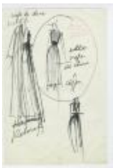
White Crepe de Chine Pleated Dresses (KA0035_000087)