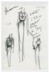
Floor-Length Evening Dress with Nautical Themed Jacket (KA0035_000225)