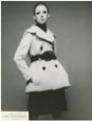
Double-Breasted Coat with Belted Waist and Rounded Collar (KA0035_000055)