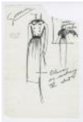
Women's Ensemble with Midi-Length Skirt and Cropped Jacket (KA0035_000224)