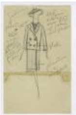
Double-Breasted Coat and Navy Pleated Wrap Skirt (KA0035_000206)