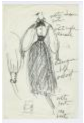
White Satin and Black Velvet Puff-Sleeved Dress (KA0035_000069)