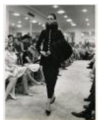
Women's Evening Ensemble with Fur Muff and Embellished Buttons (KA0035_000063)