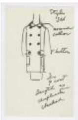
Double-Breasted Coat with Buttoned Straps and Patch Pockets (KA0035_000200)