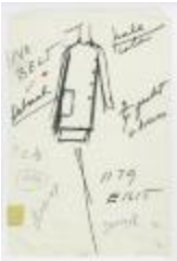
Women's Day Suit with Asymmetrical Jacket (KA0035_000236)