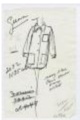
Women's Coat with Pointed Collar and Patch Pockets (KA0035_000221)