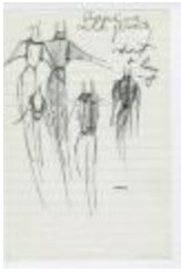
Racine Silk Jersey Dresses (KA0035_000113)