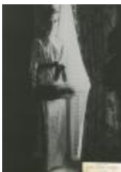
Sequined Evening Ensemble with Fur-Bordered Tunic Top (KA0035_000053)