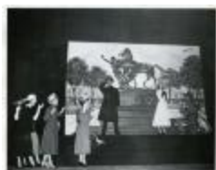
Traina-Norell Fashion Presentation Featuring Models and Costumed Actors (KA0035_000044)