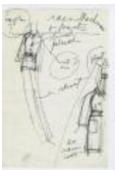
Women's Raincoat and Two-Piece Ensemble (KA0035_000095)