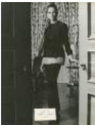
Evening Ensemble with Sequin-Bordered Tunic Top (KA0035_000056)