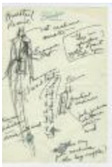
Long-Sleeved Dress with High Collar (KA0035_000125)