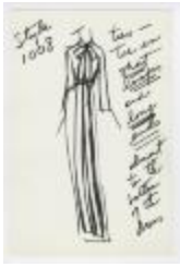
Long-Sleeved Evening Dress with Long Bow Collar (KA0035_000245)