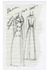
Double-Breasted Evening Coat (KA0035_000242)