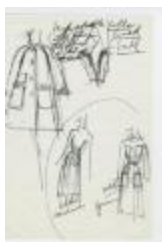
Collarless Tent Coat, White Cashmere Dress, and White Agnona Wool Coat (KA0035_000150)