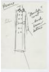
"Burlap" Coat (KA0035_000130)