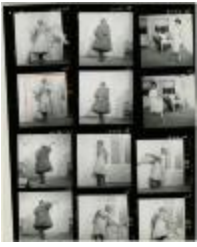
Dinah Shore and Unknown Model Wearing Evening Ensembles by Norell (KA0035_000002)