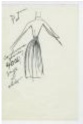
Long-Sleeved Cashmere Jersey Dress (KA0035_000093)