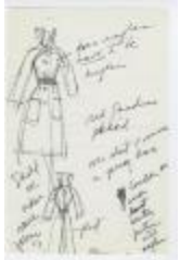
Red Plaid Coat with Raglan Sleeves (KA0035_000075)