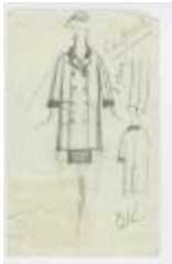
Double-Breasted Chesterfield Coat with Contrast Collar (KA0035_000154)