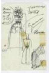
Women's Tweed Ensemble with Bow Collar (KA0035_000137)