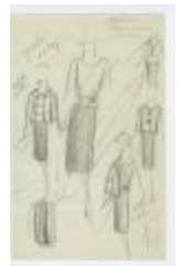
Black and White Women's Ensembles with Box Jackets (KA0035_000161)