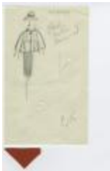
Women's Red Woolen Coat Ensemble (KA0035_000153)