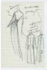
Cashmere Jersey Dress with Alpaca Overcoat (KA0035_000119)