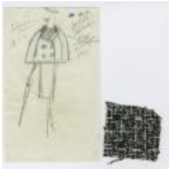
Tweed Women's Suit with Double-Breasted Cape (KA0035_000176)