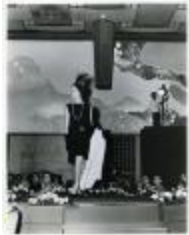
Drop-Waist Dress with Pleated Skirt and Embellished Belt Buckle (KA0035_000049)