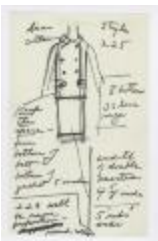
Double-Breasted Coat with Buttoned Straps (KA0035_000199)