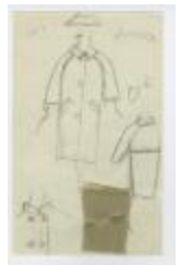
Raglan-Sleeved Overcoat (KA0035_000155)