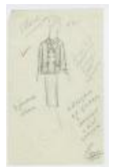
Women's Ensemble with Double-Breasted Box Coat (KA0035_000162)