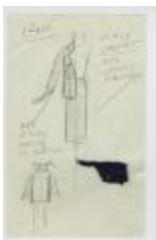
Navy Women's Suit with Red Jersey Facings (KA0035_000157)