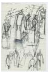
Long-Sleeved Dresses and Raincoats (KA0035_000083)