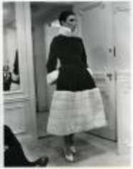
Green Velvet and White Mink Evening Coat (KA0035_000065)