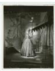
Bonwit Teller Window Display Featuring Evening Gown by Traina-Norell with Setting Inspired by Shakespeare's "Richard II" (KA0001_000362)