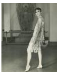
Silver Sequined Fringe Dress (KA0035_000051)