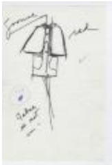
Red Cape Coat (KA0035_000124)