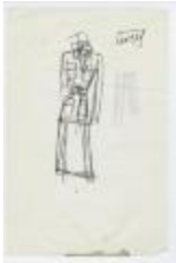
Women's Tweed Suit with Flap Pockets (KA0035_000070)