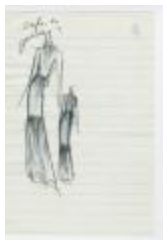
Crepe or Jersey Dress with Flounced Skirt (KA0035_000152)