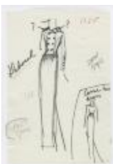
Women's Evening Ensemble with Double-Breasted Jacket (KA0035_000233)