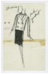
Double-Breasted Red Jacket with Pencil Skirt (KA0035_000208)