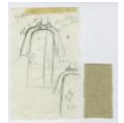
Double-Breasted, Raglan-Sleeved Coat (KA0035_000187)