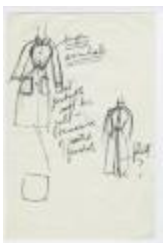
Women's Coat with Raglan Sleeves and Oversized Patch Pockets (KA0035_000123)