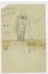
Double-Breasted Jacket with Knee-Length Pleated Skirt (KA0035_000205)