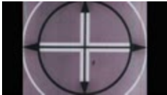
A Parsons Graduate (PC070205_F16_017)