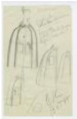
Brocade Evening Cape (KA0035_000156)