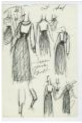
Long-Sleeved Dress with Brown Jersey Skirt (KA0035_000088)