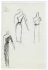
One-Sleeved Dresses (KA0035_000076)