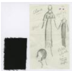
Full-Length Black Dress with Bolero Jacket (KA0035_000175)