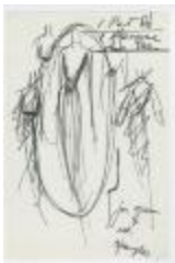
Long-Sleeved Spangled Dress (KA0035_000068)