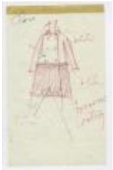
Black and White "Cone" Coat (KA0035_000209)