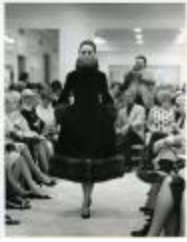
Green Velvet Evening Coat with Sable Trim (KA0035_000064)