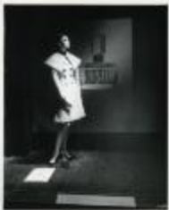
Bonwit Teller Window Display Featuring 'Norell' Perfume and Cape Coat (KA0035_000058)