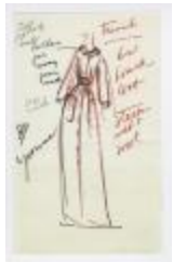
Trench-Style House Coat (KA0035_000215)