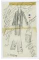
Black Cardigan Suit with White Satin Blouse (KA0035_000207)