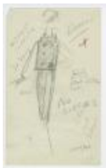
Women's Sleeveless Suit with Bow-Collared Blouse (KA0035_000165)