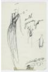
Silk Jersey Dress (KA0035_000067)