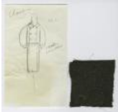
Women's Ensemble with Puffed-Sleeved Jacket (KA0035_000183)