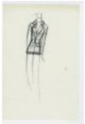
Women's Checked Blazer (KA0035_000117)