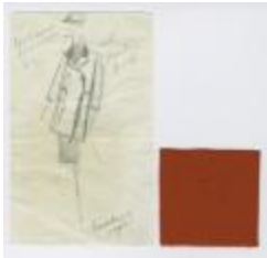
Women's Double-Breasted Chesterfield Coat in "Hunting Pink" (KA0035_000182)