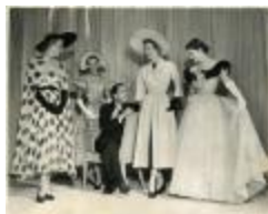
Norman Norell with Models Wearing His Designs at a Neiman Marcus Presentation (KA0035_000042)