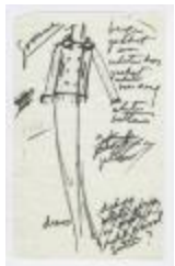
Beige Jacket with Floor-Length White Dress (KA0035_000217)