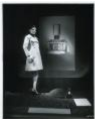
Bonwit Teller Window Display Featuring 'Norell' Perfume and Double-Breasted Coat (KA0035_000059)