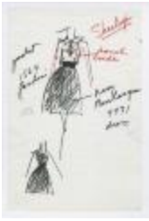
Sleeveless Navy Dress with Nautical Themed Jacket (KA0035_000227)