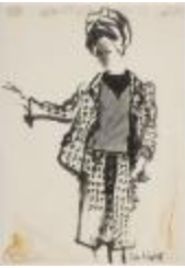
Women's Herringbone Suit with Vest (KA008601_OSxxx2_f04_01)