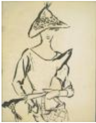
Scoop-Necked Dress with Embellished Hat (KA0038_000123)