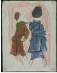
Women's Red Plaid Ensemble and Solid Blue Ensemble (KA0038_000089)