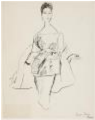
Women's Ensemble with Large Square Pockets (KA008601_OSx1_f01_01)