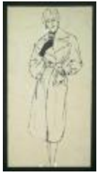
Women's Trench Coat with Wide Notched Collar (KA0038_000102)