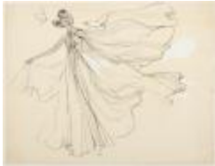
Flowing Evening Dress with Wrapped Bodice (KA002201_OSxxx1_f04_09)