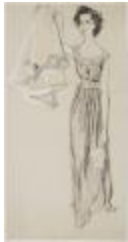
Pleated Nightgown and Frilled Peignoir or Cape (KA008601_MCB1_f03_01)