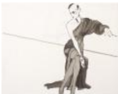
One-Sleeved Evening Dress with High Skirt Slit (KA002201_OSxxx1_f05_03)