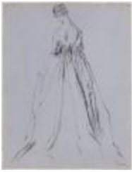
Long-Sleeved Voluminous Evening Dress (KA008601_OSxxx1_f06_02)