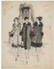
Fur-Trimmed Coats and Matching Toques (KA008601_OSxxx6_f05_01)