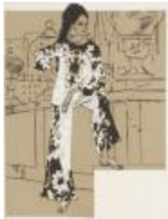
Women's Printed Pajama Suit with Tiered Tassel Earrings (KA002201_OSxxx1_f03_02)