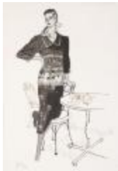
Women's Ensemble Featuring Collared Top and Narrow Skirt with Horse Race Motifs (KA002201_OSxxx1_f07_10)