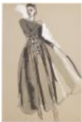
Women's Evening Ensemble Featuring Ball Gown Skirt and Floral Sash Belt (KA002201_OSxxx1_f06_03)