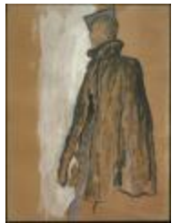
Fur Cape, Grey Dress, and Veiled Headpiece (KA0038_000110)