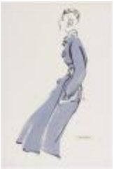
Women's Long Blue Belted Coat or Dress (KA006401_OSx1_f02_03)