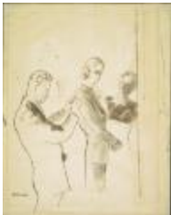
Woman in Jacket with Two Tailors (KA0038_000128)