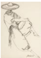
Women's Ensemble Featuring Balloon Pants, Cartwheel Hat, and Top with Funnel Neckline (KA002201_OSxxx1_f01_02)