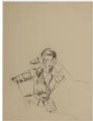
Woman with Long Hair Wearing Fitted Jacket with Oversized Ruffle Collar and Peplum Waist (KA002201_OSxxx1_f03_03)