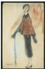
Orange and Black Plaid Jacket with Black Velveteen Skirt (KA0038_000101)