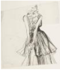
Sleeveless Pleated Dress with Long Tiered Skirt (KA002201_OSxxx1_f01_03)