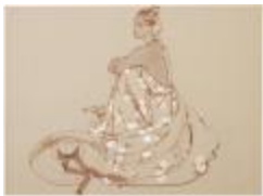
Backless Floral Printed Dress (KA002201_OSxxx1_f07_03)