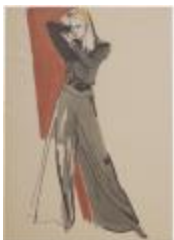
Black Women's Ensemble with Wide-Legged Pants (KA002201_OSxxx1_f07_04)