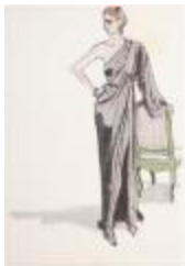
One-Sleeved Evening Dress with High Skirt Slit (KA002201_OSxxx1_f07_11)