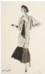
Schoolgirl Dress with Exaggerated Drop Waist and Oversized Collar (KA002201_OSxxx1_f04_12)