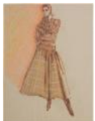
Women's Ensemble Featuring Cable-Knit Sweater and Plaid Maxi-Length Skirt (KA002201_OSxxx1_f07_05)