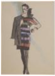
Women's Ensemble Featuring Multicolor Striped Dress and Long Black Blazer (KA002201_OSxxx1_f07_13)