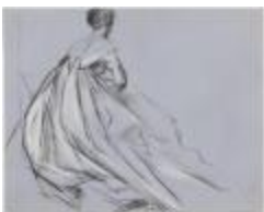
Voluminous Evening Dress with Scooped Back Neckline (KA008601_OSxxx1_f06_01)