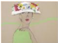
Lime Green Dress and White Mushroom Hat with Multicolor Flowers (KA002201_OSxxx1_f11_02)