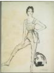
Corded Overalls with Sash Belt (KA0038_000109)