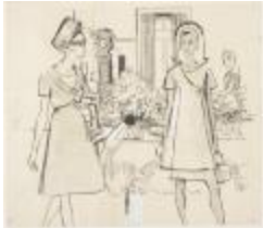
A-Line Dresses with Short Sleeves (KA008601_OSxxx7_f05_02)