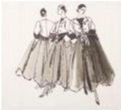
Women's Evening Ensemble Featuring Ball Gown Skirt and Bolero Jacket (KA002201_OSxxx1_f06_07)