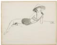
Women's Two-Piece Bathing Suit with "Coolie" Hat (KA008601_MCB2_f01_01)