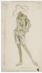
Women's Summer Ensemble with Floral Shirt and Checked Shorts (KA008601_OSxx1_f02_01)