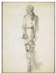
Women's Suit with Belted Jacket and Fitted Skirt (KA0038_000093)