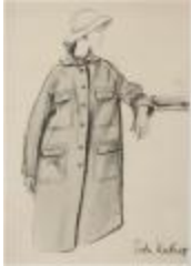
Oversized Women's Coat with Large Square Flap Pockets (KA008601_MCB3_f04_05)