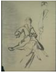
Women's Loose Overcoat and Men's Suit (KA0038_000111)