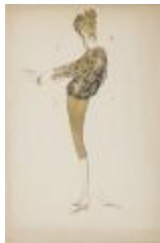
Gold Pencil Skirt and Patterned Jacket (KA008601_MCB3_f01_04)