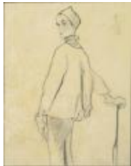
Women's Ensemble with Loose Coat (KA0038_000131)