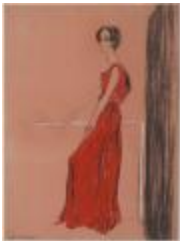
Red Evening Dress with Cowl-Necked Front and Back (KA008601_MCB3_f03_01)