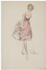
Pink Bridesmaid Dress with Floral Headpiece (KA008601_MCB2_f02_04)