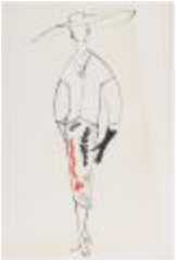
Women's Ensemble with Cartwheel Hat, Cocoon Top, and Abstract Printed Pencil Skirt (KA006401_OSx1_f02_04)