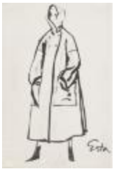
Women's Long Hooded Overcoat with Oversized Square Pockets (KA008601_OSx1_f02_05)