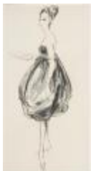
Strapless Cocktail Dress with Bubble Skirt (KA008601_OSxxx1_f03_01)