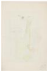
Partial Sketch of Woman with Arms Extended (KA008601_OSx2_f03_01v)