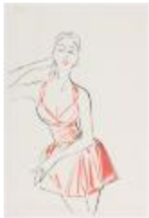
Orange Playsuit with Ruched Bodice (KA006401_OSx1_f05_03)