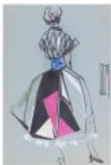
Women's Ensemble with Harlequin Printed Top and Voluminous Patterned Skirt (KA006401_OSx1_f04_02)