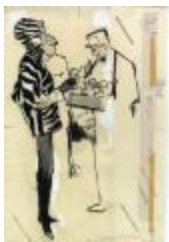
Women's Ensemble Featuring Knee-High Boots and Zebra Striped Coat with Hood (KA002201_OSxx3_f10_05)