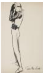
Women's Sleeveless Ski Suit with Striped Top and Belt Satchel (KA008601_MCB3_f06_03)