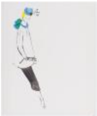
Black Capri Pants or Skirt with Trapeze Coat and Blue and Green Accessories (KA006401_OSx1_f01_03)