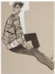
Women's Ensemble with Dark Pants and Loose Patterned Top (KA002201_OSxxx1_f03_07)