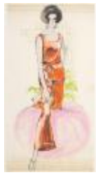
Orange Women's Ensemble Featuring Bellbottom Pants (KA002201_OSxxx1_f11_04)