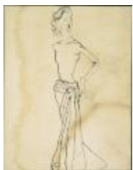
Long-Sleeved Evening Dress with Low-Slung Girdle (KA0038_000130)