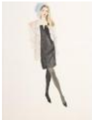
Short Black Sheath Dress with Oversized Tan Blazer (KA002201_OSxxx1_f11_06)