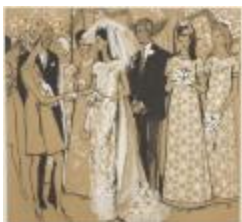
Wedding Party and Guests Featuring Bride in Patterned Dress with Wattleau Train (KA002201_OSxxx1_f03_09)