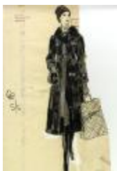
Woman in Long Coat with Saks Fifth Avenue Shopping Bag (KA002201_OSxx3_f10_04)