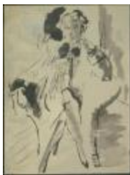
Women's Ensemble with Dark Collar and Matching Sleeve Cuffs (KA0038_000099)