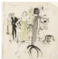
Sheath, Empire Waist, and Pencil Dresses (KA008601_OSxxx7_f02_01)