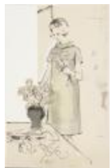
Short-Sleeved Shift Dress with Rolled Collar (KA008601_OSx2_f02_02)