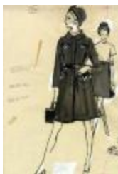
Two Women in Casual Ensembles and Capulet Hats (KA002201_OSxx3_f10_03)