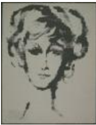
Portrait of Unknown Woman (KA0038_000091)