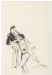
Man and Woman Lounging in Casual Ensembles (KA002201_OSxxx1_f01_01)