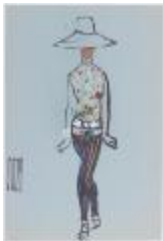
Women's Ensemble with Multicolor Printed Top and Striped Pants (KA006401_OSx1_f04_01)