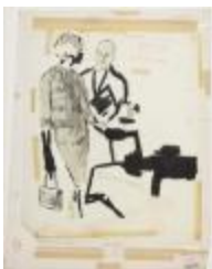
Overlay Featuring Women's Ensemble with Decorative Bands of Trim (KA008601_OSxxx7_f03_01)