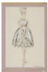
Short-Sleeved Bridesmaid Dress with Embroidered Skirt (KA008601_MCB2_f02_01)