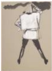
Women's Ensemble Featuring High Leather Boots and Jacket with Cape Back (KA002201_OSxxx1_f06_02)