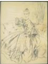
Portrait of Unknown Woman in Full Evening Dress and Drop Necklace (KA0038_000097)