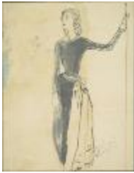
Long-Sleeved Navy Evening Dress with Low-Slung Giridle (KA0038_000129)