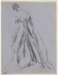
Voluminous Long-Sleeved Evening Dress with Scooped Back Neckline (KA008601_OSxxx1_f06_03)