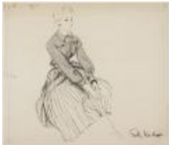
Women's Polka Dotted Blouse with Pleated Midi Skirt (KA008601_MCB4_f02_02)