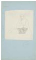
Plaid Control-Top Shorts and Brassiere (KA008601_OSx1_f14_07)