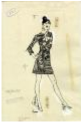
Wrap Dress with All-Over Geometric Print (KA002201_OSxx3_f10_06)