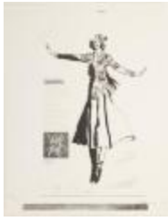
Lord & Taylor Advertisement Featuring Women's Sweater Ensemble by Cacharel (KA002201_OSxxx1_f02_02)