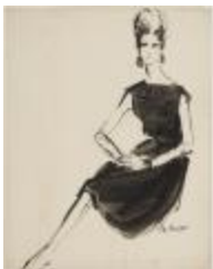
Sleeveless Cocktail Dress (KA008601_OSxxx1_f02_01)