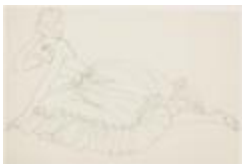
Patio Dress with Fitted Bodice, Tied Waist, and Ruffled Skirt (KA008601_OSx1_f15_02)