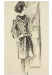
Women's Herringbone Suit with Turban (KA008601_OSxxx2_f05_01)