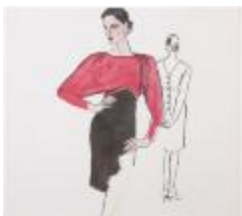
Black and Bright Pink Dress with Fitted Skirt and Dolman Sleeves (KA002201_OSxxx1_f08_03)