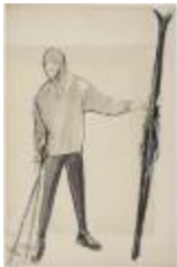
Women's Ski Ensemble with Polka-Dotted Parka and Striped Trousers (KA008601_MCB3_f06_01)