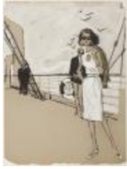
Woman on Ship Deck Wearing Short Sheath Dress with Cut-Out Design (KA002201_OSxxx1_f04_01)