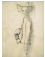
Women's Ensemble with Fitted Jacket and Wide-Brimmed Hat (KA0038_000079)