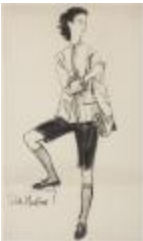
Women's Ensemble Featuring Bermuda Shorts, Collarless Jacket, and Knee-High Socks (KA008601_MCB3_f04_01)