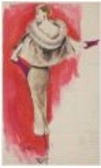
Blond Wool Sheath Dress and Cape with Blue Fox Fur Trim (KA008601_MCB4_f05_01)