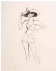
Swimsuit with Cut-Out Center (KA002201_OSxxx1_f05_01)