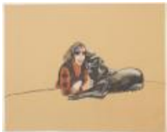
Woman in Red and Black Plaid Top with Dog (KA002201_OSxxx1_f08_02)