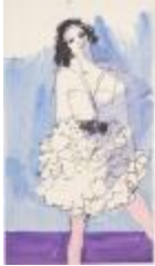
Ruffled Skirt, Wide Belt, and Collared Blouse (KA002201_OSxxx1_f07_07)