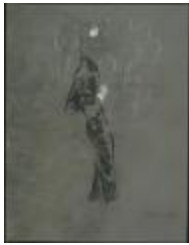
Women's Ensemble with Short Loose Coat and Long Fitted Skirt (KA0038_000112)