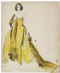
Yellow Dotted Evening Dress with Matching Shawl (KA008601_MCB3_f05_02)