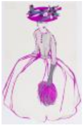
Voluminous Circle Skirt, Striped Blouse, and Large Embellished Hat (KA006401_OSx1_f01_05)