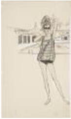
Women's Striped Romper with Matching Turban (KA008601_OSx2_f01_02)