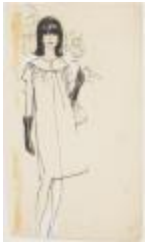
Short-Sleeved Shift Dress with Gathered Yoke (KA008601_OSx1_f21_02)