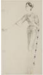
Knee-Length Fitted Dress with Bell Sleeves (KA008601_MCB2_f04_02)