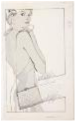
Lord & Taylor Advertisement Featuring Woven Bag by Judith Leiber (KA002201_OSxxx1_f12_02)