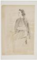
Women's Ensemble with Pleated Skirt and Cardigan (KA004101_MCC3_f07_01)