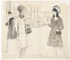
Shift Dress, Double-Breasted Coat, and Women's Suit (KA008601_OSxxx7_f05_01)