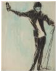
Women's Two-Toned Ski Ensemble with Hooded Jacket (KA008601_MCB3_f06_04)