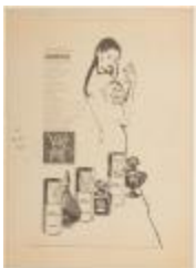
Lord & Taylor Advertisement Featuring Guerlain "Body Shampoo" Bottles (KA002201_OSxxx1_f02_05)