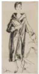
Women's Wrap Coat with Shawl Collar (KA008601_MCB1_f06_02)