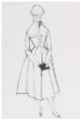
Princess Coat or Shirtdress with Bowler Hat (KA006401_OSx1_f03_04)