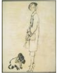
Women's Topcoat with Square Patch Pocket (KA0038_000106)