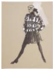
Women's Ensemble Featuring Patterned Cardigan and Short Gathered Skirt (KA002201_OSxxx1_f06_01)