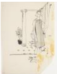
Striped Shift Dress with Cut-Out Collar (KA008601_OSx2_f01_01)