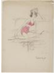
Pink Girdle and Brassiere with Embroidery (KA008601_MCB3_f02_02)