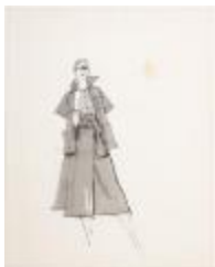
Women's Ensemble Featuring A-Line Wrap Skirt and Short-Sleeved Jacket (KA002201_OSxxx1_f05_02)