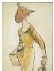
Yellow Sheath Dress with Orange Hat and Basket Purse (KA0038_000116)