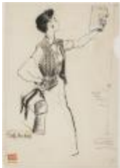
Women's Ensemble with Short-Sleeved Collared Shirt and Cable Knit Vest (KA008601_MCB4_f03_01)