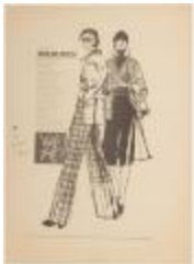
Lord & Taylor Advertisement Featuring Two Layered Fall Sportswear Ensembles by Act III (KA002201_OSxxx1_f02_08)