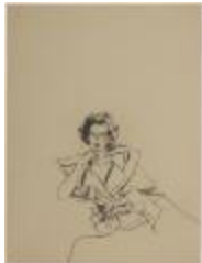
Woman with Short Hair Wearing Fitted Jacket with Oversized Ruffle Collar and Peplum Waist (KA002201_OSxxx1_f03_04)