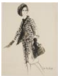
Women's Herringbone Suit with Turban and Satchel Bag (KA008601_OSxxx2_f05_02)