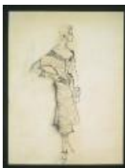
Short-Sleeved Dress with Diagonal Stripes (KA0038_000103)