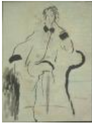
Women's Ensemble Featuring Coat with Flap Closure and Dark Collar (KA0038_000078)