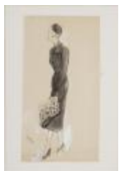
Women's Suit with Frog Closure Embellishments (KA004101_kOSxxx1_f09_01)