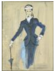
Fitted Blue Women's Suit (KA0038_000115)