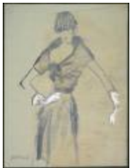
Short Dress with Fichu Wrap and Spotted Cap (KA0038_000086)