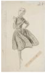
Checked Shirtdress with Short Gloves (KA008601_OSxxx3_f01_03)