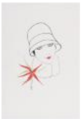
Women's Cloche Hat and Fur Collar with Poinsettia (KA006401_OSx1_f01_04)