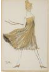
Gold Pleated Cocktail Dress with Empire Waistline (KA008601_MCB3_f01_02)