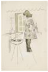
Pencil Skirt with Loose Patterned Tunic (KA008601_OSx2_f03_01)