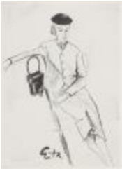
Women's Herringbone Suit with Bucket Bag (KA008601_OSx1_f02_03)