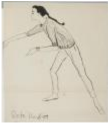
Cable Knit Sweater with Skinny Trousers (KA008601_MCB3_f04_04)