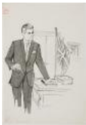
Men's Pinstripe Suit with Narrow Necktie (KA008601_OSxx2_f09_01)