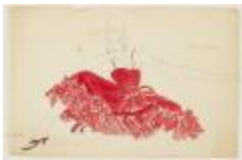
Red Patio Dress with Heeled Sandals (KA008601_OSx1_f15_05)