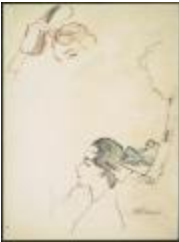
Women Using Hair Color Selector and Pinking Machine (KA0038_000090)