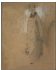
Cutaway Jacket with Fur Collar (KA0038_000094)