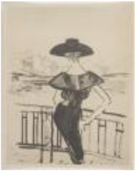
Women's Ensemble with Cape-Collared Top (KA008601_OSx1_f02_04)