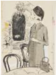
Long-Sleeved Tunic Dress with Split Neckline (KA008601_OSx2_f01_03)