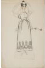
Wedding Dress with Buttoned Bodice and Embroidered Skirt (KA008601_MCB2_f02_03)