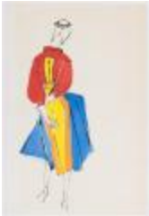
Women's Red, Blue, and Yellow Ensemble or Dress (KA006401_OSx1_f02_02)