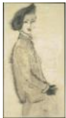
Women's Cardigan Jacket and Beret (KA0038_000119)