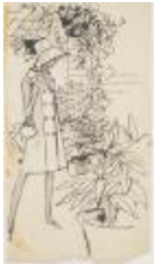
Double-Breasted Dress with Notched Collar and Matching Hat (KA008601_OSx1_f21_04)