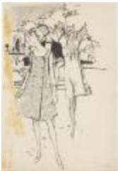
Double-Breasted Trapeze Dress and Bow-Collared Shift Dress (KA008601_OSx2_f05_01)