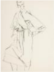
Long Wrap Coat with Cape Effect (KA002201_OSxxx1_f01_04)