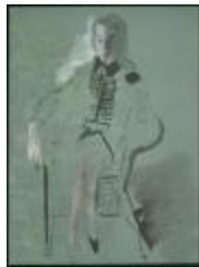
Women's Ensemble with Dark Collar and Matching Sleeve Cuffs (KA0038_000096)