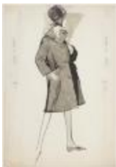
Women's A-Line Coat with Notched Collar (KA008601_OSxxx3_f04_02)