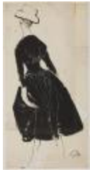
Black Dress with Voluminous Skirt and Bow Detail (KA008601_MCB2_f05_03)