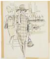
Plaid Sack Dress and Sleeveless Shift Dress with Bow (KA008601_OSx1_f21_06)