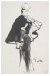
Women's Ensemble with Two-Toned Cape (KA008601_OSx1_f02_02)