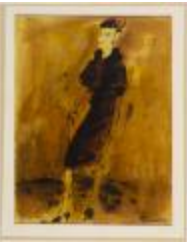
Women's Ensemble with Elbow-Length Collared Cape (KA008601_OSxxx2_f03_01)