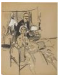
Man and Woman in Evening Wear (KA002201_OSxxx1_f03_08)