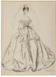
Wedding Dress with Voluminous Skirt and Lace Top (KA008601_MCB2_f02_02)