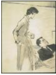
Two Women's Ensembles with Short Jackets and Gingham Blouses (Drawing in 2 Parts) (KA0038_000108)