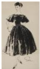
Black Dress with Voluminous Skirt and Short Puff Sleeves (KA008601_MCB2_f05_02)