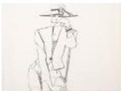
Rough Sketch of Woman Wearing Suit with Collarless Jacket and Plaid Blouse (KA002201_OSxxx1_f06_04)