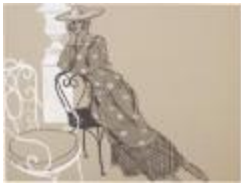
Long Dotted Dress and "Coolie" or "Saucer" Hat (KA002201_OSxxx1_f07_06)