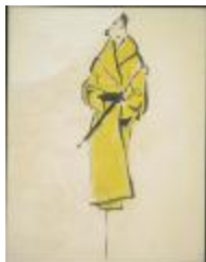
Women's Yellow Wrap Coat with Shawl Collar (KA0038_000080)