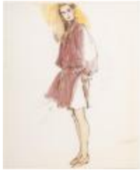
Loose Red Dress with Gold Jewelry (KA002201_OSxxx1_f07_09)