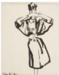
Women's Kimono Sleeve Coat with Wide Belt (KA008601_OSxx1_f08_03)