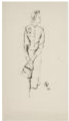
Women's Suit with Chest Embellishment and Flap Handbag (KA004101_MCC3_f01_01)