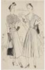
Two-Piece Women's Ensemble and Shirtdress with Full Skirts (KA004101_MCC3_f01_02)