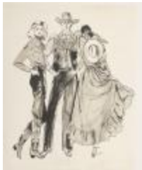
Man and Two Women Wearing Cowboy Inspired Ensembles (KA002201_OSxxx1_f04_05)