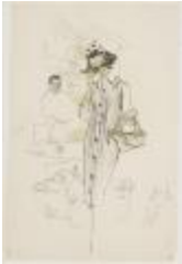
Sack-Style Shirtdress (KA008601_OSx1_f21_05)