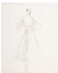
Rough Sketch of Dress with Cut-Out Motifs (KA002201_OSxxx1_f09_01)