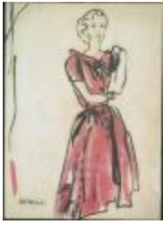
Pink Shirtdress with Chelsea Collar (KA0038_000085)