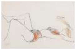
Orange Two-Piece Swimsuit with High-Waisted Bottoms (KA006401_OSx1_f05_01)