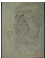
Oversized Women's Hat with Bow (KA0038_000082)