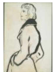
Belted Women's Coat with Dark Collar (KA0038_000117)