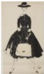
Black Striped Dress with Voluminous Skirt and Buttoned Bodice (KA008601_MCB2_f05_05)