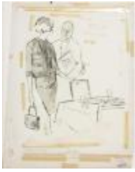
Women's Ensemble with Decorative Bands of Trim (KA008601_OSxxx7_f03_01overlay)