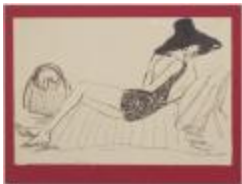
Women's Printed One-Piece Swimsuit with Mushroom Hat (KA008601_OSxxx1_f01_01)