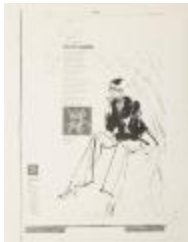
Lord & Taylor Advertisement Featuring "Haberdashery" Ensemble by Ralph Lauren (KA002201_OSxxx1_f02_03)