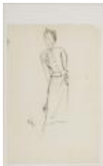
Women's Suit with Tiered Flap Accents (KA004101_MCC3_f03_01)