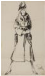
Women's Coat with Oversized Pockets and Standing Collar (KA008601_MCB1_f06_01)