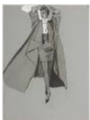
Women's Ensemble Featuring Duster Jacket and Pencil Skirt (KA002201_OSxxx1_f04_04)