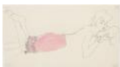
Pink Knee-Length Skirt Slip with Lace Hem (KA008601_OSx1_f14_01)