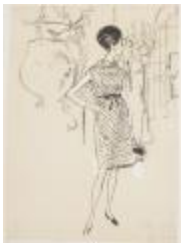
Polka-Dotted Dress with Rolled Collar and Back Panel (KA008601_OSx1_f21_03)