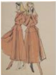
Long-Sleeved Orange Top with Matching Maxi Skirt (KA002201_OSxxx1_f07_12)