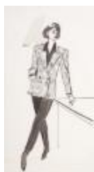
Women's Floral Printed Blazer and Stirrup Pants (KA002201_OSxxx1_f06_05)