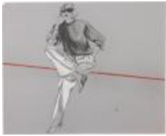
Women's Ensemble Featuring Pullover and Pants (KA002201_OSxxx1_f09_02)