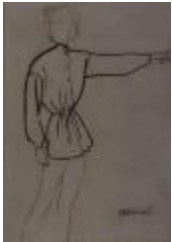
Long-Sleeved Tunic Blouse with Cinched Waistline (KA0038_k09_05_01)