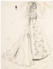
Floral Printed Bridal Gown with Empire Waistline and Flyaway Veil (KA002201_OSxxx1_f10_02)