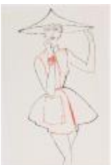
Orange Playsuit with Mandarin Collar and Wide "Coolie" Hat (KA006401_OSx1_f03_01)