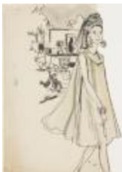
Sleeveless Tent Dress with Rolled Collar (KA008601_OSx2_f06_02)