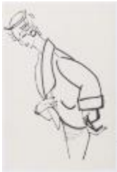
Women's Cocoon Coat with Wide Sleeve Cuffs (KA006401_OSx1_f01_02)