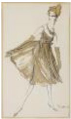
Gold Pleated Cocktail Dress with Empire Waistline and Bow (KA008601_MCB3_f01_03)