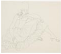
Patio Dress with Fitted Bodice and Ruffled Skirt (KA008601_OSx1_f15_03)