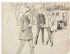
Women's Ensembles with Narrow Trousers (KA008601_OSxxx7_f02_02)