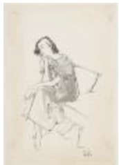
Nightgown with Ruffled Bib and Short Puffed Sleeves (KA008601_OSx1_f02_01)