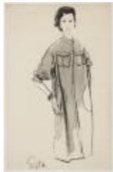
Women's Long Overcoat with Square and Circular Pockets (KA008601_MCB4_f02_01)