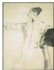
Women's Loose Overcoat with Small Buttons and Fur Muff (KA0038_000107)