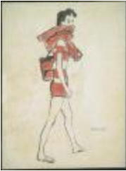
Red Striped Pullover with Gabardine Shorts (KA0038_000088)