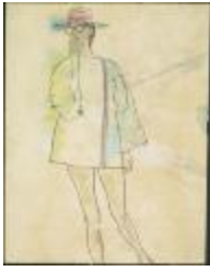
Multicolor Poncho and Sunhat (KA0038_000118)