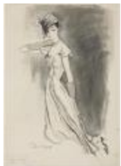
Soft Crepe Dress with Shirred Bodice and Short Cape Sleeves (KA008601_MCB4_f05_02)