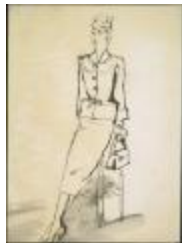
Women's Suit with Yoke and Bow Accents (KA0038_000081)