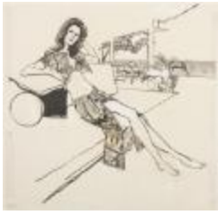
Women's Printed Ensemble with Wrap Skirt, Bikini Top, and Bolero Jacket (KA002201_OSxxx1_f04_08)