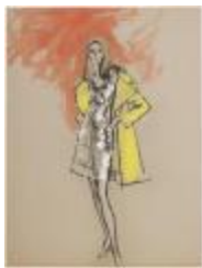
High-Waisted Sequined Sheath Dress with Yellow Swing Coat (KA002201_OSxxx1_f11_01)