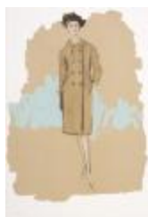
Brown Double-Breasted Herringbone Coat and Mushroom Hat (KA002201_kOSxxx7_f01_01)