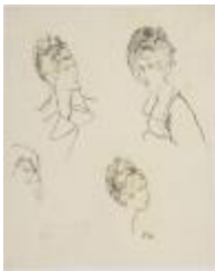
Four Women's Heads (KA004101_kOSxxx1_f08_01)