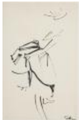
Black Color Separation Featuring Layered Skirt Ensemble (KA008601_OSxxx5_f02_01)