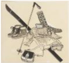
Sweater, Boots, Socks, and Purse with Assorted Ski Equipment (KA002201_OSxxx1_f04_03)