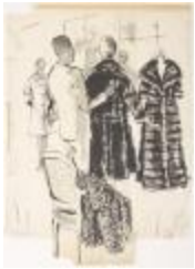
Saks Fifth Avenue Sales Associate and Two Women in Fur Coats (KA002201_OSxxx1_f10_03)