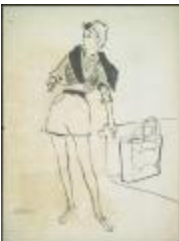
Women's Ensemble with Gabardine Shorts and Frilled Gingham Blouse (KA0038_000132)