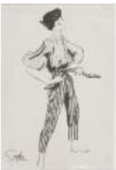
Women's Ensemble with Striped Capri Pants and Collared Blouse (KA008601_OSx1_f02_06)