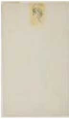
Woman's Head with Pillbox Hat (KA008601_MCB2_f04_01v)