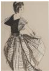
Striped Dress with Full Skirt (KA002201_OSxxx1_f04_11)