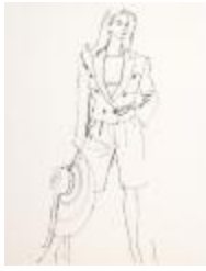
Women's Oversized Blazer and Knee-Length Shorts (KA002201_OSxxx1_f06_06)