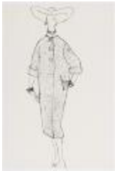
Women's Collarless Cocoon Coat with Slit Pockets (KA006401_OSx1_f03_05)