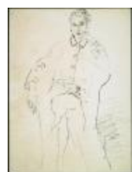
Women's Ensemble Featuring Coat with Flap Closure (KA0038_000100)