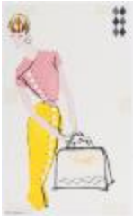
Women's Buttoned-Up Ensemble with Short-Sleeved Pink Top and Yellow Pencil Skirt (KA006401_OSx1_f04_05)