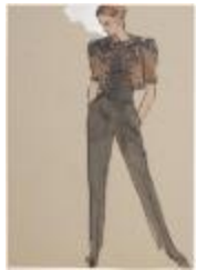
Black Women's Ensemble with Short-Sleeved Embellished Bolero Jacket (KA002201_OSxxx1_f07_14)