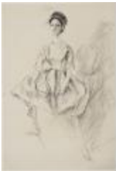
Dress with Short Sleeves and Full Knee-Length Skirt (KA008601_MCB2_f04_03)