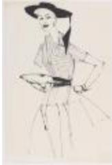
Short-Sleeved Striped Collared Shirt with Voluminous Skirt (KA006401_OSx1_f03_03)