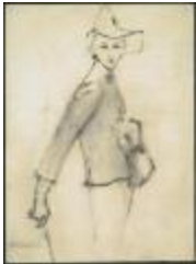
Women's Ensemble with Fitted Jacket and Tall Hat (KA0038_000095)