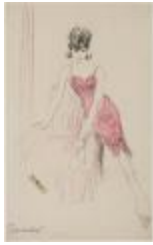
Pink Slip with Lace (KA008601_MCB3_f02_01)