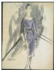
Blue Sheath Dress with White Collar and Sleeve Cuffs (KA0038_000092)