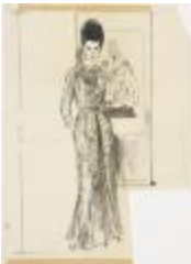
Floor-Length Patterned Housedress (KA008601_OSx2_f04_02)