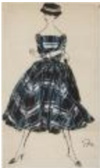
Blue, Black, and White Plaid Dress with Full Skirt (KA008601_MCB2_f05_01)