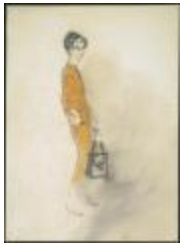
Women's Matchbox Suit in Persimmon (KA0038_000087)