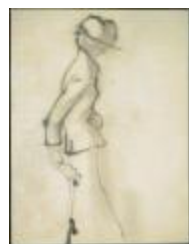
Women's Fitted Jacket and Quilled Hat (KA0038_000105)