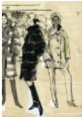
Three Women in Various Fur Coats (KA002201_OSxx3_f10_01)