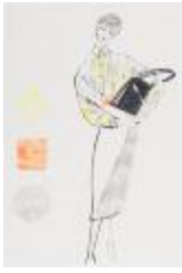
Grey Shirtdress with Yellow and Orange Accents (KA006401_OSx1_f04_03)