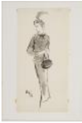
Women's Suit with Barrel Handbag and Feathered Hat (KA004101_kOSxxx1_f10_01)