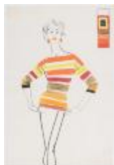
Multicolor Striped Top with Bateau Neckline and Three-Quarter Length Sleeves (KA006401_OSx1_f02_01)