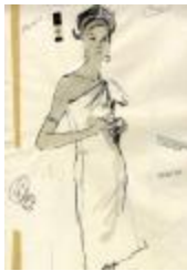
Asymmetrical Evening Dress with Oversized Bow (KA002201_OSxx3_f10_02)