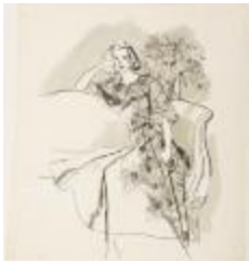
Woman Lounging in Floral Printed Dress with Puff Sleeves (KA002201_OSxxx1_f04_02)