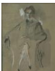
Women's Ensemble with Dark Collar and Matching Sleeve Cuffs (KA0038_000122)