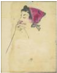
Rose Handkerchief Hat with French Ribbon Trim (KA0038_000124)