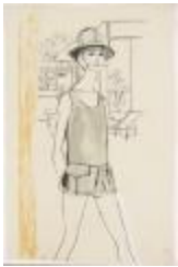
Belted Beach Romper with Safari Hat (KA008601_OSx2_f02_01)