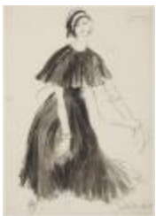
Pleated Black Silk Crepe Dress with Matching Cape (KA008601_MCB4_f05_03)