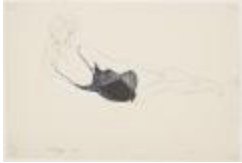
Striped Bathingsuit, Model Reclining, Charcoal Sketch (KA008601_OSx1_f14_03)