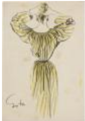
Miron Striped Worsted Dress (KA008601_OSxx1_f11_01)