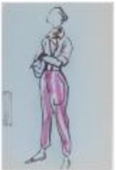
Women's Ensemble with Collared Shirt, Pink Capri Pants, and Striped Scarf (KA006401_OSx1_f02_05)