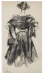
Plaid Skirt and Matching Shawl with White Collared Blouse (KA008601_MCB3_f04_02)