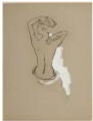
Back View of Nude Woman (KA002201_OSxxx1_f03_05)