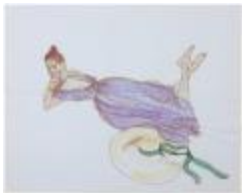
Purple and Green Dotted Sundress with Off-the-Shoulder Ruffled Neckline (KA002201_OSxxx1_f08_01)