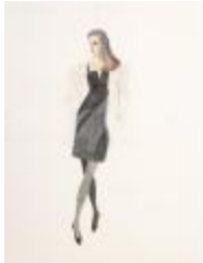
Short Black Sheath Dress with Oversized Tan Blazer and Layered Pearl Necklace (KA002201_OSxxx1_f11_05)