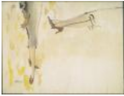
Fitted Skirts with Red or Orange Pumps (KA0038_000083)