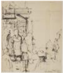
Talmack Design Room (KA008601_MCB4_f04_01)