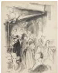
Men and Women in Formalwear (KA008601_OSxxx7_f01_01)