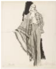
Plaid Women's Ensemble Featuring Blanket Cape (KA002201_OSxxx1_f04_10)