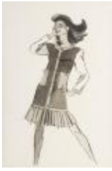
Long Color-Blocked Cardigan with Pleated Skirt (KA002201_OSxxx1_f04_06)