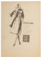
Lord & Taylor Advertisement Featuring Baby Llama Wrap Coat by Hobson (KA002201_OSxxx1_f02_06)