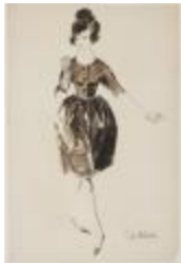
Brown Dress with Fitted Bodice and Bubble Skirt (KA008601_MCB2_f03_02)