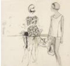
Women's Ensembles Featuring Shorts and Sleeveless Tops (KA008601_OSxxx7_f04_01)