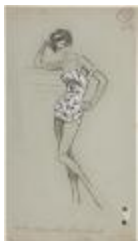
Women's One-Piece Printed Swimsuit with Arm Cuff (KA008601_OSxxx3_f01_02)