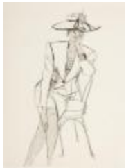
Women's Suit with Collarless Jacket, Pencil Skirt, and Plaid Blouse (KA002201_OSxxx1_f01_05)