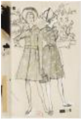
Women's Day Coat and Matching Dress (KA008601_OSx1_f20_01)