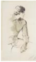
Men's Long-Sleeved Collared Shirt with Partial Button Placket (KA008601_OSxxx3_f04_01)