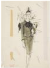
Women's Suit with Oversized Bow Collar (KA008601_OSx2_f04_01)