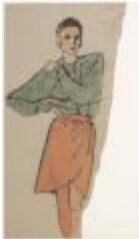
Peach Wrap Skirt with Printed Green Blouse (KA002201_OSxxx1_f07_02)