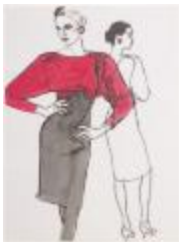
Black and Bright Pink Dress with Fitted Skirt and Dolman Sleeves (KA002201_OSxxx1_f07_08)