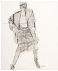
Women's Ensemble with Coat, Sweater Vest, and Plaid Skirt (KA002201_OSxxx1_f05_04)