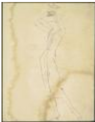
Women's Beachwear Ensemble with Buttoned Dress and Sunhat (KA0038_000104)