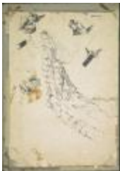
Ruffled Bridal Gown and Containers of "Salut de Schiaparelli" (KA0038_000077)