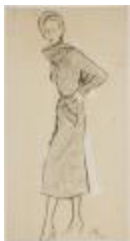
Long-Sleeved Shirtdress with Matching Neck Scarf (KA004101_kOSxxx1_f08_02)