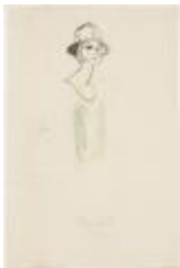
Partial Sketch of Woman with Safari Hat (KA008601_OSx2_f02_01v)