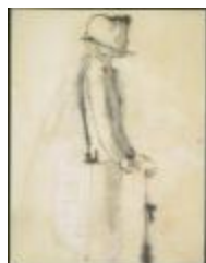
Women's Fitted Jacket and Quilled Hat (KA0038_000098)