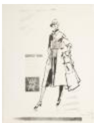
Lord & Taylor Advertisement Featuring Garnet Wool Ensemble by Geoffrey Beene (KA002201_OSxxx1_f02_01)