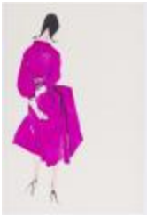
Bright Fuchsia Shirtdress (KA006401_OSx1_f05_02)