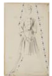
Women's Ensemble with Pleated Skirt and Double-Breasted Jacket (KA008601_MCB2_f04_01 overlay)