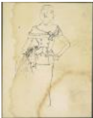
Women's Evening Ensemble with Double-Breasted Top and Fichu Wrap (KA0038_000126)