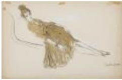
Gold Pleated Cocktail Dress with Wrap Top (KA008601_MCB3_f01_01)