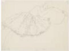
Voluminous Circle Skirt with Lace Border (KA008601_OSx1_f14_04)