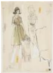
Short-Sleeved Shirt Dress and Herringbone Sheath Dress with Rolled Collar (KA008601_OSx2_f03_02)