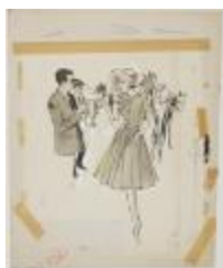
Short-Sleeved Belted Shirtdress with Sunhat (KA008601_OSxx2_f10_01)