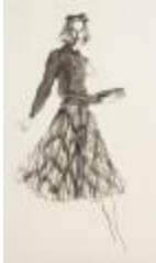
Women's Ensemble Featuring Pleated Plaid Skirt and Sweater (KA002201_OSxxx1_f04_07)