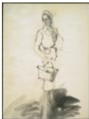
Women's Suit with Belted Coat and Fitted Skirt (KA0038_000084)