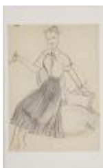
Women's Ensemble with Short-Sleeved Blouse and Pleated Skirt (KA004101_MCC3_f04_01)