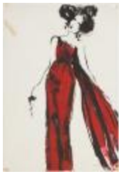
Red One-Shoulder Evening Dress with Back Panel (KA008601_OSxxx1_f04_01)