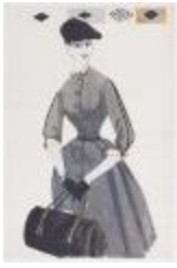
Grey Shirtdress with Black Newsboy Cap and Duffle Bag (KA006401_OSx1_f03_02)