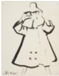
Women's Swing Coat with Cape Collar (KA008601_OSxx1_f08_02)