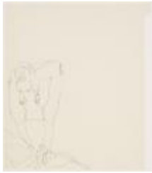
Partial View of Patio Dress with Fitted Bodice (KA008601_OSx1_f15_04)