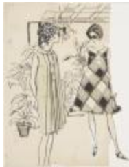
Pleated and Diamond-Patterned Trapeze Dresses (KA008601_OSx2_f05_02)