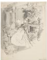
Parlor Setting Featuring Woman with Evening Dress (KA008601_OSxxx7_f01_03)