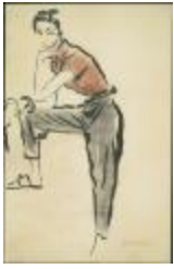
Women's Ensemble with Black Pants and Short-Sleeved Red Blouse (KA0038_000120)