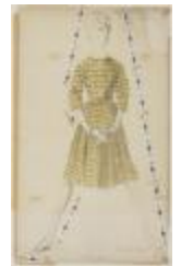
Yellow Plaid Ensemble with Pleated Skirt and Double-Breasted Jacket (KA008601_MCB2_f04_01)