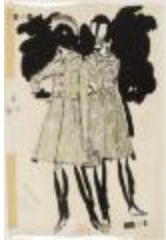
Women's Day Coat and Matching Dress with Black-Out (KA008601_OSx1_f20_01overlay)