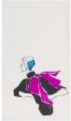
Women's Black Turtleneck Top with Oversized Fuchsia Bow (KA006401_OSx1_f04_04)