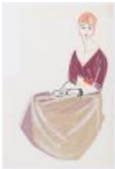
Maroon Cocoon Top with Wide V-Shaped Neckline and Long Beige Skirt (KA006401_OSx1_f01_01)