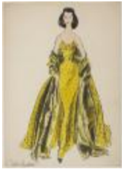
Yellow Dotted Evening Dress with Matching Shawl (KA008601_MCB3_f05_01)