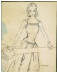
Evening Dress with Beaded Trim and Matching Stole (KA0038_000127)