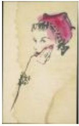
Rose Handkerchief Hat with French Ribbon Trim (KA0038_000121)