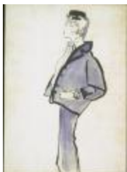
Short Navy Blue Coat with Silk Braided Trim (KA0038_000114)