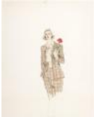
Women's Brown Plaid Suit with Tan Collared Shirt (KA002201_OSxxx1_f11_03)