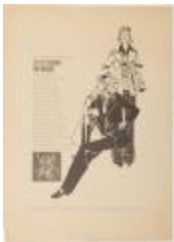
Lord & Taylor Advertisement Featuring Two Women's Ensembles by Butte Knitwear (KA002201_OSxxx1_f02_07)