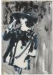
Women's Box Coat with Oversized Hat (KA008601_OSxxx1_f04_02)