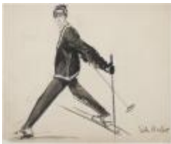
Women's Ski Ensemble with V-Necked Poplin Parka (KA008601_MCB3_f06_02)