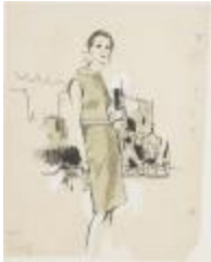
Two-Piece Sleeveless Dress with Scalloped Edges (KA008601_OSx1_f21_01)