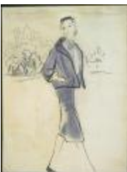
Short Navy Blue Coat and Fitted Skirt (KA0038_000113)