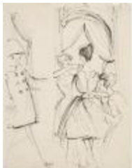
Full-Skirted Cocktail Dress and Double-Breasted Swagger Coat (KA008601_OSxxx7_f01_02)