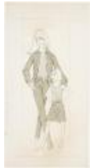
Polka Dotted and Striped Women's Ensembles (KA008601_OSxxx3_f01_01)