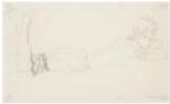
Knee-Length Skirt Slip with Lace Hem (KA008601_OSx1_f14_02)