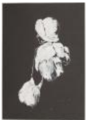
Woman Wearing Cloche Hat with Fur Wrap and Scarf (KA002201_OSxxx1_f03_06)