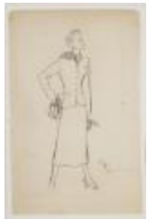
Women's Suit with Patterned Neck Scarf and Frame Handbag (KA004101_MCC3_f02_01)