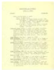
Architecture and Documents, Louis XIV Period (PIC03002_b09_f07_01)