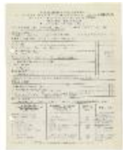
Annual Report of the Trustees of Museums and Other Institutions or Associations of Science, Literature, Art, History or Other Departments of Knowledge (PC010101_000004)