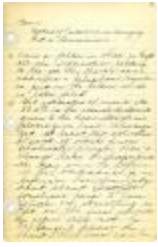
Notes from Eleanor McMillen Brown Lecture (KA0075_k01_f04_01)