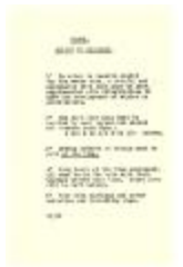
Tours. Notice to Students. (KA0052_b01_f08_01)