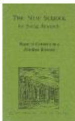
New School for Social Research Report of Committee on a Five-Year Program (NS010105_000004)