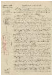
Lease for Parsons Paris Building (PC010102_000013)