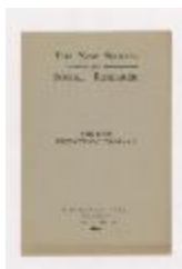
The New Educational Program (NS030105_000505)