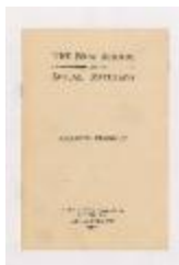
Building Program (NS030105_000506)