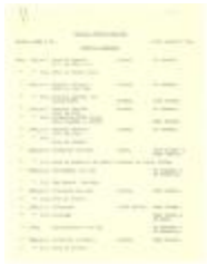
Special Summer Session General Schedule (KA0052_b01_f03_01)