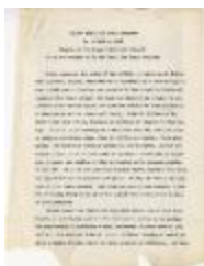
The New School for Social Research (NS030105_000659_pg67-70)