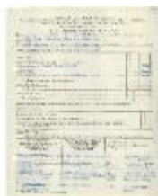
Annual Report of the Trustees of Museums and Other Institutions or Associations of Science, Literature, Art, History or Other Departments of Knowledge (PC010101_000003)