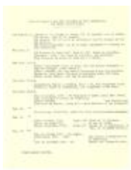
General Suggestions for Visiting on Free Afternoons and after School Hours (KA0052_b01_f03_03)