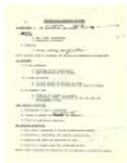
Qualities for Successful Teaching (KA0052_b01_f03_04)