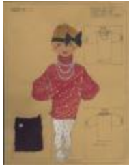
Children's Knitted "Pearl Dress" (PIC02002-1_b04_f10_01)