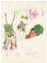
Tropical Fantasies Circa 1953 (PC020201_000075)