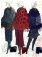
'OP' Sweaters, Flannel Bottoms, Wool Jersey Tops (PIC02002-1_b39_f02_02)