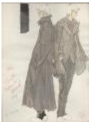
Menswear Suiting Coordinates (PIC02002-1_b39_f02_01a)