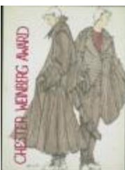
Menswear Suiting Coordinates (PC020201_000004)