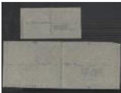
Pattern Pieces for Children's Knitted "Pearl Dress" (PIC02002-1_b04_f10_03)