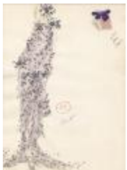
For Pale to Deep Purple Evenings... (PC020201_000076)