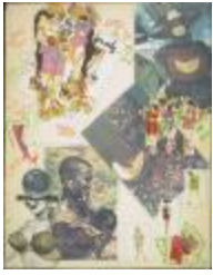
Mood Board Featuring Cone Bras, Plates, Metallic Fabrics, and African Imagery (PC020201_000002)