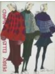
'OP' Sweaters, Flannel Bottoms, Wool Jersey Tops (PC020201_000003)