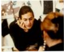
Parsons School of Design Alumnus Marc Jacobs (PIC04001_b05_f03_02)