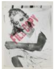
Production Elements for Ms. Magazine Cover, Do Women Make Men Violent? (KA0014_000007)