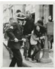
Production Elements for Ms. Magazine Cover, Do Women Make Men Violent? (KA0014_000009)