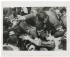
Production Elements for Ms. Magazine Cover, Do Women Make Men Violent? (KA0014_000008)