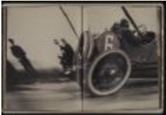
Pages from Diary of a Century, by Jacques Henri Lartigue (KA0014_b02_f07_01)