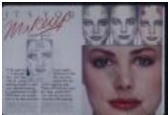
Sample proof of page from Self Magazine (KA0014_b03_f03_02_s12)