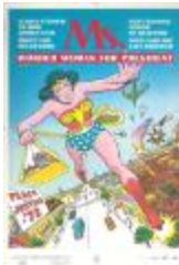
Ms. Magazine cover (KA0014_Osx1_f08_01)