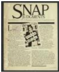
Mock-up from Rolling Stone's "Snap Judgments: A Rock & Roll Retrospective 1969-1977" (KA0014_b09_01)