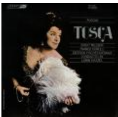
Proof for LP Cover, Puccini's "Tosca" (London Records) (KA0014_OSx2_f06_01)