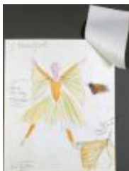
Alvin Ailey American Dance Theater, costume design sketches (KA0014_OSx2_f05_01)