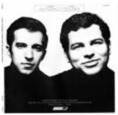
Proof for LP Cover, "Performances by Vladimir Ashkenazy and Itzhak Perlman," (London Records) (KA0014_OSx2_f06_04)