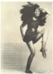
Scrapbook Collage Pages (KA0014_b05_f10)