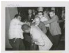
Production Elements for Ms. Magazine Cover, Do Women Make Men Violent? (KA0014_000006)