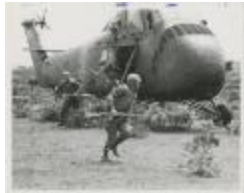
Production Elements for Ms. Magazine Cover, Do Women Make Men Violent? (KA0014_000005)