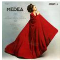
Proof for LP Cover, Cherubini's "Medea" (London Records) (KA0014_OSx2_f06_06)