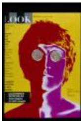
Cover for LOOK magazine, featuring John Lennon. (KA0014_b07_f01_01)