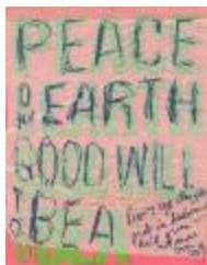
Peace on Earth Good Will to Bea (KA0014_000020)