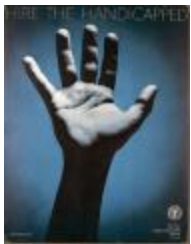
"Hire the Handicapped" Poster (KA0014_OSx2_f04_01)