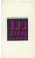
Cover for 100 Jogos Dramaticos (KA0014_b01_f01_01)