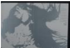
Harper's Bazaar work samples (KA0014_b03_f03_01)