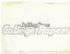
Rolling Stone College Papers optional mastheads and layout (KA0014_b07_f03_01)