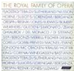
Proof for LP Cover, "The Royal Family of Opera" Anthology (London Records) (KA0014_OSx2_f06_05)