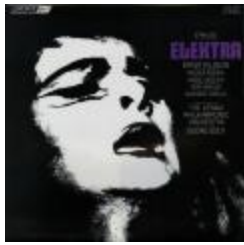
Proof for LP Cover, Strauss's "Elektra" (London Records) (KA0014_OSx2_f06_03)