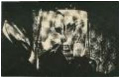
Postcard from Diane Arbus to Bea Feitler (KA0014_000019)