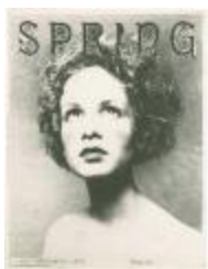
Twiggy as Spring (KA0014_000027)