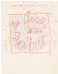
The Doors to Paradise (KA0014_000023)