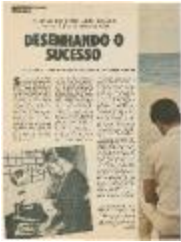
Article about Bea Feitler from Jornal do Brasil (KA0014_000017)