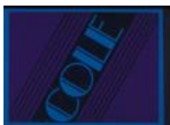
Cover for Cole: A Biographical Essay (KA0014_b06_f02_01_s01)