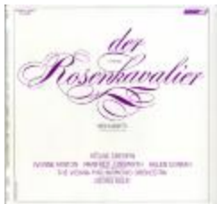
Proof for LP Cover, Strauss's "Der Rosenkavalier" (London Records) (KA0014_OSx2_f06_02)