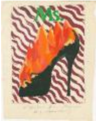
For Bea from Miriam (My Inspiration!) (KA0014_000025)