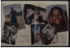
Section from publication of Rolling Stone's, "Snap Judgments: A Rock & Roll Retrospective 1969-1977" (KA0014_b03_f05_s)