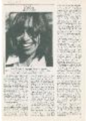
Article about Bea Feitler from Mais Magazine (KA0014_000018)