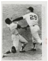
Production Material for Ms. Magazine Cover, Do Women Make Men Violent? (KA0014_000004)