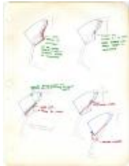
Front and Back Bodice Slopers, Pattern Pieces (KA0008_b03_f05_05v)