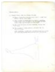
Batwing Sleeve Instructions (KA0008_b03_f05_04v)