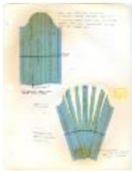
Leg-o-mutton Style # 1 (KA0008_b03_f05_06)