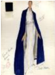
Pleated White Evening Dress with Wool Melton Cape (PIC02002-1_b25_f01_02)