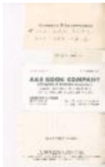
Idea Book (KA0008_000002)