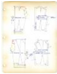
Gusset Kimono (KA0008_b03_f04_01)