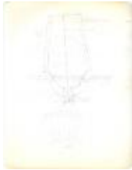
Sleeve Variations (KA0008_b03_f06_07v)