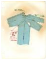
Batwing Sleeve (KA0008_b03_f05_04a)