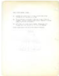
Full Flair Skirt Instructions (KA0008_b03_f05_03v)