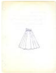
Full Flair Skirt (KA0008_b03_f05_03a)