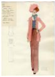
Junior's Ensemble with Pink Flannel Jacket and Wool Knit Sweater (PIC02002-1_b25_f01_01)