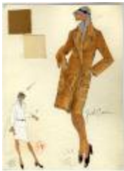
Two-Piece White Jersey Dress with Camel's Hair Coat (PIC02002-1_b25_f01_03)