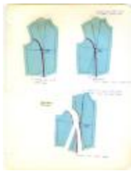
Gusset Kimono (KA0008_b03_f04_02)