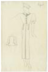
Short-Sleeved Dress with Star Embellishments and Matching Cape (KA0039_V9p62-005)