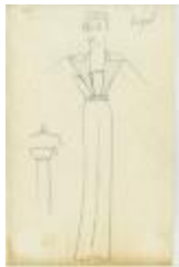
Floor-Length Evening Dress with Notched Lapel (KA0039_V9p67-009)