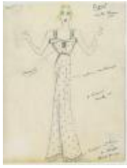
Sheer White Evening Dress with Silver Nailhead Embellishments (KA0039_V9p54-008)