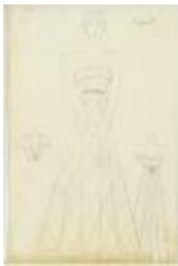
Plaid Evening Dress with Cuffed Bodice and Jacket (KA0039_V9p65-008)