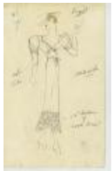
Black Wool Dress with Lace Border (KA0039_V9p38-002)