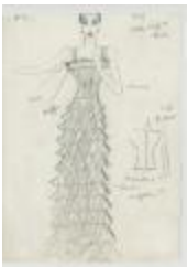
Black CrÃ©pe and Lace Evening Dress with Ruffled Skirt and Matching Jacket (KA0039_V8p12-008)