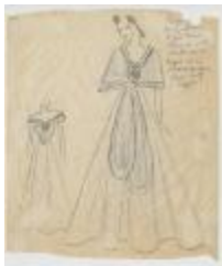
Heavy White Piqué Dress with Royal Blue Taffeta Shawl (KA0039_V8p73-004)