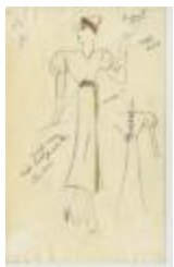
Black Wool Dress with Gold Mesh Accents (KA0039_V9p38-004)