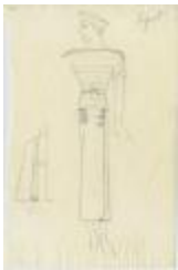
Women's Ensemble with Striped Top and Wrapped Skirt (KA0039_V9p62-006)