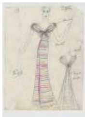
Multicolor Striped Evening Dress (KA0039_V9p19-008)