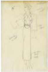
Black Wool Dress with Long Jabot Collar and Gold Chain Belt (KA0039_V9p64-002)