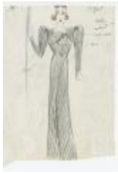
Long-Sleeved Black Velvet Evening Dress with Lace Accents (KA0039_V8p10-009)