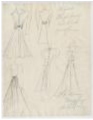
Set of Five Sketches Depicting Beige and Black Linen Dresses (KA0039_V8p53-001)