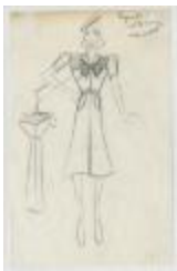
White Linen Dress with Black Velvet Yoke and Bow (KA0039_V9p03-002)