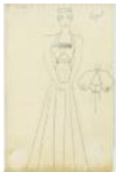
Evening Dress with Floral Embellishments and Matching Shrug (KA0039_V9p64-009)