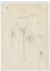
Blue CrÃ©pe Military Inspired Women's Ensemble (KA0039_V8p38-002)