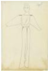
Floor-Length Dress with Batwing Sleeves (KA0039_V9p65-009)