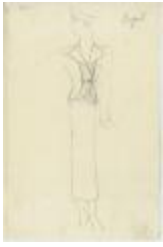
Women's Suit with Contrast Border (KA0039_V9p65-004)