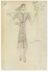
Brown CrÃ©pe Dress with White Vermicelli Embroidery (KA0039_V9p48-001)