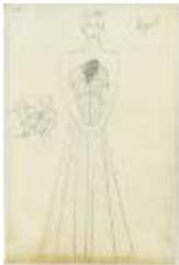
Plaid Evening Dress with Cuffed Bodice and Floral Embellishment (KA0039_V9p64-008)