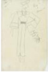
Brown Dress with Bell Sleeves and Beige Wood Beaded Girde (KA0039_V9p70-006)