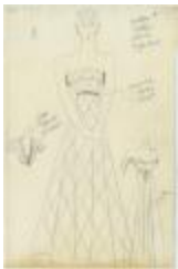
Yellow and Black Plaid Organdie Evening Dress with Cuffed Bodice and Jacket (KA0039_V9p62-008)