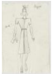
Short-Sleeved Two-Toned Dress (KA0039_V8p33-005)