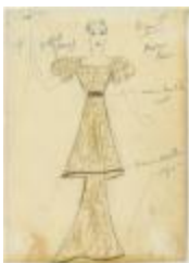
Brown Lace Tunic Dress with Leather Accents (KA0039_V9p43-009)