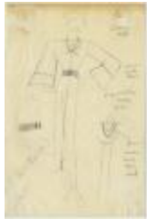
Brown Cr pe Dress with Beige Wood Beaded Girdle (KA0039_V9p26-003)