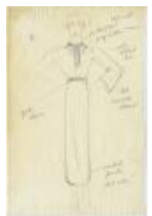
Black Wool Dress with Pleated Pique Accents and Gold Chain Belt (KA0039_V9p62-001)