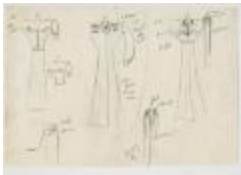
Set of Six Sketches Depicting Three Dresses and Partial Sleeve and Bodice Details (KA0039_V8p54-005)