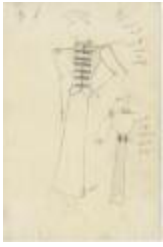
Women's Wool Suit with White Crepe Blouse and Velvet Accents (KA0039_V9p70-005)