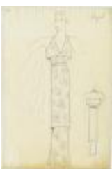
Printed Tunic Evening Dress with Halter Neckline (KA0039_V9p62- 009)