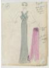
Jade Green Pleated Chiffon Evening Dress with Purple Chiffon Cape (KA0039_V9p15-009)