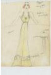
Ivory Satin Evening Dress with Bands of Puffing (KA0039_V9p35-009)