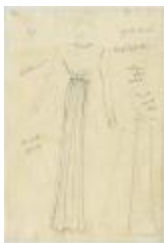
Gold LamÃ© Evening Dress with Antique Gold Belt and Rust Wool Cape (KA0039_V9p40-006)