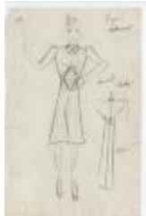
Collared Black Wool Dress with Diamond Shaped Center (KA0039_V8p05-005)