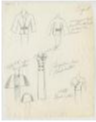
Set of Six Sketches Depicting a Coat, Cape, and Dresses (KA0039_V8p67-004)