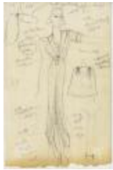
Black Shirred Taffeta Women's Ensemble with Chantilly Lace Slip (KA0039_V9p70-009)