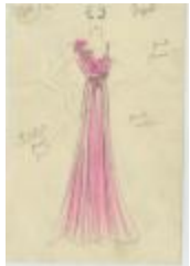
Pink Chiffon Evening Dress with Large Pink Flowers (KA0039_V9p56-005)