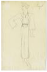
Calf-Length Dress with Long Jabot Collar and Chain Belt (KA0039_V9p62-003)