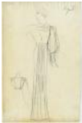
Evening Dress with Floral Embellishments and Long Puffed Sleeves (KA0039_V9p62-007)