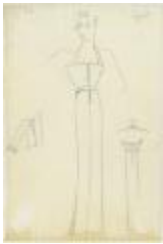
Evening Dress with Halter Strap and Matching Jacket (KA0039_V9p63-007)