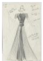
Black Satin Evening Dress with Pleated Chiffon Overskirt and Sleeves (KA0039_V8p43-005)