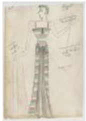
Maroon, Green, and White Striped Crepe Evening Dress with Maroon Chiffon Cape (KA0039_V9p16-007)