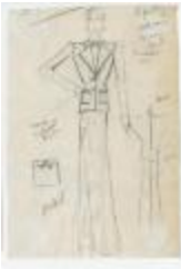
Women's Black Moiré Dinner Suit (KA0039_V8p01-006)