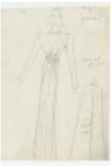
Gold Lamé Evening Dress with Embellished Belt and Rust Wool Cape (KA0039_V8p07-009)