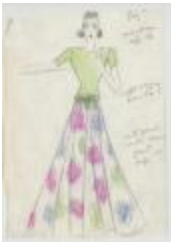
Women's Evening Ensemble with Jade Green CrÃ©pe Top and Multicolored CrÃ©pe Skirt (KA0039_V8p12-007)