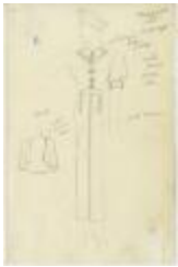
Short-Sleeved Navy Wool Dress with White Pearl Star Embellishments and Matching Cape (KA0039_V9p65-006)