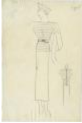
Women's Ensemble with Striped Top and Looped Sleeves (KA0039_V9p63-005)