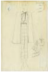
Plaid CrÃ¢pe Dress with Pleated Sleeves and Wool Cape (KA0039_V9p63-003)