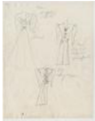
Set of Three Sketches Depicting a Black Evening Dress, Navy Crepe Dress, and Blue Coat with Painted Flower Buttons (KA0039_V8p53-003)