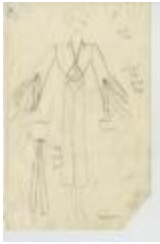
Black CrÃ©pe Dress with Gold Clips and Gathered Sleeve Details (KA0039_V9p28-005)