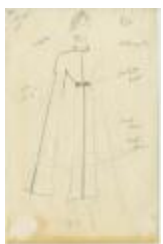
Women's Black Wool Cape Ensemble with Ruffle Collar (KA0039_V9p68-008)