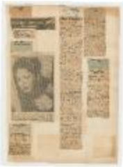
Dramatic Workshop and Studio Theatre Scrapbook IV, Part 3 (NS030105_DW_0403)