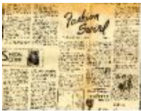
Color, Coordination in Katja collection (KA0018_binder66_03)