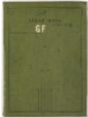
Press clippings 21: 1941-1944 (NS030101_PC_021)