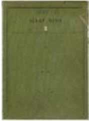
Press clippings 20: 1940 - 1942 June (NS030101_PC_020)