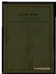
Press clippings 7: 1931 Aug, 1932 Sep-1933 Apr (NS030101_PC_07_OCR)