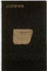
Press clippings 2: 1926-1927 (NS030101_PC_02_OCR)