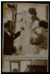
Clipping showing gown fitting from "Future Fashion Leaders," Buffalo Courier-Express, 13 November 1949. Source: Parsons Scrapbook, 1948-53, p. 59. (PIC03002SB_vol2_59_01)