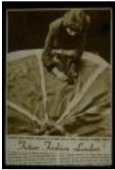
Clipping showing student sewing, "Future Fashion Leaders," Buffalo Courier-Express, 13 November 1949. (PIC03002SB_vol2_58_01)