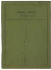
Press clippings 17: 1938-1939 (NS030101_PC_017)