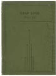
Press clippings 30: 1947-1948 (NS030101_PC_030)