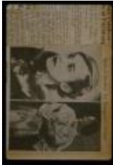
Spurns Society for Designer Career March 6 1934