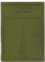
Press clippings 28: 1945-1946 (NS030101_PC_028)