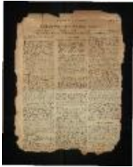
Press clippings 1: 1918-1935 May, 1939 (NS030101_PC_01_OCR)