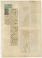
Press clippings 25: 1943-1944 (NS030101_PC_25)