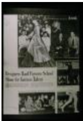
Clipping about Parsons Fashion Show, "Designers raid Parsons School Show for Fashion Talent," Look, 8 November [1949?]. (PIC03002SB_vol2_57)