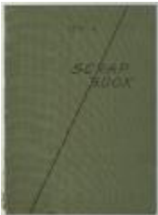
Press clippings 35: 1951-1952 (NS030101_PC_035)