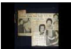
"Students From Afar Study U.S. Art," U.S. Telegram article (PIC03002SB_vol3_28)