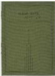
Press clippings 33: 1949 (NS030101_PC_033)