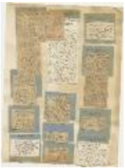
Press clippings 15: 1937-1938 (NS030101_PC_015)