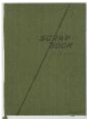
Press clippings 36: 1952-1953 (NS030101_PC_036)