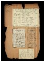
Press clippings 3: 1927-1931 May, 1940-1941 (NS030101_PC_03_OCR)