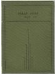
Press clippings 31: 1948-1949 (NS030101_PC_031)