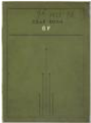
Press clippings 19: 1939-1941 (NS030101_PC_019)