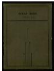
Press clippings 5: 1931-1932 (NS030101_PC_05_OCR)