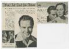
Dramatic Workshop and Studio Theatre Scrapbook IV, Part 4 (NS030105_DW_0404)