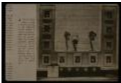
"He Sets Fashions in Shop Windows," June 17, 1936. (PIC03002SB_vol1_57)