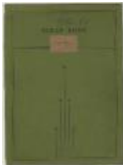
Press clippings 23: 1942-1943 (NS030101_PC_023)