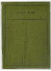
Dramatic Workshop and Studio Theatre Scrapbook IV, Part 1 (NS030105_DW_0401)