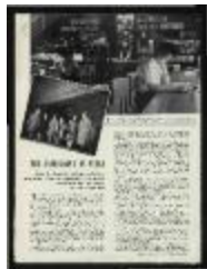
Press clippings: Additional Articles: 1931-1943 (NS030101_PC_Additional_Article)