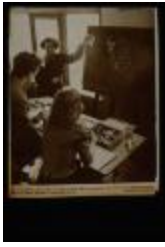
Clipping showing advertising art class, "Future Fashion Leaders," Buffalo Courier-Express, 13 November 1949. (PIC03002SB_vol2_59_02)