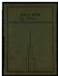
Press clippings 6: 1932 (NS030101_PC_06_OCR)