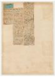
Dramatic Workshop and Studio Theatre Scrapbook III, Part 2 (NS030105_DW_0302)