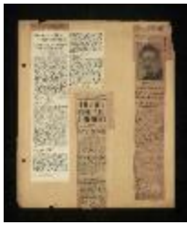
Press clippings 9: 1930-1936, 1939 (NS030101_PC_09_01_OCR)