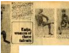
Katja, Woman of Three Talents (KA0018_binder60_02)