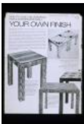
How to Give the Versatile Popular Parsons Table Your Own Finish (PIC03002SB_vol10_33)