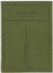
Press clippings 24: 1943-1944 (NS030101_PC_024)