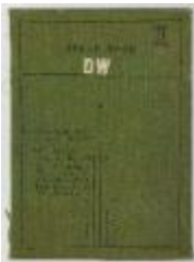
Dramatic Workshop and Studio Theatre Scrapbook II, Part 1 (NS030105_DW_0201)