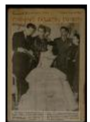
Opening Fashion Exhibit. November 28 1940. (PIC03002SB_vol1_64)