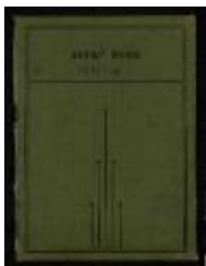
Press clippings 10: 1935-1936 (NS030101_PC_010_OCR)