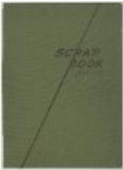
Press clippings 32: 1949 (NS030101_PC_032)