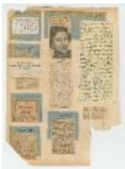
Dramatic Workshop and Studio Theatre Scrapbook I, Part 2 (NS030105_DW_0102)