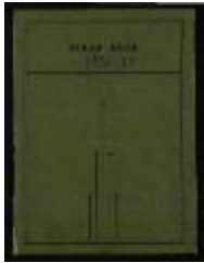
Press clippings 14: 1936-1937 (NS030101_PC_014_OCR)