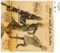
Modern Touch from Sweden (KA0018_binder60_03)