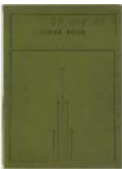
Press Clippings 27: 1944 - 1949 (NS030101_PC_027)