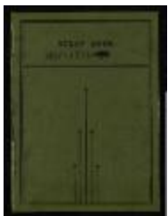
Press clippings 12: 1935-1936 (NS030101_PC_012_OCR)