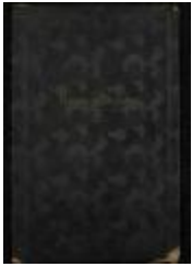
Press clippings 13: 1935 Feb-1937 Jun (NS030101_PC_13-01_OCR)