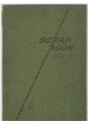
Press clippings 34: 1950-1951 (NS030101_PC_034)