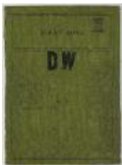
Dramatic Workshop and Studio Theatre Scrapbook III, Part 1 (NS030105_DW_0301)