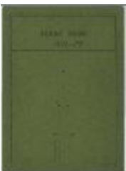
Press clippings 29: 1945-1947 (NS030101_PC_029)