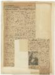
Press clippings 26: 1944-1945 (NS030101_PC_26)