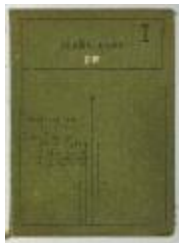
Dramatic Workshop and Studio Theatre Scrapbook I, Part 1 (NS030105_DW_0101)