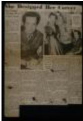
Clipping about Claire McCardell, "She Designed Her Career," NY World-Telegram, 3 August 1949. (PIC03002SB_vol2_53)