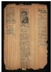
Press clippings 4: 1927-1931 Apr, 1933, 1935, 1939 (NS030101_PC_04_OCR)