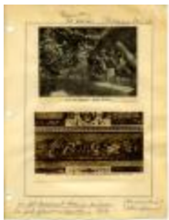
Scrapbook Page on the Palazzo del Te, Mantua (KA0063_b01_f06_01)