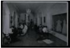
Students Study Costumes (PIC03002SB_vol1_40_02)