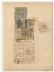
Dramatic Workshop and Studio Theatre Scrapbook II, Part 2 (NS030105_DW_0202)