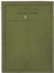
Press clippings 18: 1939-1942 (NS030101_PC_018)