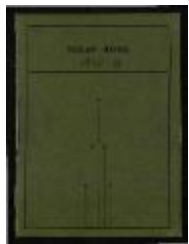
Press clippings 11: 1935-1936 (NS030101_PC_011_OCR)