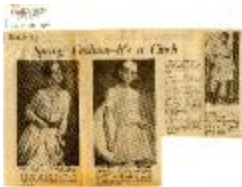
Spring Fashion - It's a Cinch (KA0018_binder66_02)