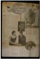
Dressing the Movie Stars (PIC03002SB_vol1_123)