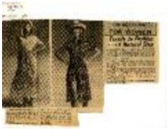
Textile to Fashion | A Natural Step (KA0018_binder74_01)