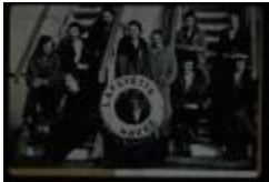
Students Aboard MS Lafayette (PIC03002SB_vol1_40_01)