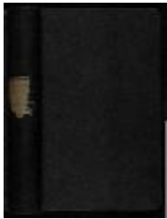
Promotions 3: 1943-1944 (NS030101_Promo_03_OCR)