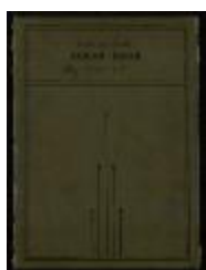
Press clippings 8: 1933-1935 (NS030101_PC_08_OCR)