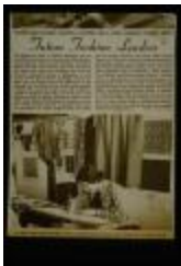
Clipping showing student at drawing board, "Future Fashion Leaders," Buffalo Courier-Express, 13 November 1949. (PIC03002SB_vol2_58_02)