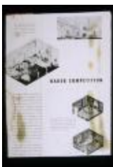
Clipping about entries for Baker Competition, in which students designed the living-dining area of an existing house (PIC03002SB_vol2_234)