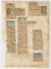
Dramatic Workshop and Studio Theatre Scrapbook IV, Part 2 (NS030105_DW_0402)