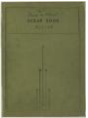
Press clippings 16: 1937-1939 (NS030101_PC_016)