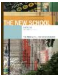
New School for Social Research 2007-2008 Vol. 65 No. 2 (NS050101_gf2007ye)