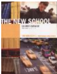
New School for Social Research 2006 -2007 Vol. 64 No. 2 (NS050101_gf2006ye)