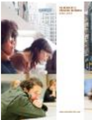
New School for Social Research 2012-2013 Vol. 70 No. 2 (NS050101_gf2012ye)