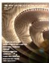
New School for Social Research 2014-2015 (NS050101_gf2014ye)