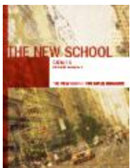
New School for Social Research 2008-2009 Vol. 65 No. 3 (NS050101_gf2008ye)