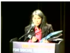
The Parallax of Evil: Jean Baudrillard and Sylvere Lotringer (NS070206_2014NS23_D006)