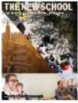
New School for Social Research 2011-2012 Vol. 69 No. 2 (NS050101_gf2011ye)