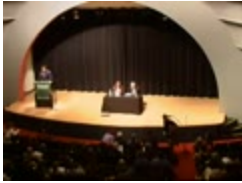
Some Observations on Female Sexuality (NS070206_2014NS23_D002)