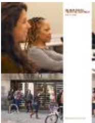
New School for Social Research 2013-2014 (NS050101_gf2013ye)