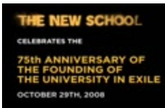
75th Anniversary of the Founding of the University in Exile Slideshow (2014NS06_D001)