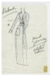
Pink Jersey and White Satin Wrap Coat (KA0035_000144)