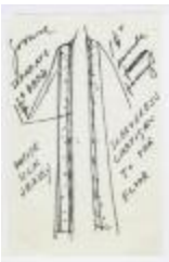
Sleeveless White Silk Jersey Cardigan (KA0035_000218)