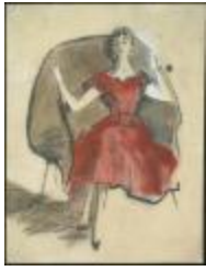
Red Lace Evening Dress with Cape Collar (KA0038_000073)