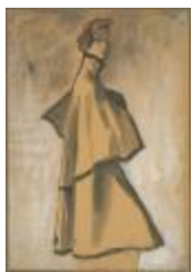
Flannel Cape Coat with Black Braid Piping (KA0038_000054)