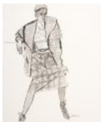
Women's Ensemble with Coat, Sweater Vest, and Plaid Skirt (KA002201_OSxxx1_f05_04)