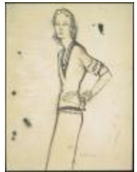
Middy-Bodice Sheath Dress (KA0038_000059)