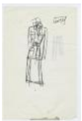
Women's Tweed Suit with Flap Pockets (KA0035_000070)