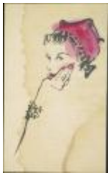
Rose Handkerchief Hat with French Ribbon Trim (KA0038_000121)