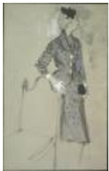
Blue Women's Suit with Black Dots (KA0038_000019)