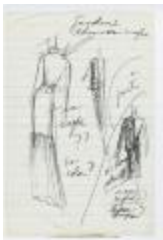
Spangled Suit and Crepe Evening Dress (KA0035_000081)