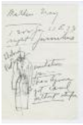
Women's Fur Coat with Patch Pockets (KA0035_000104)