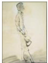
Women's Cardigan Suit with Blue Border (KA0038_000040)