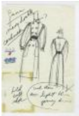
Navy Double Cashmere Coat with Mandarin Collar (KA0035_000138)