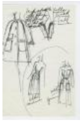
Collarless Tent Coat, White Cashmere Dress, and White Agnona Wool Coat (KA0035_000150)