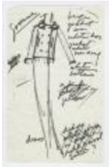
Beige Jacket with Floor-Length White Dress (KA0035_000217)