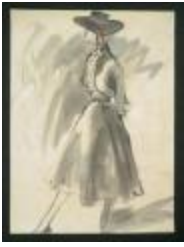
Women's Ensemble with Bolero Jacket and Full Skirt (KA0038_000006)