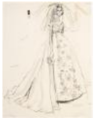
Floral Printed Bridal Gown with Empire Waistline and Flyaway Veil (KA002201_OSxxx1_f10_02)