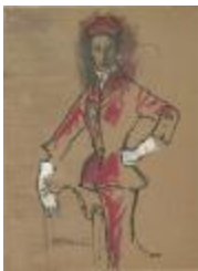
Wine Velveteen Late-Day Suit (KA0038_000038)