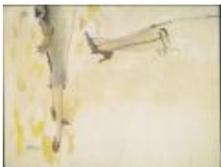
Fitted Skirts with Red or Orange Pumps (KA0038_000083)