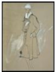
Women's Coat with White Ermine Collar (KA0038_000003)