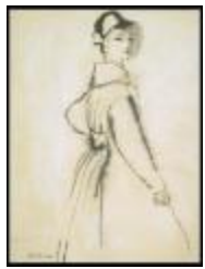
High-Waisted Women's Coat with Back Belt (KA0038_000002)