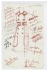
Double-Breasted Coat with Peter Pan Collar and Buttoned Straps (KA0035_000219)