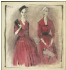
Red Jersey Dresses (KA0038_000036)