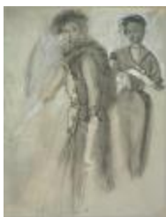
Coat Dresses (KA0038_000025)