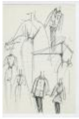
Gandini Silk Dresses and Two-Piece Women's Ensembles (KA0035_000149)