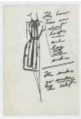
Short-Sleeved Dress with Long Bow (KA0035_000243)