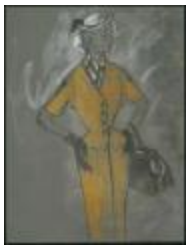
"B&A" Coctine" Linen Suit with Cardigan Jacket (KA0038_000023)