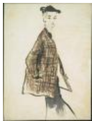
Rust and Black Tweed Collarless Coat (KA0038_000044)