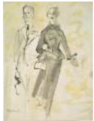
Black Alpaca Skirt and Fitted Jacket (KA0038_000030)