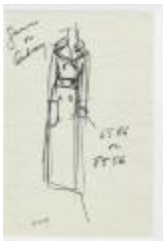
Double-Breasted Coat with Self-Belt and Oversized Patch Pocket (KA0035_000132)