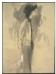
Women's Ensemble with Short Jacket and Cloche Hat (KA0038_000049)