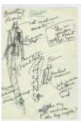
Long-Sleeved Dress with High Collar (KA0035_000125)