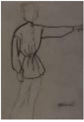
Long-Sleeved Tunic Blouse with Cinched Waistline (KA0038_k09_05_01)