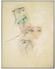
Women Applying Eye Makeup and Plucking Eyebrows (KA0038_000058)