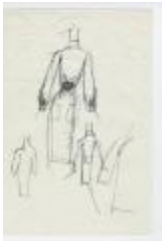
Long-Sleeved Dress with High Collar and Patch Pockets (KA0035_000094)