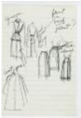
Women's Ensemble with Tent Coat and Pleated Skirt (KA0035_000114)