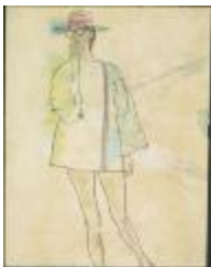
Multicolor Poncho and Sunhat (KA0038_000118)