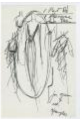
Long-Sleeved Spangled Dress (KA0035_000068)