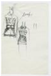
Checked Coat with Belted Waist (KA0035_000099)