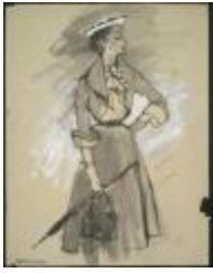
Women's Ensemble with Bolero Jacket and Large Bows (KA0038_000057)