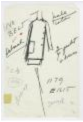
Women's Day Suit with Asymmetrical Jacket (KA0035_000236)