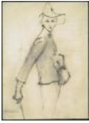
Women's Ensemble with Fitted Jacket and Tall Hat (KA0038_000095)