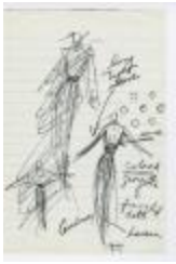
Colored Georgette Evening Dress with Spangled Dots (KA0035_000110)