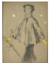
Short Swing Coat with Trumpet Skirt (KA0038_000067)