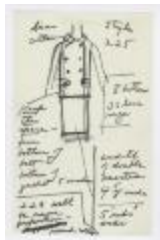
Double-Breasted Coat with Buttoned Straps (KA0035_000199)