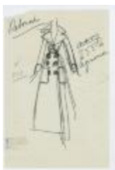
Navy Wool Sash Coat with Wide Lapels (KA0035_000131)