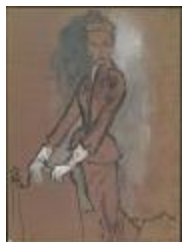
Women's Late-Day Suit in Wine Velveteen (KA0038_000032)