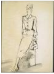
Women's Suit with Yoke and Bow Accents (KA0038_000081)