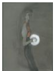
Wool Plaid and Velveteen Directoire Suit (KA0038_000050)