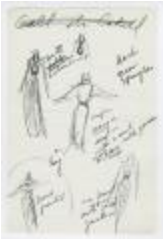
Embroidered, Spangled, and Hand-Painted Dresses (KA0035_000078)