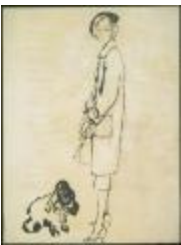
Women's Topcoat with Square Patch Pocket (KA0038_000106)