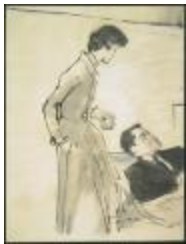
Two Women's Ensembles with Short Jackets and Gingham Blouses (Drawing in 2 Parts) (KA0038_000108)