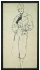
Women's Trench Coat with Wide Notched Collar (KA0038_000102)