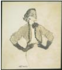
Blond Fleece Jacket with Black Braid and Tassels (KA0038_000063)