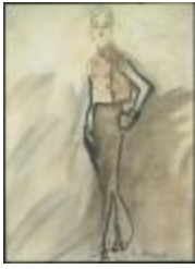
Evening Ensemble with Sleeveless Pink Pillbox Jacket (KA0038_000043)