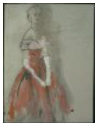
Pale Pink Chiffon Top and Crimson Satin Skirt (KA0038_000041)