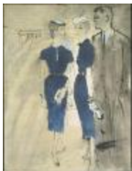
Navy Blue Sheath Dresses with White Buttons (KA0038_000024)