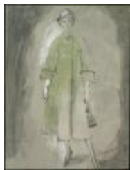
Women's Green Coat with Large Button Closure (KA0038_000075)