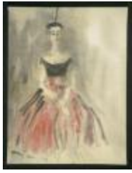
Black Top with Pink Taffeta Skirt (KA0038_000011)