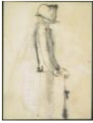
Women's Fitted Jacket and Quilled Hat (KA0038_000098)