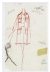
Double-Breasted Taffeta Coat with Large Flap Pockets (KA0035_000232)