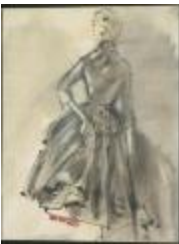
Black Taffeta Dress with Colorful Petticoat (KA0038_000046)