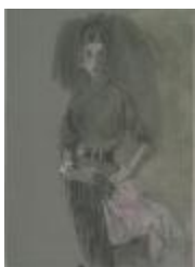
Women's Ensemble with Belted Sweater and Pleated Skirt (KA0038_000055)