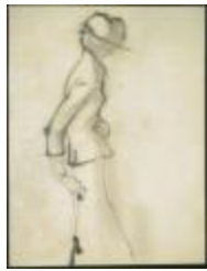
Women's Fitted Jacket and Quilled Hat (KA0038_000105)