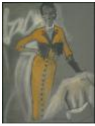
Orange Coat Dress with Large Black Bow (KA0038_000033)