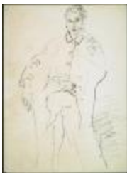
Women's Ensemble Featuring Coat with Flap Closure (KA0038_000100)