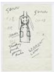
Shocking Pink Jersey Dress (KA0035_000220)