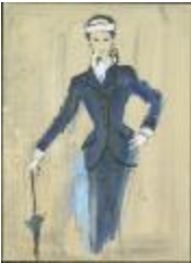
Fitted Blue Women's Suit (KA0038_000115)