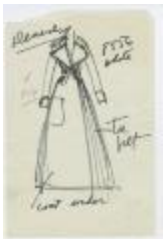
Long White Coat with Tie-Belt and Wide Lapels (KA0035_000133)