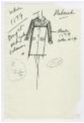
White Coat with Red Yoke and Sleeves (KA0035_000237)