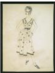
Day Dress with Butterfly Embroidery (KA0038_000010)