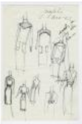
Purple Dress (KA0035_000066)