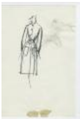
Collarless Coat or Dress with Patch Pockets (KA0035_000085)