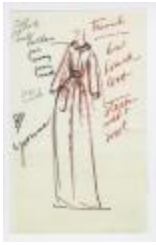
Trench-Style House Coat (KA0035_000215)