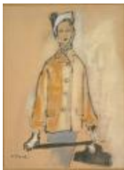
Women's "B&A" Coctine" Wool Coat (KA0038_000026)