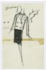
Double-Breasted Red Jacket with Pencil Skirt (KA0035_000208)