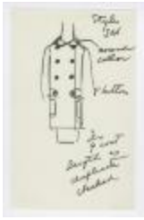
Double-Breasted Coat with Buttoned Straps and Patch Pockets (KA0035_000200)