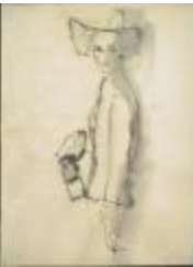
Women's Ensemble with Fitted Jacket and Wide-Brimmed Hat (KA0038_000079)