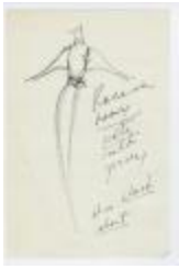
White Silk Jersey Dress with Dolman Sleeves (KA0035_000072)