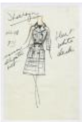
Blue and White Checked Coat (KA0035_000212)