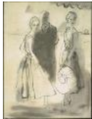
Blue Dresses with Tucks (KA0038_000015)