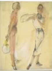
Shell Pink Dress and Lavender-Blue Ensemble (KA0038_000056)