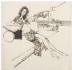
Women's Printed Ensemble with Wrap Skirt, Bikini Top, and Bolero Jacket (KA002201_OSxxx1_f04_08)