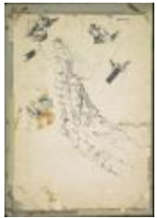
Ruffled Bridal Gown and Containers of "Salut de Schiaparelli" (KA0038_000077)