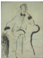
Women's Ensemble Featuring Coat with Flap Closure and Dark Collar (KA0038_000078)