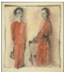
Red Jersey Ensemble and Shirtwaist Dress (KA0038_000037)