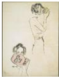
Women Applying "Diet-Form" and Heated Facial Mask (KA0038_000045)