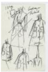
Belted Coat with Assortment of Swing Coats (KA0035_000090)