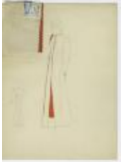
Floor-Length Evening Coat or Housecoat (KA0067_000156)