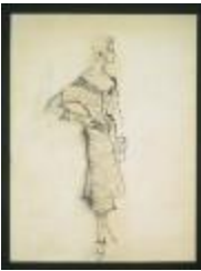
Short-Sleeved Dress with Diagonal Stripes (KA0038_000103)