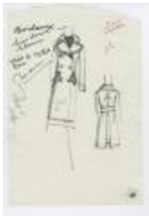
Women's Double-Breasted Coat with Wide Notched Collar (KA0035_000230)