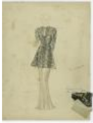
Women's Evening Ensemble with Lace Tunic Jacket (KA0067_000094)