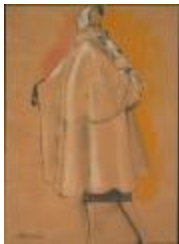
Women's "B&A" Coctine" Coat with Low Yoke (KA0038_000021)