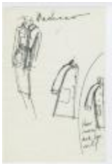
Women's Suit and Overcoat (KA0035_000121)