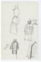
Checked Coats and Long-Sleeved Flounced Dress (KA0035_000109)