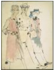
Women's Pink Coat and Jacket Ensembles (KA0038_000027)