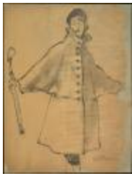
Women's Tent Coat with Dolman Sleeves (KA0038_000018)