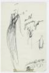
Silk Jersey Dress (KA0035_000067)