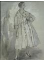
Women's Ensemble with Shirtdress and Tent Coat (KA0038_000016)