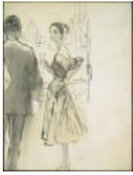
Pleated Dress with Bell Sleeves (KA0038_000042)