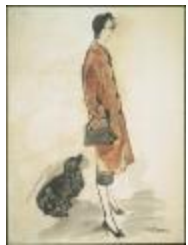
Auburn Velvet Coat (KA0038_000035)