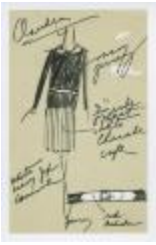
Pleated White Crepe Skirt with Navy Jersey Overblouse (KA0035_000214)