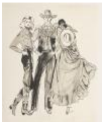
Man and Two Women Wearing Cowboy Inspired Ensembles (KA002201_OSxxx1_f04_05)