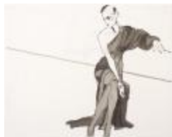
One-Sleeved Evening Dress with High Skirt Slit (KA002201_OSxxx1_f05_03)