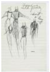
Racine Silk Jersey Dresses (KA0035_000113)