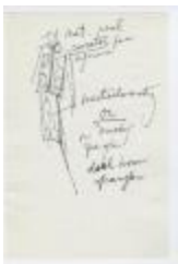
Red or Dark Brown Spangled Women's Ensemble (KA0035_000103)