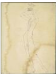
Women's Beachwear Ensemble with Buttoned Dress and Sunhat (KA0038_000104)