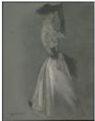
Blond Taffeta Coat Dress (KA0038_000064)