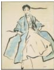
Blue Linen Coat with Embroidered Dinner Dress (KA0038_000053)