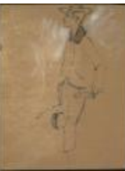
Topaz Wool Ensemble with Mink Collar (KA0038_000065)