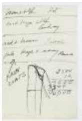
Partial Design for Raincoat (KA0035_000077)