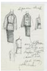
Alpaca Checked Coats and Solid Skirts (KA0035_000148)