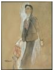
Box-Jacket Suit with Pink Velveteen Vest (KA0038_000022)