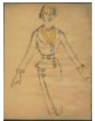
Grey Wool Jersey Dress with Wrap-Around Skirt (KA0038_000066)