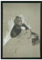
Women's Coat with Oversized Collar (KA0038_000008)