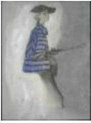
Blue and Black Striped Jacket with Raglan Sleeves (KA0038_000051)