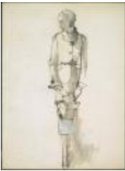
Women's Suit with Belted Jacket and Fitted Skirt (KA0038_000093)