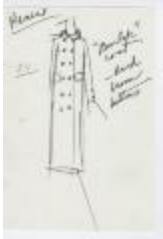
"Burlap" Coat (KA0035_000130)