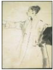
Women's Loose Overcoat with Small Buttons and Fur Muff (KA0038_000107)