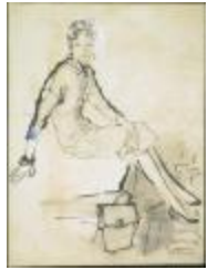
Women's Cardigan Suit (KA0038_000014)