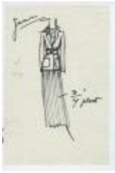
Long Pleated Skirt with Belted Jacket (KA0035_000135)