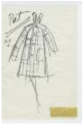
Checked Tent Coat with High Collar (KA0035_000142)