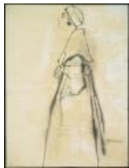
High-Waisted Women's Coat with Shawl Collar (KA0038_000031)