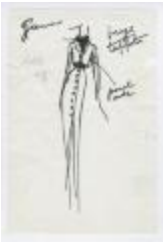
Beige Taffeta Women's Ensemble with Buttoned Skirt (KA0035_000226)