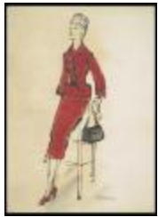
Red Women's Suit with Rounded Yoke (KA0038_000001)