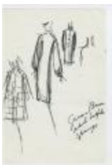
Checked Coat and Long-Sleeved Dress (KA0035_000098)