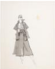
Women's Ensemble Featuring A-Line Wrap Skirt and Short-Sleeved Jacket (KA002201_OSxxx1_f05_02)