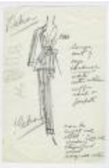
Beige Cashmere Lounge Suit (KA0035_000222)