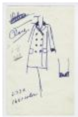
A-Line Chesterfield Coat with Flap Pockets (KA0035_000216)