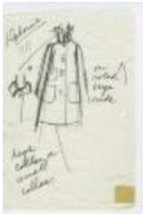
Tent Coat with Three Pockets and High Collar (KA0035_000145)