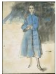
Turquoise Blue Coat with Fringe (KA0038_000076)