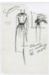
Women's Ensemble with Midi-Length Skirt and Cropped Jacket (KA0035_000224)