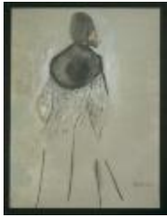
Women's Tweed Coat with Sealskin Collar (KA0038_000007)