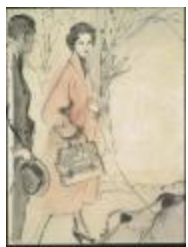
Pink Fleece Women's Coat (KA0038_000052)