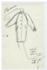
Raglan-Sleeved Coat with Mandarin Collar (KA0035_000140)