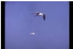
Coney Island (KA0130_000001)