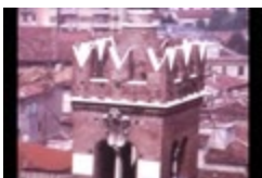
Ponte di Veia (KA0130_000003)