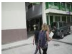
The International Field Program: Caldas, Colombia (IFP_Parts_1_and_2)