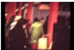
Partenza Michelangelo (KA0130_000002)