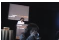
Centurion Award for Design Excellence Presentation (PC030101_PICd034)