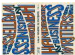
Handbook for Business Writers book cover proof (KA0009_000004)