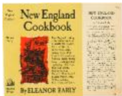
New England Cookbook book cover proof (KA0009_000003)