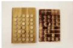
Styles for Writing book cover sculpture and proof (KA0009_000001)