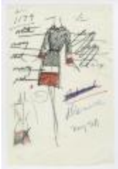
Navy Taffeta Coat with White and Red Stripes (KA0035_000234)