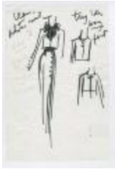
White Women's Suit with Bow Collar (KA0035_000229)