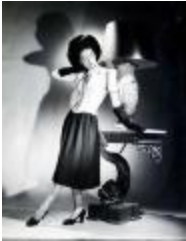
"Basque" Silhouette Dress with Lace-Up Bodice (KA0035_000004)