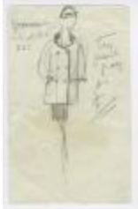
Women's Double-Breasted, Chesterfield Coat (KA0035_000180)