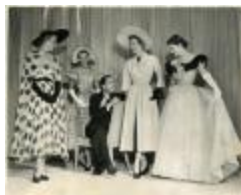
Norman Norell with Models Wearing His Designs at a Neiman Marcus Presentation (KA0035_000042)