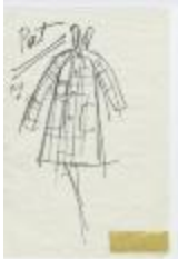
Checked Tent Coat with High Collar (KA0035_000142)