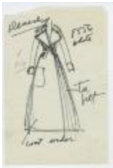
Long White Coat with Tie-Belt and Wide Lapels (KA0035_000133)