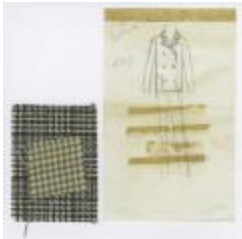
Glen Plaid or Herringbone Women's Suit (KA0035_000202)