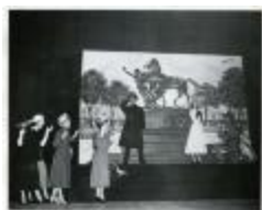
Traina-Norell Fashion Presentation Featuring Models and Costumed Actors (KA0035_000044)