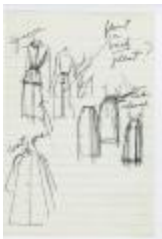
Women's Ensemble with Tent Coat and Pleated Skirt (KA0035_000114)