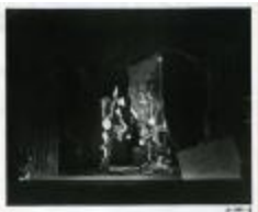
Store Window Display Featuring Sequined Evening Dress by Traina-Norell (KA0035_000024)