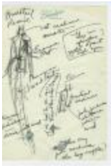
Long-Sleeved Dress with High Collar (KA0035_000125)