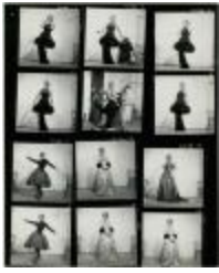
Dinah Shore Modeling Four Evening Ensembles by Norell (KA0035_000003)