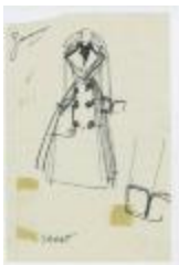
Women's Double-Breasted Coat with Wide Lapels (KA0035_000134)