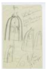
Brocade Evening Cape (KA0035_000156)