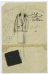
Women's Ensemble with Pleated Skirt and Black Velvet Collar (KA0035_000211)