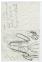
Tent Coat with Oversized Patch Pockets (KA0035_000111)