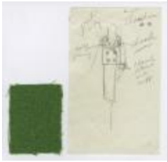
Bright Green Box-Cut Jacket (KA0035_000179)