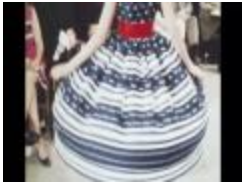
Norman Norell Spring/Summer 1968 Fashion Presentation (Norell_showroomcollection_1968)