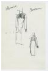
"Bordeau" Dress (KA0035_000091)