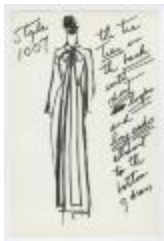
Floor-Length Evening Dress with Long Bow Collar (KA0035_000244)