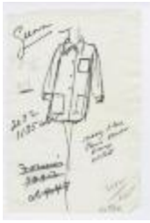
Women's Coat with Pointed Collar and Patch Pockets (KA0035_000221)