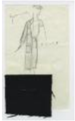
Women's Three-Piece Suit with Buttoned-Flap Pockets (KA0035_000167)