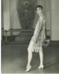
Silver Sequined Fringe Dress (KA0035_000051)