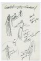
Embroidered, Spangled, and Hand-Painted Dresses (KA0035_000078)