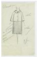
Women's Black and White Overcoat (KA0035_000159)