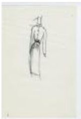
Shirtdress with Standing Collar (KA0035_000092)