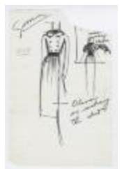
Women's Ensemble with Midi-Length Skirt and Cropped Jacket (KA0035_000224)