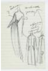
Cashmere Jersey Dress with Alpaca Overcoat (KA0035_000119)