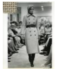
Double-Breasted Beige and Brown Wool Coat with Large Square Patch Pockets (KA0035_000062)