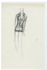
Women's Checked Blazer (KA0035_000117)