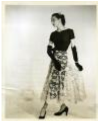
Traina-Norell Gown No. 533 (KA0035_000034)