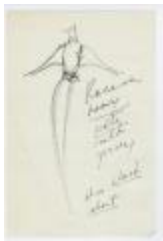
White Silk Jersey Dress with Dolman Sleeves (KA0035_000072)