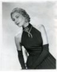
Traina-Norell Gown #140 (KA0035_000020)