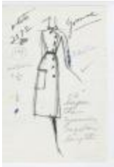
White Dress or Coat with Buttons and Oversized Patch Pocket (KA0035_000126)