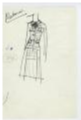
Women's Plaid Suit with Bow Collar (KA0035_000141)