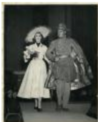
Traina-Norell Fashion Presentation Featuring Model and Costumed Actor (KA0035_000046)