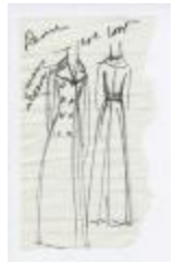
Double-Breasted Evening Coat (KA0035_000242)