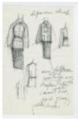
Alpaca Checked Coats and Solid Skirts (KA0035_000148)