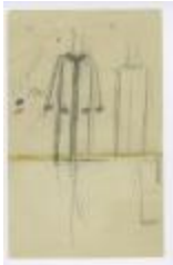
Cardigan Coat (KA0035_000204)