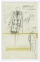
Double-Breasted Wrap Coat with Buttoned Straps (KA0035_000201)