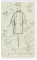
Double-Breasted Navy Coat with Gold Cords or Beads (KA0035_000164)