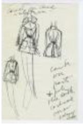
Women's Ensemble with Belted Camel Jacket (KA0035_000096)