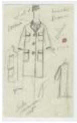
Women's Chesterfield Coat with Black Piping (KA0035_000166)