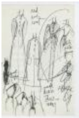
Red Evening Coat with Assortment of Dresses (KA0035_000105)