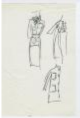
Women's Suit and Partial Ensembles (KA0035_000084)