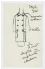
Double-Breasted Coat with Buttoned Straps and Patch Pockets (KA0035_000200)