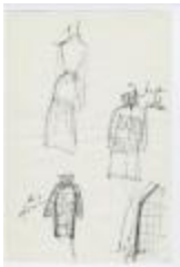
Checked Coats and Long-Sleeved Flounced Dress (KA0035_000109)