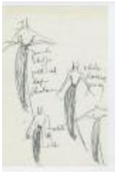
White, Black, and Pink Long-Sleeved Dresses (KA0035_000106)