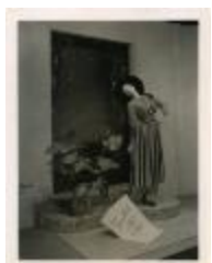
Jordan Marsh Store Display Featuring Ensemble by Traina-Norell (KA0035_000036)