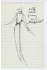
Black Silk Jersey Evening Dress with Dolman Sleeves (KA0035_000118)