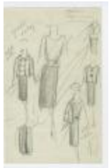
Black and White Women's Ensembles with Box Jackets (KA0035_000161)