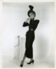
Traina-Norell Dress No. 532 (KA0035_000027)