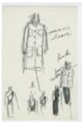
Pink Coat with Assortment of Dresses (KA0035_000086)