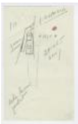
Box-Cut Jacket with Notched Collar and Patch Pockets (KA0035_000169)