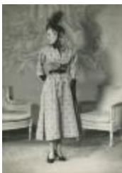
Patterned Shirt Dress with Feathered Hat (KA0035_000037)