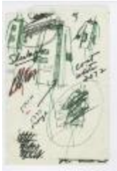
White Coat with Orange Trim (KA0035_000228)