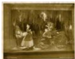
Lord & Taylor Window Display Featuring Traina-Norell Dresses and Horse-Drawn Carriage (KA0035_000043)