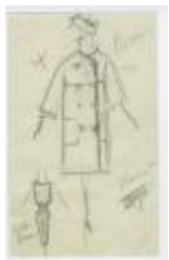
Double-Breasted Red Coat with Black Blouson Dress (KA0035_000163)