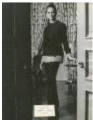
Evening Ensemble with Sequin-Bordered Tunic Top (KA0035_000056)