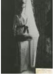
Sequined Evening Ensemble with Fur-Bordered Tunic Top (KA0035_000053)