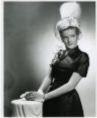
Traina-Norell Dress #102 with Ermine Hat, Cartier Diamond Jewelry (KA0035_000009)