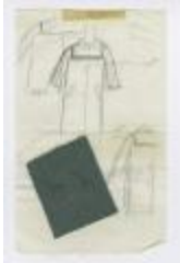
Green Woolen Coat or Coat Dress (KA0035_000185)