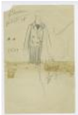
Double-Breasted Jacket with Knee-Length Pleated Skirt (KA0035_000205)