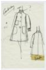
Tent Coat with Standing Collar and Three Pockets (KA0035_000146)