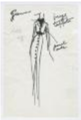
Beige Taffeta Women's Ensemble with Buttoned Skirt (KA0035_000226)