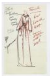
Trench-Style House Coat (KA0035_000215)