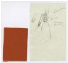
Cherry Red Embellished Bolero Jacket (KA0035_000177)