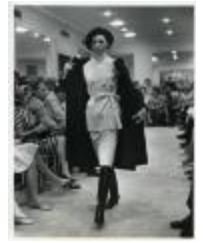
Three-Piece Women's Ensemble with Large Square Patch Pockets (KA0035_000061)