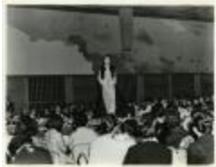
Sequined Evening Dress with Sleeveless Caftan (KA0035_000050)