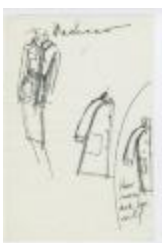
Women's Suit and Overcoat (KA0035_000121)