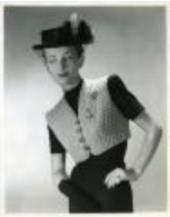
Traina-Norell Costume #133 & 1133 (KA0035_000019)