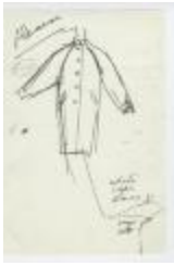
Raglan-Sleeved Coat with Mandarin Collar (KA0035_000140)