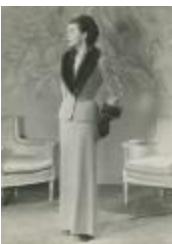
Women's Evening Suit with Fur Trim (KA0035_000039)