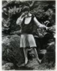
Beige Shirt-Waist Dress with Long Navy Blue Jerkin (KA0035_000048)