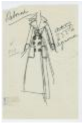
Navy Wool Sash Coat with Wide Lapels (KA0035_000131)