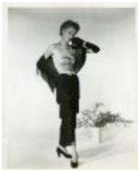
Traina-Norell Gown No. 524 (KA0035_000035)