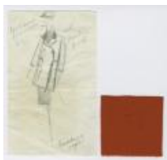
Women's Double-Breasted Chesterfield Coat in "Hunting Pink" (KA0035_000182)