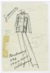
Women's Pants Ensemble with Double-Breasted Jacket (KA0035_000239)