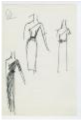
One-Sleeved Dresses (KA0035_000076)