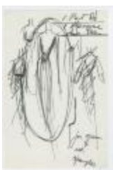
Long-Sleeved Spangled Dress (KA0035_000068)