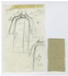
Double-Breasted, Raglan-Sleeved Coat (KA0035_000187)