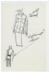
Women's Tweed Suit with "Diplomat" Skirt (KA0035_000147)