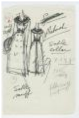
Women's Double-Breasted Coat with Sable Accents (KA0035_000128)