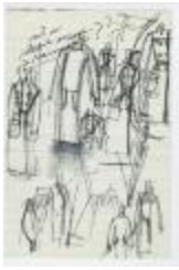
Long-Sleeved Dresses and Raincoats (KA0035_000083)