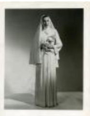
Nun-Inspired Bridal Gown with Diamonds by Van Cleef & Arpels (KA0035_000018)