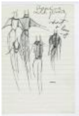
Racine Silk Jersey Dresses (KA0035_000113)