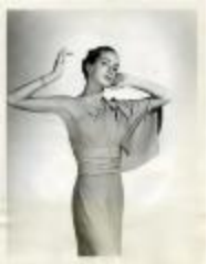
Flame-Colored Formal Dinner Gown with Diamonds by Van Cleef & Arpels (KA0035_000017)