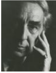
Portrait of Norman Norell (KA0035_000052)