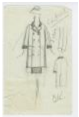
Double-Breasted Chesterfield Coat with Contrast Collar (KA0035_000154)