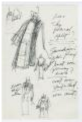
Plaid Coats and Jersey Dresses (KA0035_000101)