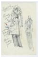
Plaid Coat and Jacket Ensemble (KA0035_000136)