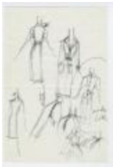
Belted Dresses and Coats (KA0035_000108)