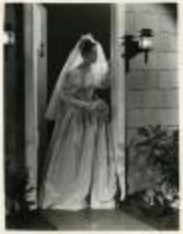
White Taffeta Corselet Wedding Dress (KA0035_000011)