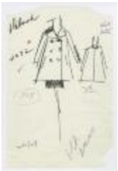
White Satin Tent Coat and Black Dress (KA0035_000235)