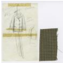
Herringbone Women's Suit (KA0035_000203)