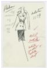
White Women's Ensemble with Belted Jacket (KA0035_000241)