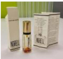
Norell Perfume Spray (KA0035_000248)