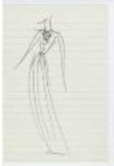
Long-Sleeved Evening Dress with Embellished Bodice (KA0035_000116)