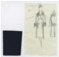
Double-Breasted Chesterfield Coat with Fur Trim (KA0035_000172)