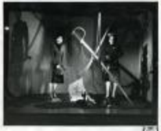
Store Window Display Featuring "Fencing Jacket" Ensembles by Traina-Norell (KA0035_000022)