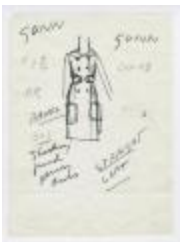
Shocking Pink Jersey Dress (KA0035_000220)