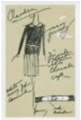
Pleated White Crepe Skirt with Navy Jersey Overblouse (KA0035_000214)