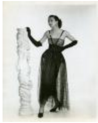
Traina-Norell Gown No. 534 (KA0035_000032)