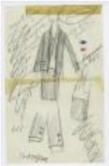
Black Cardigan Suit with White Satin Blouse (KA0035_000207)