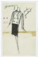
Double-Breasted Red Jacket with Pencil Skirt (KA0035_000208)