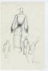
Long-Sleeved Dress with High Collar and Patch Pockets (KA0035_000094)