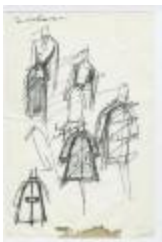
Tent Coat and Belted Shirtdress (KA0035_000082)