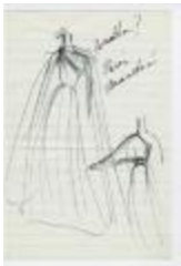
Asymmetrical Evening Dresses (KA0035_000115)