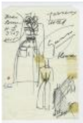
Women's Tweed Ensemble with Bow Collar (KA0035_000137)