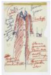
Double-Breasted "House Gown" (KA0035_000210)