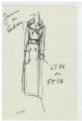
Double-Breasted Coat with Self-Belt and Oversized Patch Pocket (KA0035_000132)