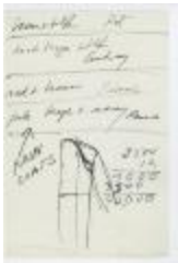
Partial Design for Raincoat (KA0035_000077)