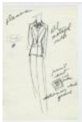
Natural Silk Ensemble with Checked Skirt (KA0035_000139)