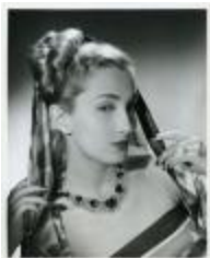
Balinese Print Evening Gown with Jean Schlumberger Necklace (KA0035_000030)