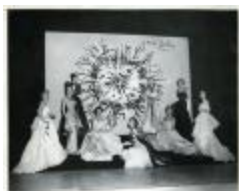
Fashion Presentation Featuring Traina-Norell Evening Gowns and Painted Backdrop (KA0035_000045)