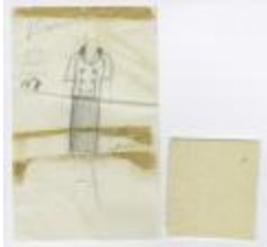
Short-Sleeved Jacket with Black Skirt (KA0035_000197)