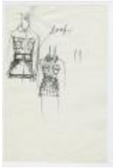
Checked Coat with Belted Waist (KA0035_000099)