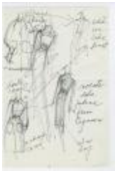
Long-Sleeved Dresses with Camel and Checked Coats (KA0035_000107)