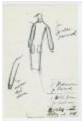
Long-Sleeved Dress with High Collar and Patch Pockets (KA0035_000071)