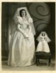
White Taffeta Corselet Wedding Dress on Model and Marionette (KA0035_000012)