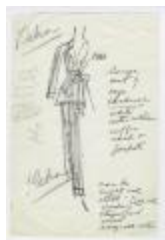
Beige Cashmere Lounge Suit (KA0035_000222)