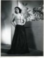
Evening Dress with Long Sleeves and Boned Bodice (KA0035_000015)