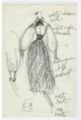
White Satin and Black Velvet Puff-Sleeved Dress (KA0035_000069)