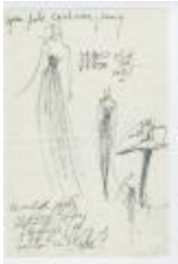
Long-Sleeved Cashmere and Silk Jersey Dresses (KA0035_000100)