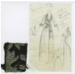
Black and Gold Brocade Housecoat (KA0035_000184)