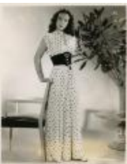
Sequined Formal Gown with Black Corselet (KA0035_000010)