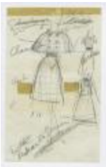
Checked Ensemble with Double-Breasted Capelet (KA0035_000191)