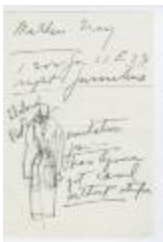
Women's Fur Coat with Patch Pockets (KA0035_000104)