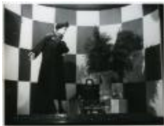
Henri Bendel Window Display Featuring Traina-Norell Evening Coat with Fur Trim (KA0035_000005)