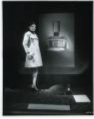
Bonwit Teller Window Display Featuring 'Norell' Perfume and Double-Breasted Coat (KA0035_000059)