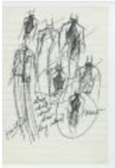
Women's Evening Ensemble with Halter Neckline (KA0035_000089)