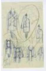
Women's Double-Breasted Chesterfield Coats (KA0035_000158)