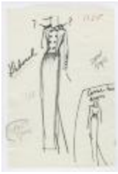
Women's Evening Ensemble with Double-Breasted Jacket (KA0035_000233)