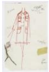
Double-Breasted Taffeta Coat with Large Flap Pockets (KA0035_000232)