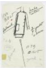
Women's Day Suit with Asymmetrical Jacket (KA0035_000236)