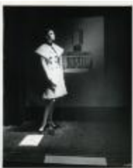
Bonwit Teller Window Display Featuring 'Norell' Perfume and Cape Coat (KA0035_000058)