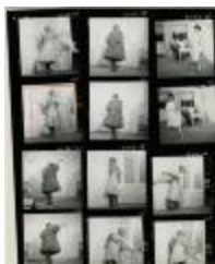
Dinah Shore and Unknown Model Wearing Evening Ensembles by Norell (KA0035_000002)