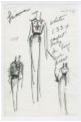
Floor-Length Evening Dress with Nautical Themed Jacket (KA0035_000225)