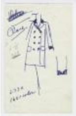
A-Line Chesterfield Coat with Flap Pockets (KA0035_000216)