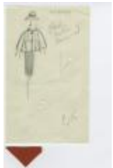
Women's Red Woolen Coat Ensemble (KA0035_000153)