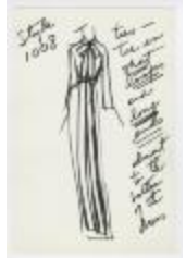
Long-Sleeved Evening Dress with Long Bow Collar (KA0035_000245)