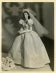
White Taffeta Corselet Wedding Dress on Marionette (KA0035_000013)