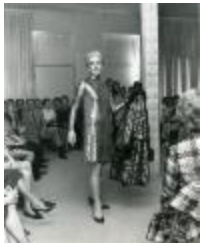
Long-Sleeved Sequined Dress with Brocade Evening Coat (KA0035_000060)