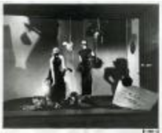
Store Window Display Featuring Black Evening Dresses by Traina-Norell (KA0035_000023)