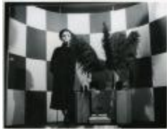
Henri Bendel Window Display Featuring Traina-Norell Evening Coat with Persian Lamb Collar (KA0035_000006)