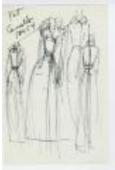
Full-Length Belted Overcoats (KA0035_000120)