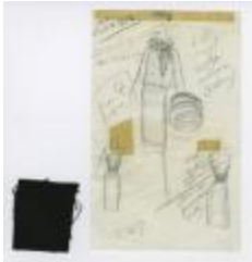
Black Suit with Sable Collar and Muff (KA0035_000190)