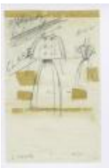
Women's Ensemble with Double-Breasted Capelet (KA0035_000188)