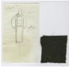
Women's Ensemble with Puffed-Sleeved Jacket (KA0035_000183)