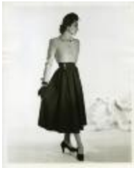
Traina-Norell Dress No. 517 (KA0035_000031)