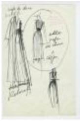
White Crepe de Chine Pleated Dresses (KA0035_000087)