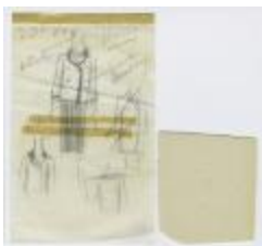
White Double-Breasted Coat with Pleated Skirt (KA0035_000194)