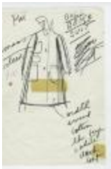
Tent Coat with High Collar (KA0035_000143)