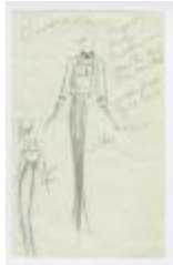
Women's Evening Ensemble with Military Inspired Jacket (KA0035_000171)