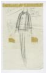
Double-Breasted Coat with Pants (KA0035_000189)