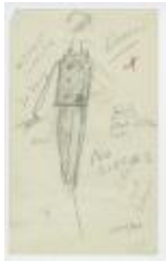
Women's Sleeveless Suit with Bow-Collared Blouse (KA0035_000165)