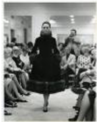
Green Velvet Evening Coat with Sable Trim (KA0035_000064)