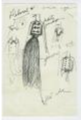
Jersey Skirt with White Bolero Jacket (KA0035_000129)