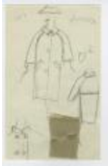
Raglan-Sleeved Overcoat (KA0035_000155)