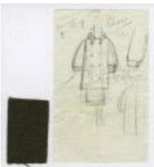
Double-Breasted Coat with Quilted Lining (KA0035_000181)