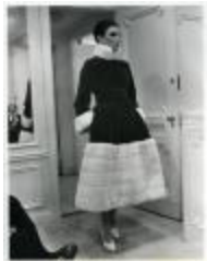
Green Velvet and White Mink Evening Coat (KA0035_000065)