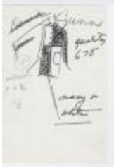
Navy and White "Quadrant" Coat (KA0035_000127)