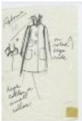
Tent Coat with Three Pockets and High Collar (KA0035_000145)