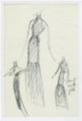
Assortment of Evening Dresses (KA0035_000097)