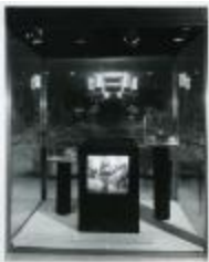
Bonwit Teller Window Display Featuring 'Norell' Perfume (KA0035_000057)