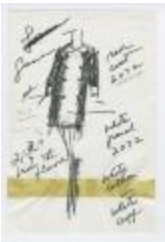
Red Coat with White Panel (KA0035_000223)