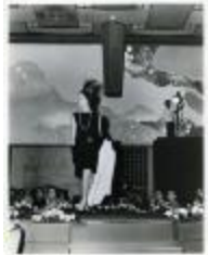
Drop-Waist Dress with Pleated Skirt and Embellished Belt Buckle (KA0035_000049)