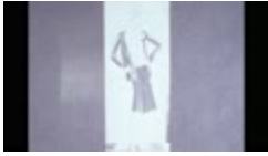
Norman Norell (Norell_documentary_1972)