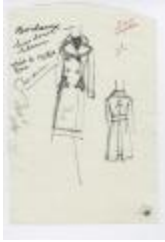
Women's Double-Breasted Coat with Wide Notched Collar (KA0035_000230)