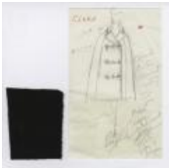
Black Cape with Embroidered Frogs (KA0035_000168)