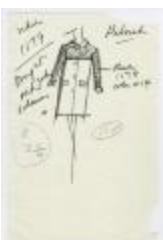
White Coat with Red Yoke and Sleeves (KA0035_000237)