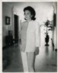
Two-Toned Evening Pajamas (KA0035_000047)