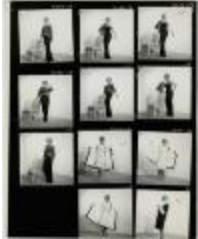
Dinah Shore Modeling Two Ensembles by Norell (KA0035_000001)