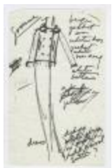
Beige Jacket with Floor-Length White Dress (KA0035_000217)