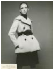
Double-Breasted Coat with Belted Waist and Rounded Collar (KA0035_000055)