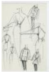
Gandini Silk Dresses and Two-Piece Women's Ensembles (KA0035_000149)