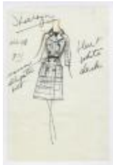
Blue and White Checked Coat (KA0035_000212)