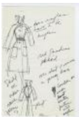
Red Plaid Coat with Raglan Sleeves (KA0035_000075)