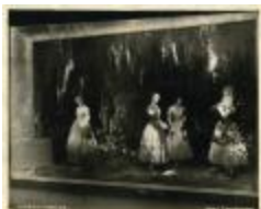
Lord & Taylor Window Display Featuring Traina-Norell Dresses with Full Skirts (KA0035_000041)