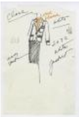
White Jacket, Red Blouse, and Navy Skirt (KA0035_000213)