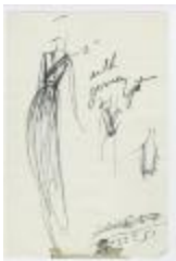
Silk Jersey Dress (KA0035_000067)