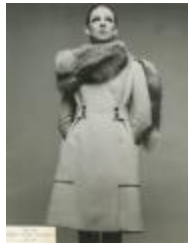
Wrap Coat with Large Square Patch Pockets and Fur Wrap (KA0035_000054)