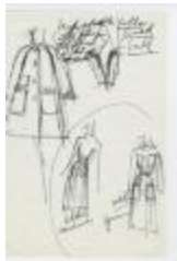
Collarless Tent Coat, White Cashmere Dress, and White Agnona Wool Coat (KA0035_000150)