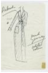
Pink Jersey and White Satin Wrap Coat (KA0035_000144)