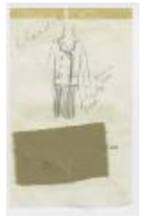
Pleated Black Skirt with Double-Breasted Jacket (KA0035_000198)