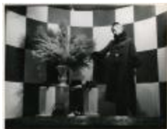
Henri Bendel Window Display Featuring Traina-Norell Evening Coat with Fur Wrap (KA0035_000007)