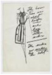
Short-Sleeved Dress with Long Bow (KA0035_000243)