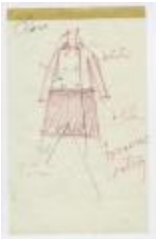
Black and White "Cone" Coat (KA0035_000209)