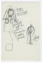
Women's Coat with Raglan Sleeves and Oversized Patch Pockets (KA0035_000123)