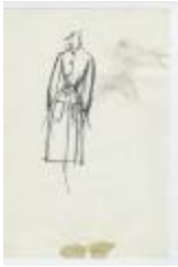
Collarless Coat or Dress with Patch Pockets (KA0035_000085)