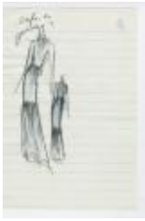
Crepe or Jersey Dress with Flounced Skirt (KA0035_000152)