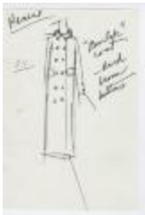
"Burlap" Coat (KA0035_000130)