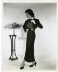
Traina-Norell Dress No. 577 (KA0035_000033)