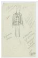
Women's Ensemble with Double-Breasted Box Coat (KA0035_000162)