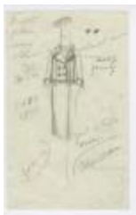
Women's Ensemble with Double-Breasted, Box-Cut Jacket (KA0035_000178)