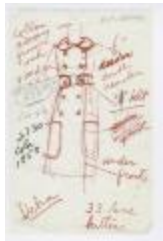
Double-Breasted Coat with Peter Pan Collar and Buttoned Straps (KA0035_000219)