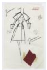
Double-Breasted Cape Coat (KA0035_000231)