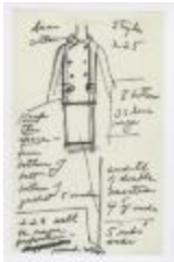
Double-Breasted Coat with Buttoned Straps (KA0035_000199)