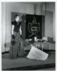
The Blum Store Window Display Featuring Traina-Norell Evening Dress with Boned Bodice and Dotted Skirt (KA0035_000014)