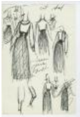
Long-Sleeved Dress with Brown Jersey Skirt (KA0035_000088)