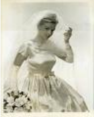
Bridal Dress with Veil and Cartier Diamond Jewelry (KA0035_000008)