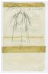
Tent Coat with Mandarin Collar (KA0035_000195)