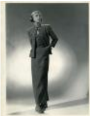
Wool Jersey Dinner Suit (KA0035_000025)