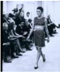
Two-Piece Sequined Shift Dress with Bare Midriff (KA0035_000246)