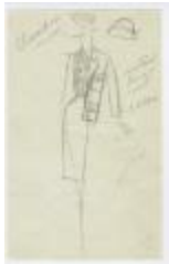
Women's Natural Linen Suit with Buttoned-Flap Pockets (KA0035_000160)