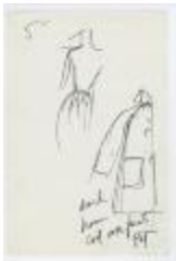
Partial Sketch of Dress and Tent Coat (KA0035_000080)