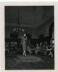
Women's Ensemble with "Fencer Jacket Silhouette" (KA0035_000026)