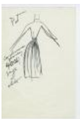
Long-Sleeved Cashmere Jersey Dress (KA0035_000093)