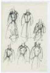
Belted Coats (KA0035_000074)