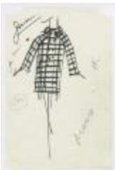
Checked Coat with Raglan Sleeves (KA0035_000238)