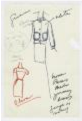
Short-Sleeved Brown Dress with White Jacket (KA0035_000240)