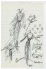
Colored Georgette Evening Dress with Spangled Dots (KA0035_000110)