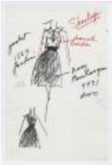
Sleeveless Navy Dress with Nautical Themed Jacket (KA0035_000227)