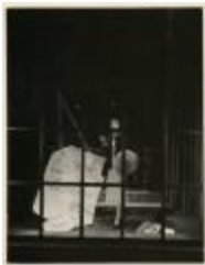
Neiman Marcus Window Display Featuring Traina-Norell Ensemble (KA0035_000040)