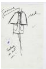
Red Cape Coat (KA0035_000124)