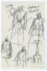
Belted Coat with Assortment of Swing Coats (KA0035_000090)