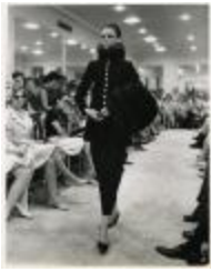
Women's Evening Ensemble with Fur Muff and Embellished Buttons (KA0035_000063)