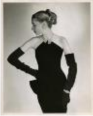
Black Velvet "Necklace Dress" with Jewels by Van Cleef & Arpels (KA0035_000016)