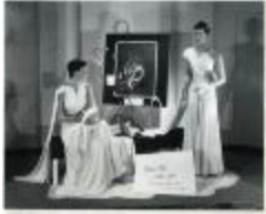
The Blum Store Window Display Featuring White Evening Dresses by Traina-Norell (KA0035_000021)