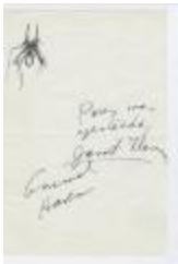
Twisted Halter Top (KA0035_000102)