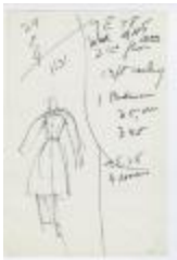
Women's Raglan-Sleeved Coat (KA0035_000079)