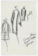
Checked Coat and Long-Sleeved Dress (KA0035_000098)