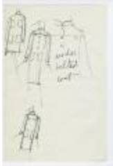
Long-Sleeved Dresses with Patch Pockets (KA0035_000073)