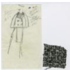
Tweed Women's Suit with Double-Breasted Cape (KA0035_000176)