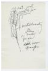
Red or Dark Brown Spangled Women's Ensemble (KA0035_000103)