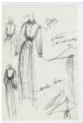
Long-Sleeved White Cashmere Dresses (KA0035_000112)