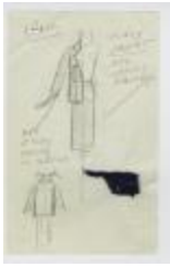
Navy Women's Suit with Red Jersey Facings (KA0035_000157)