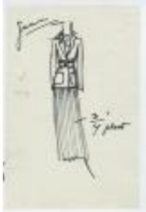
Long Pleated Skirt with Belted Jacket (KA0035_000135)