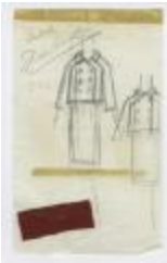
Red Ensemble with Double-Breasted, Raglan-Sleeved Jacket (KA0035_000192)