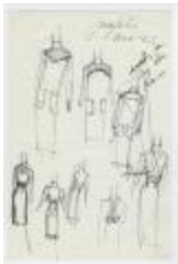
Purple Dress (KA0035_000066)