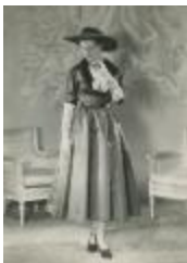
Dinner Dress with Sable Trim and Rose Embellishments (KA0035_000038)