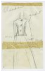
Fitted Jacket with Floor-Length Skirt (KA0035_000193)