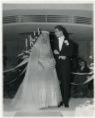
Bride or Model in Wedding Gown with Full Veil and Floral Crown (KA0035_000028)