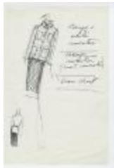
Beige, White, and Brown Women's Ensemble (KA0035_000151)