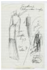
Spangled Suit and Crepe Evening Dress (KA0035_000081)