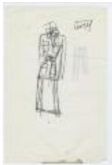
Women's Tweed Suit with Flap Pockets (KA0035_000070)