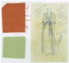
Bright Satin Housecoat (KA0035_000174)