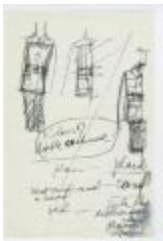
Women's Ensemble with Belted Jacket (KA0035_000122)