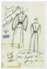
Navy Double Cashmere Coat with Mandarin Collar (KA0035_000138)