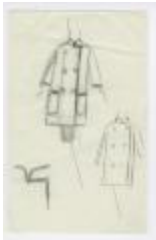
Double-Breasted Coat with Mandarin Collar (KA0035_000170)