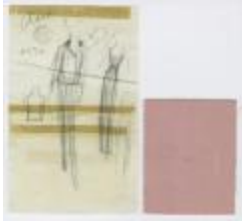
Floor-Length Dress with Double-Breasted Jacket (KA0035_000196)