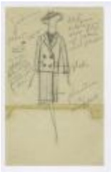
Double-Breasted Coat and Navy Pleated Wrap Skirt (KA0035_000206)