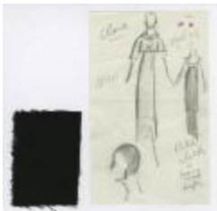
Full-Length Black Dress with Bolero Jacket (KA0035_000175)