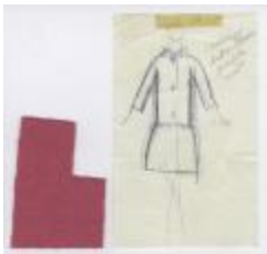
Bright Pink Coat Dress (KA0035_000186)