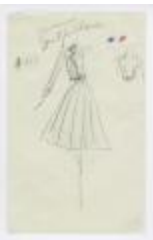
Green Suit with Gored Skirt and Pillbox Jacket (KA0035_000173)