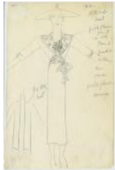
Women's Black CrÃ©pe Suit with Field Flower Printed Fichu Collar (KA0039_V9p65-003)