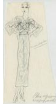
Blue and Green "Crepey" Silk Dress with Two Large Bows (KA0039_V8p49-001)