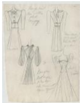
Set of Four Sketches Depicting a Women's Suit, Coat, and Two Dresses (KA0039_V8p55-004)