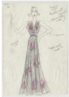
Floral Printed Net Evening Dress with a Royal Blue Satin Belt (KA0039_V8p44-05)