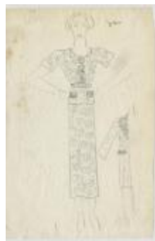
Floral Print Women's Ensemble with Matching Jacket (KA0039_V8p13-003)