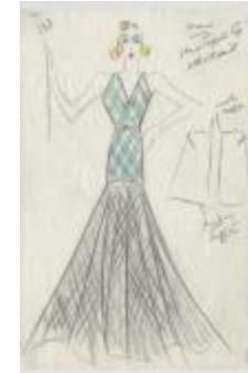
Women's Evening Ensemble with Green Plaid Taffeta Top and Black Net Skirt (KA0039_V8p31-009)