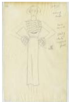
Navy CrÃ©pe Dress with White Ruffled Gilet and Sleeve Cuffs (KA0039_V9p67-003)