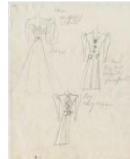
Set of Three Sketches Depicting a Black Evening Dress, Navy Crepe Dress, and Blue Coat with Painted Flower Buttons