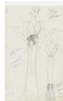
Black Evening Dress with Sash Belt and Pleated Panels (KA0039_V8p11-008)