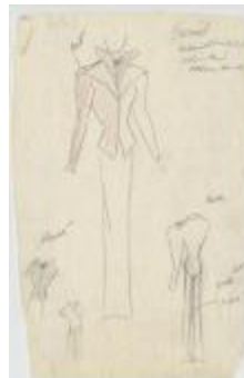
Black Satin Dress with Draped Bodice (KA0039_V8p77-003 (not scanned))