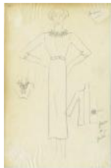
Women's Ensemble with Floral Embellishments (KA0039_V9p68-001)