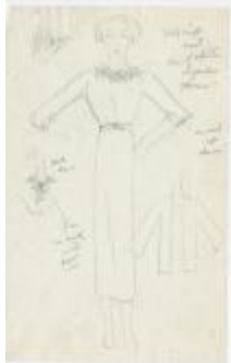
Black CrÃ©pe Women's Suit with White Organdie Flower Lei (KA0039_V8p07-005)