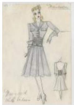
Navy Blue Dress with White Borders and Bows (KA0039_V8p40-003)