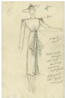
Long-Sleeved Black Wool Dress with Printed Accents (KA0039_V9p52-005)