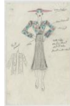
Women's Ensemble with Printed Blouse and Black CrÃ©pe Pleated Skirt (KA0039_V9p05-005)