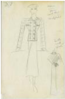
Women's Ensemble with Double-Breasted Check Print Jacket (KA0039_V9p71-003)