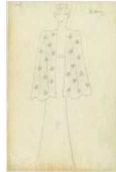
Women's Evening Ensemble with Floral Embellished Net Cape (KA0039_V9p68-007)