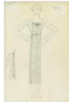
Long-Sleeved Printed Dress with Pleated Panel and Matching Coat (KA0039_V9p69-003)