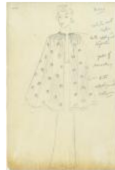
Women's White Net Evening Cape with Smocked Yoke and Dot Appliques (KA0039_V9p69-007)