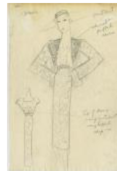
Women's Printed Suit with Shirred and Puffed Lapel (KA0039_V9p68-002)