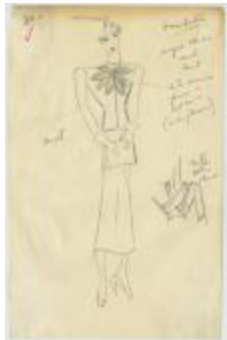
Women's Royal Blue Wool Suit with White Ermine Fur Embellishment (KA0039_V9p26-002)