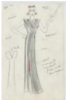
Black Satin Evening Dress with Red and Green Underskirt and Wrapped Yoke (KA0039_V8p32-008)