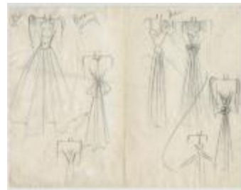
Set of Eight Sketches Depicting Various Evening Ensembles (KA0039_V8p55-005)