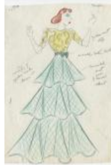
Women's Evening Ensemble with Three- Tiered Emerald Net Skirt and Yellow Net Top (KA0039_V8p10-008)