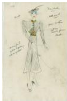
Black Wool Dress with Indian Print Scarf and Sash Belt (KA0039_V9p41-005)