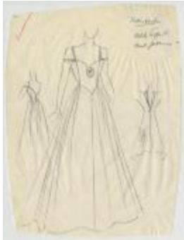
Black Taffeta Evening Dress with Bodice Embellishment and Matching Coat (KA0039_V8p76-001)