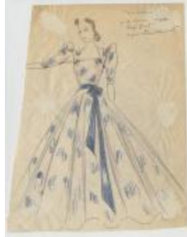
Pink Organdie Evening Dress with Royal Blue Tulip Print (KA0039_V8p72-002)