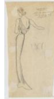
Black Crêpe Evening Dress with Cowl Back Embroidered in White Bugles (KA0039_V8p71-001)