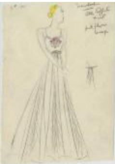
Black Taffeta and Net Evening Dress with Pink Flower Corsage (KA0039_V9p48-005)