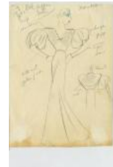
Black Slipper Satin Evening Dress with Net Yoke and Leg-of-Mutton Sleeves (KA0039_V9p30-009)