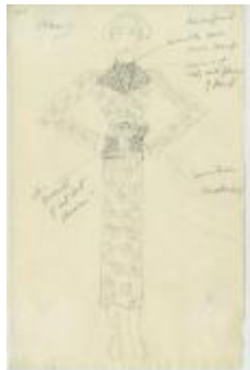
Daisy Printed Women's Suit with Cut-Out Flowers and Green Lace Accents (KA0039_V9p69-005)