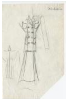
Women's Skirt Suit with Double Breasted Jacket and Embellished Lapel (KA0039_V8p05-006)