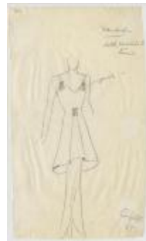
Women's Black Tunic Evening Ensemble with Jewel Embellishments (KA0039_V8p76-005)