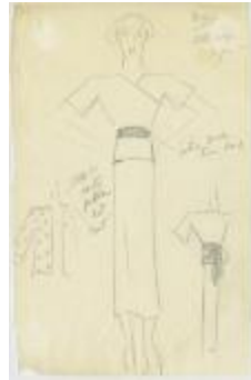
Women's Black CrÃ©pe Ensemble with Polka Dot Coat (KA0039_V9p65-001)