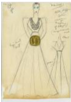
Black Slipper Satin Evening Dress with Jet Bead Rope Necklaces (KA0039_V9p39-007)