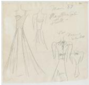
Set of Four Sketches Depicting a Blue and Brown Ensemble and Navy Blue Satin and Tulle Evening Dress (KA0039_V8p52-001)