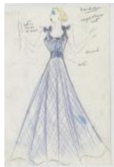
Royal Blue Net Evening Dress with Satin Band and Bows (KA0039_V8p12-006)