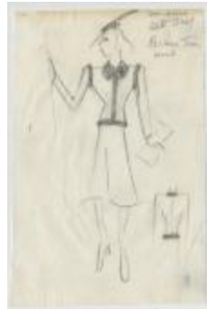
Women's Black Wool Suit with Persian Lamb Trim (KA0039_V9p17-002)