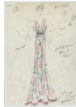
Field Flower Print Crêpe Evening Dress with Red Net Petticoat (KA0039_V8p46-003)