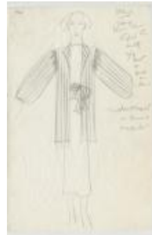
Navy Blue Dress with Striped Coat and Matching Sash (KA0039_V8p39-006)