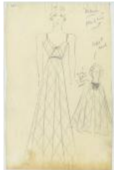
Plaid Evening Dress with Net Bodice and Hooded Cape (KA0039_V9p68-009)