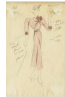
Wine Colored Crêpe Dress with Velvet Flowers (KA0039_V9p38-003)