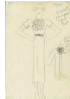
Short-Sleeved Grey Dress with Plaid Jabot Collar and Matching Coat (KA0039_V9p62-002)