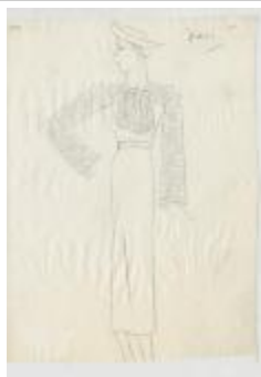
Long-Sleeved Print Dress with Jabot Collar (KA0039_V8p18-009)