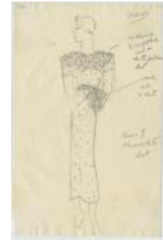
Blue and White Polka Dot Dress with Three Ruffled Red and White Polka Dot Collars (KA0039_V9p24-005)