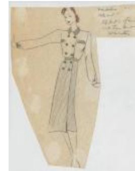
Black Wool Double-Breasted Women's Coat with Fitted Waist and Gold Buttons (KA0039_V8p50-004)