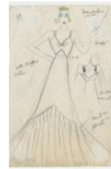
Black Slipper Satin Evening Dress with Shirred Flounce Skirt (KA0039_V8p01-008)