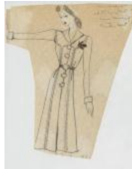
White Linen Coat with Brown Kerchief and Embellished Buttons (KA0039_V8p48-003)