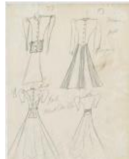
Set of Four Sketches Depicting Two Women's Ensembles and Two Views of a Puff-Sleeved Dress (KA0039_V8p53-002)