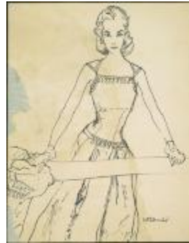
Evening Dress with Beaded Trim and Matching Stole (KA0038_000127)