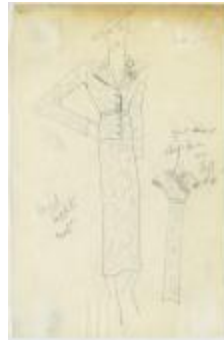
Women's Printed Suit with Boutonniere (KA0039_V9p70-003)