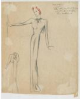
Black Satin Long-Sleeved Dinner Dress with Cut-Out Back and Large Stone Necklace (KA0039_V8p70-003)