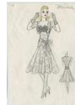
Knee-Length Black Printed Dress with Ruffled Collar Embellishments (KA0039_V8p42-005)