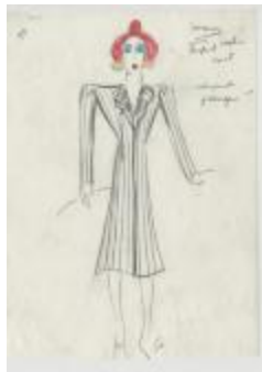
Women's Striped Wool Coat with Shirred Collar (KA0039_V8p33-004)