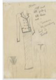
Double Breasted Red Tweed Coat with Black Piping and Black Dress (KA0039_V8p37-007)