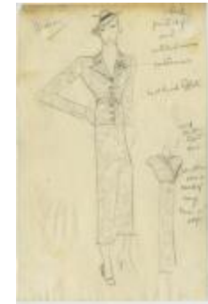
Women's Floral Printed Chiffon Suit with Boutonniere (KA0039_V9p67-002)