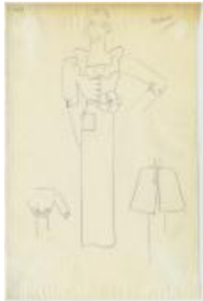
Calf-Length Dress with Ruffled Square Neckline and Matching Cape (KA0039_V9p68-003)