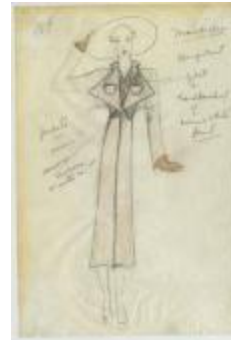
Women's Beige Coat with White and Brown Printed Gilet and Handkerchief (KA0039_V9p22-001)