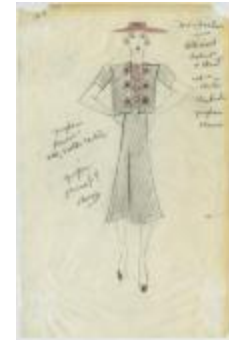
Black Wool Bolero and Skirt with Red and White Checked Gingham Blouse and Flowers (KA0039_V9p21-003)