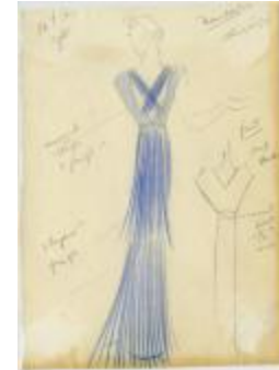
Blue Crêpe Evening Dress with Fringe Layered Skirt (KA0039_V9p51-009)