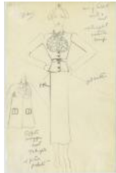
Women's Navy Taffeta Suit with Swagger Coat and White Eyelet Batiste Scarf (KA0039_V9p69-002)