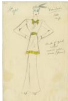
Women's Black Crêpe Tunic Ensemble with Gold Embroidery (KA0039_V9p33-004)