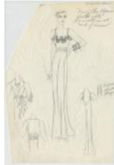
Navy Blue Alpaca Evening Dress with White Pleated Mousseline Neckline and Matching Wrap Coat (KA0039_V8p49-002)