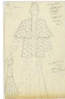
Crinkled Navy and Red Polka Dotted Evening Dress with Matching Caped Coat (KA0039_V9p72-008)