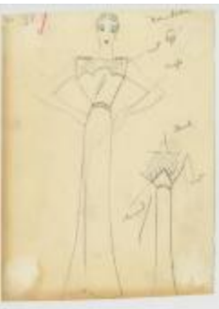
Crêpe Evening Dress with Shirred Net Yoke (KA0039_V9p46-007)