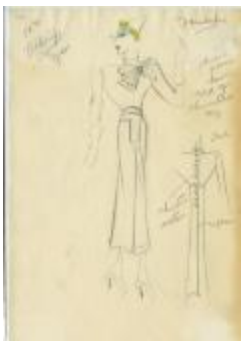
Black Crêpe Dress with Shirred Bow and Rhinestone Buttons (KA0039_V9p39-006)