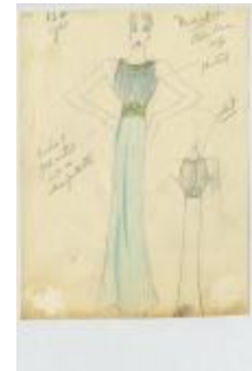
Pale Blue Pleated Crêpe Evening Dress with Gold Metal Embroidery (KA0039_V9p27-008)