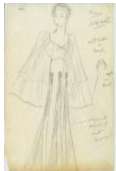
Black Satin and Net Evening Dress with Hooded Cape (KA0039_V9p67-007)