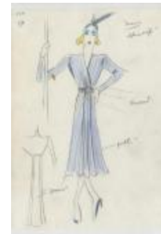
Blue CrÃ©pe Long-Sleeved Wrap Dress with Full Skirt (KA0039_V8p34-004)