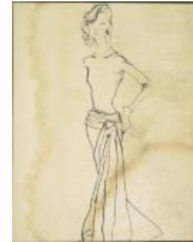
Long-Sleeved Evening Dress with Low-Slung Girdle (KA0038_000130)