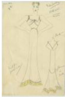
Black Satin Evening Dress with Band of Gold Embroidery (KA0039_V9p26-006)