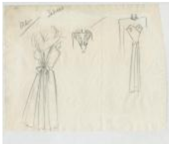
Set of Three Sketches Depicting a Dress and Coat with Large Collar (KA0039_V8p55-001)