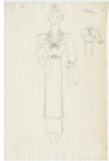
Calf-Length Dress with Two-Tiered Skirt (KA0039_V8p07-006)