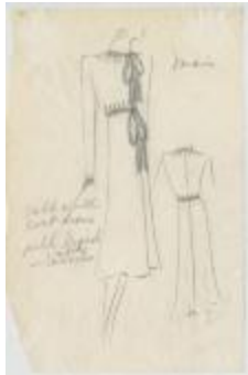
Black Coat Dress with Silk Braid Cords and Tassels (KA0039_V8p20-001)