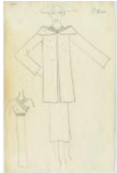
Women's Ensemble with Long Box Coat and Surplice Top Dress (KA0039_V9p68-004)