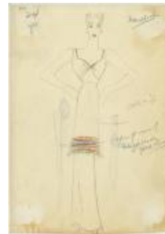
Black Crêpe Evening Dress with Colored Bead and Gold Thread Border (KA0039_V9p57-009)