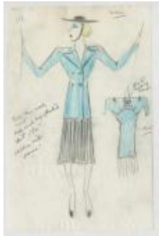
Women's Ensemble with Pale Blue Wool Coat and Black Wool Box-Pleated Skirt (KA0039_V8p35-001)