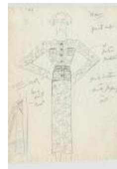
Women's Floral Printed Crepe Ensemble with Pink Accents and Matching Coat (KA0039_V8p18-007)