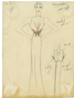
Black Crêpe Evening Dress with Metallic Fabric Accents (KA0039_V9p53-008)