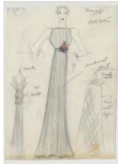
Black Satin Evening Dress with Sunburst Pleats and Matching Net Cape (KA0039_V9p16-008)