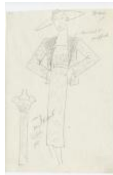
Navy Point D'Esprit Women's Ensemble with Taffeta Slip (KA0039_V8p11-004)