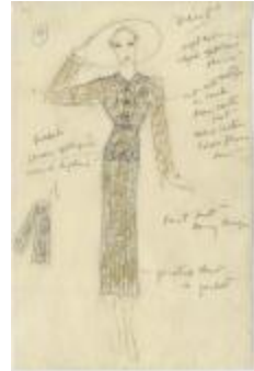
Women's Daisy Print Suit with Pleated Skirt and Appliques (KA0039_V9p43-005)