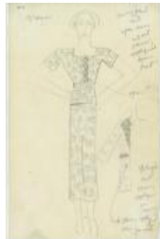
Daisy Printed Women's Suit with Floral Appliques (KA0039_V9p69-006)