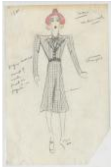
Women's Checked Wool Ensemble with Piqué Facing (KA0039_V9p14-003)