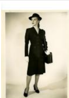
Public Health Nurse (KA0023_b01_f11_01)