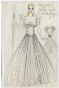
White Crepe and Organza Evening Dress with Ruffled Neckline (KA0039_V8p42-008)