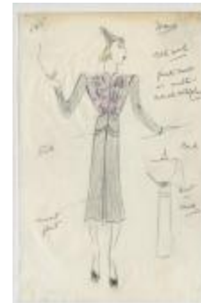
Black Wool Women's Ensemble with Multicolored Cellophane Embroidery (KA0039_V9p10-003)