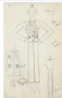
Three-Piece Women's Suit with Floral Printed Jabot Collar (KA0039_V8p19-009)