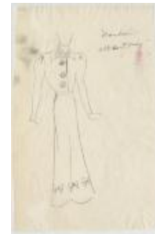
Black Jersey Shirt Dress with Bows and Floral Embellishments (KA0039_V8p78-003)