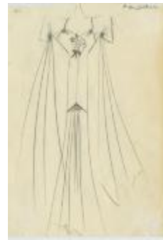
Long Evening Dress with Floral Embellishment and Hanging Fabric (KA0039_V9p35-006)