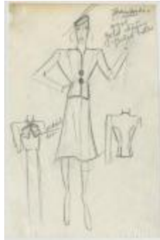
Wool Women's Suit with Gold Daisy Fluted Buttons (KA0039_V9p03-001)