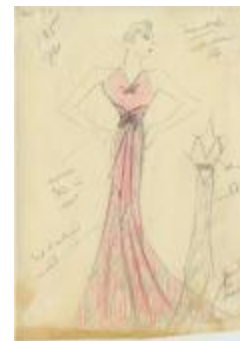
Evening Dress with Sheer Red Bodice and Red and Silver Printed Skirt (KA0039_V9p43-007)