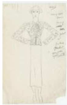
Navy Wool Women's Ensemble with Jabot Collar and Openwork (KA0039_V8p10-004)