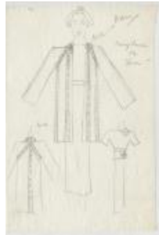
Sheer Navy Women's Suit with Navy Lace Inserts (KA0039_V8p20-006)