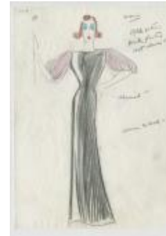
Black Satin Evening Dress with Pink Pleated Net Sleeves (KA0039_V8p35-008)