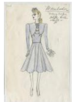
Navy Crepe Dress with White Collar and Cuffs (KA0039_V8p42-004)