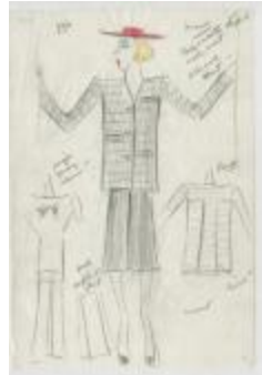
Women's Ensemble with Black and White Striped Coat and Beige Jersey Blouse (KA0039_V8p37-005)