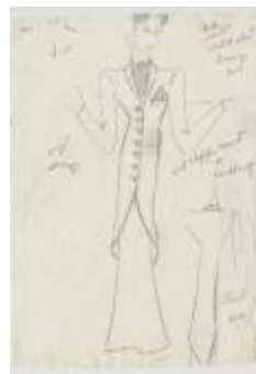
Women's Black Velvet Dinner Suit with Red Chiffon Ascot and Handkerchief (KA0039_V8p14-008)