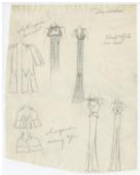
Set of Sketches Depicting an Evening Coat, Evening Cape, and Two Evening Dresses (KA0039_V8p03-001)