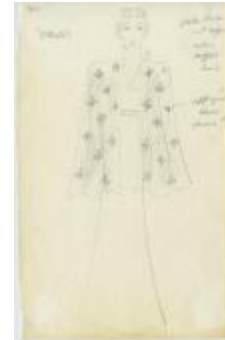
Women's Pale Blue Net Evening Cape with Blue Flower Appliques (KA0039_V9p70-007)