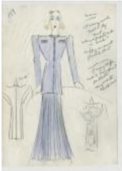
Women's Evening Ensemble with Embroidered Navy Wool Coat and Chiffon Pleated Skirt (KA0039_V8p30-007)