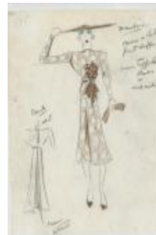
Brown and White Printed Chiffon Dress with Brown Taffeta Flowers (KA0039_V8p34-001)