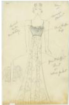
Blue and Printed Chiffon Evening Dress with Bolero Jacket (KA0039_V9p69-008)