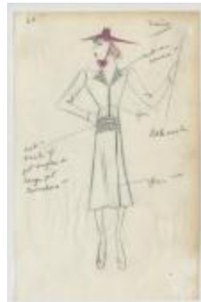
Black Wool Women's Ensemble with Jet Bugle and Cabochon Embroidery (KA0039_V9p09-003)