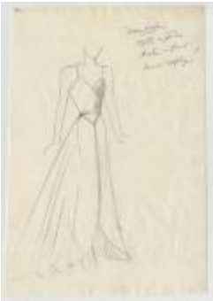
Black Taffeta Evening Dress with Lamé Applique (KA0039_V8p79-002)