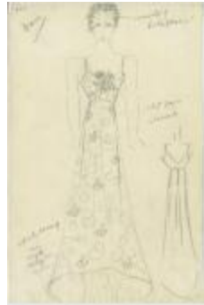
Floral Printed Evening Dress with Field Flower Wreath and Whale Boning (KA0039_V9p68-005)