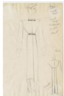
Calf-Length Wool Coat with Buttons at Neck and Waist (KA0039_V8p07-003)