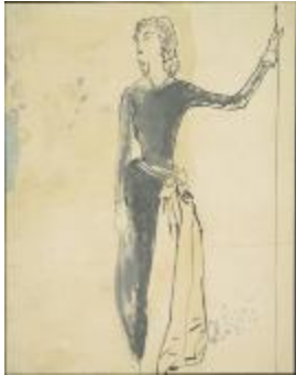
Long-Sleeved Navy Evening Dress with Low-Slung Girdle (KA0038_000129)