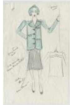
Women's Ensemble with Green Tweed Coat Featuring Black Horse Head Buttons (KA0039_V8p31-005)