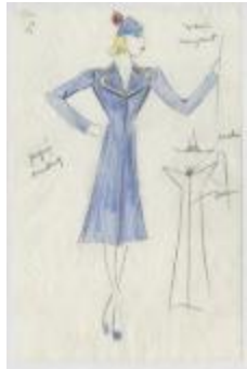
Navy Wool Coat with Rounded Collar and White Piqué Banding (KA0039_V8p35-004)