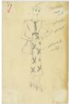
Women's Black Wool Ensemble with Jet Beaded Embroidery (KA0039_V9p33-006)