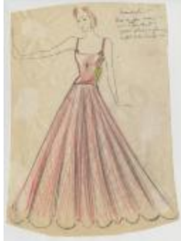
Red Chiffon and Tulle Evening Dress with Yellow Flowers (KA0039_V8p71-004)