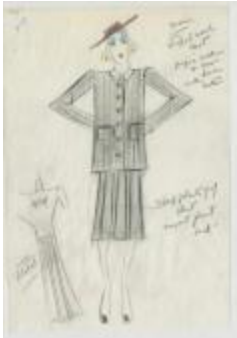
Women's Striped Wool Ensemble with White Piqué Collar and Bow (KA0039_V8p37-001)