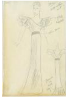
Black Cotton Net Evening Dress with Ruffled Capelet Sleeves (KA0039_V9p64-007)