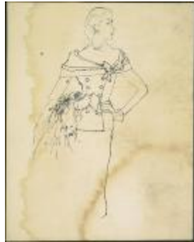
Women's Evening Ensemble with Double-Breasted Top and Fichu Wrap (KA0038_000126)