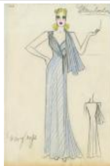
Navy Crepe Evening Dress with Draped Panel (KA0039_V9p70-008)