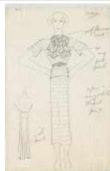
Navy and White Striped Women's Ensemble with Jabot Collars and Floral Embellishments (KA0039_V8p19-007)