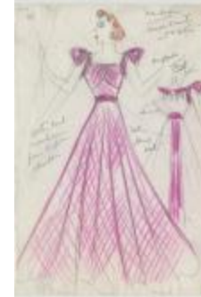
American Beauty Net and Satin Evening Dress with Large Satin Shoulder Loops (KA0039_V8p13-007)