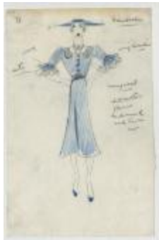
Navy Wool Dress with Ruffled Sleeves and White Flower Embellishments (KA0039_V9p06-002)