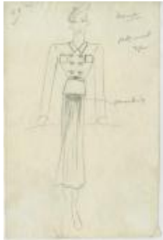
Black Wool Women's Ensemble with Smocking and Button Accents (KA0039_V9p63-004)