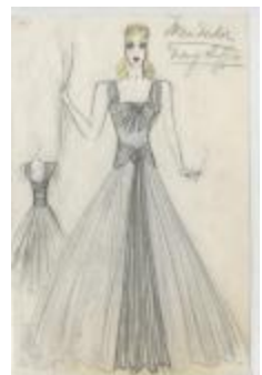
Navy Chiffon Evening Dress with Wrapped Bodice and Bows (KA0039_V8p40-009)