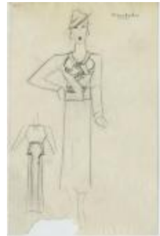
Women's Ensemble with Jabot Collar and Small Ties (KA0039_V9p66-002)