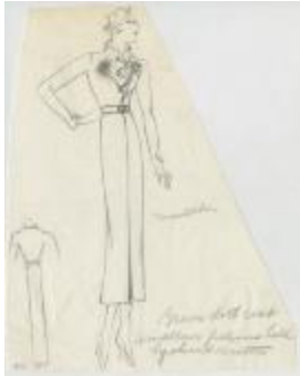
Brown Cloth Coat with "Windblown" Fullness Held by Shirred Rosettes (KA0039_V8p48-002)