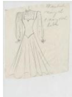
Navy and White Dotted Dress with a Vest-Like Bodice (KA0039_V8p52-003)