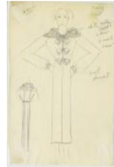
Women's Navy Coat with White Collar and Wool Bows (KA0039_V9p65-002)