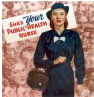
She's Your Public Health Nurse (KA0023_kOSxx2_f06_01)