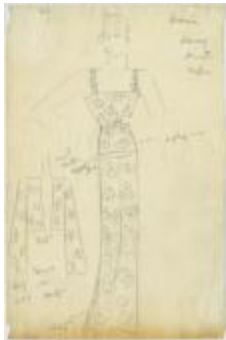
Women's Daisy Printed Crepe Evening Ensemble with Floral Appliques (KA0039_V9p72-007)