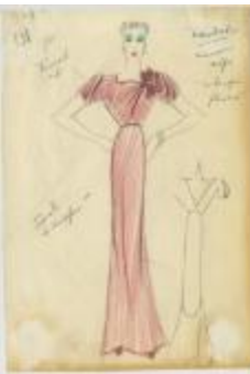
Maroon Crêpe Evening Dress with Large Flower Embellishments (KA0039_V9p31-009)