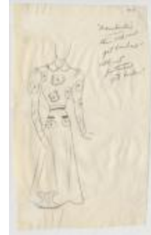
Thin Black Wool Dress with Black Net Petticoat and Floral Embroidery (KA0039_V8p74-004)