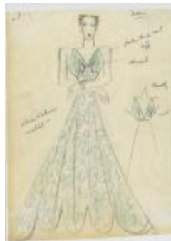
Pale Blue and Silver Printed Evening Dress (KA0039_V9p50-007)