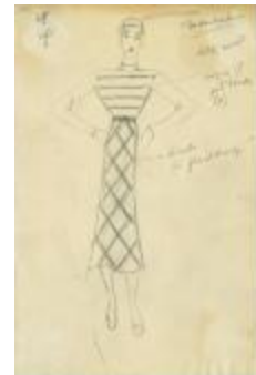
Long-Sleeved Black Wool Dress with Jet Bead Designs (KA0039_V9p58-002)