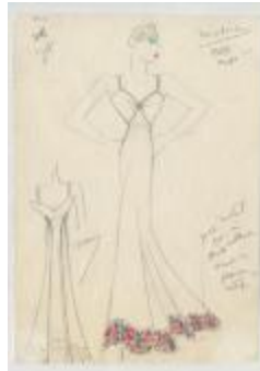
Black Crêpe Evening Dress with Pink and Blue Beaded Embroidery in Flower Motifs (KA0039_V8p35-007)