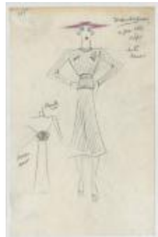
Black CrÃ©pe Women's Ensemble with White Lace Accents (KA0039_V9p06-003)