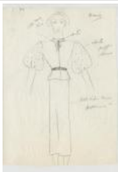
Black Crêpe Dress with Peplum Waist and White Puff Sleeves (KA0039_V8p18-008)