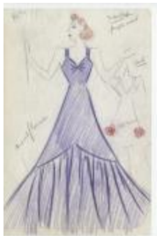
Purple Velvet Evening Dress with Shirred Flounce Skirt (KA0039_V8p04-007)