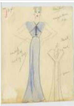
Royal Blue Crêpe Evening Dress with Braided Strips (KA0039_V9p60-008)