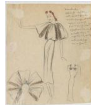
Black Chiffon Velvet Dress with Velvet and Mink Cape and Coral and Pearl Embellishments (KA0039_V8p70-002)