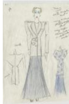
Women's Evening Ensemble with White Bengaline Coat and Navy Chiffon Sunburst Pleated Skirt (KA0039_V8p31-008)