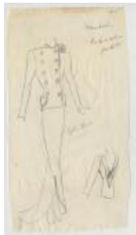
Pink and Silver Jacket with Long Satin Skirt (KA0039_V8p74-002)