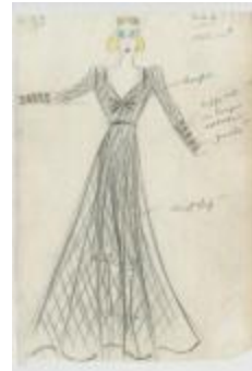
Black Net Evening Dress with Multicolor Cabochon Jewel Embellishments (KA0039_V9p19-006)