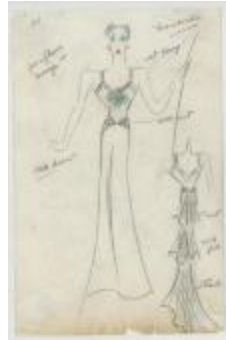
Evening Dress with Black Net Ruffles and Green Flower Corsage (KA0039_V9p02-008)