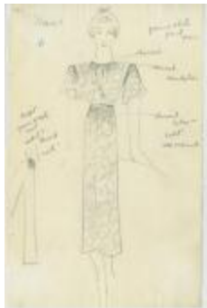
Green and White Printed Dress with Green Wool Coat (KA0039_V9p69-004)