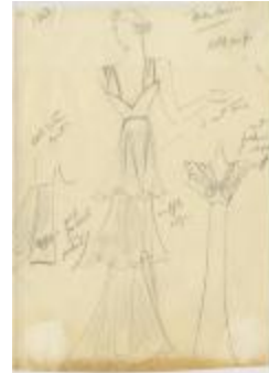
Black Crêpe Evening Dress with Net Tiered Skirt and Black Satin Coat (KA0039_V9p46-008)