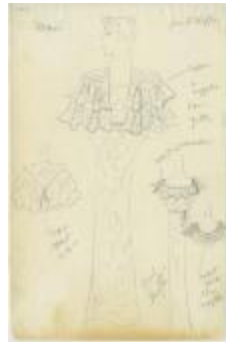
Calf-Length Printed Chiffon Dress with Ruffled Cape (KA0039_V9p66-007)