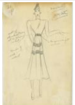
Black Satin Dress with Velvet Bands and Rhinestone Flower Belt (KA0039_V9p58-003)