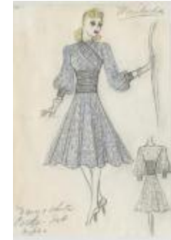
Navy and White Polka Dot Crepe Dress with Bishop Sleeves (KA0039_V8p40-001)