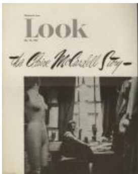
The Claire McCardell Story (PC30201_bp4_f6_01)