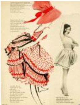
Layered Skirt Ensemble with Peach Basket Hat (KA008601_b02_f10_01)