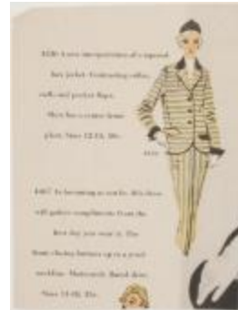
Simplicity Pattern 4436: Misses' and Women's Two-Piece Suit (KA008601_OSx1_f07_03v)