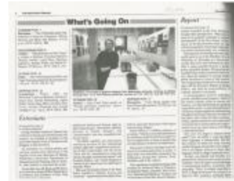
Page from The New School Observer (PC010401_000008)