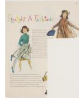
"Straight A Fashions" (KA008601_OSx1_f07_15)