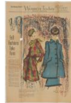
"Fall Fashions Take Form" (KA008601_OSxx1_f06_01)