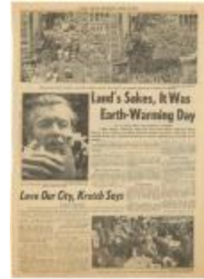
New York Daily News, Page 3 (KA0123_kOSx4_f08_04)