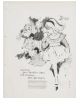
Bamberger's Advertisement Featuring Girls' Dresses (KA008601_OSxx1_f01_05)