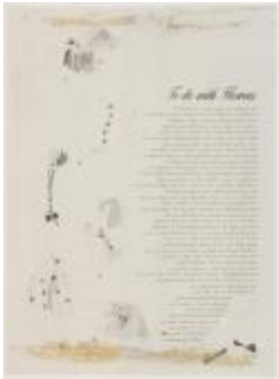
"To Do With Flowers" (KA008601_OSx1_f05_04)