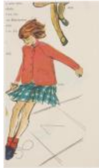
Simplicity Pattern 4820: Girls' Jacket with Flap Pockets (KA008601_OSx1_f07_05v)