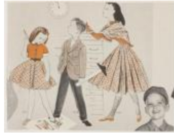
Simplicity Patterns 4577, 4478, and 4500: Boys' Suit and Two Girls' Ensembles (KA008601_OSx1_f07_06v)