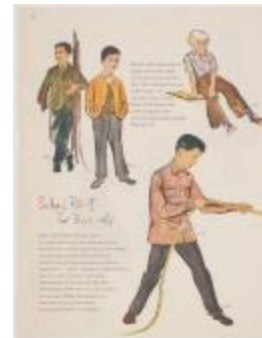
"School Report- For Boys Only" (KA008601_OSx1_f07_16v)