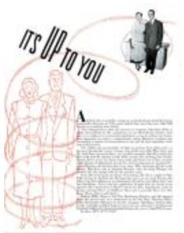
"Sophie's Gala Showing," Saks News, Vol. 7, No. 5 (KA0102_k07_f01_01b)