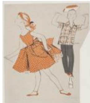
Simplicity Patterns 4316 and 4543: Girls' Dress and Boys' Shirt (KA008601_OSx1_f07_02)