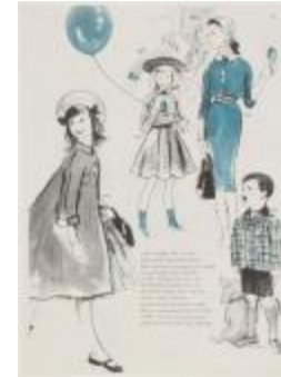
Simplicity Patterns 1940, 1780, 1975, and 1980: Four Children's Ensembles (KA008601_OSx1_f07_10)