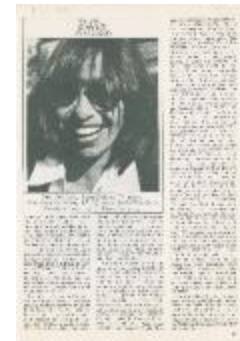
Article about Bea Feitler from Mais Magazine (KA0014_000018)