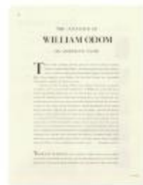
The Influence of William Odom on American Taste (PIC03002_OSx3_f05_03)