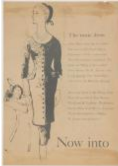
"The Tunic Dress" (KA008601_OSx1_f13_14)