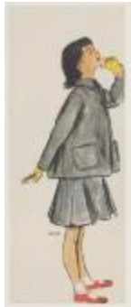
Simplicity Pattern 4418: Girls' Short Swagger Coat (KA008601_OSx1_f07_01)