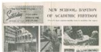
New School: Bastion of Academic Freedom (NS030105_000803)