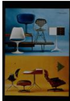
From "Masters of Design," Playboy magazine, 1961. (KA0048_b01_f15_s09)