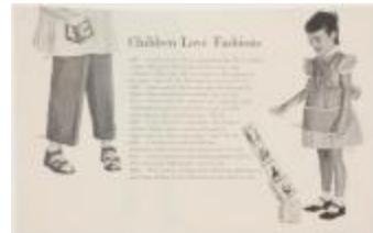
"Children Love Fashions" (KA008601_OSx1_f07_04)