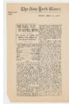
New York Times Review of "The Flies" by Jean Paul Sartre (NS030105_000405)