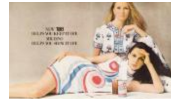
Advertisement for Tab Soft Drink and Mr. Dino Fashions (KA0049_KOSxx-2_f01_01)