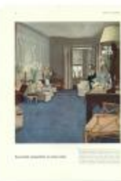
Ugly Duckling Becomes Swan (PIC03002_OSx3_f05_01)