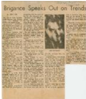
Brigance Speaks Out On Trends (KA0005_000001)