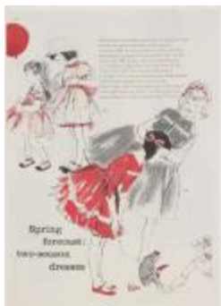
"Spring Forecast: Two-Season Dresses" (KA008601_OSx1_f07_10v)