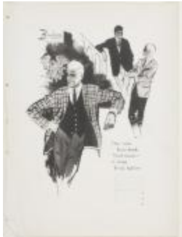
Bamberger's Advertisement Featuring Men's Suits (KA008601_OSxx1_f01_07)