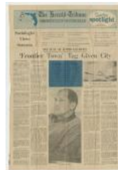
Sociologist Views Sarasota (NA000901_000011)