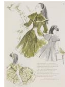
Simplicity Patterns 1739, 1701, and 1706: Three Girls' Ensembles (KA008601_OSx1_f07_07)