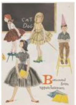
"Borrowed from Upperclassmen" (KA008601_OSx1_f07_11)