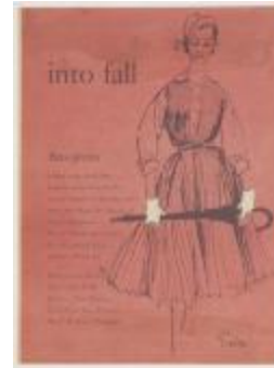
"Bias Pleats" (KA008601_OSx1_f13_01v)