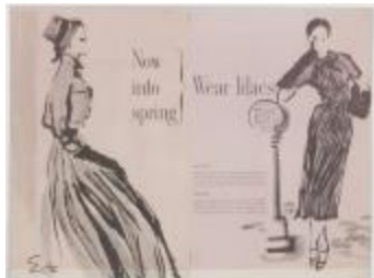
"Now into Spring: Wear Lilacs" (KA008601_OSx1_f13_18)