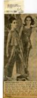
Holiday Hostess (KA0018_binder51_03)