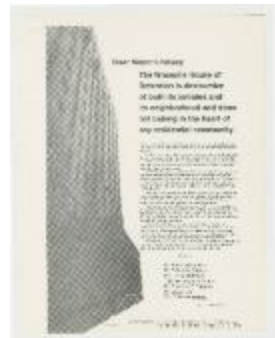
Open Letter to Mayor Lindsay Regarding Women's House of Detention (NS010102_000001)