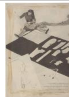
Simplicity Pattern 1521: Juniors' and Misses' Two-Piece Suit (KA008601_OSx1_f05_02)