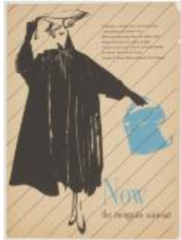
"The Incognito Raincoat" (KA008601_OSx1_f13_08)