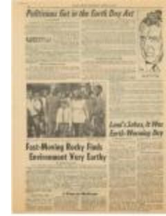
New York Daily News, Page 4 (KA0123_kOSx4_f08_05)