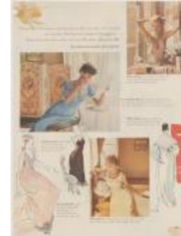
Assortment of Nightgowns and Lingerie (KA008601_OSx1_f06_01)