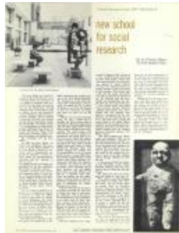
New School for Social Research: Its Art Center Open to the Public Free (NS030502_000010)