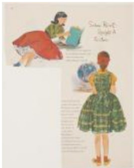
"School Report- Straight A Fashions" (KA008601_OSx1_f07_15v)