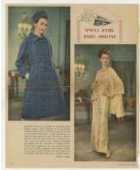
Two for the Show (KA0018_000042)