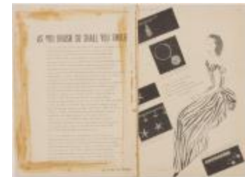
"As You Brush So Shall You Smile" (KA008601_OSx1_f05_05v)