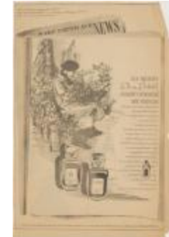
Saks Fifth Avenue Advertisement Featuring Givenchy Perfumes (KA008601_OSx1_f17_01)