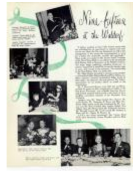
"Where else but at S.F.A.," Saks News, Vol. 7, No. 5, unpaginated (KA0102_k07_f01_01h)