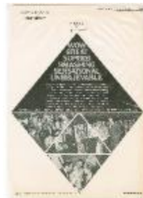
American Viscose Advertisement in Women's Wear Daily (KA0023_000003)