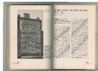
The New School for Social Research (NS030105_00510)