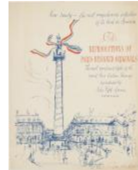
"S.F.A's Reproductions of Paris-Designed Originals" (KA008601_OSx1_f19_02)