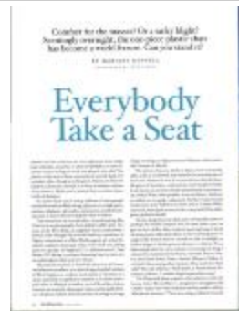
Photocopy of clipping from Smithsonian magazine about one-piece plastic chairs: "Everybody Take a Seat"