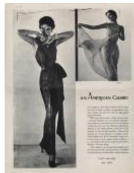
An American Classic on the Way (PC30201_bp4_f6_05)