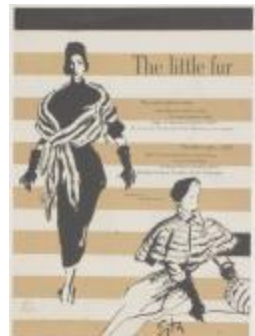
"The Little Fur" (KA008601_OSx1_f13_15v)