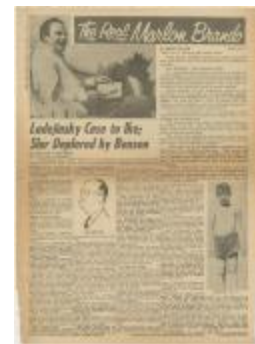
Feature Article about Marlon Brando (NS030105_000401)