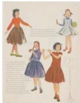
Simplicity Patterns 4394, 1256, 1253, and 1252: Four Girls' Ensembles (KA008601_OSx1_f07_16)