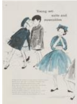
"Young Set: Suits and Ensembles" (KA008601_OSx1_f07_08)