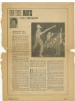
ON THE ARTS [news column] (NS030502_000001)