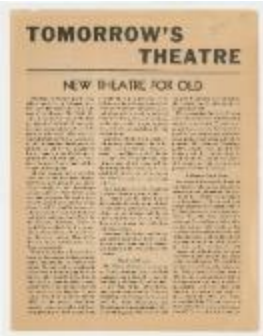
Dramatic Workshop Newspaper - "Tomorrow's Theatre" (NS030105_000293)