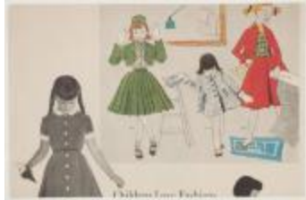
Simplicity Patterns 4581, 4576, and 4451: Girls' Coat and Two Full Ensembles (KA008601_OSx1_f07_09)