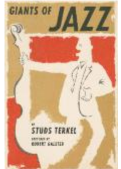
Book Jacket for "Giants of Jazz" (KA014101_000003)