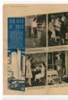
New York at Lunch (KA0045_OSxx2_f04_01)