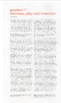
"position 1: newness, play and invention." Scapes, v. 1 (Fall 2002), 20-21. (PC020101_000003)