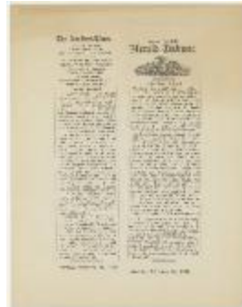
Articles on Ecole Libre from New York Herald Tribune and New York Times (NS030105_000119)