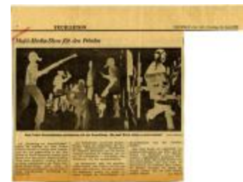
Multi-Media-Show fuer den Frieden (NS030502_000013)