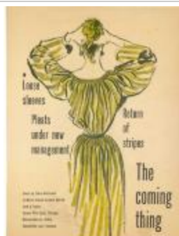
"The Coming Thing" (KA008601_b01_f17_01)