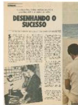
Article about Bea Feitler from Jornal do Brasil (KA0014_000017)