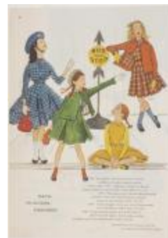
"Back-to-School Fashions" (KA008601_OSx1_f07_11v)