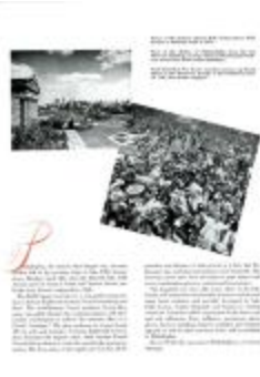
"It's Up to You," Saks News, Vol. 7, No. 2 (Easter 1952) (KA0102_k07_f01_01a)