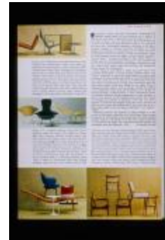
From "Masters of Design," Playboy magazine, 1961. (KA0048_b01_f15_s10)