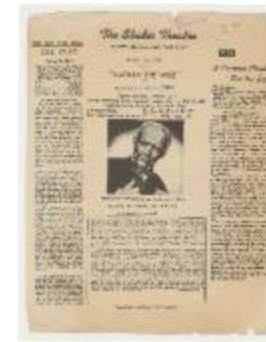
Collection of Reviews of "Nathan The Wise", a Play by Gotthold Ephraim Lessing (NS030105_000404)