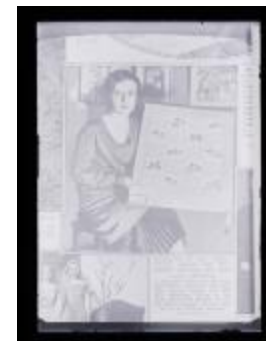
Evidence of Her Versatility Among the Talented Younger Set (KA0122_g01_f02_01)