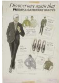
Assortment of Men's Suits, Shirts, Jackets, and Shoes (KA008601_OSxxx3_f03_01)