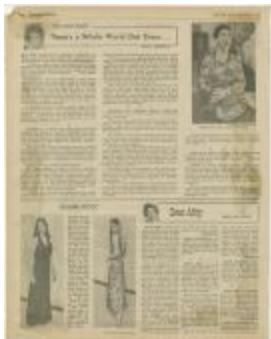
There's a Whole World Out There (KA0005_000015)