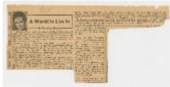
Article Detailing Erwin Piscator Daring Production of "The Flies" (NS030105_000411)