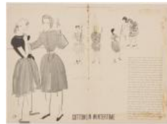
"Cottons In Wintertime" (KA008601_OSx1_f05_05)