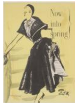
"Now Into Spring" (KA008601_OSx1_f13_03)