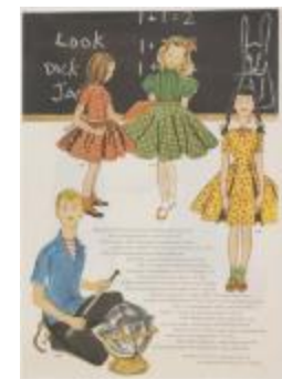
Simplicity Patterns 1408, 1558, 1741, and 1708: Boys' Shirt and Three Girls' Dresses (KA008601_OSx1_f07_12)