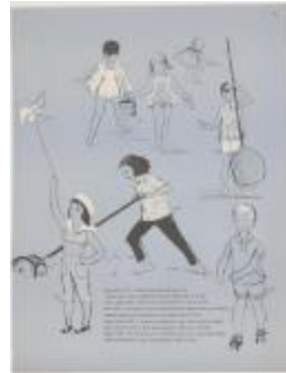
Children's Playclothes, Simplicity Pattern Package Illustration, probably 1957 (KA008601_OSx1_f07_19)