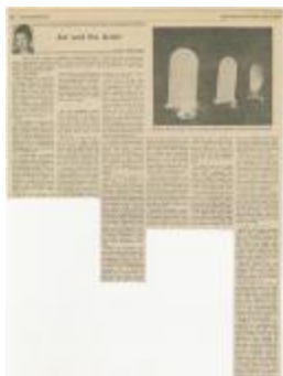
Art and the Artist [news column] (NS030502_000002)