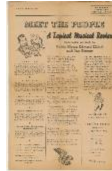
A Musical Review of the First Production of the Musical Play Department - "Meet The People" (NS030105_000406)