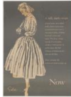
"A Tall, Dark Stripe" (KA008601_OSx1_f13_01)