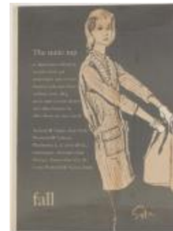
"The Tunic Top" (KA008601_OSx1_f13_16v)