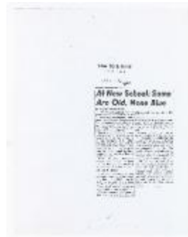
At New School: Some Are Old, None Are Blue (NS030105_000420)