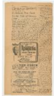
Review of "The Flies" by Jean-Paul Sartre (NS030105_000412)