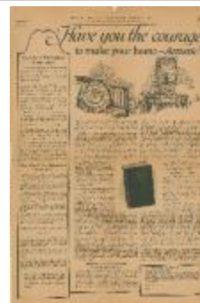
Have You the Courage to Make Your Home—Artistic? (KA0057_000002)