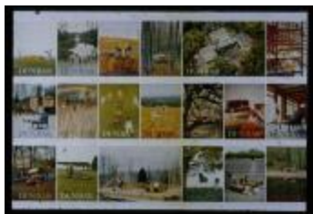
Dunbar Catalog Covers (KA0048_b01_f15_s06)