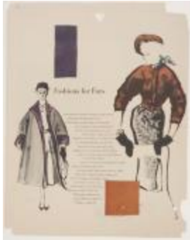
"Fashions for Furs" (KA008601_OSx1_f07_13)