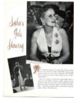
"The Thirties: The Lean Years," Saks News, Vol. 29 , No. 5 (1974) (KA0102_k07_f01_01c)