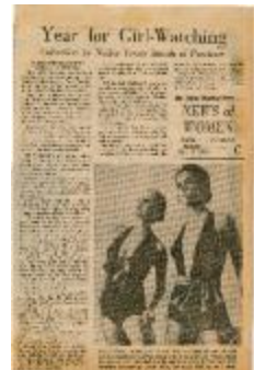
Year for Girl-Watching (KA0005_000003)