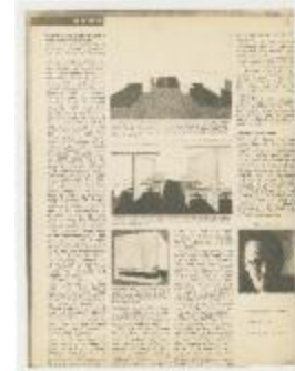
Four Parsons Students Tackle Women's Prison Design (PC010401_000019)