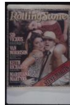
Exposed The Secret Life Of Steve Martin (KA0014_b03_f05_s21)