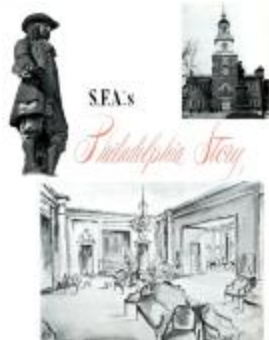
Philadelphia story (1 of 2), Saks News, Vol. 7, No. 2 (Easter 1952) (KA0102_k07_f01_01)