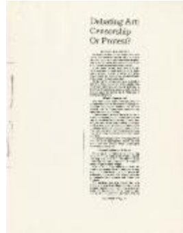
Debating Art: Censorship Or Protest? (PC010401_000009)