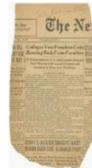
Colleges Vote Freedom Code Banning Reds from Faculties (NS030105_000039)