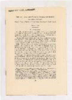
On Field Forces (NS080202_000003)