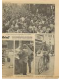
New York Daily News, Page 2 (KA0123_kOSx4_f08_03)