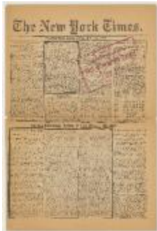
Various Clippings from The New York Times, Ranging from 1882-1883 (NS030105_000407)