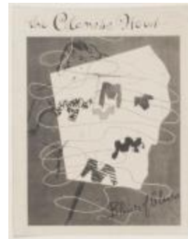
Blouses of Celanese (KA008601_OSx1_f04_01)