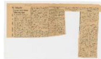
Positive Review of "The Flies" by Jean-Paul Sartre (NS030105_000413)