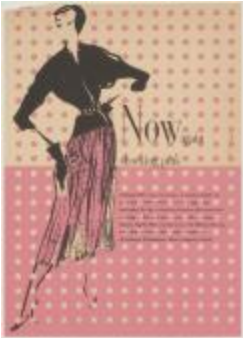
"Now Again: Shocking Pink" (KA008601_OSx1_f13_07)