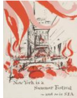
"New York is a Summer Festival" (KA008601_OSx1_f19_01)