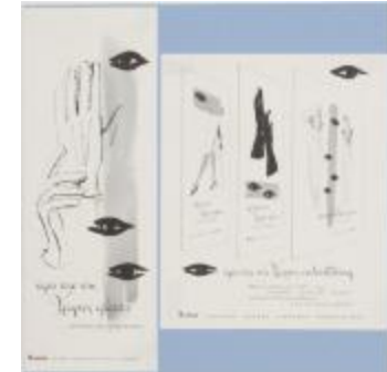
"Eyes are on Kayser Gloves", "Eyes are on Kayser Advertising" (KA008601_OSx1_f07_21v)