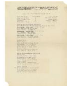
List of Honors and Scholarships to the New York School of Fine and Applied Art for 1915-1916 (KA0057_k5_f15_01)