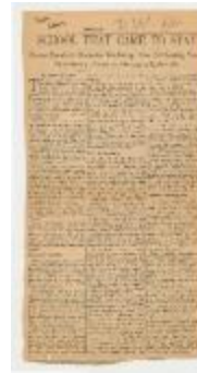
Dramatic Workshop Celebrates 10th Anniversary, Hopes to Become a University (NS030105_000285)