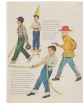
Simplicity Patterns 4452, 4166, 4100, and 4990: Boys' School Clothes (KA008601_OSx1_f07_17)