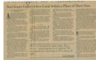
"Strength In Numbers," Sarasota Herald-Tribune, August 29, 1989. (KA0027_b01_f01_01)