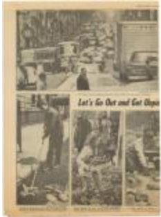
New York Daily News, Page 1 (KA0123_kOSx4_f08_02)