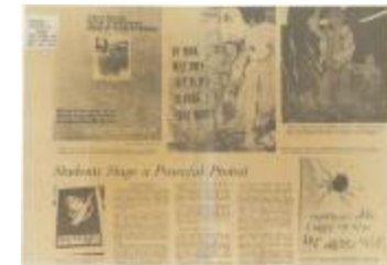
Students Stage a Peaceful Protest (NS030502_000006)