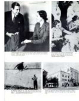
"The Forties: The War Years," Saks News, Vol. 29 , No. 5 (1974) (KA0102_k07_f01_01d)