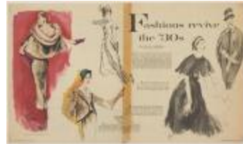
"Fashions Revive the '30s" (KA008601_OSxx1_f07_01)