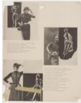
Simplicity Patterns 3663, 3638, and 3682: Three Teen Ensembles (KA008601_OSx1_f07_13v)