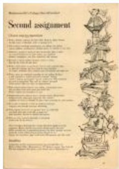
Mademoiselle's College Board Contest Second Assignment (KA0019_b01_f16_09)