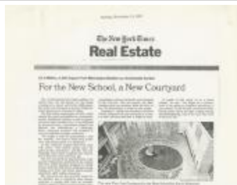
For the New School, a New Courtyard: $2.6 Million, 4,500-Square-Foot Minicampus Doubles as a Community Garden (NS030103_000004)