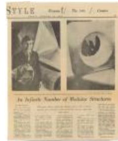
An Infinite Number of Modular Structures (page 1) (KA0123_kOSx4_f12_01)