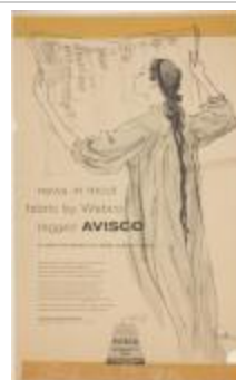
Avisco Advertisement Featuring Acetate Tricot Nightgown (KA008601_OSx1_f03_01)