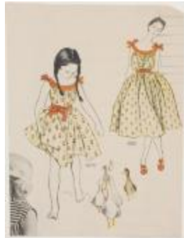
Simplicity Patterns 4582 and 4579: Matching Mother and Daughter Dresses (KA008601_OSx1_f07_03)