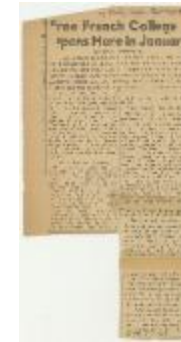
"Free French College Opens Here in January" from The New York Daily News (NS030105_000091)