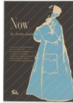
"The Denim Rainduster" (KA008601_OSx1_f13_09)