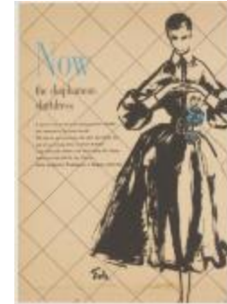
"The Diaphanous Shirtdress" (KA008601_OSx1_f13_10)