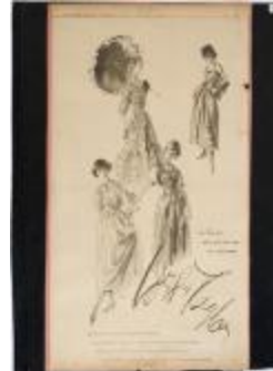
For the girl who got the sun for Christmas (KA0045_OSxx2_f01_01)