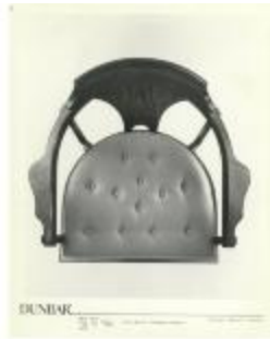
Dunbar Advertisement (KA0048_b02_f06_01)