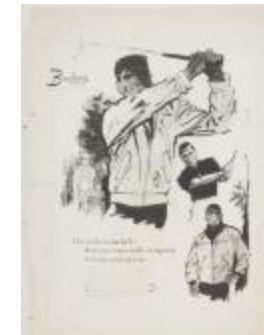
Bamberger's Advertisement Featuring Men's Activewear (KA008601_OSxx1_f01_06)