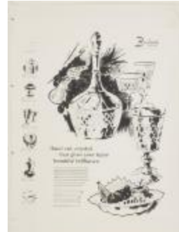
Bamberger's Advertisement Featuring Crystal Glassware (KA008601_OSxx1_f01_01)