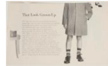
"That Look Grown Up" (KA008601_OSx1_f07_04v)