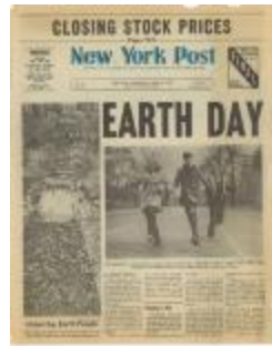
New York Post, Cover (KA0123_kOSx4_f08_07)