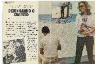
Desenhando O Sucesso (KA0014_0000011)