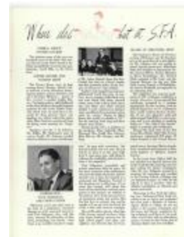
"Where else but at S.F.A.," Saks News, Vol. 7, No. 2, unpaginated (KA0102_k07_f01_01i)