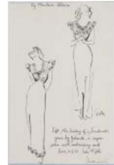
Bridal Nightgowns (KA008601_OSx1_f16_03)