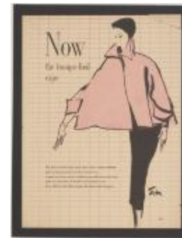
"The Trompe-L'oeil Cape" (KA008601_OSx1_f13_05)