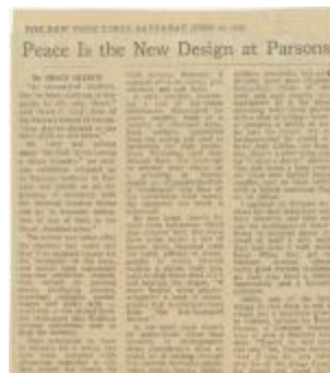
Peace Is the New Design at Parsons (NS030502_000005)