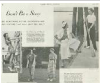
Don't Be a Sissy (KA0045_b01_f12_01)