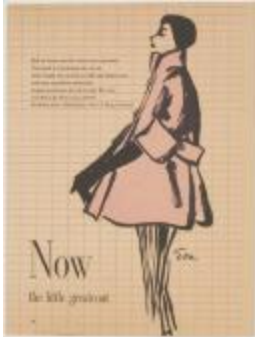
"The Little Greatcoat" (KA008601_OSx1_f13_12)