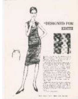
Designed for Stretch by Edith d'Errealde (KA0023_000005)