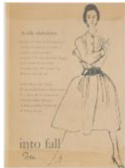
"A Silk Shirtdress" (KA008601_OSx1_f13_02v)