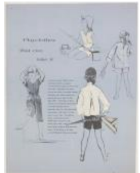
"Playclothes That Can Take It" (KA008601_OSx1_f07_18)