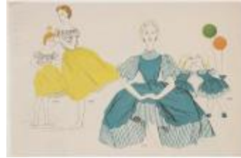
Simplicity Patterns 3874, 4292, 3791, and 3808: Two Matching Mother and Daughter Ensembles (KA008601_OSx1_f07_09v)