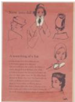
"A Something of a Hat" (KA008601_OSx1_f13_02)