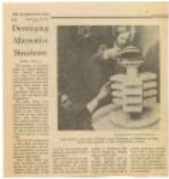
An Infinite Number of Modular Structures (page 2) (KA0123_b01_f07_20)