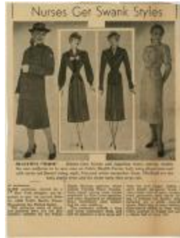
Nurses Get Swank Styles (KA0023_000001)