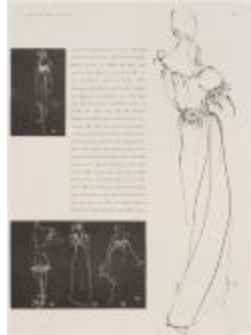
Assortment of Nightgowns and Lingerie (KA008601_OSx1_f05_03)