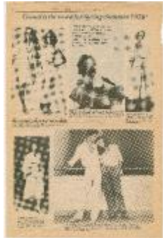
Casual Is the Word for Spring-Summer 1978 (KA0023_000004)