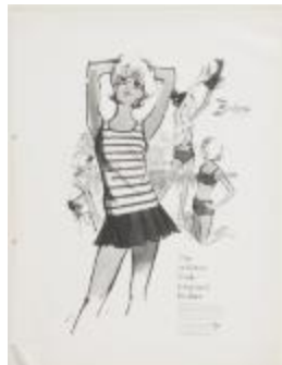
Bamberger's Advertisement Featuring Women's Beachwear (KA008601_OSxx1_f01_04)