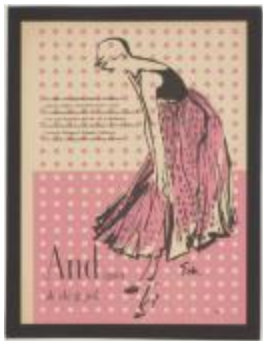
"And Again: Shocking Pink" (KA008601_OSx1_f13_04)