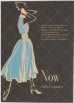
"Chiffon Separates" (KA008601_OSx1_f13_11)