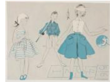
Simplicity Patterns 4276, 4452, and 4541: Boys' Lumber Jacket and Two Girls' Ensembles (KA008601_OSx1_f07_06)