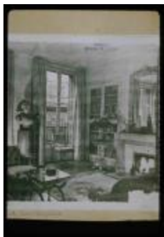
Van Day Truex's Paris Apartment (PIC03002_p04_f05_01)