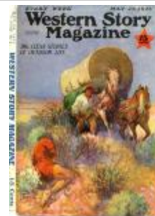
Western Story magazine cover (KA0090_b01_f08_01)