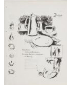
Bamberger's Advertisement Featuring White Earthenware (KA008601_OSxx1_f01_02)