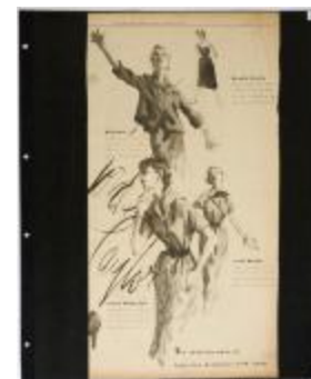
The sporting ways of American designers with linen (KA0045_OSxx2_f03_01)