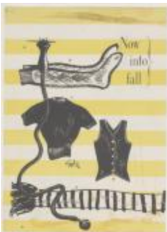
"Now Into Fall" (KA008601_OSx1_f13_15)