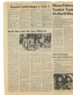
New York Post, Page 3 (KA0123_kOSx4_f08_08)