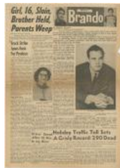
Feature Article about Marlon Brando (NS030105_000400)