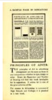
Advertisement for Principles of Advertising Design by Frank Alvah Parsons (KA0057_k05_f10_01)