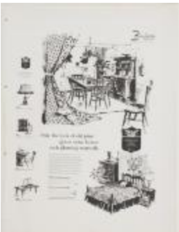
Bamberger's Advertisement Featuring Old Pine Furniture (KA008601_OSxx1_f01_03)