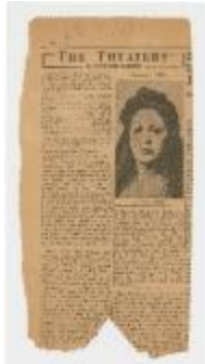
Newspaper Review of "The Flies" by Jean-Paul Sartre (NS030105_000408)