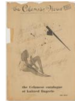
The Celanese Catalogue of Knitted Lingerie (KA008601_OSx1_f04_02)