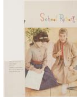
"School Report-" (KA008601_OSx1_f07_14)