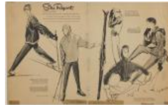
"Ski Report" (KA008601_OSxx2_f07_01)