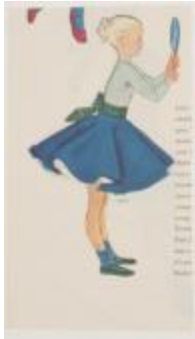
Simplicity Pattern 4753: Girls' Circle Skirt with Petticoat (KA008601_OSx1_f07_05)