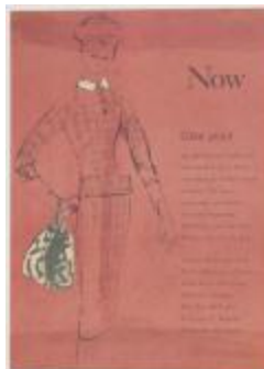
"Glen Plaid" (KA008601_OSx1_f13_16)