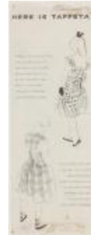
"Here is Taffeta" (KA008601_OSx1_f05_01)