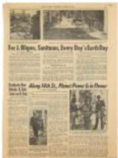
New York Daily News, Page 5 (KA0123_kOSx4_f08_06)