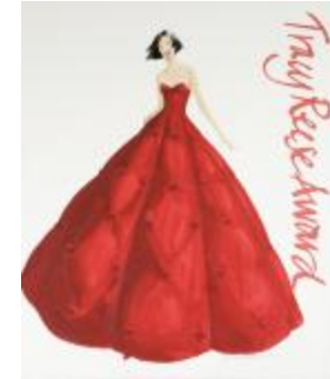
Quilted Red Silk Taffeta Evening Dress (PIC02002-1_OSxx20_f01_01)