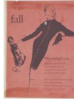
"The Cardigan Coat" (KA008601_OSx1_f13_14v)