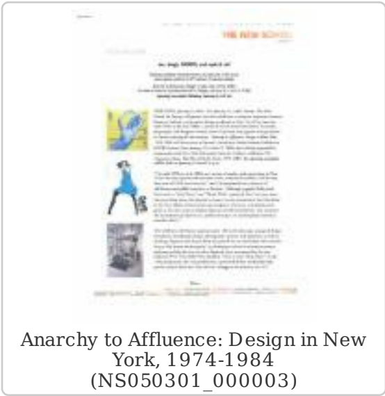
Anarchy to Affluence: Design in New York, 1974-1984 (NS050301_000003)