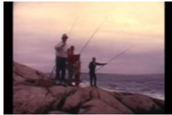
New York scenes (Unidentified 1) (KA0130_000006)