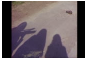
Study of Street Life on Upper West Side of Manhattan (KA0117_000001)