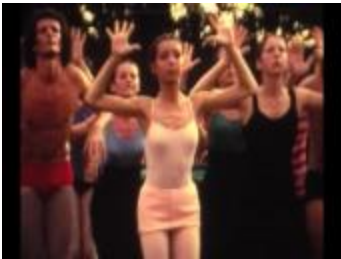
Teatro Romano Part 2 (KA0130_000005)