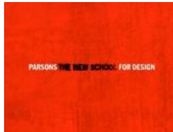
Parsons School of Design recruitment video (2015PC06_D005_LOGICAL VOLUME I)