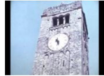
Teatro Romano Part 1 (KA0130_000004)