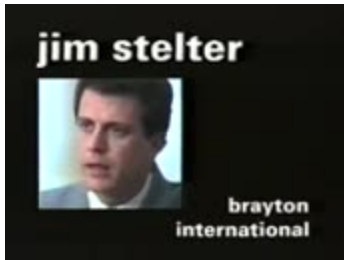
Brayton International / University of North Carolina, Greensboro Honors Studio (KA0119_VHS_02)