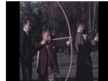
Barbecue at Old Mill, 1937 (Halle_16mm_02_H264)