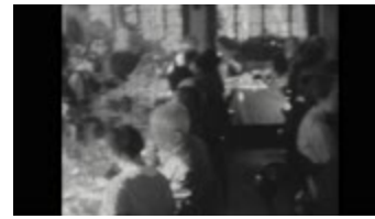
GATHERING OF UNIVERSITY PROFESSORS "Poundridge" 1935 (Halle_16mm_01_H264)