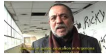
Out of the Shadows (2017NS07_DVD_001)