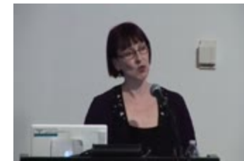
Gender Studies and Body Politics: Intersections, Directions, Representations (Session 3) (NS070205_000003)