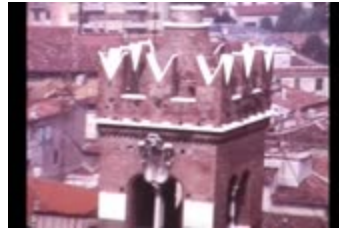
Ponte di Veia (KA0130_000003)