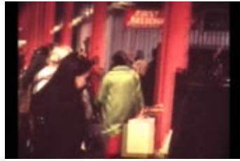
Partenza Michelangelo (KA0130_000002)