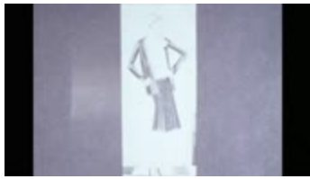
Norman Norell (Norell_documentary_1972)