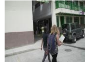
The International Field Program: Caldas, Colombia (IFP_Parts_1_and_2)