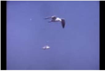
Coney Island (KA0130_000001)