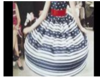
Norman Norell Spring/Summer 1968 Fashion Presentation (Norell_showroomcollection_1968)