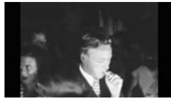
Parsons Paris 1948 (PC070201_000001)