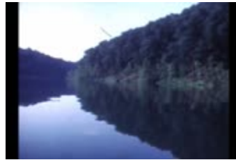
Zambonini family camping trip (Unidentified 2) (KA0130_000007)