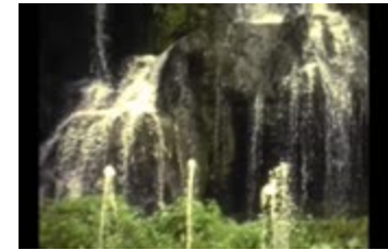
Villa d'Este (Unidentified 3) (KA0130_000008)