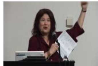
Gender Studies: What Histories Do We Want to Claim? (Session 2) (NS070205_000002)