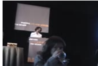
Centurion Award for Design Excellence Presentation (PC030101_PICd034)