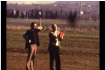
Viterbo (Unidentified 4) (KA0130_000009)